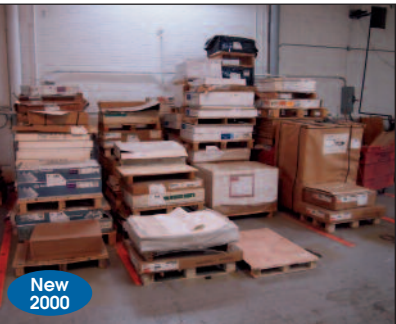
Partial View of Paper Inventory