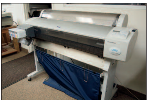
Epson Stylus Pro 9600 Proofer