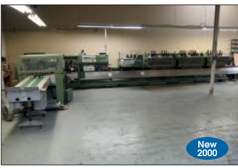
Muller "Presto" Saddle Stitcher