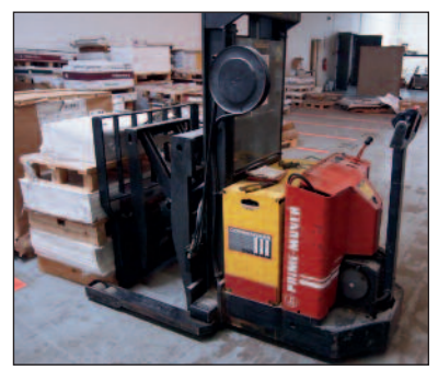
Prime-Mover 3000 lb Walkbehind Lift Truck