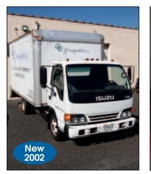
Isuzu Box Truck, Diesel