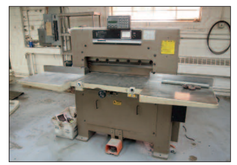
Challenge 30" Paper Cutter