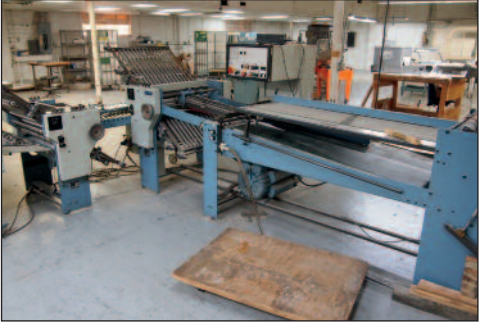
MBO Folder Model T65