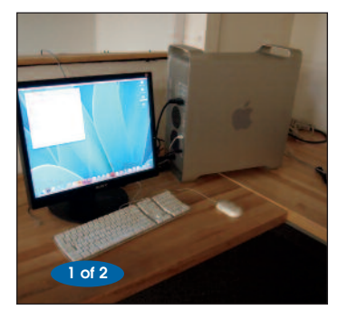
Apple G5 Power PC