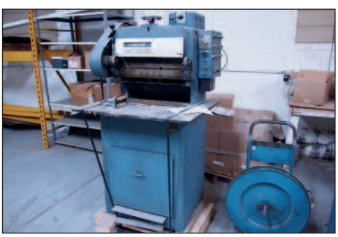
Lawson Super Duty Drill