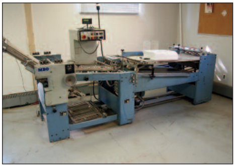
MBO Folder Model B23