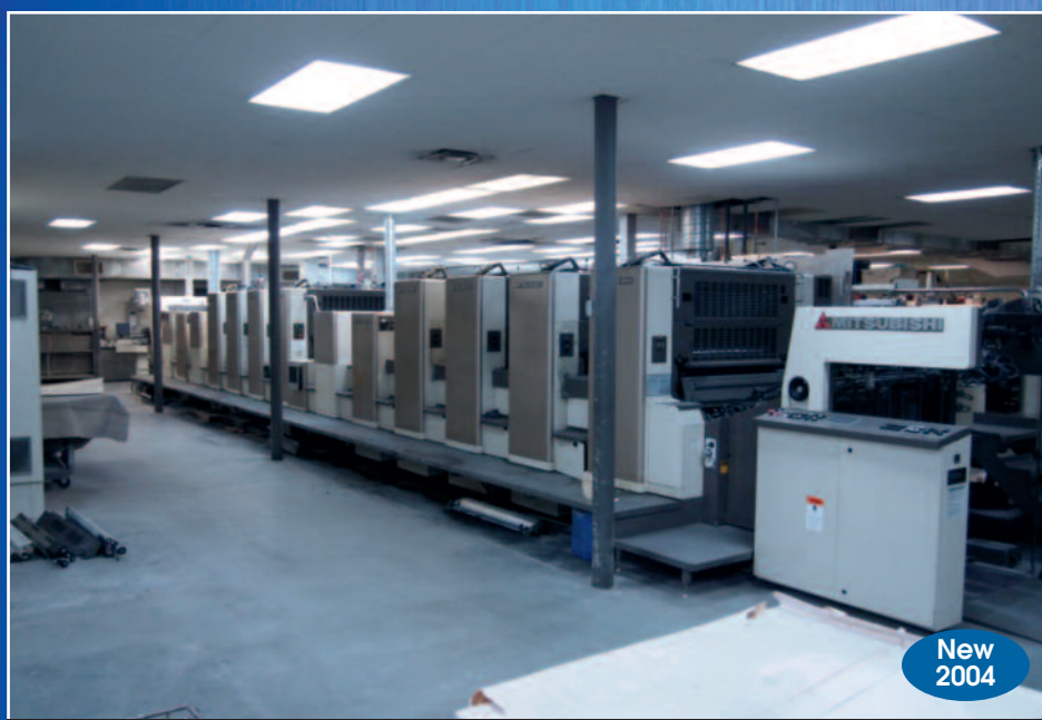
Mitsubishi Press Diamond Series D-3000-R-8

2004 MITSUBISHI D-3000-R-8 + DOUBLE COATER PRESS 2000 MULLER PRESTO SADDLE BINDER 2000 MBO B32S PERFECTION SERIES FOLDER 2002 CREO TRENDSETTER QUANTUM 800 CTP SYSTEM