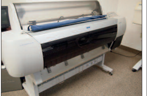
Epson Stylus Pro 9800 proofer