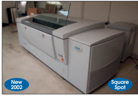
Creo Trendsetter CTP System Model TS-8 Quantum 800 Spectrum