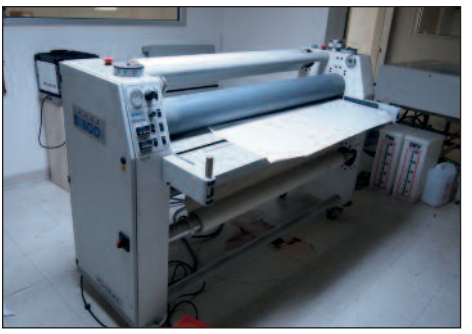
Seal Image 600 Laminator