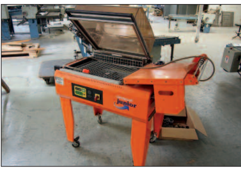
MiniPack Junior Packaging Machine