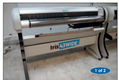
Iris 43Wide Proofers