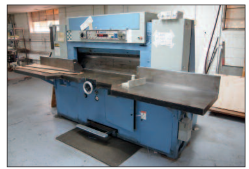
Lawson 45" Paper Cutter