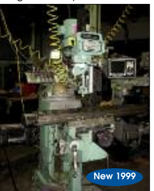
TRAK # K-3 CNC Vertical Miller