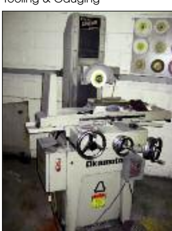
Okamoto Surface Grinder

COMPLETE LOT CATALOG AND PHOTOS WWW.THOMASAUCTION.COM