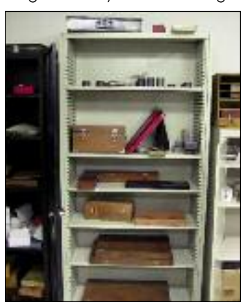
Large Quantity of Inspection Tooling & Gauging