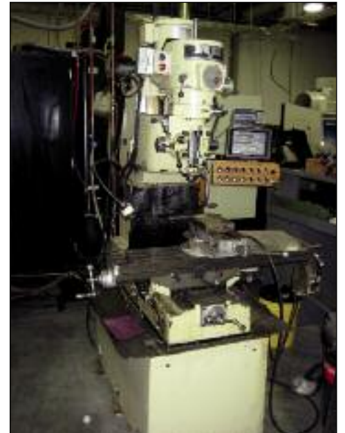
RBC "Bed Type" Vertical Miller