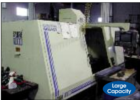
Cincinnati # Sabre-1000 CNC VMC