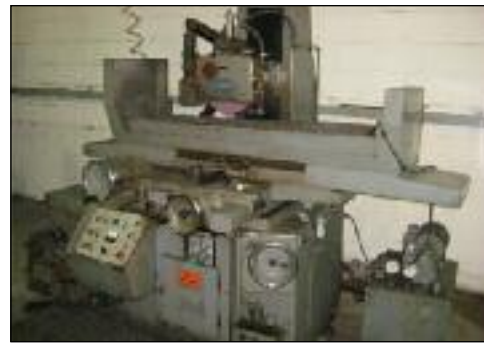
NICCO 12"x 24" Hyd. Surface Grinder