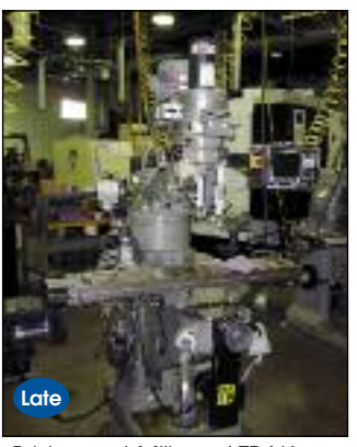
Bridgeport Miller w/ TRAK CNC Control