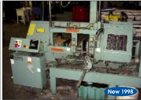
W.F. Wells # W-10-1 Horizontal Bandsaw