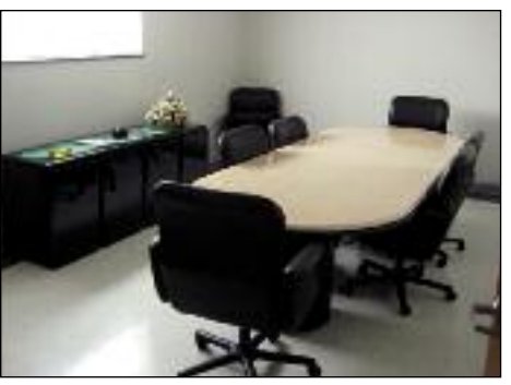
Late Type Office Furniture