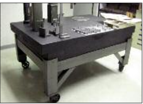
Granite Surface Plate 48"x 72"