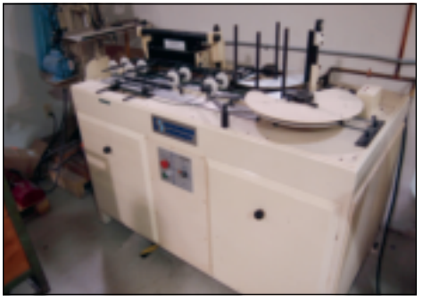
SICKINGER WIRE MACHINE, SEMI-AUTOMATIC, MODEL PS517