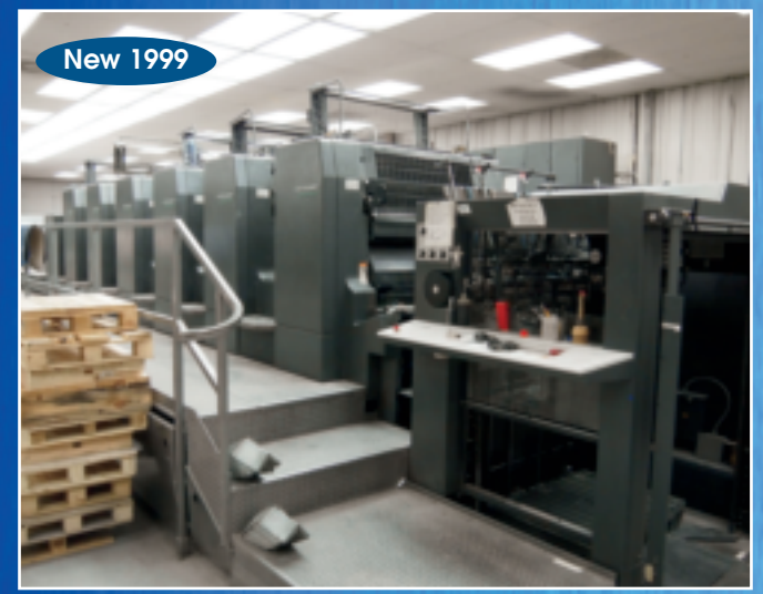
HEIDELBERG CD-102-6+L PRINTING PRESS (PRIVATE SALE - NOT IN AUCTION)