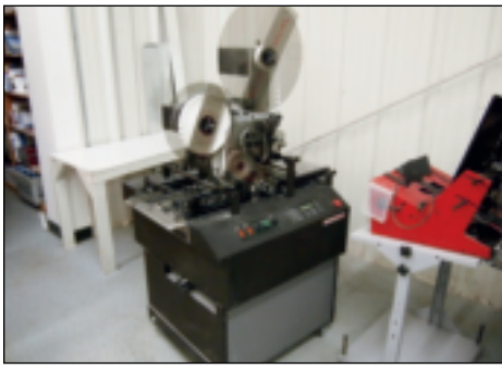
SECAP TABBER MODEL JET ONE