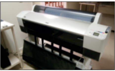
EPSON STYLUS PRO 10600 INK JET PROOFER