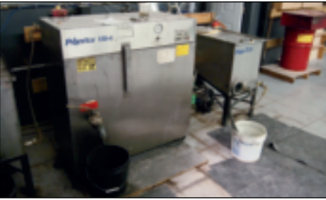
PRISCO TECH BLANKET WASH DISTILLATION SYSTEM MODEL PTR-9