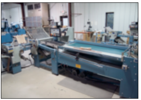
MBO FOLDER MODEL B26C

Challenge Round Corner Machine Model SCM, S/N 2368A