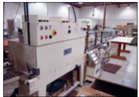
GREAT LAKES 16" SHRINK WRAP PACKAGING MACHINE