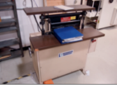
SICKINGER AUTOMATIC PUNCH MODEL USP13