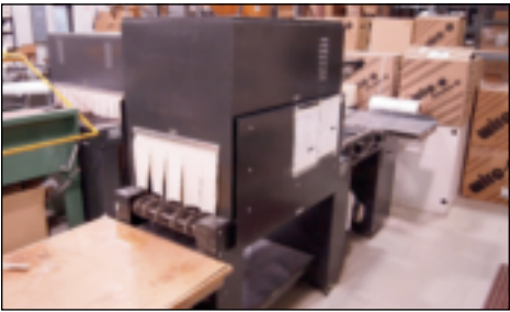
EASTEY 16" SHRINK WRAP PACKAGING MACHINE W/HEAT TUNNEL