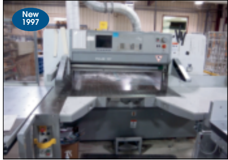
POLAR 54" PAPER CUTTER MODEL 137ED