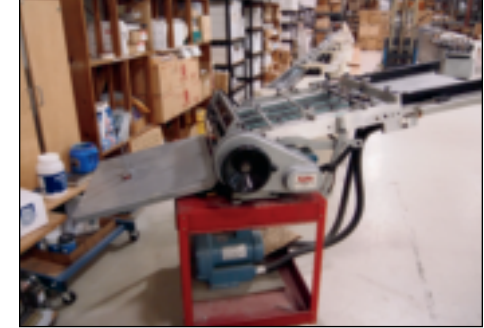
ROLLEM SCORING/PERFORATING MACHINE MODEL CHAMPION 990