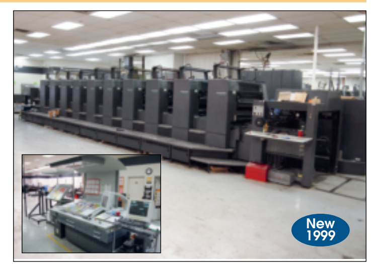
HEIDELBERG SM-102-10P-6 PRINTING PRESS (PRIVATE SALE-NOT IN AUCTION)