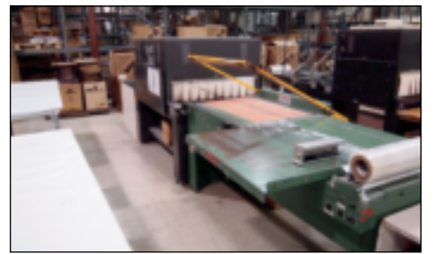
EASTEY 32" SHRINK WRAP PACKAGING MACHINE W/HEAT TUNNEL