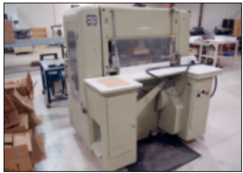
WHOLENBERG 3-KNIFE TRIMMER, MODEL K