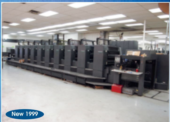
HEIDELBERG SM-102-10P-6 PRINTING PRESS (PRIVATE SALE - NOT IN AUCTION)