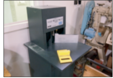
CHALLENGE ROUND CORNER MACHINE MODEL SCM