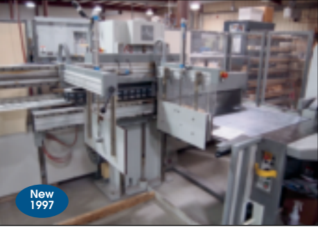
POLAR TRANSOMAT MODEL IEL110-4