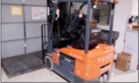
TOYOTA 2600 LB. ELECTRIC FORKLIFT MODEL 7FBEU15