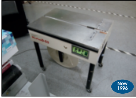
STRAPAK STRAPPER MODEL D-53