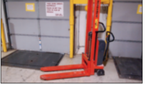
INTERTHOR 2200 LB. PAPER LIFT