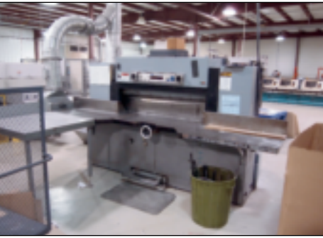
BAUM LAWSON 55" PAPER CUTTER