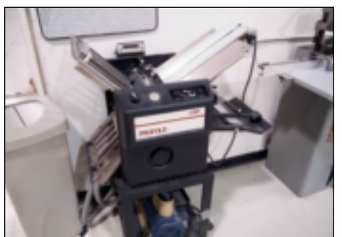
PROFOLD FOLDER MODEL 535K