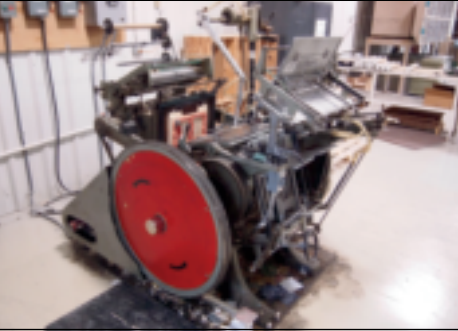
Kluge 12 X 18 Foil Stamping / Embossing / Die Cutter

Interthor 2200 lb. Paper Lift w/ Weigh Scale (5+) Hydraulic Pallet Jackets