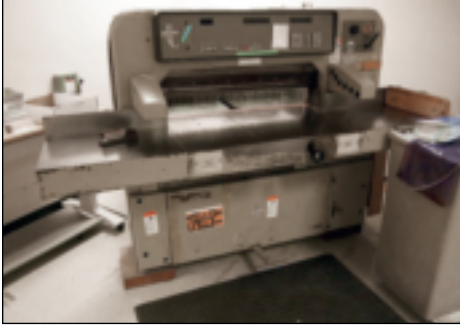
POLAR PAPER CUTTER MODEL 92ECM