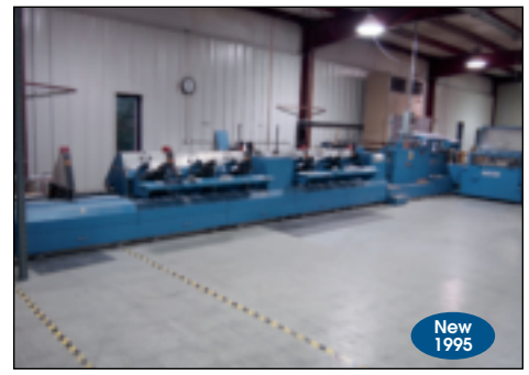
SHERIDAN HIGH SPEED SADDLE STITCHER LINE MODEL 705A-10