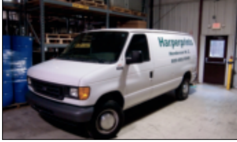
2005 FORD ECONOLINE VAN