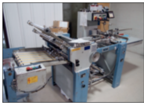
MBO FOLDER MODEL T49-2