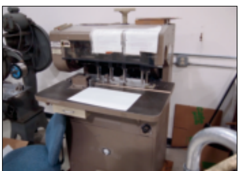
Challenge Paper Drill Model MS70A, 5-Spindle

DIE CUTTER Kluge 12 X 18 Foil Stamping / Embossing / Die Cutter, S/N NB1278-78