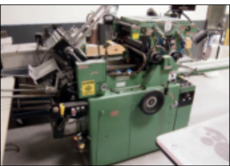
HALM JET 2-/COLOR ENVELOPE PRINTING PRESS MODEL JP 3000