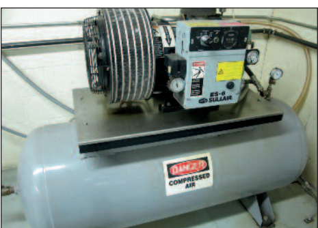
SULLAIR ES6-10H AIR COMPRESSORS