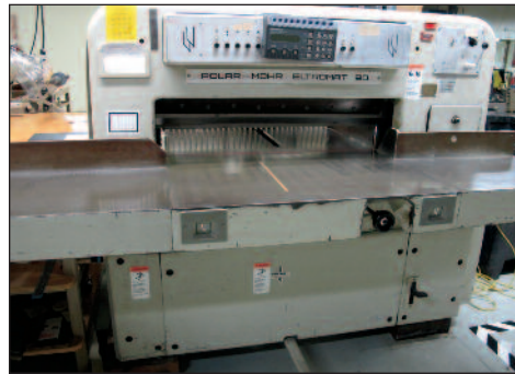
POLAR MOHR PAPER CUTTER MODEL 90CE