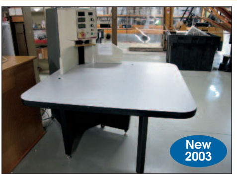
US PAPERCOUNTERS COUNTWISE PAPER COUNTER MODEL CW-M