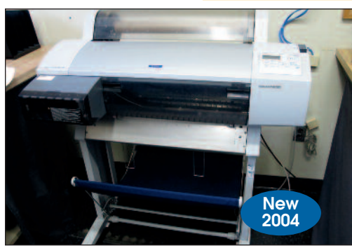
EPSON STYLUS PRO 7600 PROOFER