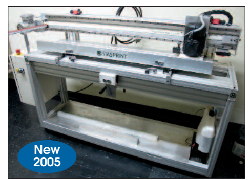
SIASPRINT SQUEEGEE SHARPENER MODEL BRAVO 110-43