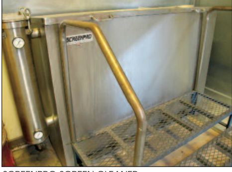
SCREENPRO SCREEN CLEANER