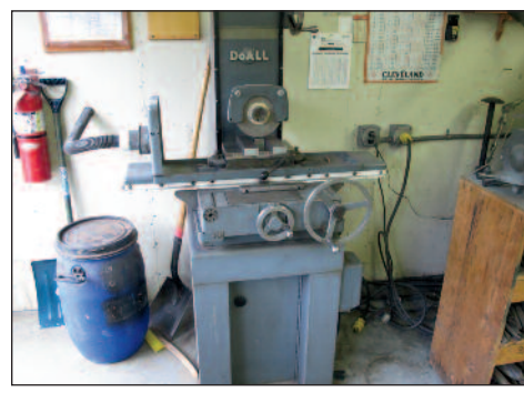
DOALL HAND FEED SURFACE GRINDER MODEL