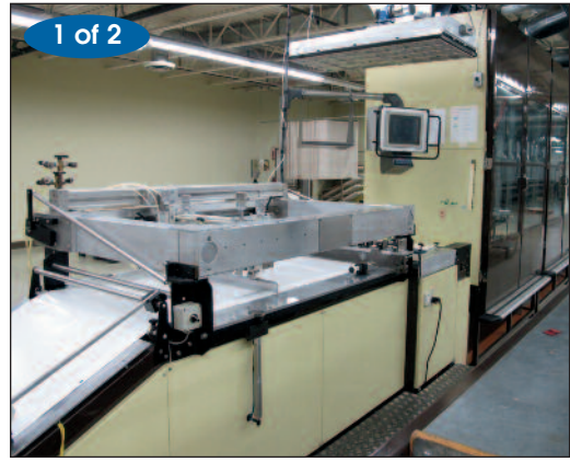
REEL-2-REEL WEB SCREEN PRINTING PRESS