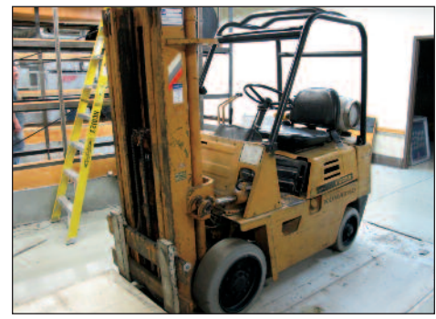
KOMATSU LPG FORKLIFT MODEL FG25S