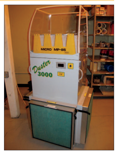
ISLAND CLEAN AIR AIR PURIFICATION UNIT MODEL DUSTER 3000

US Papercounters Countwise Paper Counter Model CW-M, S/N 1374093 (New 2003)