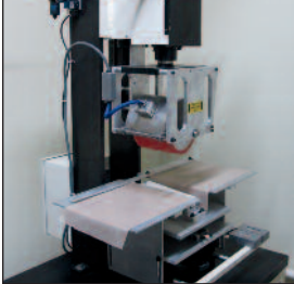
SRM STAMPRITE HOT STAMP PRINTER