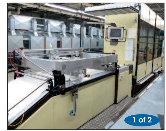
REEL-2-REEL WEB SCREEN PRINTING PRESS