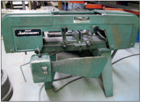
DAKE JOHNSON HORIZONTAL BAND SAW MODEL B