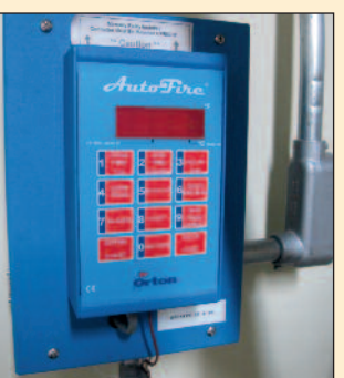
PARAGON KILN MODEL TOUCH-N-FIRE TNF283

SRM Stamprite Hot Stamp Printer, 6" Roll, Digital Temp Control, Mounted on Steel Table