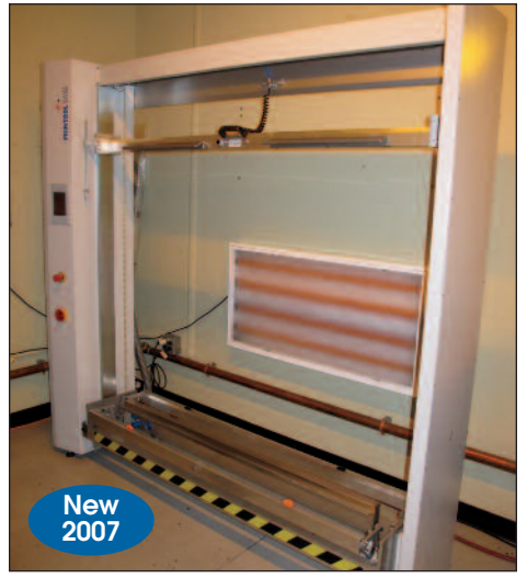
PRINTOOL SWISS SCREEN COATING MACHINE MODEL PB5110/1500X1500

STRAPPING MACHINES Akebono Interlake OB300 Strapper