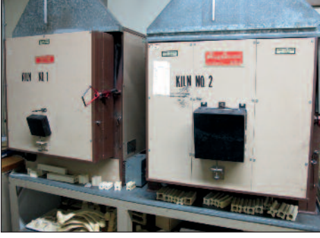
CAROL SUZANNE CERAMIC FIBER FABRICATION KILNS MODEL CSE-LAB