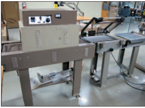
CLAMCO L-SEAL PACKAGING MACHINE MODEL 770-20

SCREEN IMAGESETTER MODEL KATANA FT-R5055R