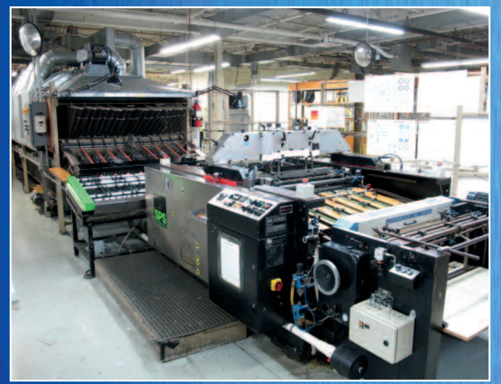
SPS SHEET FED SCREEN PRINTING LINE, VITESSA-FLEX S1-PE W/DRYING SYSTEM

SAKURAI SHEET FED SCREEN PRINTING LINE MODEL MAESTRO-72A