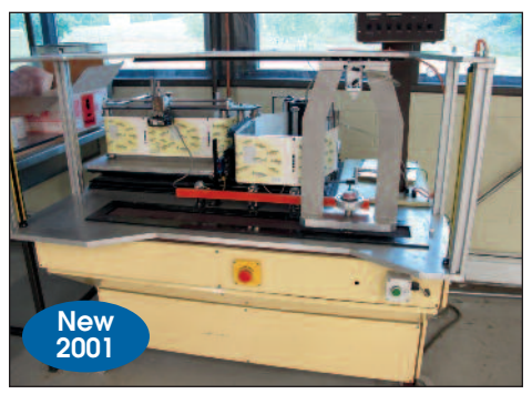
REEL-2-REEL DECORATING MACHINE MODEL SRC3