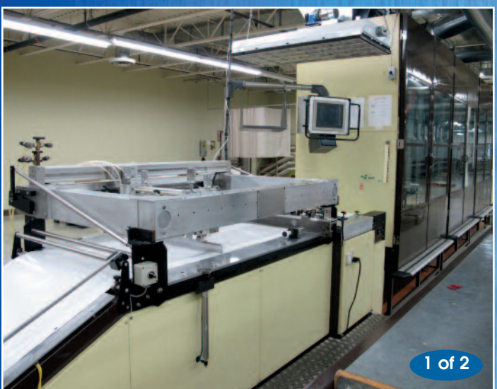
REEL-2-REEL WEB SCREEN PRINTING PRESS