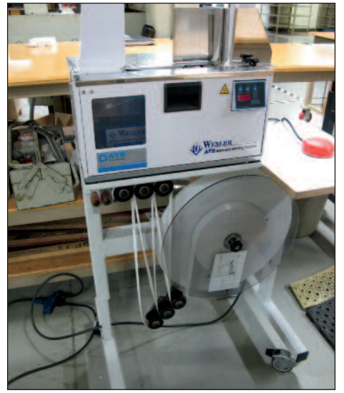
WEXLER AUTOMATIC BANDING MACHINE MODEL ATS-CE240/30