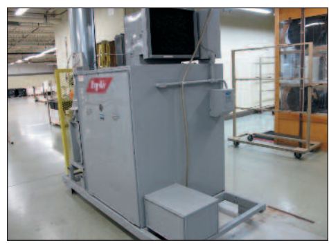
BRY-AIR DEHUMIDIFIER SYSTEM MODEL MVB-20BG