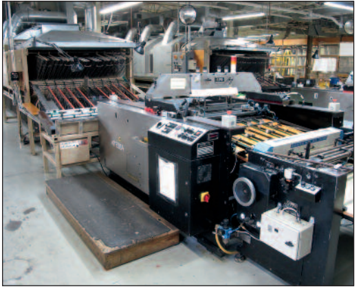
SPS SHEET FED SCREEN PRINTING LINE, VITESSA-FLEX S1-PE W/DRYING SYSTEM