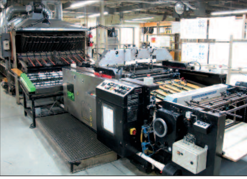
SPS SHEET FED SCREEN PRINTING LINE, VITESSA-FLEX S1-PE W/DRYING SYSTEM