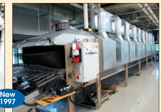
SAKURAI SHEET FED SCREEN PRINTING LINE MODEL MAESTRO-72A