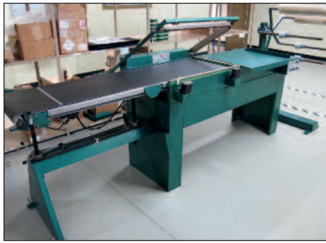
SERGEANT L-SEAL FLEXIBLE PACKAGING MACHINE MODEL 2030-B/SIMP

SCREEN IMAGESETTER MODEL KATANA FT-R5055R