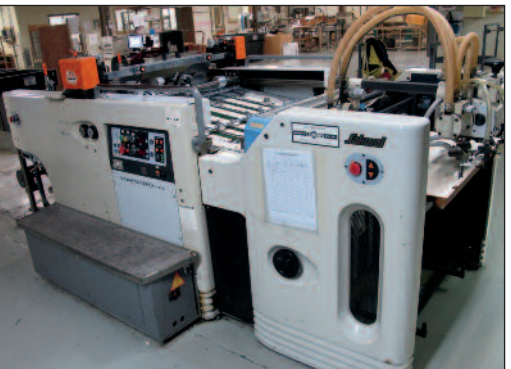
SAKURAI SHEET FED SCREEN PRINTING LINE MODEL MAESTRO-72A