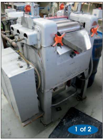
JH DAY INK MILL