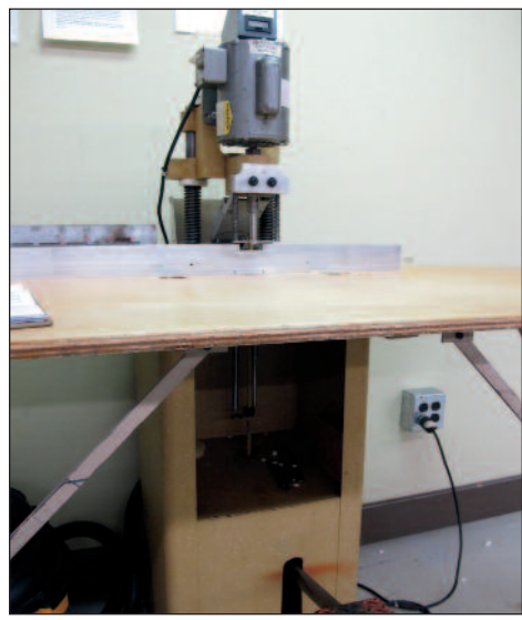
CHALLENGE PAPER DRILL MODEL JF