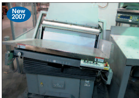
Polar Mohr Jogger Model RA-4