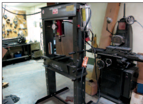
Ramco 55 Ton H-Frame Press Model RP55