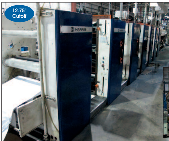
Harris Web Printing Press, Model M110