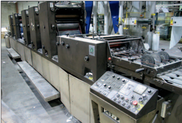
Didde Web Press Model ML 22" Cutoff