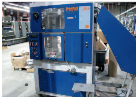
Gammerler Stacker Model Print Path STC-70