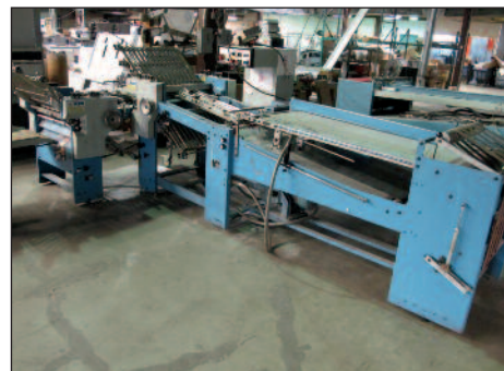
MBO Folder Model B23-C