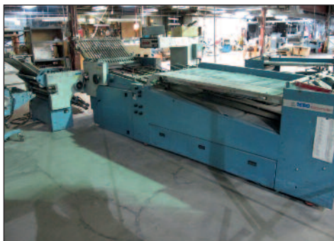
MBO Folder Model 32-S-C, Perfection Series