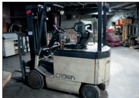
Crown 4,500 lb Electric Forklift Model 55F-SS-A063