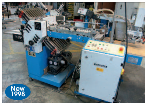
G&K Mini Folder Model FA36/6FN-TH