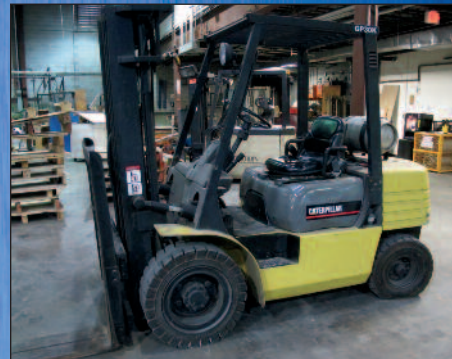
Caterpillar 6,000 lb LPG Forklift Model GP30K