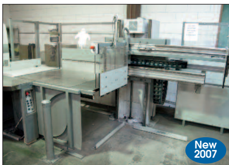
Polar Mohr Transomat Model TR130ER-5