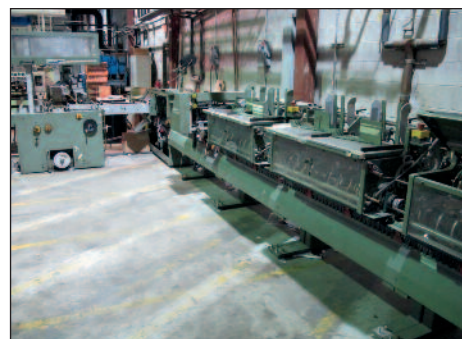
Muller Martini Mintueman Saddle Stitcher Model 1509