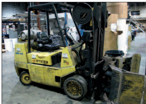
Hyster 8,000 lb LPG Forklift Model S80XL