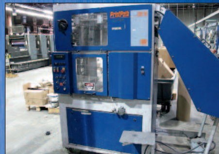
Gammeler Stacker Model Print Path STC-70

THOMAS INDUSTRIES 2414 Boston Post Road Guilford, CT 06437-2310 (203) 458-0709 • (203) 458-0727 Fax http://www.thomasauction.com