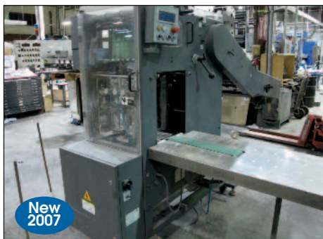
TPE Stacker Model 825