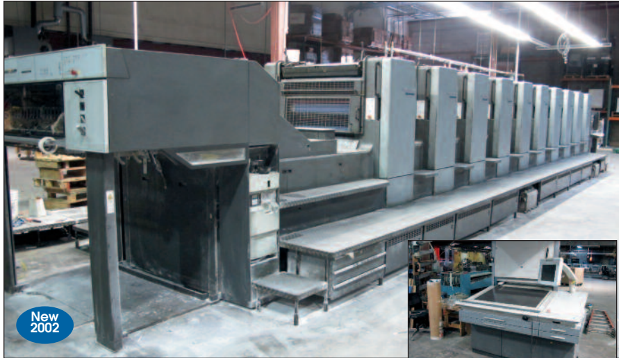
Heidelberg Printing Press Model SM102-10-P6-S