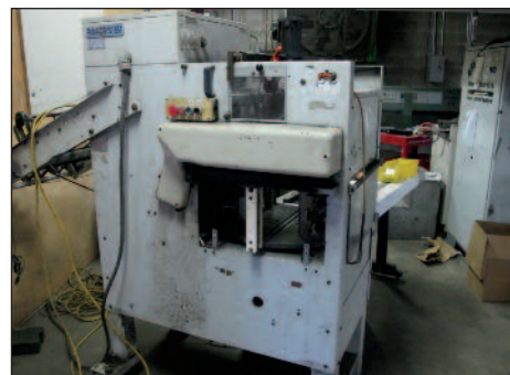
Rima Stacker Model RS-12S