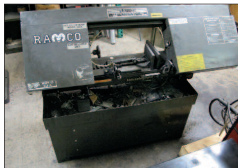
Ramco Horizontal Band Saw Model RS-90P