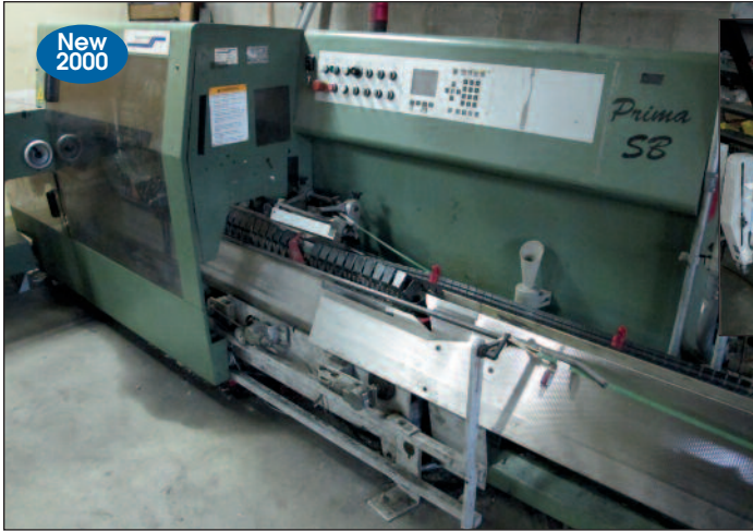
Muller Martini Saddle Stitcher Line Model Prima SB