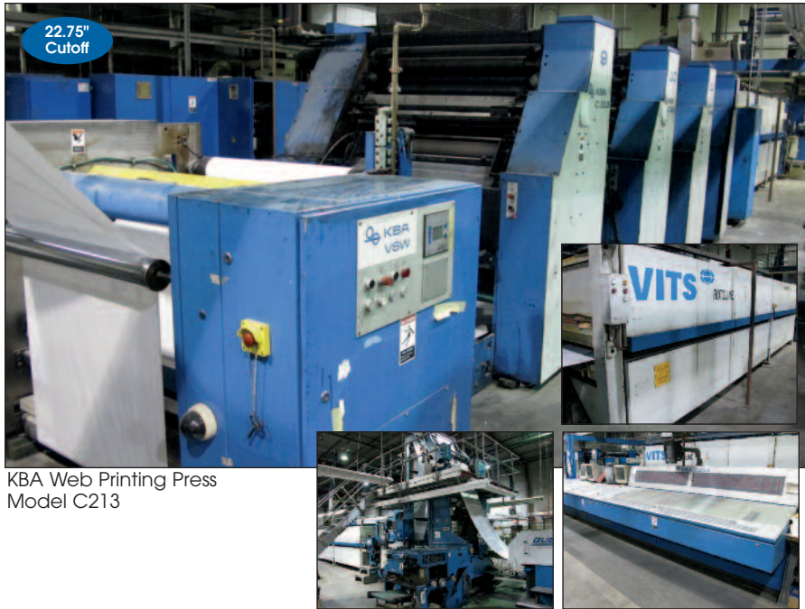
KBA Web Printing Press Model C213

2007 Questec air flotation Sheeter, 578 mm cutoff; same design as a VITS; SN PH-Q/20758