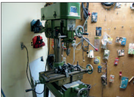
Jet Milling & Drilling Machine Model Jet-16