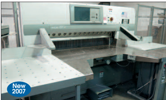
Polar Mohr Paper Cutter Model 137XT

SALE DATE: THURSDAY, JULY 19, 11:00 AM (ET)