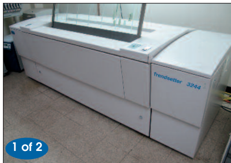
Heidelberg Creo Trendsetter