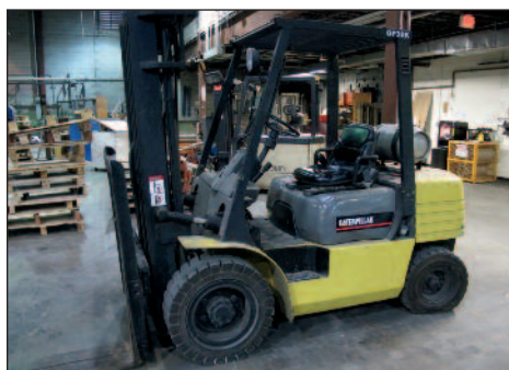
Caterpillar 6,000 lb LPG Forklift Model GP30K