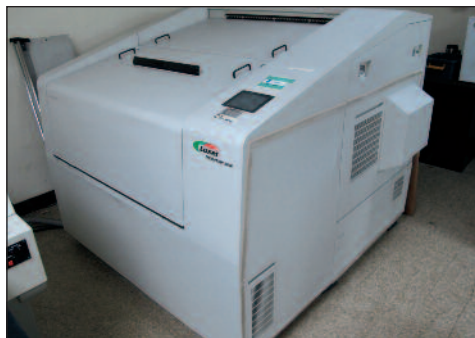
Fuji Luxel Final Proof 5600