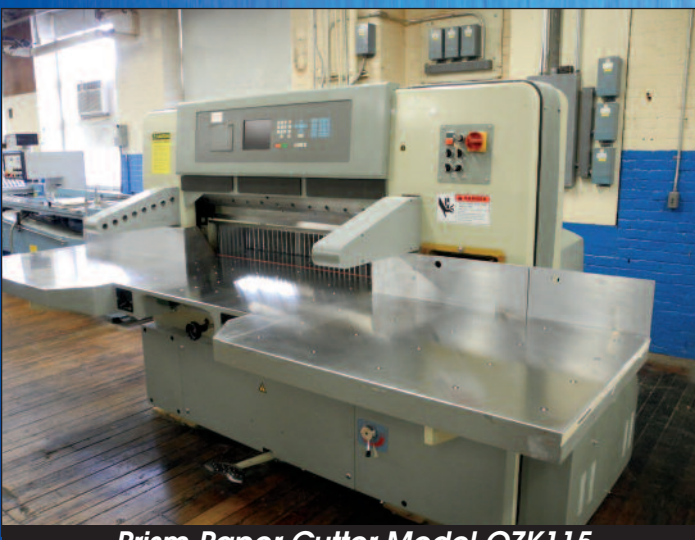
Prism Paper Cutter Model QZK115