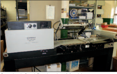
Beseler L-Seal Packaging Machine