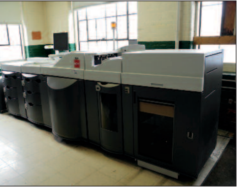
Kodak (Ikon) Digital Print System # Digimaster 125