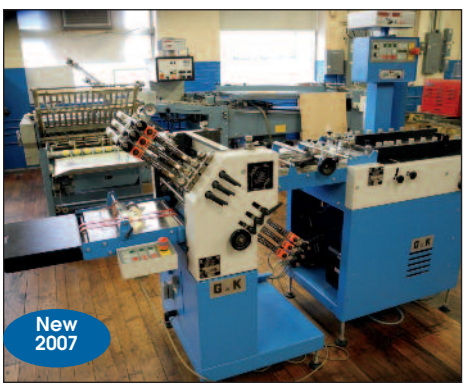
G&K Minifolder Model FA36/6-6KSAF36