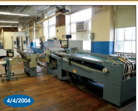
MBO folder # B30-C