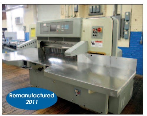
Prism Paper Cutter # QZK115

TYING MACHINE Bunn Tying Machine S/N 57220