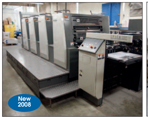
Komori 4-C Sheet Fed Printing Press # Spica 429P Heidelberg Quickmaster Printing Press #QM 46-2