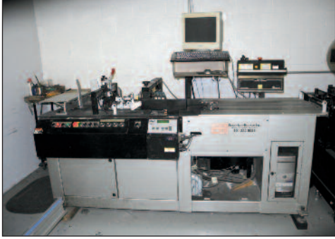
Edgeton-Becker Variable Data Videojet Print Cheshire 2" Tabbing Machine System

Challenge Round Corner Machine Model DCM, S/N 556