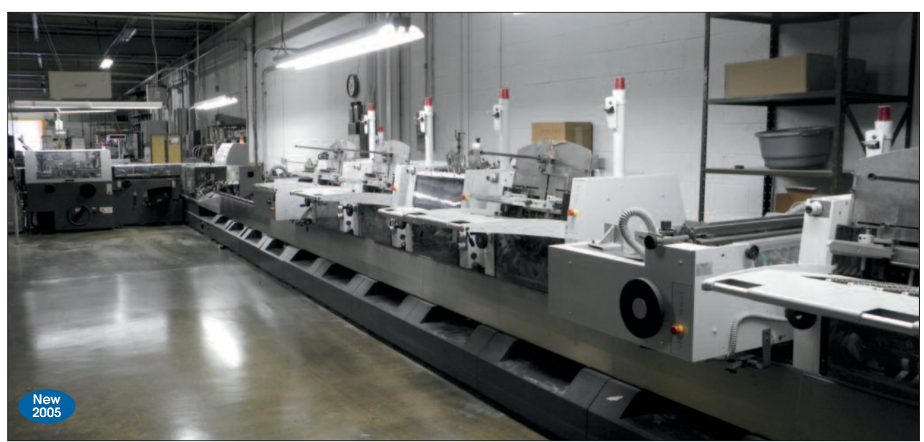
Heidelberg Stitchmaster Saddle Stitcher Line Model ST350