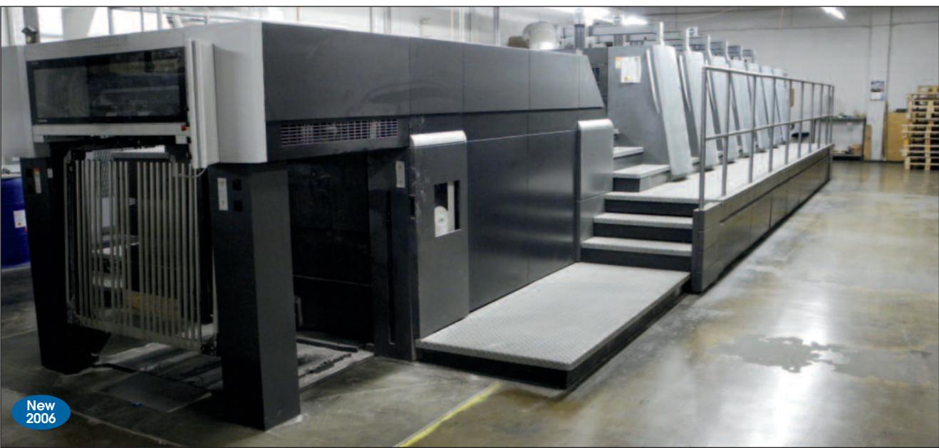
Heidelberg Speedmaster XL-105-6+LX 6-Color Sheet Fed Printing Press