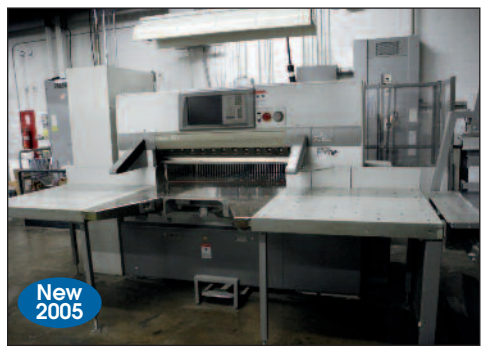
Polar Mohr Paper Cutter Model 115X