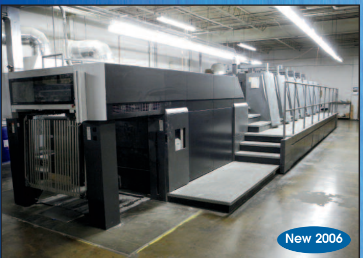
Heidelberg Speedmaster XL-105-6+LX 6-Color Sheet Fed Printing Press