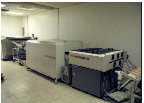
Kodak Lotem 800 Platesetter CTP System

In 1947 Thomas Industries conducted its first printing auction, mailing auction brochures, by using a metal Addressograph manual mailing system to buyers within a 50-mile radius. In 2011 our printing auctions resulted in the sale of over 6000 printing assets to 39 states -19 countries live onsite and worldwide webcast, The nation's most experienced full service printing industry specialists-Tom Gagliardi - Fred Moss -Fred Goldwyne - Ike Covin -Frank Fruciano. 203 458 0709.