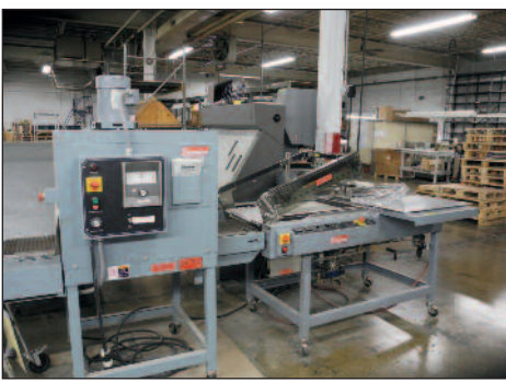
Shanklin L-Seal Packaging Machine Model S26