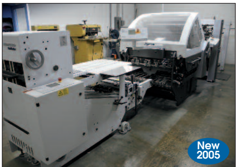
Heidelberg Stahl Folder Model KH-82-4K-2PD Heidelberg Folder Model S1426D-4-8PH-3