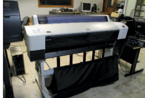
Epson Pro 9800 Wide Format Proofer