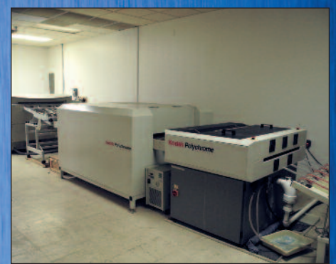
Kodak Lotem 800 Platesetter CTP System