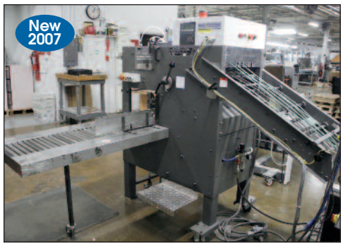
Rima Stacker #RS-1012S