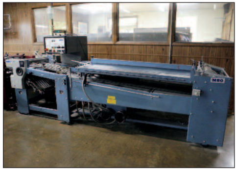
MBO Folder Model B26