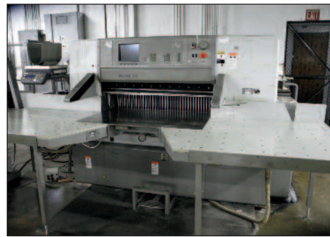
Polar Mohr Paper Cutter Model 115ED