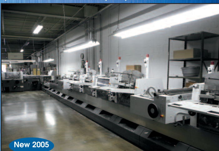
Heidelberg Stitchmaster Saddle Stitcher Line Model ST350