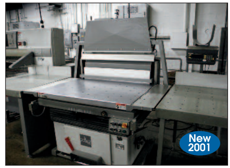
Polar Mohr Paper Jogger Model RA-4