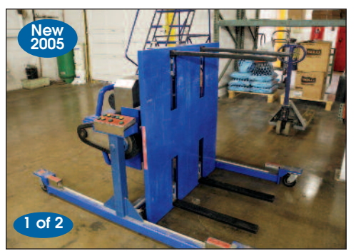
American Skid Turners Model P40