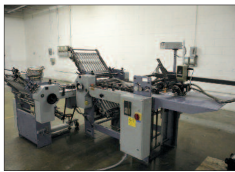
Stahl Folder Model B20

Shanklin L-Seal Packaging Machine Model S26, S/N S0118, w/Heat Shrink Tunnel #T-7XL