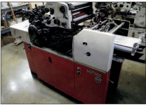
Dexter Lawson 3-Spindle Super Duty Drill Hamada Offset Duplicator Model Star 600CD Hamada Offset Duplicator Model Star 660CD