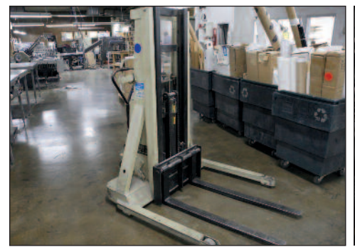
Yale 3000 Ib Electric Walk Behind Lift Truck Kaiser 20 HP Rotary Screw Air Compressor Model MCW030