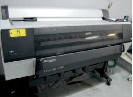
Epson Stylus 9900 Model K162A