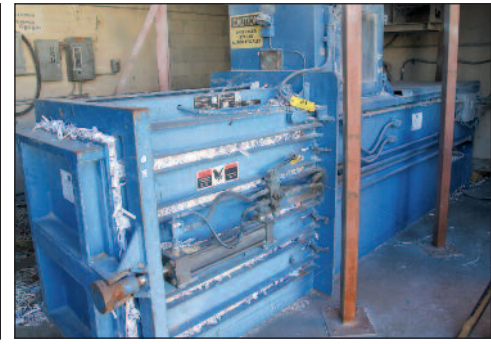
Balemaster Horizontal Baler Model FSH30