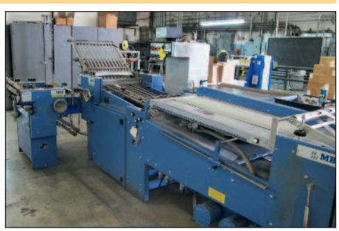
MBO Folder Model B-21-C