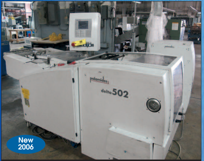
MBO Palamides Delta 502 Bander

SALE DATE: Wednesday, February 27, 1:00 PM (ET) INSPECTION: Monday & Tuesday, February 25 & 26 (9-4)