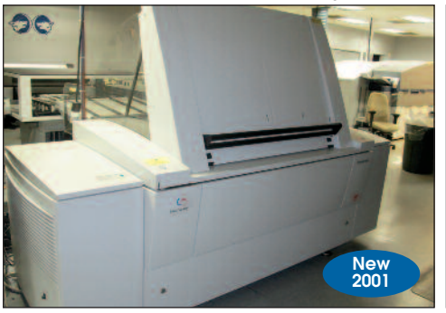
Kodak CTP System Model Trendsetter TS8