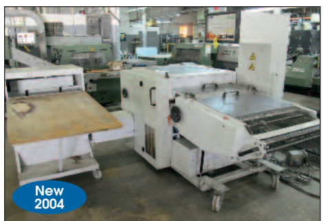
MBO Palamides BA700 Bander