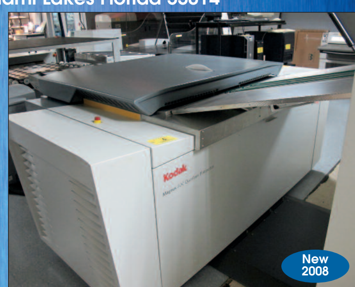
Magnus CTP System Model 800 Quantum Plate Setter

SALE DATE: Wednesday, February 27, 1:00 PM (ET) INSPECTION: Monday & Tuesday, February 25 & 26 (9-4)