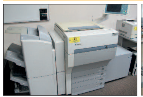
Canon Digital Printing System # Imagepress CI