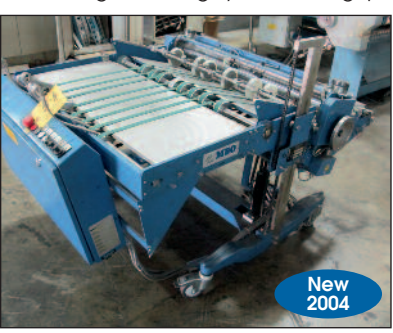
MBO Stacker Model ASP-82-2-ME