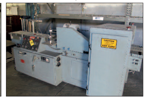
Shanklin Packaging Machine Model F1