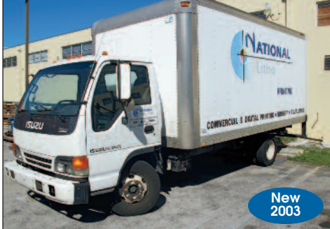
Isuzu Motors Box Truck