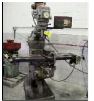
Bridgeport 1.5 HP Vertical Milling Machine