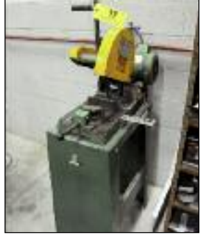
Continental #10 Cut-Off Saw