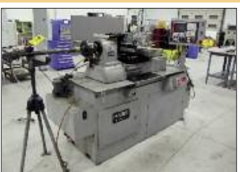
Hardinge #DSM CNC Lathe w/ Fagor CNC