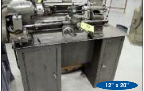
Southbend Toolroom Lathe