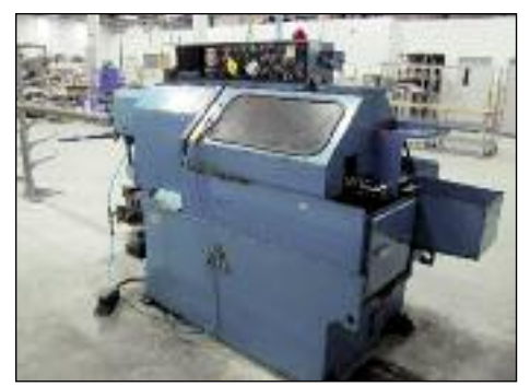
Miyano #BNC-34 "Swiss Type" CNC Lathe