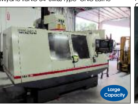
Cincinnati #Sabre-1250 CNC Vertical Machining <u>Center</u>