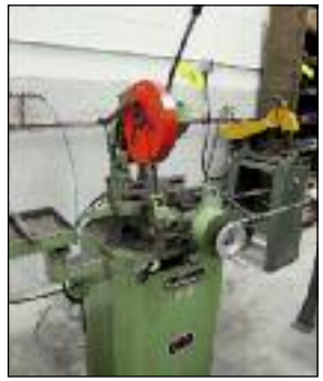
Scotchman-Bewo #315-PK Cold Saw