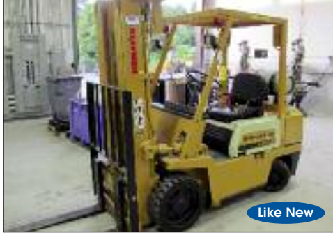
Komatsu 5000 lb. #FG-25S-4 Forklift

Miscellaneous Plant Support: (200+) CNC Tool Holders: CAT #40 & BT35, (5) Drill Presses: Chicago, Craftsman & King, (12) 6" Kurt Type Machine Vise, SMW Rotary Indexer Model #RT160PY Carbide Insert Lathe Tooling, Carbind Indexable Drills, Jacobs Drill Chucks, Collets, Universal R8 Quick Change Adaptors, Dumore Tool Post Grinders, Yuasa Tool Posts, Arbor Presses, Angle Plates, Flex Collets, Matsuura Tool Ssetter, Belt Sanders, Huot Drill Cabinets, C-Clamps, Pallet Jacks, (12) Uline Portable Metal Shelves, O/A Torch Carts, Liquid Storage Cabinets, Ladders, Tools Cabinets, etc.