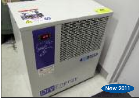
MTA #DE-0100 Air Dryer