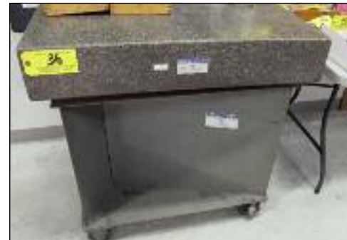
Rock of Ages 24" x 36" Granite Plate AIR COMPRESSORS - DRYERS

Komatsu #FG-25S-4 Forklift w/ 5,000 Lb Capacity, Solid Tires, LPG, Triple Mast, Side Shift and Safety Cage, S/N 172370