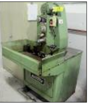
Sunnen #MBB-1660 Hone