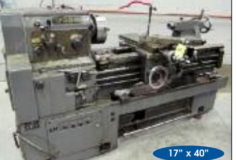
Webb #WL-435 "Gap Type" Engine Lathe

Miller #Syncrowave-250 Welder w/ Tweco #TC-900 Chiller S/N KG118051