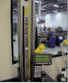
B&S (Tesa) #Micro-Hite 600 Digital Height Gage