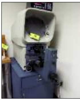
Deltronic #DH-14 Optical Comparator