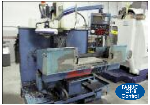
Supermax #Max-1 CNC Vertical Machining