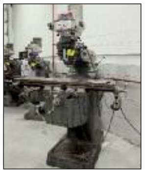
MSC 3 HP #CK-VH1052TM Vertical Milling Machine