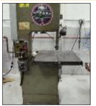
Do-All #1612-V Vertical Band Saw