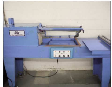
X-Rite L-Seal Packaging Machine Model 76A