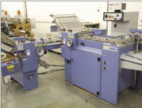
Baum System 60 Folder