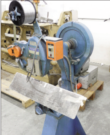
Interlake Wire Stitcher