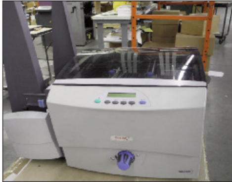
Bryce Inkjet Variable Data Printer