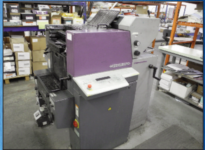
Heidelberg Printmaster Digital Printing Press