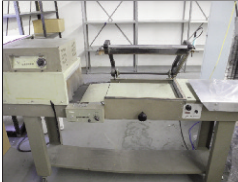
Clamco L-Seal Packaging Machine