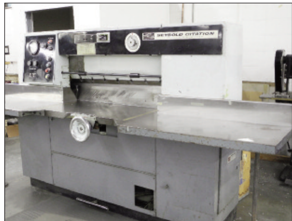
Seybold Citation 42" Paper Cutter