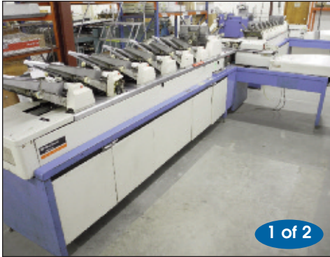
Pitney Bowes Inserter, 6-Stations