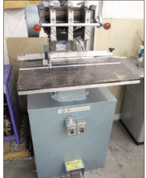
Nygren Dahly Paper Drill