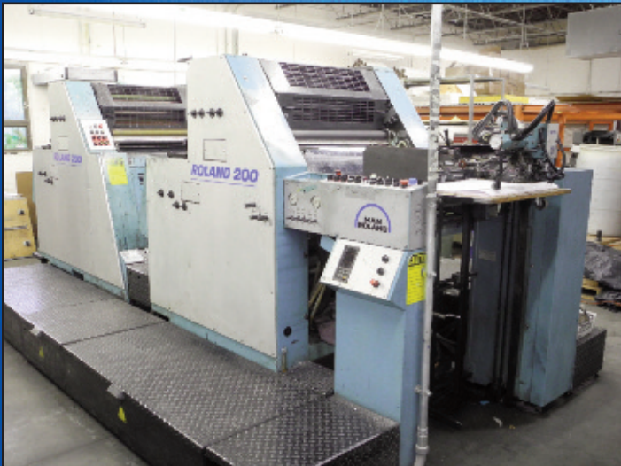
Man Roland SR204 LP Series 251 Printing Press

FIRST LOT CLOSES: THURSDAY, SEPTEMBER 12, 1:00 PM (ET) INSPECTION DATES: TUES & WEDS, SEPTEMBER 10 & 11, 9 AM TO 4 PM