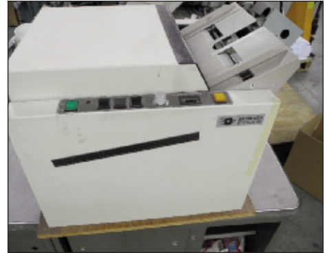
Secap Inkjet SA5300 Variable Data Printer