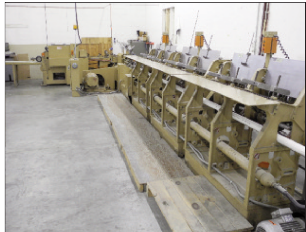
McCain Saddle Stitcher Line Model 1500