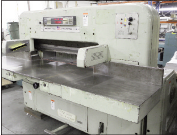
Polar Mohr 45" Paper Cutter Model 115-ST