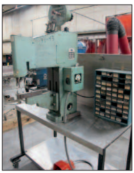
Chicago Riveting Machine Model 118