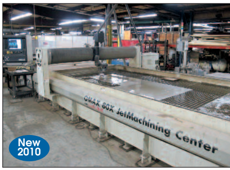
Omax CNC Waterjet System Model 80X