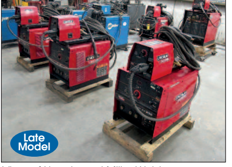
View of Lincoln and Miller Welders