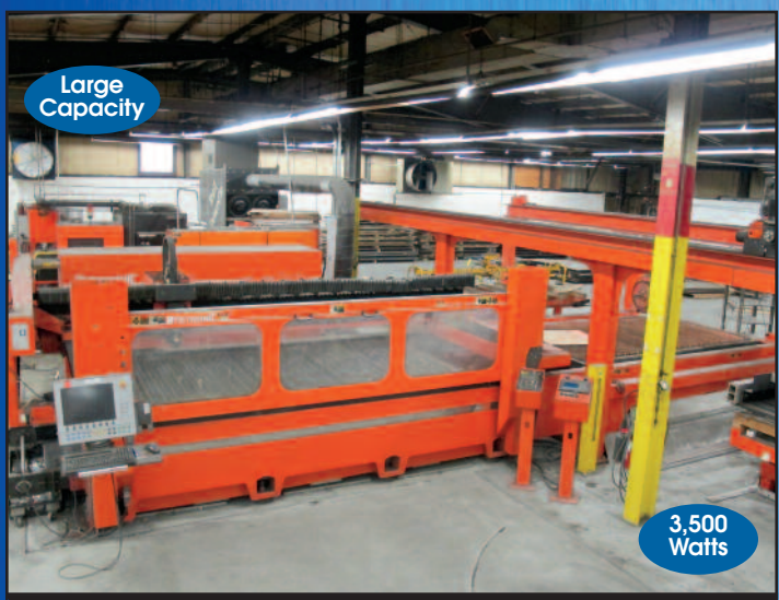
Bystronic Laser Cutter Model BTL3500