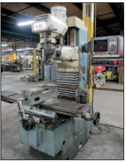
SWI Proto Trak VMM Model Trak DMP