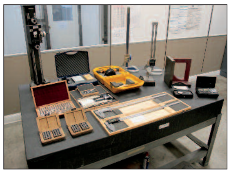
View of Inspection Tooling