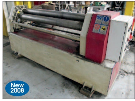
A.K. Bend Bending Rolls Model ASM130-15/4.0mm