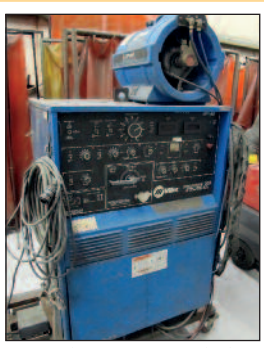
Miller Syncrowave 350 Welder