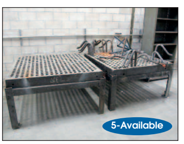
Acorn Welding Tables