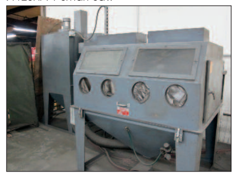
Trinco Mod.# 6044 Dual Station Dry-Blast Cabinet W/Dust Collector