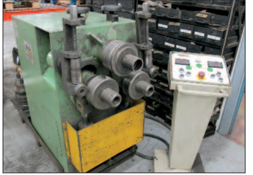
Eagle Tube Bending Machine Model