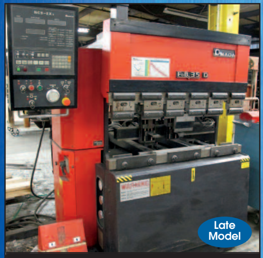
Amada CNC 4' x 35-Ton, Hydraulic Press Brake Model FBD3512E