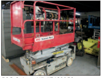
RSC Scissor Lift #7601158