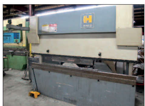
Haco CNC 10' x 120-Ton Euromaster Hydraulic Brake Model SRM-120-10