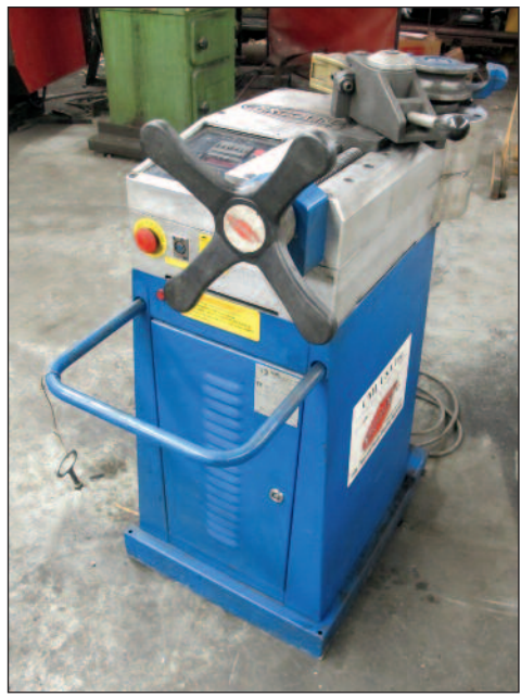
Ercolina Tube Pipe & Profile Bending Machine Model TB050-EDT