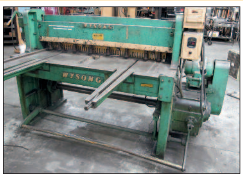
Wysong 52" x 12 Gauge Shear Model 1252