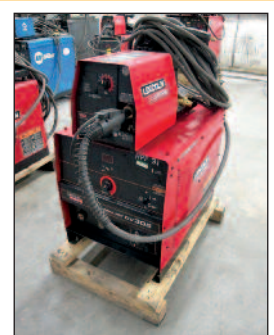
Lincoln CV-305 Welder