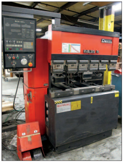
Amada CNC 4' x 35-Ton, Hydraulic Press Brake Model FBD3512E