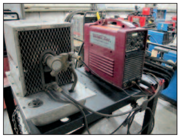
Thermal Dynamics Dynapak 4Xi Plasma Cutting System