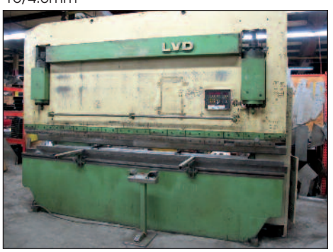
LVD 12' x 200-Ton Hydraulic Power Press Brake Model PPBL200-40