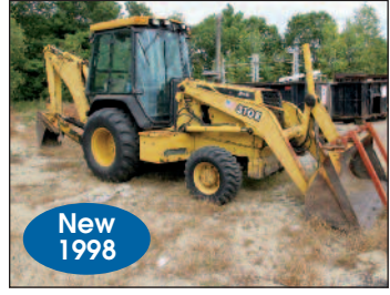
John Deere Model 310E Loader Backhoe