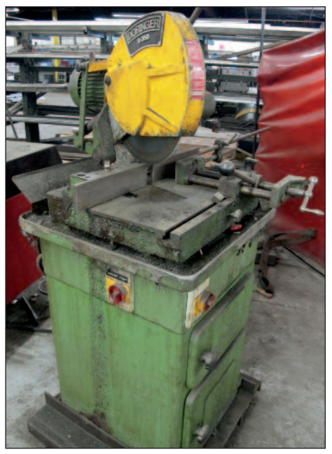
Doringer Model D350 Heavy Duty Cold Saw