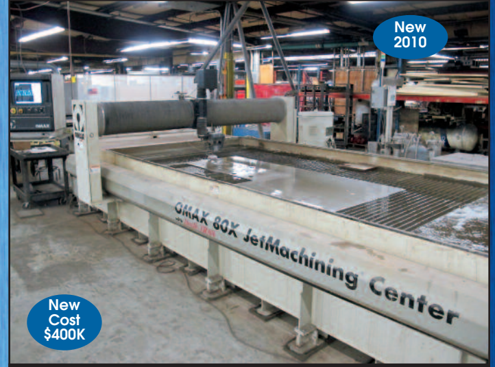
Omax CNC Waterjet System Model 80X