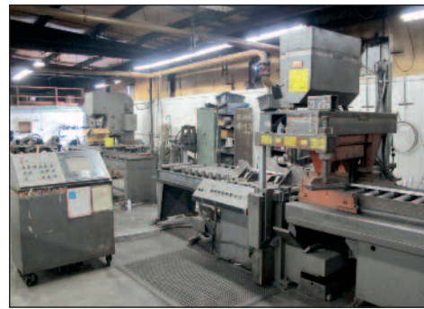
HEM CNC Metal Cutting Band Saw Model VT125HA-1-Smart Saw