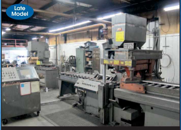
HEM CNC Metal Cutting Band Saw Model VT125HA-1-Smart Saw