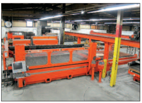
Bystronic Laser Cutter Model BTL3500