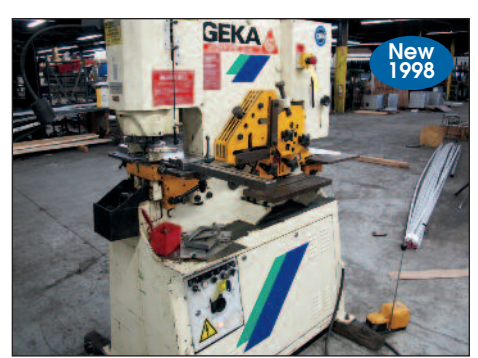
Geka Ironworker Model Hydracrop-55/A