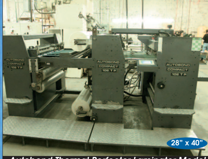
Autobond Thermal Perfector Laminator Model Compact 102-TP

BIDDING CLOSES: Thursday, January 23, 1:00 PM (ET) INSPECTION: Tuesday, January 21, 9 AM to 4 PM