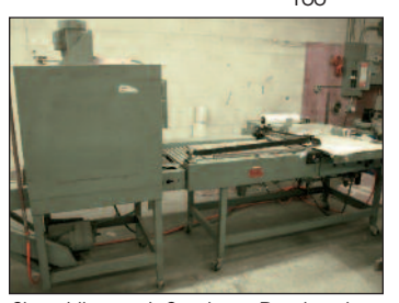
Shanklin L-Seal Packaging Machine Model S-4C