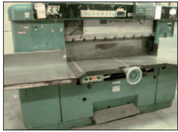
Seybold 55" Paper Cutter Saber III Model: CKD-5