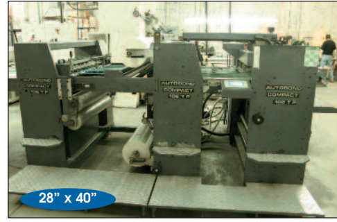
Autobond Thermal Perfector Laminator Model Compact 102-TP