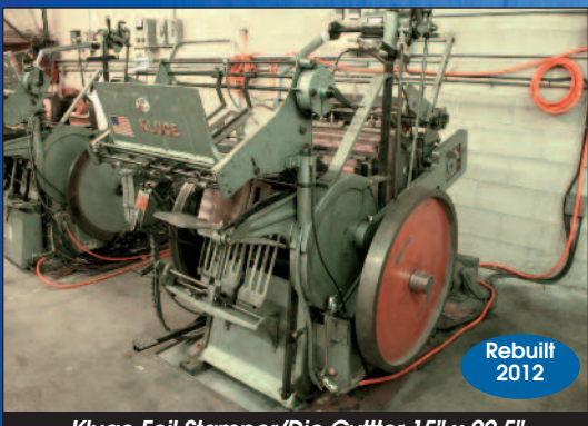
Kluge Foil Stamper/Die Cuttter 15" x 22.5"