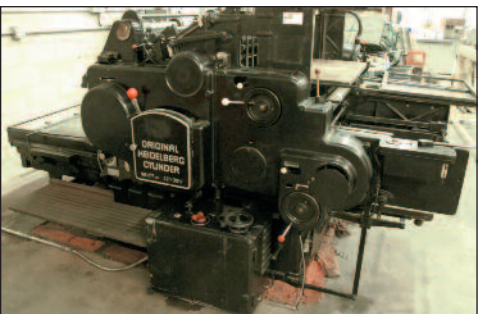
Heidelberg Cylinder Die Cutter Model SBG