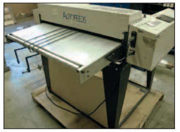
Autofeeds 30" Encapsulating Film