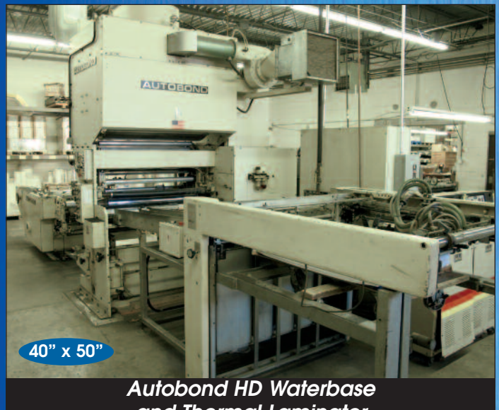
and Thermal Laminator

179 Tosca Drive, Stoughton, Massachusetts 02019