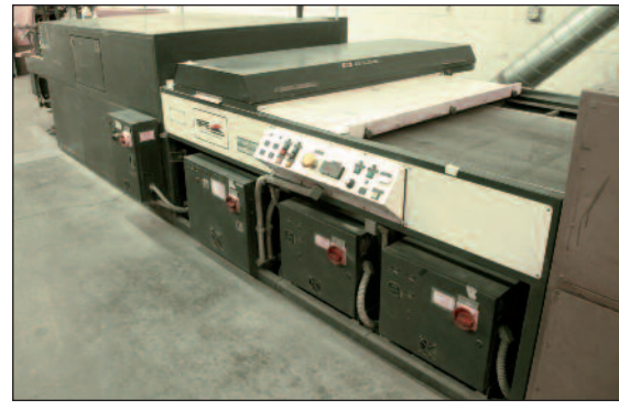
Sakurai SC102A Screen Printing Press