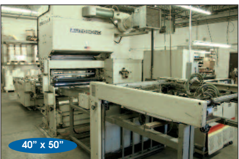
Autobond HD Waterbase and Thermal Laminator