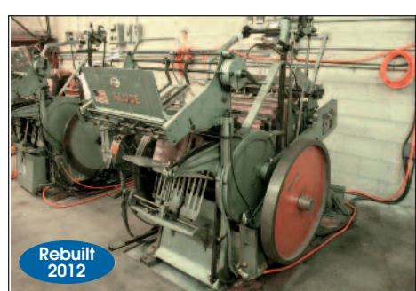
Kluge Foil Stamper/Die Cuttter 15" x 22.5"