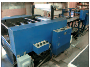
D&K 28" Double Coat/Laminator