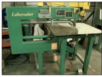
Laborsaber Ultra-Matic Die Saw Model DJ36