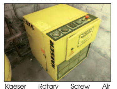
Kaeser Rotary Screw Compressor Model SX-6