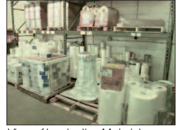
View of Laminating Materials