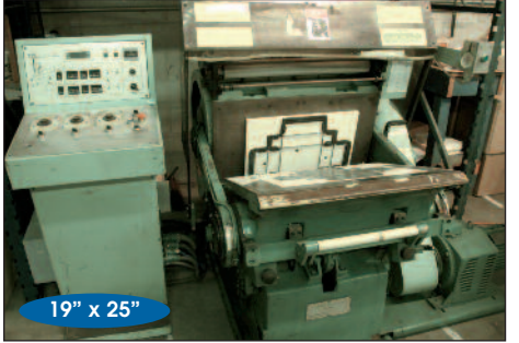
Thompson Die Cutter