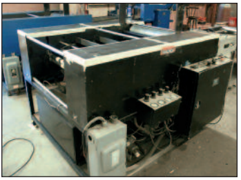
D&K 26" Double Coater/Laminator