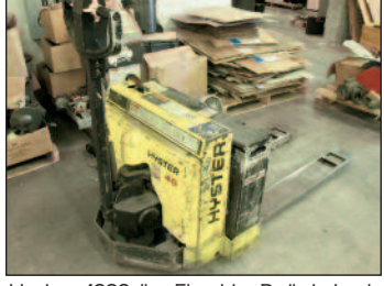
Hyster 4000 lb. Electric Pallet Jack Model W40XT