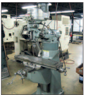
Bridgeport 2 HP Series I Vertical Mill