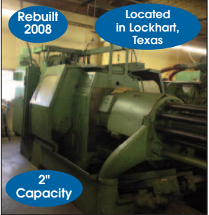
ACME-GRIDLEY # RB-8