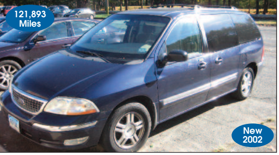
MILLER # SYNCROWAVE 350- FORD "WINDSTAR" VAN VIN # 2FMZA52442BB04537