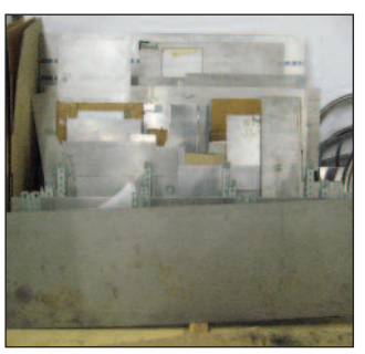
View of Raw Material