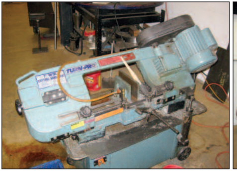
Turn-Pro 7" Horizontal Bandsaw