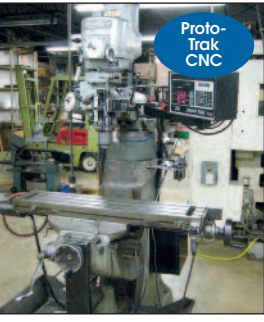
Milling Machine CNC - TAPPING CENTER