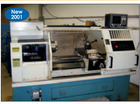
Southwestern Industries TRAK #TRL-1840-CSS