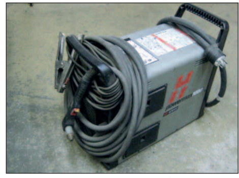
Hypertherm #Powermax-1000-G3 Portable Plasma Cutter