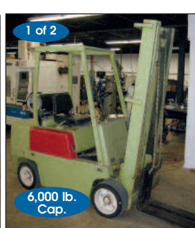
Clark #C-500-S60 Forklift