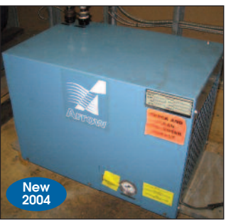
ARROW AIR DRYER