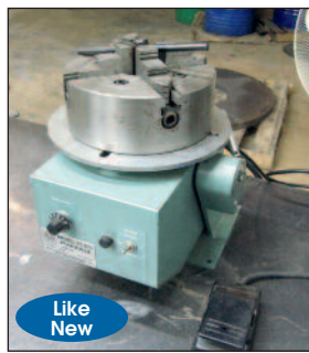
Atlas #XT-200 Welding Positioner