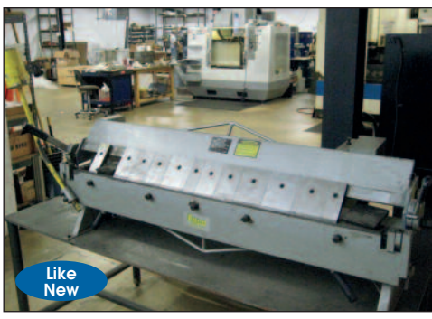
Enco 48" Box & Pan Brake