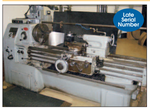
Okuma #LS Engine Lathe