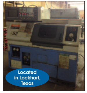
MAZAK # QUICK-TURN 6T CNC LATHE