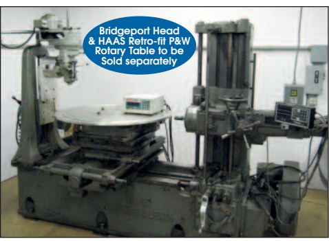
#MX-45E CNC Vertical Machining Giddings & Lewis #25-RT Horizontal Boring Mill