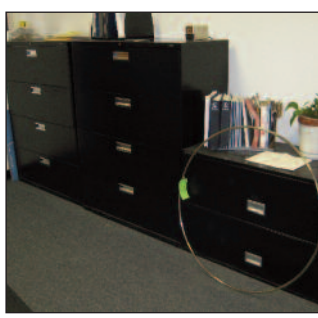
Office Furniture Available