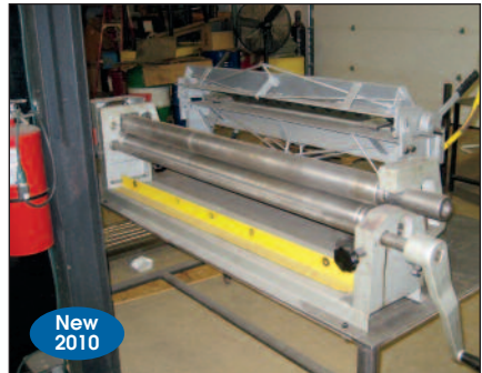
Enco 50" Slip Roll, 16G, Model #5016