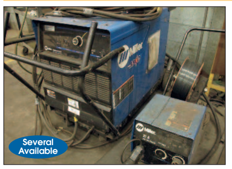
Miller Welder Model Deltaweld 452