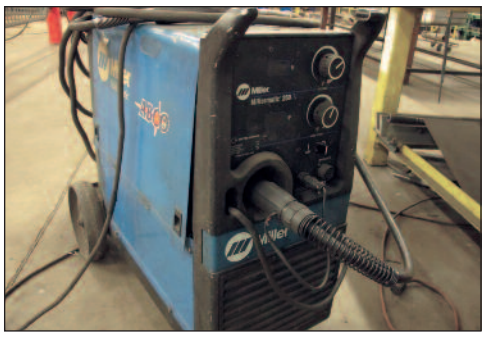
Miller Welder Model Millermatic 135