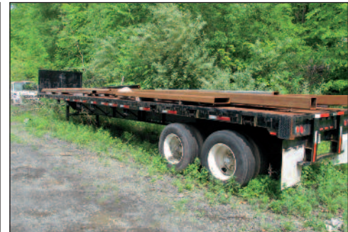
Great Dane Flat Bed Trailer Model GPS-45