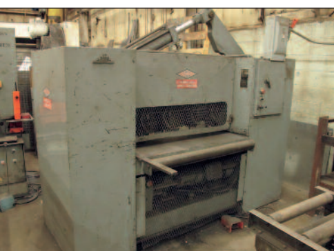
Metal Muncher # PS-4800 Hyd. Plate Shear