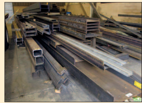
Large Steel Inventory