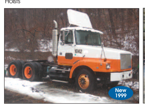
International Diesel Tractor Truck