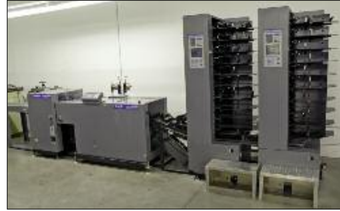
Duplo System 5000 Booklet System