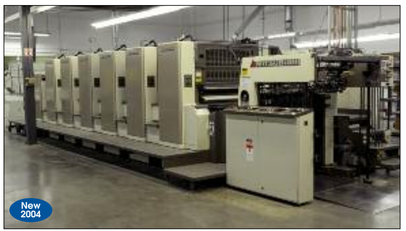
Mitsubishi 6/C Printing Press Model D3000-S