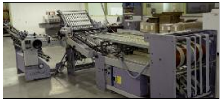
Stahl Folder Model TF-56