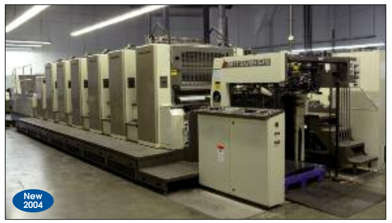
Mitsubishi 6/C Printing Press Model D3000-LX-6