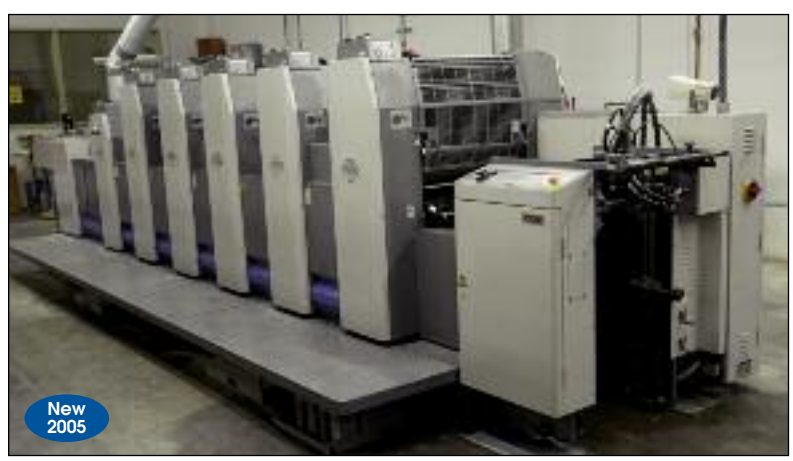
Ryobi 5/C Printing Press Model 525GX

COMPLETE LOT CATALOG, REGISTRATION & BIDDING AT: WWW.THOMASAUCTION.COM