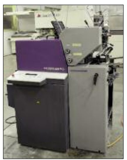
Heidelberg 2/C Printing Press Model QM46-2

Washers, Continuous Feed & Delivery, Delta Dampening, All Standard Equipment 1999 Heidelberg 2-Color Sheet Fed Printing Press Model QM-46-2, Meter Reads 22 Million, S/N 959772.