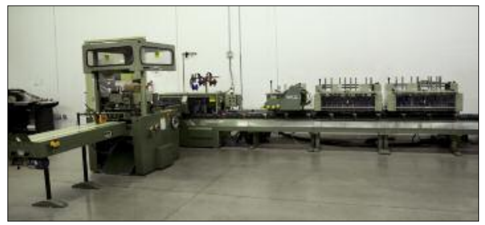
Muller Martini Saddle Stitcher Line Model Minuteman

COMPLETE LOT CATALOG AND PHOTOS WWW.THOMASAUCTION.COM