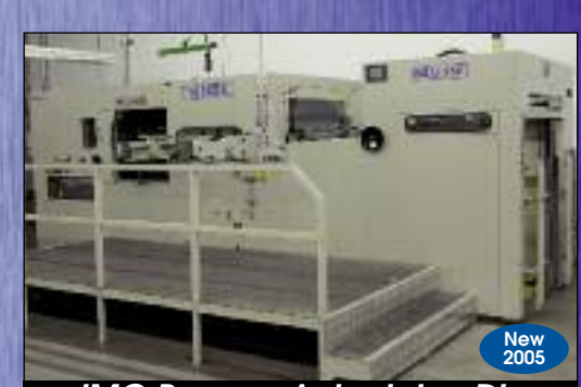
IMG Brausse Autoplaten Die Cutter Model 1050SE

Mitsubishi 6/C Printing Press Model D3000-LX-6