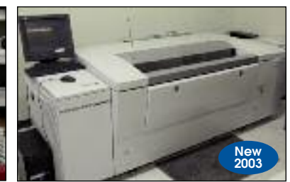
Creo Scitex CTP System Model Trendsetter 800 II Quantum