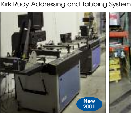
Buskro Addressing and Tabbing System