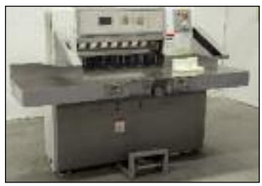
Polar Mohr 30" Paper Cutter Model 78ES

COMPLETE LOT CATALOG AND PHOTOS WWW.THOMASAUCTION.COM