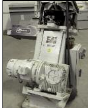
PMC Die Cutter Punch Model F79