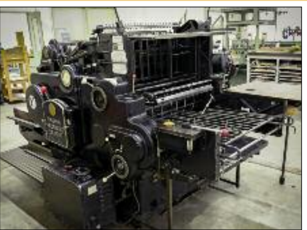
Heidelberg Original Cylinder Die Cutter 22" x32"

Know of a Printing Plant Closing? Call Now: 203-458-0709 We Pay Finders Fee $$$$