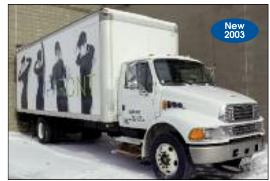
Sterling Box Truck Model Acterra