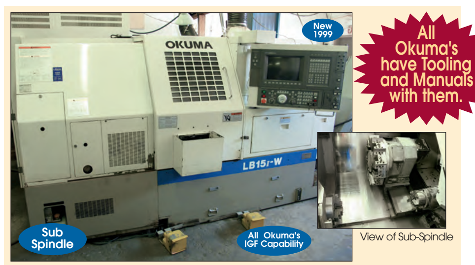
Okuma # LB-15-II-W CNC Turning Center W/ Sub-Spindle