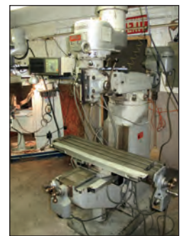
Bridgeport "Series I", 2 HP Vertical Milling Machine