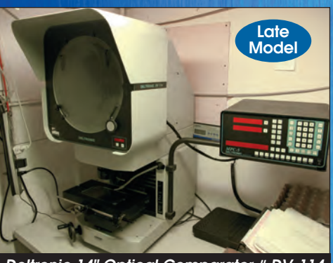
Deltronic 14" Optical Comparator # DV-114