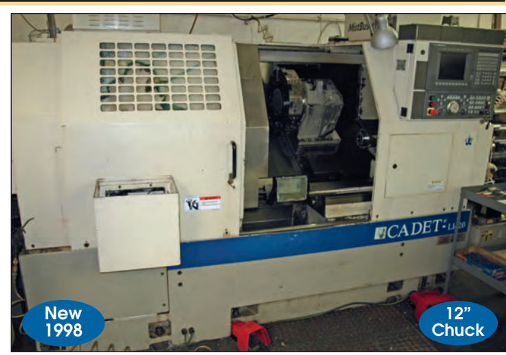
Okuma "Cadet" # L-1420 CNC Turning Center