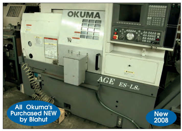
Okuma "Heritage" # ES-L8-II CNC Turning Center