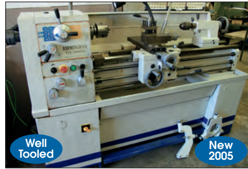
Birmingham # YCL-1440GH "Gap Type" Engine Lathe