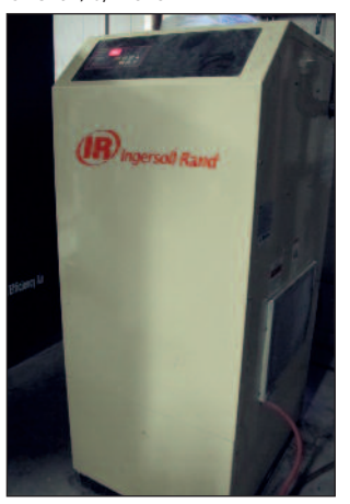
Ingersoll Rand Compressed Air Dryer Model NVC200A200,