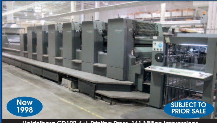
Heidelberg CD102-6+L Printing Press, 161 Million Impressions

AUCTION #2 - Sheet Fed, Bindery, Mailing Bidding Closes: March 19, 1:00 PM (ET) Location: 2305 S 1070 West, Salt Lake City, Utah 84119