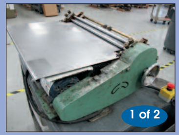
Potdevin Rotary Press Model W24-73