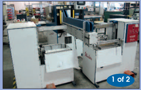
On Demand Super Smasher Model 55, S/N 102 w/ (2) On Demand Super Stickers