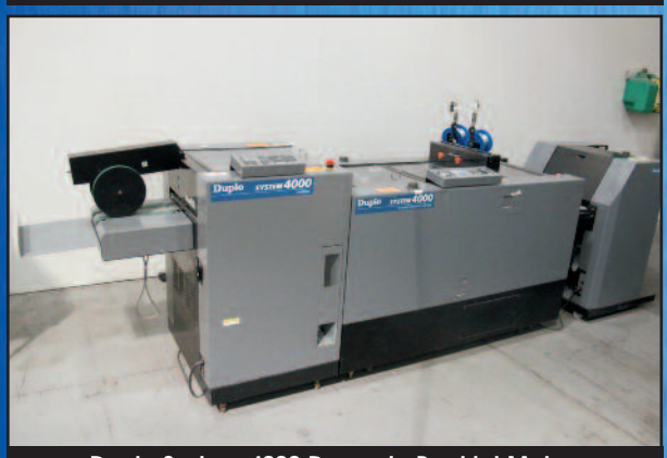
Duplo System 4000 Dynamic Booklet Maker