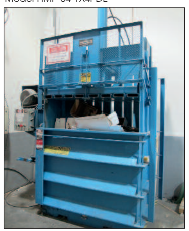
Summit Vertical Hydraulic Baler Model Nova 660/40