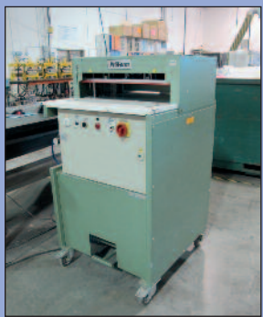
Praform Hand Smasher Model Pra Form 2100A