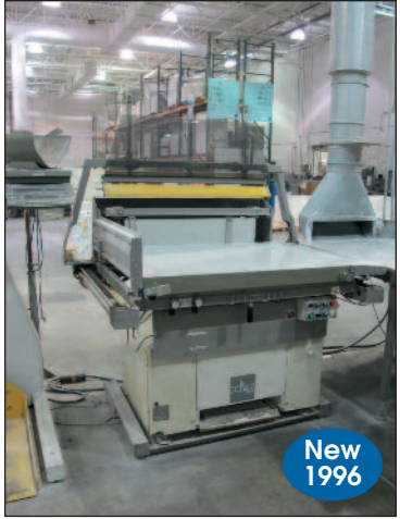
Polar Mohr Jogger Model RAB5, w/ Quartzel Digital Weigh Scale