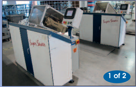
ODM Sewer Model Super Sewer, S/N SN-¬-107, w/ Seiko Sewing Machine Head