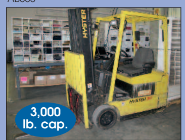
Hyster ForkLift Model J30XMT2