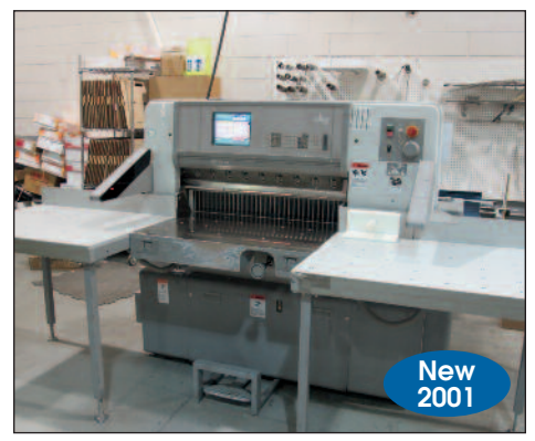
Polar Paper Cutter Model 92E New 2001