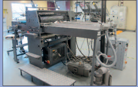
AutoBond Laminator Model MINI 76 TPM, S/N