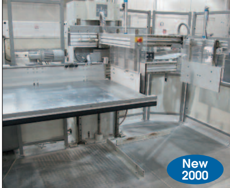
Polar Mohr Transomat Paper Delivery System Model TR130ER-5