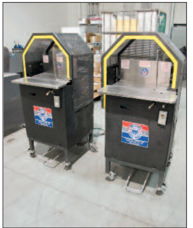
Bunn Package Tying Machine 2-Available