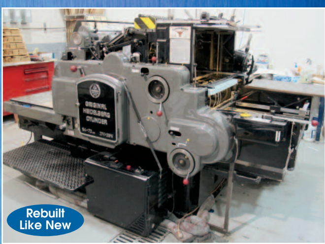
Original Heidelberg Cylinder Press 21 1/4" x 28 3/8"