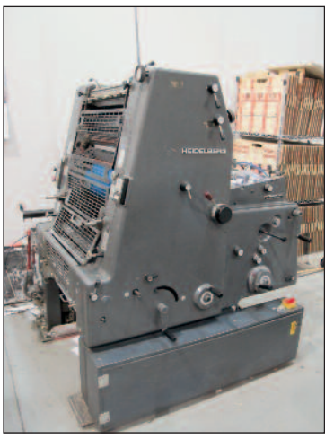
Heidelberg GTO Printing Press Model GTO-52, S/N 676271