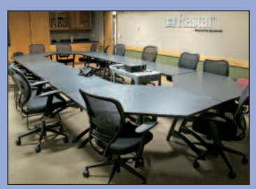
View of Executive Conference Room