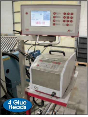
HHS Promelt Hot Melt Glue System Model HMP-04-1X4PDE