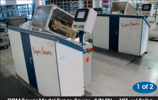
ODM Sewer Model Super Sewer, S/N SN-¬-107, w/ Seiko Sewing Machine Head