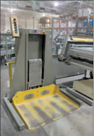
Polar Mohr Paper Lift Model L600W-3