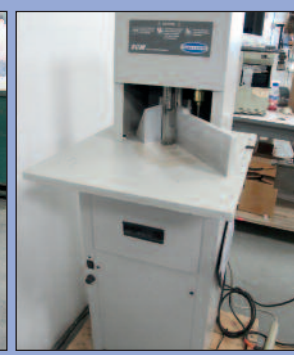
Challenge Corner Machine Model SCM, S/N 2188A