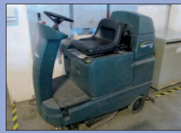
Nobles Floor Scrubber Model Speed Scrub, Electric