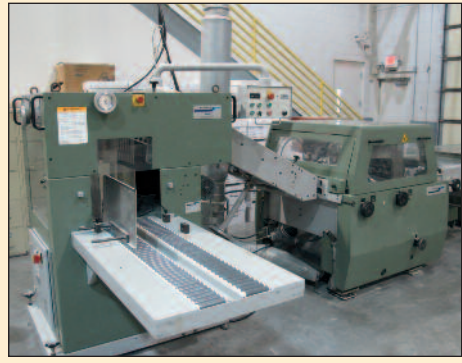
Muller Martini Saddle Stitcher Line Model Prima S/N 389-0025, 8 Pocket Feeders, Cover Feeder