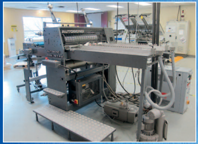
AutoBond Laminator Model MINI 76 TPM, S/N 910225

OPEN HOUSE INSPECTION DAYS: 3/10, 3/11, 3/17 & 3/18 - 9 AM to 4 PM