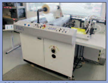
GBC Laminator Model Delta 93000977