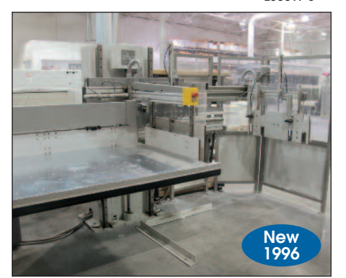
Polar Mohr Transomat System Model TR1ER110-4