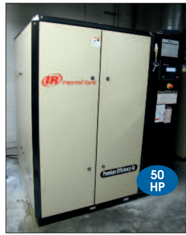
Ingersoll Rand Premium Efficient Air Rotary Screw Air Compressor Model IRN50H-CC