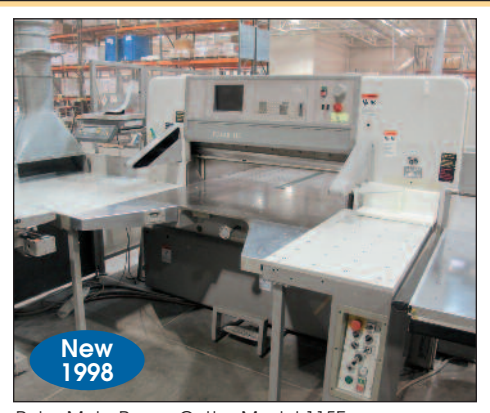
Polar Mohr Paper Cutter Model 115E