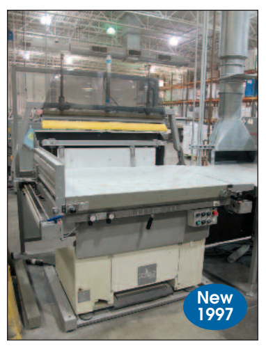
Polar Mohr Jogger Model RAB5, w/ Quartzel Digital Weigh Scale