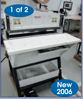
Renz Super 700 Punch