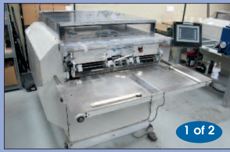
GP2 Auto Case Maker Model SC-2