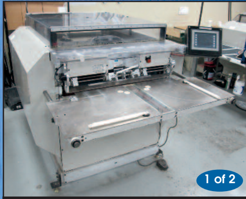
GP2 Auto Case Maker Model SC-2