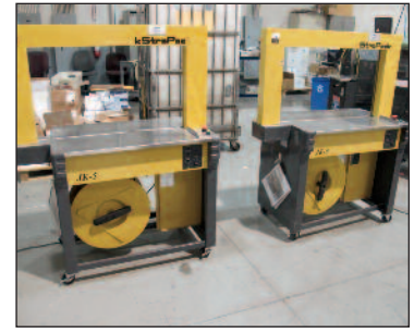
Strapers StayPack #1 Model JK54-Available

THOMAS INDUSTRIES, INC 2414 BOSTON POST RD. GUILFORD, CT 06437 203 458 0709 GAVEL@THOMASAUCTION.COM