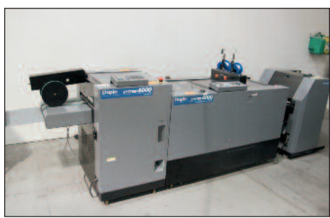
Duplo System 4000 Dynamic Booklet Maker