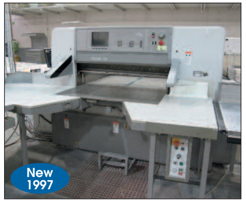
Polar Mohr Paper Cutter Model 115ED