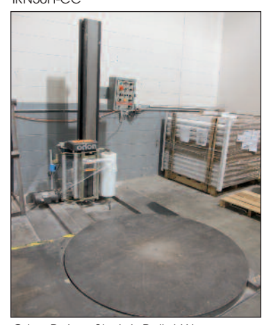
Orion Rotary Stretch Pallet Wrapper Model 166-17