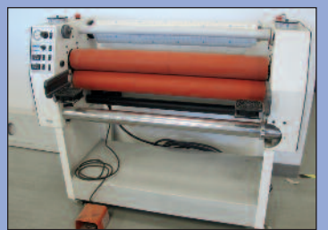
Seal Laminator Model IT400, S/N 52U400723