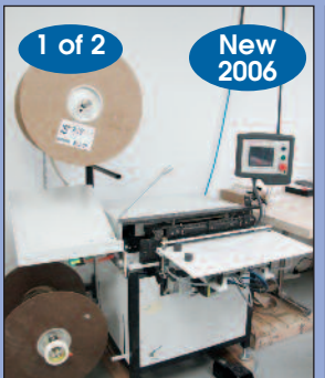
Renz Autobind 500 Model AB500