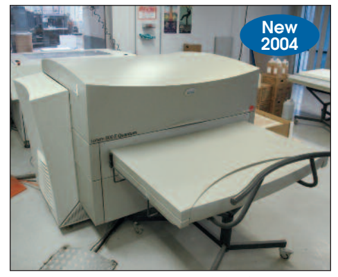
Creo CTP System Model Lotem 800 II Quantum, Square Spot