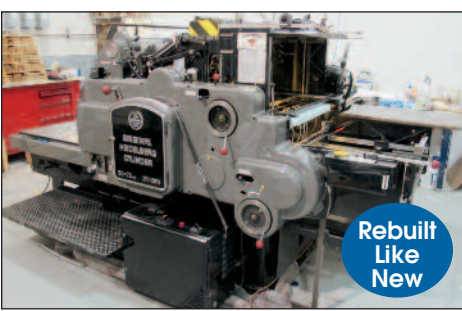
Original Heidelberg Cylinder Press 21 1/4" x 28 3/8"