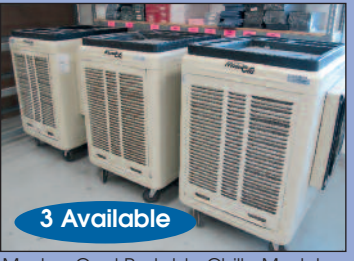
Master Cool Portable ChillerModel MMB14A