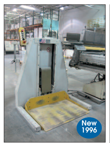
Polar Mohr Paper Lift Model L1000W3