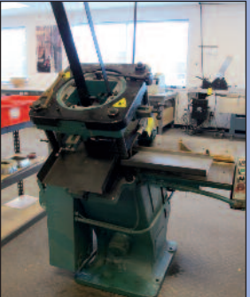
PMC Die Cutter Model F85