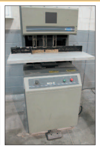
Challenge MS-5 Paper Drill