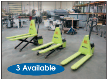
Pramac Lifter High lift Pallet jack (Lifter) Model HX10EL540