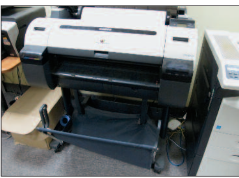
Canon Image Printer Model IPF655