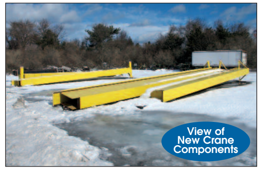
North American Industries Single Girder 10-Ton Bridge Crane