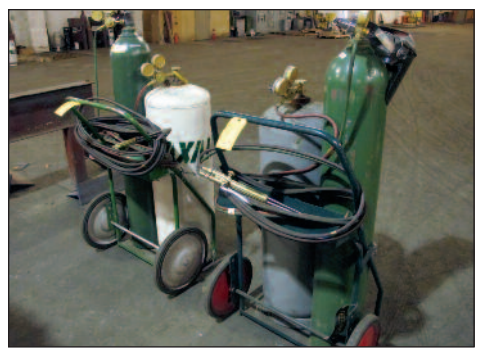
Portable Acetylene Torch Carts