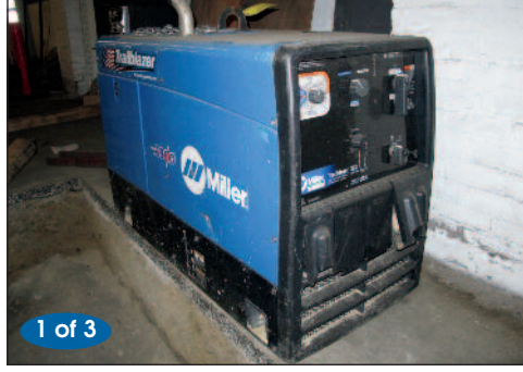
Miller Trailblazer Gasoline Powered Arc Welder