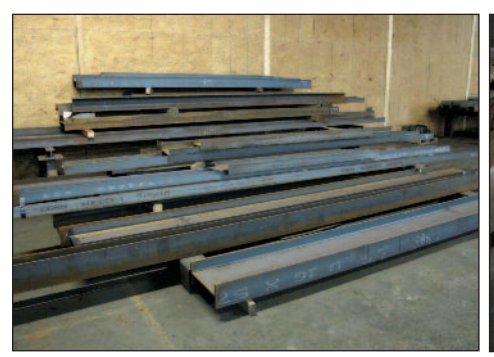
View of Steel Inventory

Terex #TH-844C "Turbo" Telescopic Reach Forklift