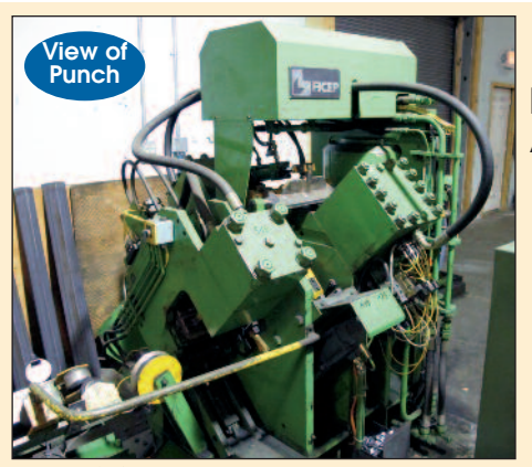
FICEP CNC Hydraulic Angle Punch & Shear Line