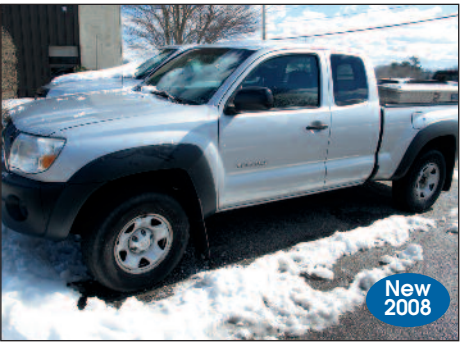
Toyota Tacoma Pickup