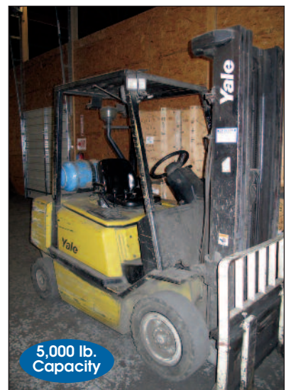
Yale LPG Lift Truck