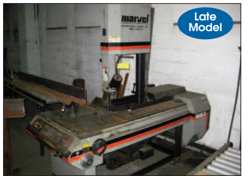
Marvel Vertical Tilt Frame Band Saw Model Series 8 Mark II

FICEP 72 Ton Hyd. Angle/ Punch w/Fagor Control, 6"x 6"x 5/8" Precision Shearing & Punch Capacity, FICEP Hydraulic Feed W/ 32' V Roller Feed Table & Semi-Automatic Beam Loader