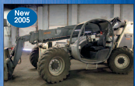
Terex Turbo Telescopic Reach Forklift Model TH844C

Marvel Vertical Tilt Frame Band Saw Model Series 8 Mark II