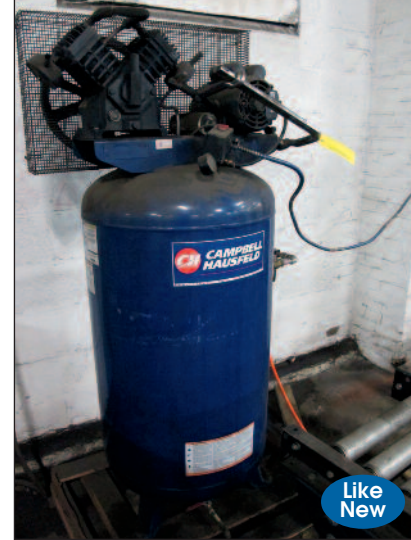
Campbell Hausfeld Vertical Tank Air Compressor Model DP5810-Q