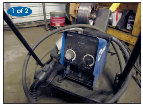
Miller Series 70 Wire Feeder