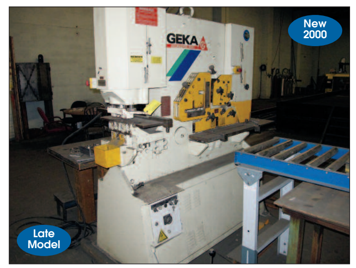
GEKA #110-A Hyd. Ironworker