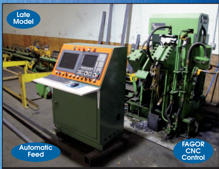
FICEP Hyd. CNC Angle/Punch Line

Peddinghaus Beam Drilling/Cutting/Coping Line