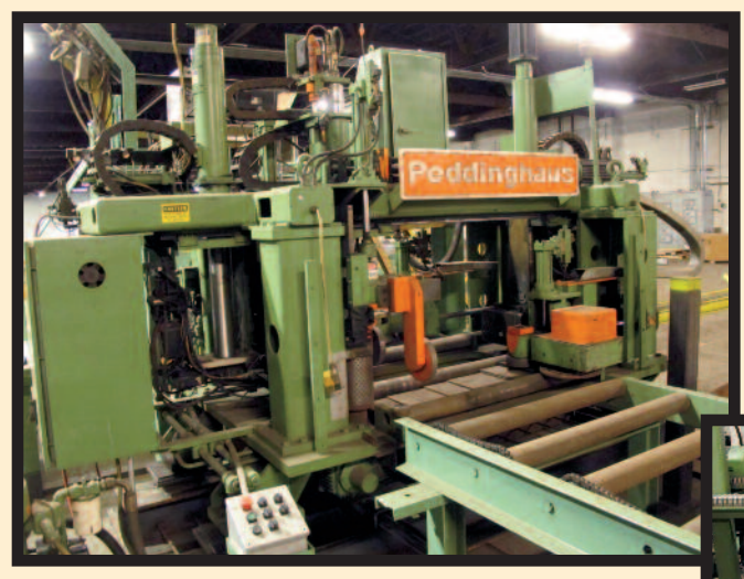
Peddinghaus Beam Drilling/Cutting/Coping Line