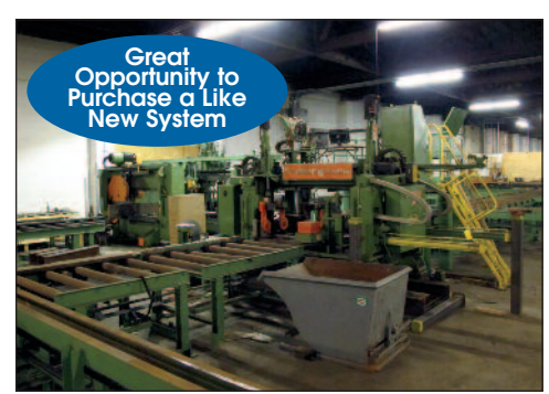
View of Peddinghaus CNC Beam System

Quincy 15 Hp Rotary Screw Air Compressor, Auto-dual Control Campbell Hausfeld Vertical Tank Air Compressor, #DP-5810Q Zeks Heat Sink Dryer #50-HFA, S/N 537553-1 (1) Air Receiving Tank