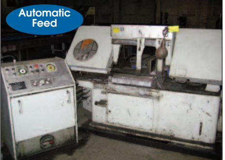
Marvel Hydraulic Horizontal Band Saw, Model 15A4/M1

Nitto Double Acting Hydraulic Punch Model Hss11-1624, 52 Ton, 10,000 PSI