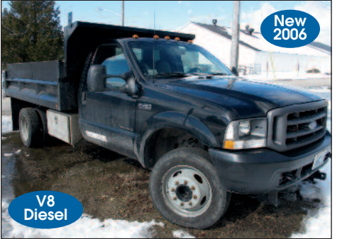
Ford F-450 Dump Body Truck