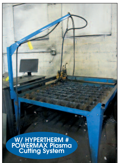
Powermax Plasma Cutting Table