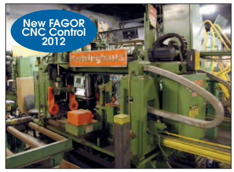
Close up View of Peddinghaus