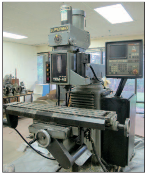
Supermax #YCM-40 CNC Miller