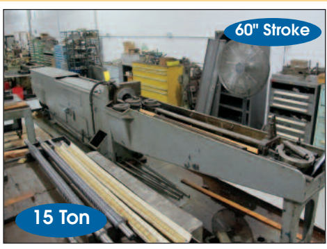
American #H-15-60 Horizontal Broach