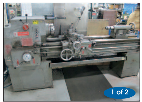
Southbend "Turn-Ado" Engine Lathe