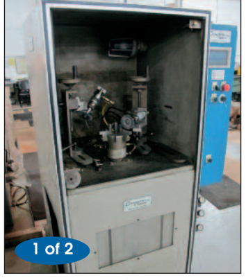
Chamfer-Matic Gear Finisher