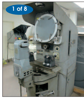
&L Optical Comparator