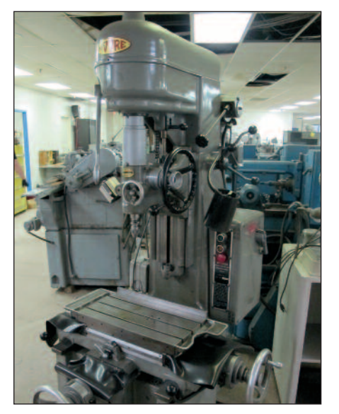
Moore #1 1/2 Jig Borer