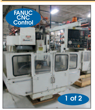
Kitamura #Mycenter-1 CNC Vertical Machining Center