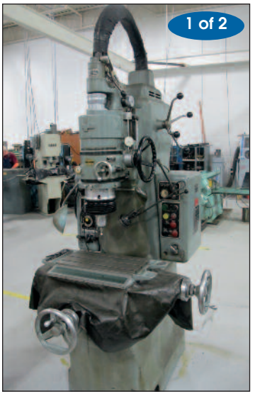
Moore #2 Jig Grinder