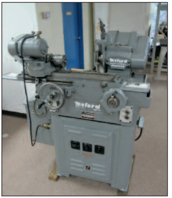
Myford Cylindrical Grinder