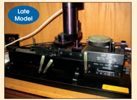
Vari-Roll #F-2 "Computerized" Gear Tester

THIS BROCHURE IS A PARTIAL LISTING. COMPLETE LOT LISTING AT WWW.THOMASAUCTION.COM