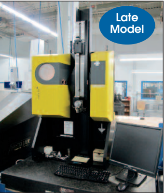
Brown & Sharpe Profile 80 Non-Contact Gaging System