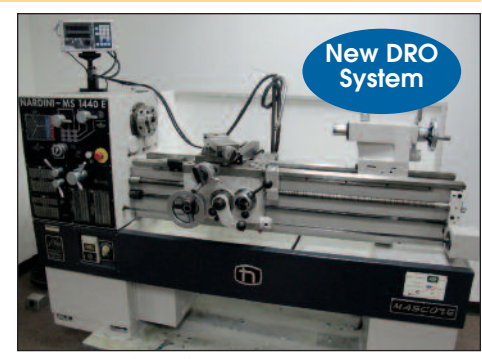
Nardini #MS-1440E Engine Lathe