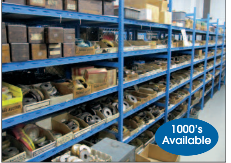
View Of Fellows Cutters & Hobs