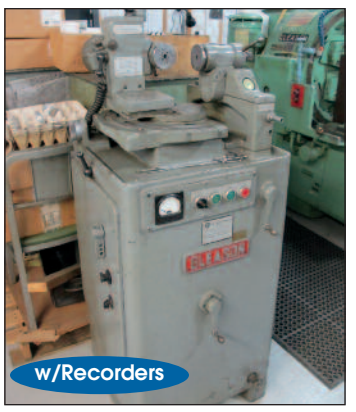
Gleason #104 Angular "Hypoid" Gear Testers