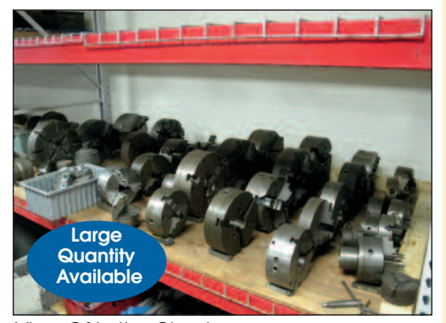
View Of Lathe Chucks