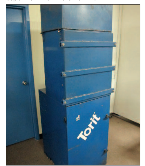
Torit Dust Collector