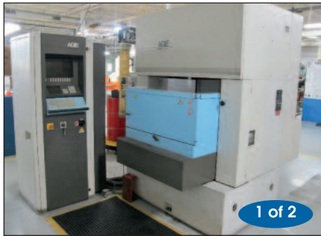
Agie #Agiecut-250 CNC Wire EDM