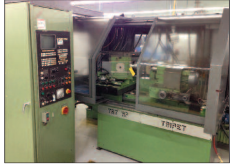
TRIPET #TST-100 CNC I.D. Grinder