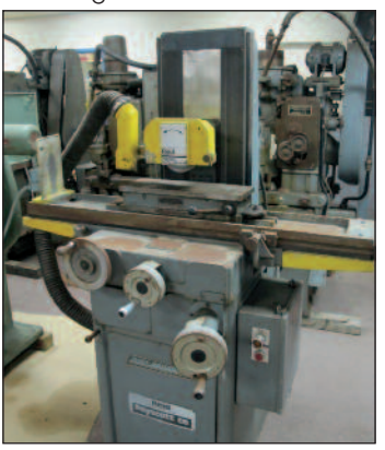
Reid Surface Grinder