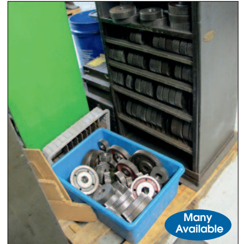
Gleason & Fellows Change Gears