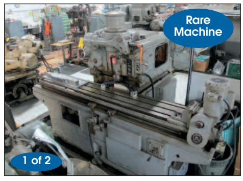
Fellows #3X-60 Rack Shaper