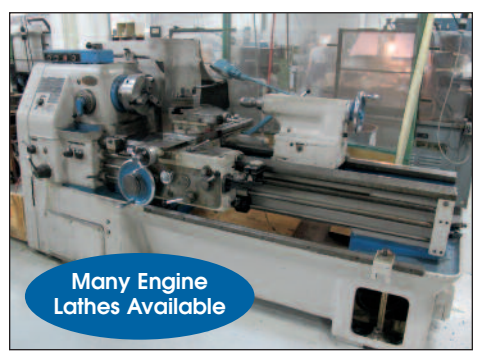
Okuma #LS Engine Lathe