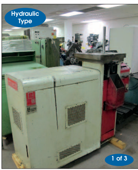
Mitts & Merrill #2HFR-K5 Hyd. Keyseater