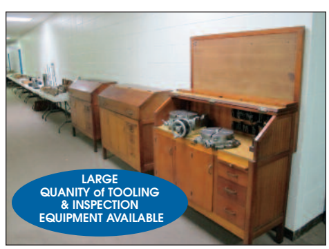
View Of Moore Tool Cabinets