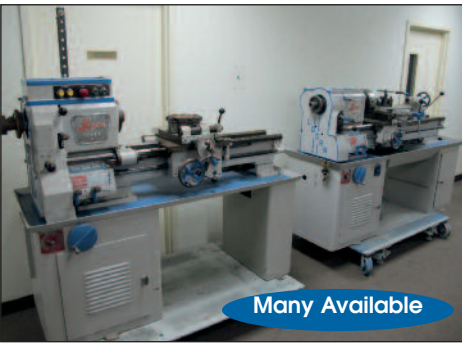
Logan Toolroom Lathes