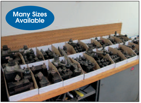
View of Aloris Tool Posts