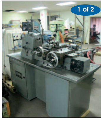
Hardinge #HC Hand Chucker