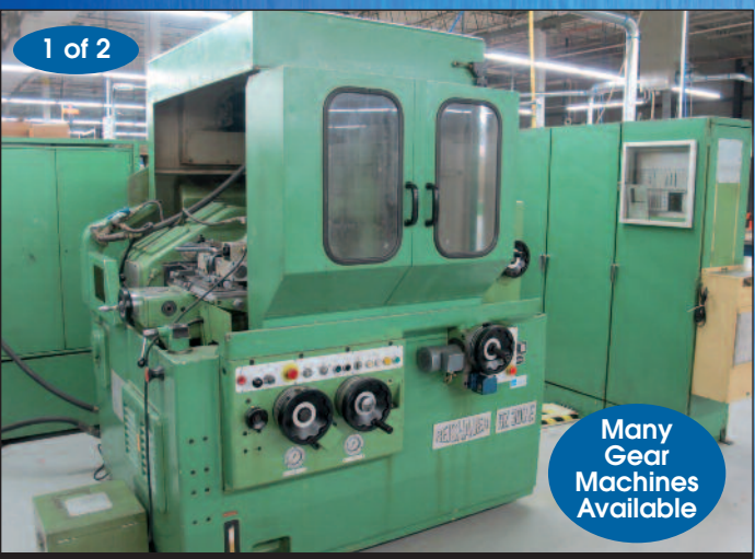
Reishauer #RZ-300E Gear Grinder

120 Industrial Park Road, New Hartford, CT 06057