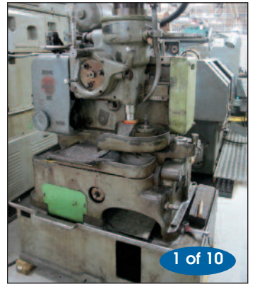
Fellows #7 Gear Shaper