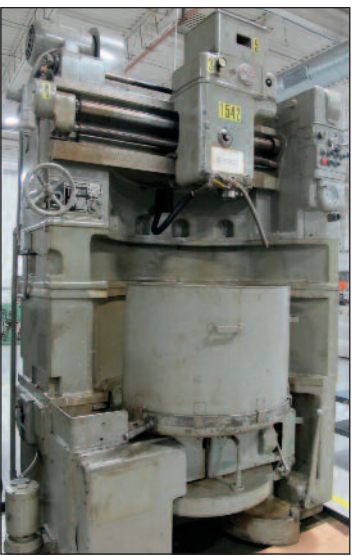
Fellows #36 Gear Shaper