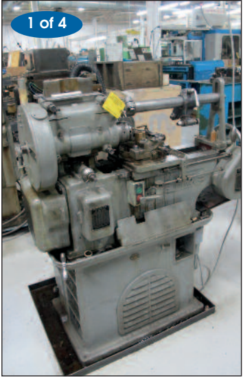
Barber-Coleman #6-10 Gear Hobber