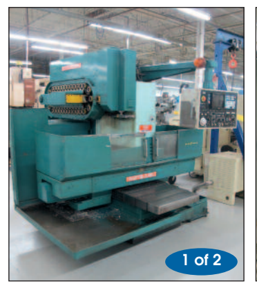
Matsuura #MC-760V CNC Vertical Machining Center