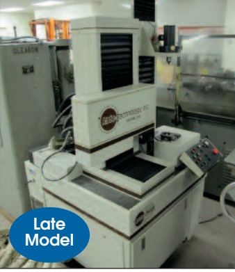
Roto-Technology CNC Gear & Hob Checker