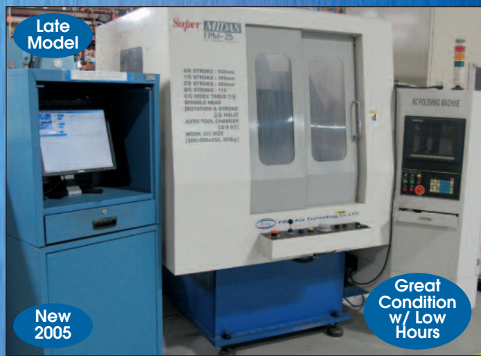
Super Midas #FPM-25 CNC Polishing Machine

SALE DATES: JUNE 10th, 11th & 12th - 11:00 AM (ET) EACH DAY Inspection Day: Monday, June 9th, 9:00 AM - 5:00 PM