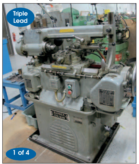
Barber Coleman #6-10 Gear Hobber