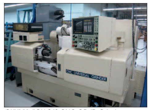
OKUMA #GU-24S CNC OD-ID Grinder