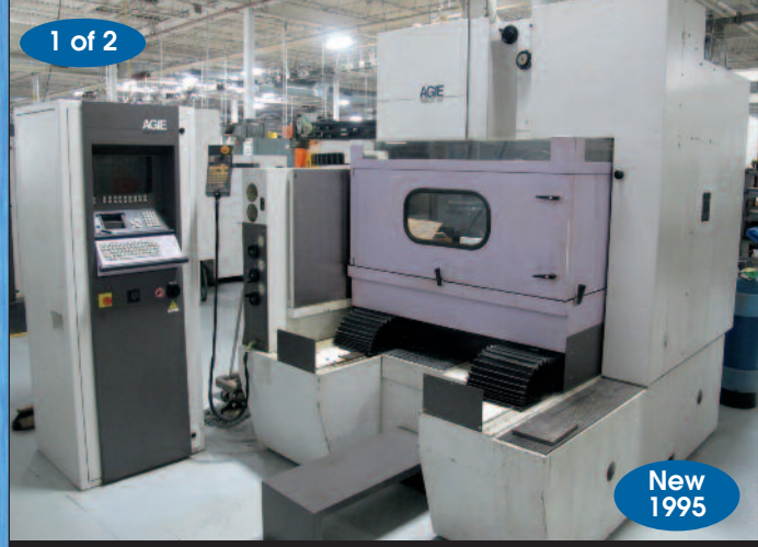
AGIE #AgieCut-320 CNC Wire EDM