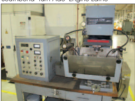
Hansvedt #SM-150B EDM Machine