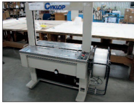
Cyklop Strapping Machine Model BETA-100