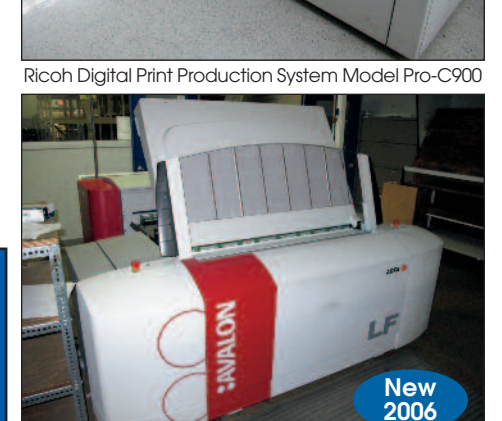
Agfa Avalon LF CTP System