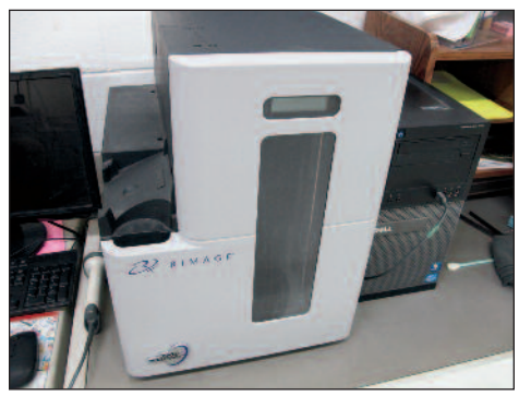
Rimage 3400 Professional CD Duplication System