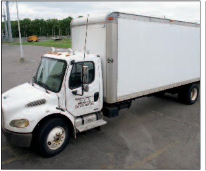
Freightliner Box Truck Model Business Class M2