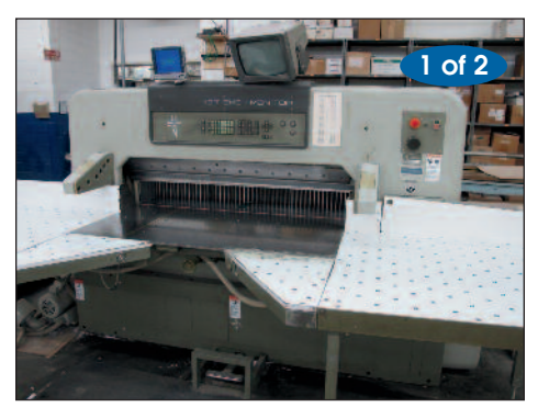
Polar Mohr Paper Cutter Model 137EMC-MON