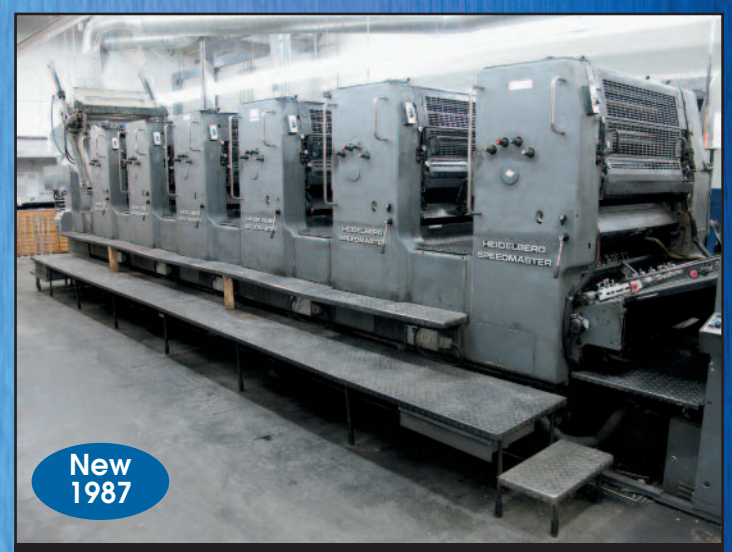
Heidelberg SM-102S Printing Press