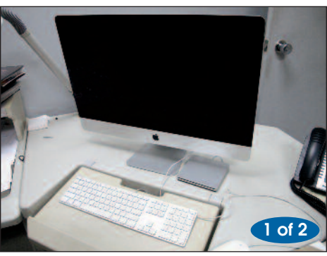
Apple All-In-One Power PC, 26'