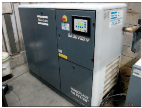
Atlas Copco 40 HP Compressor #GA30VSDFF