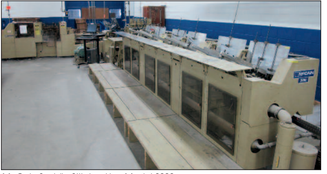
McCain Saddle Stitcher Line Model 2000