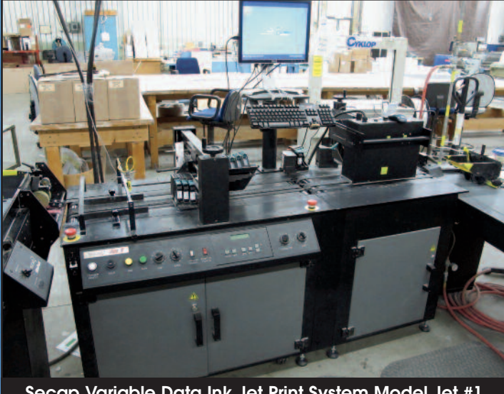
Secap Variable Data Ink Jet Print System Model Jet #1