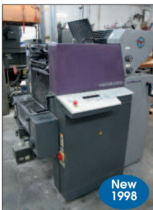
Heidelberg QM-46-2 Printing Press