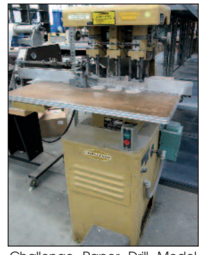
Challenge Paper Drill Model EH3A