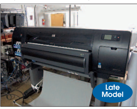
HP Designjet Z6200 Proofer, 2-Sided