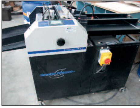
Graphic Wizard Crease Master Plus