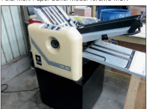
Baum Folder Model 714XLT