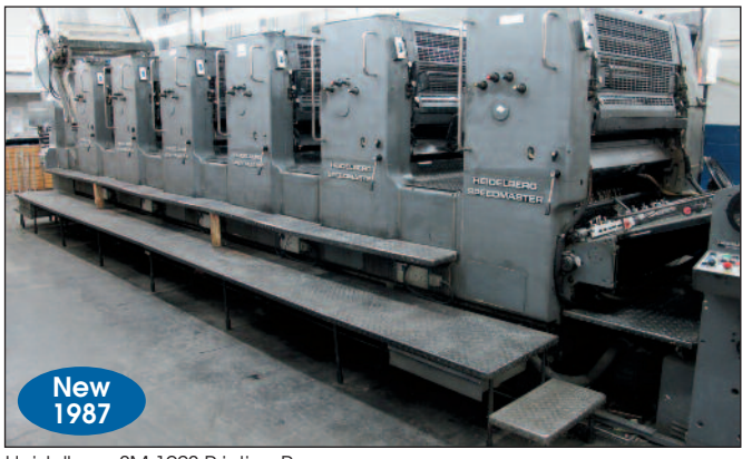
Heidelberg SM-102S Printing Press