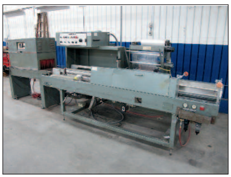
Weldotron L-Seal Packaging Machine Model 9511F