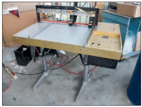
MG Industries Taping Machine, 2-Tape Heads