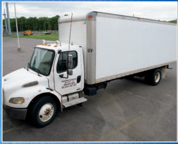
Freightliner Box Truck Model Business Class M2