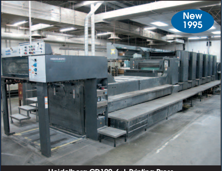
Heidelberg CD102-6+L Printing Press

Auction Date: Thursday, June 26, 1:00 PM (ET) Inspection: Tues & Weds, June 24 & 25, 9 AM to 4 PM