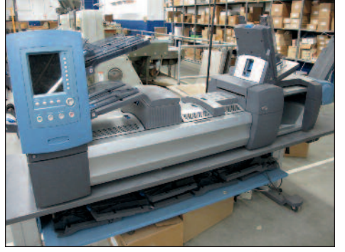
Pitney Bowes Postage Machine Model Connect Plus 1000