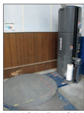
Lantech Rotary Stretch Pallet Wrapper Model Q30084