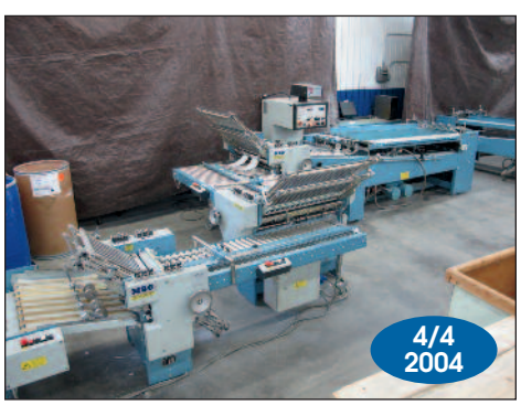
MBO Folder Model B30