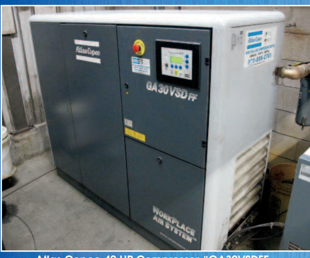
Atlas Copco 40 HP Compressor #GA30VSDFF

400 Cadwell Drive, Springfield, MA 01104 Auction Date: Thursday, June 26, 1:00 PM (ET) Inspection: Tues & Weds, June 24 & 25, 9 AM to 4 PM