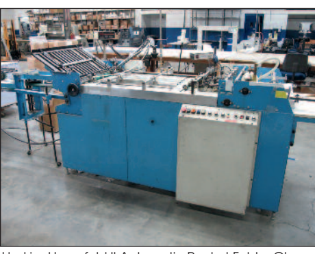
Haskins Hyperfold II Automatic Pocket Folder Gluer