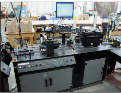
Secap Variable Data Ink Jet Print System Model Jet #1