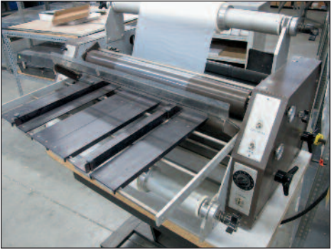
Ledco Heavy Duty 25" Laminator #HD25-707