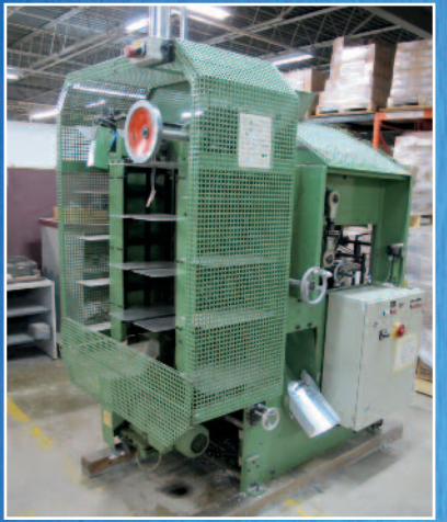
Kugler Automatic Paper Punch 8 ½" x 11"