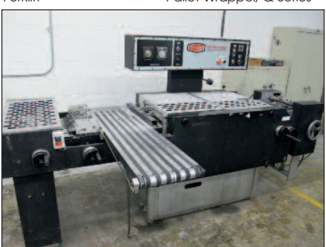
Scott Ten Thousand Automatic Plastic Index Tabbing Machine

Kugler Automatic Paper Punch 8 1/2" x 11"