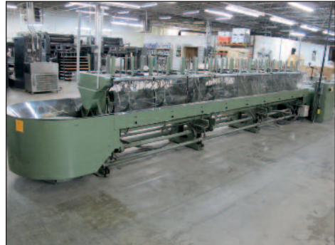
Techgraph Sterling Collator Model S-5965