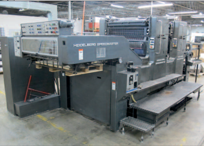
Heidelberg SM102-ZP 2-Color Sheet Fed Printing Press