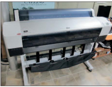
Epson Stylus Pro 9800 Wide Format Proofer