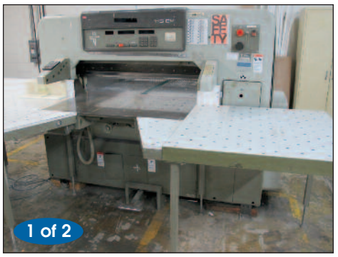
Polar Paper Cutter Model 115EM