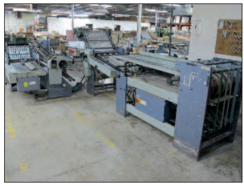
Stahl Folder Model TFU78