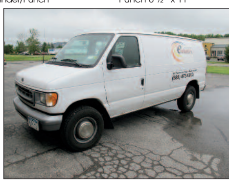
2000 Ford E-250 Cargo Van

HP DesignJet 5000 Wide Format Printer, 42" HP 2500CP Format Inkjet Printer w/ Rampage Shooter