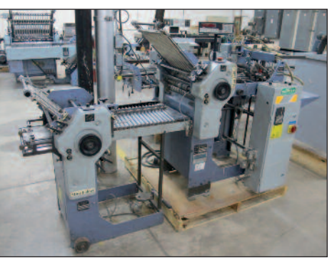
Stahl Mini Folder Model T36