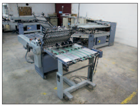
Stahl Folder Model TF66