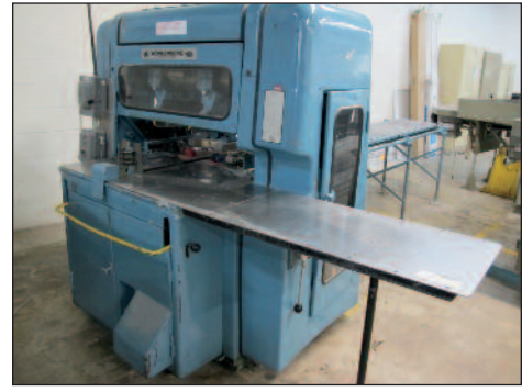
Wohlenberg/Lawsen Rapid Trimmer Model C