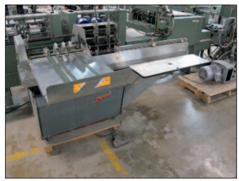
Rosback Automatic Stitcher Model 201-A