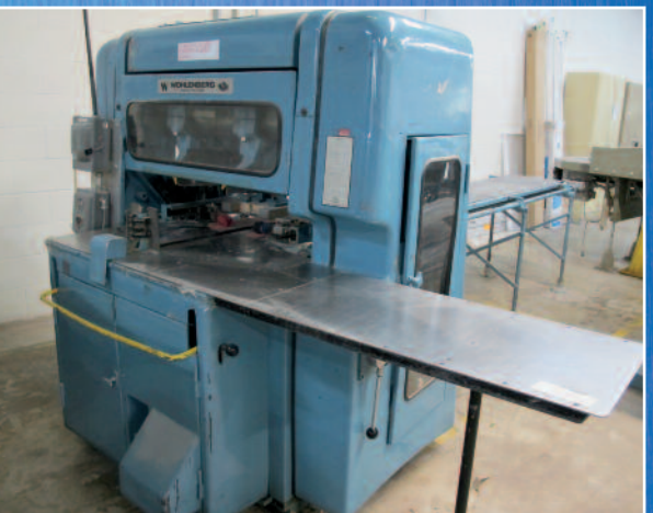
Wohlenberg/Lawsen Rapid Trimmer Model C

AUCTION INFORMATION • WWW.THOMASAUCTION.COM • 203-458-0709