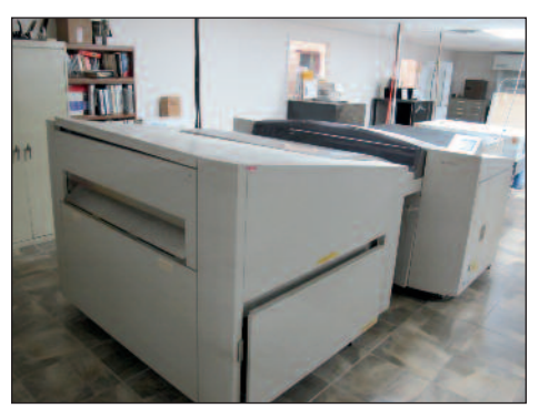
Screen CTP System Model PRT-8000