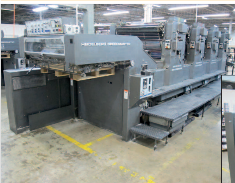
Heidelberg SM102VP 4-Color Sheet Fed Printing Press