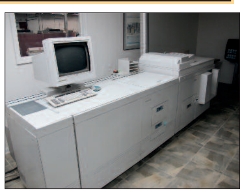
Xerox Docutec135 High Speed Printer

Seal Laminator Model IT400, S/N 400452 w/ Control