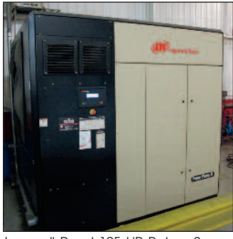
Ingersoll Rand 125 HP Rotary Screw