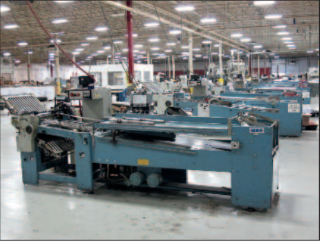
View of MBO Folders