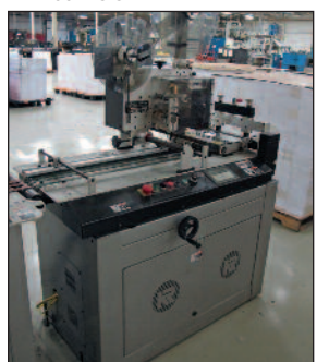
Kirk Rudy #535-CS Tabber