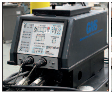
GMS Microglue Hot Melt Glue System Model Lawson Super Duty Paper 14-202