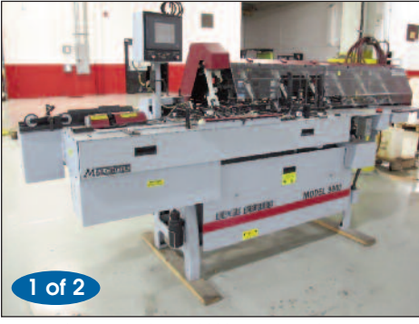
Mailcrafters Edge Series 9800 Inserter, 6-Station