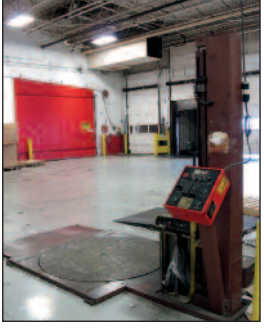
Mima Accu-Stretch Rotary Stretch Wrapper Model FE-LP Air Compressor #IRN125H