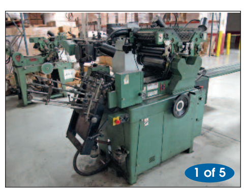
Halm Jet SuperJet JPTWOD-6D