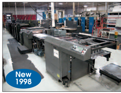
Didde Colortech Web Press 24" Width, 17" Cut Off