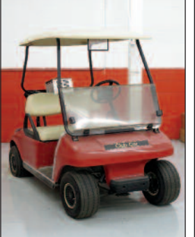
Club Car Electric Golf Cart