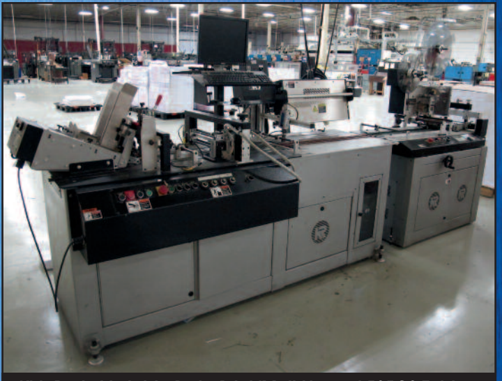
Kirk Rudy Variable Date Print/Mail Line w/ 535CS Tabber