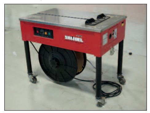
Samuel Semi-Automatic Strapping Machine #P-625