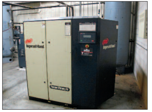
Ingersoll Rand 50 HP Rotary Screw Air Compressor #IRN50H-CC