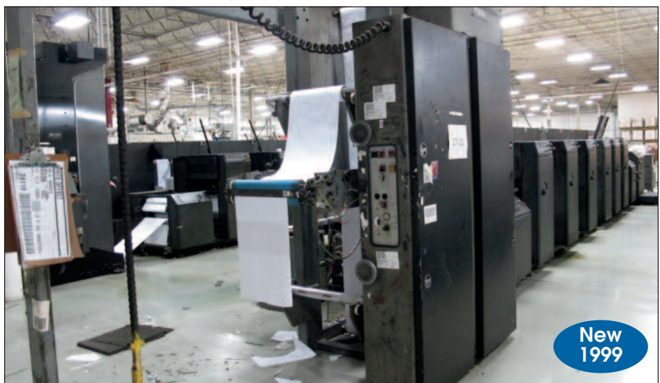
Didde Colortech Web Press 18" Width, 23" Cut Off