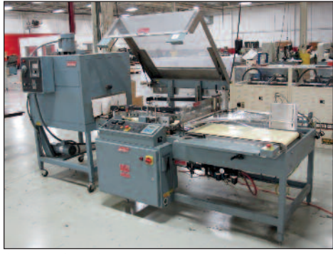
Shanklin #27A L-Seal Packaging Machine w/Heat Tunnel