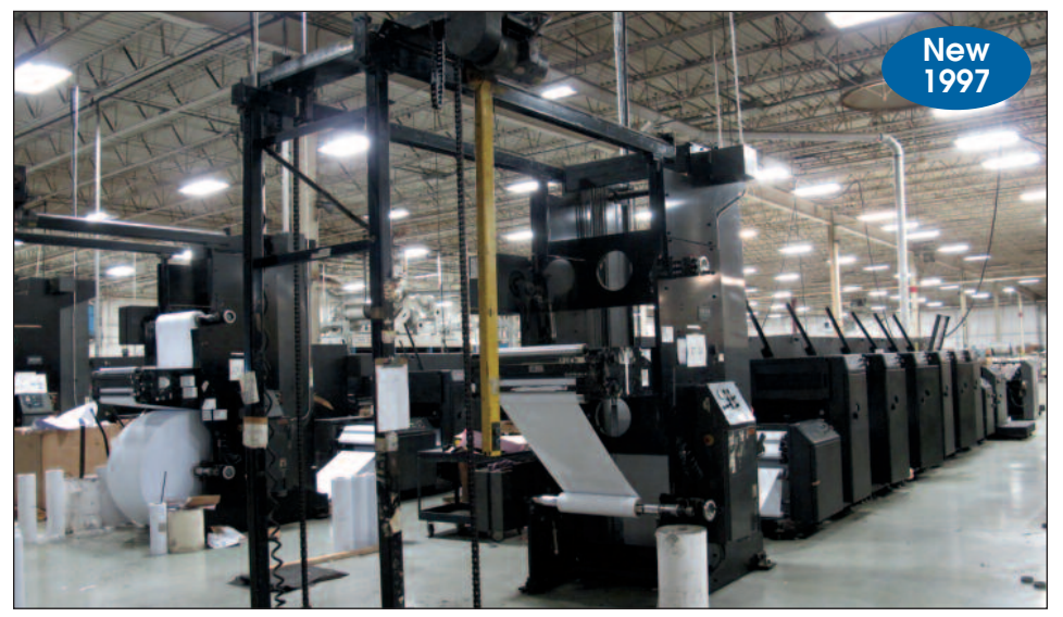
Didde Colortech Web Press 27" Width, 22" Cut Off