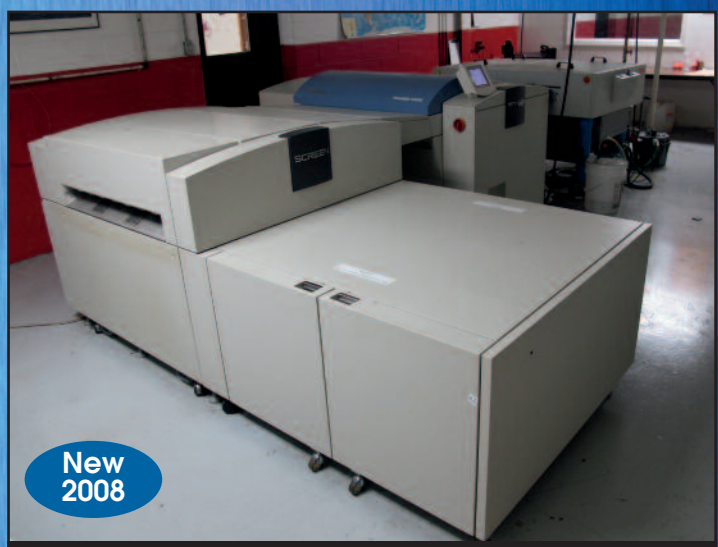
Screen CTP System Model Plate-Rite 4300S