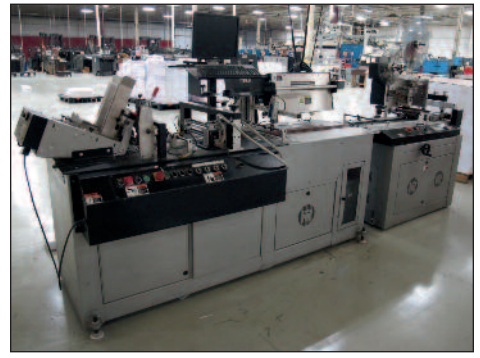
Kirk Rudy Variable Data Print/Mail Line w/ 535CS Tabber