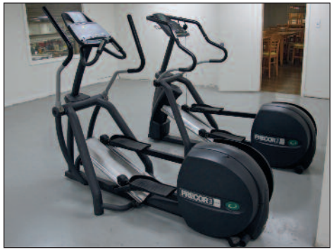
(2) Precor Eliptical Machines Model EFX556