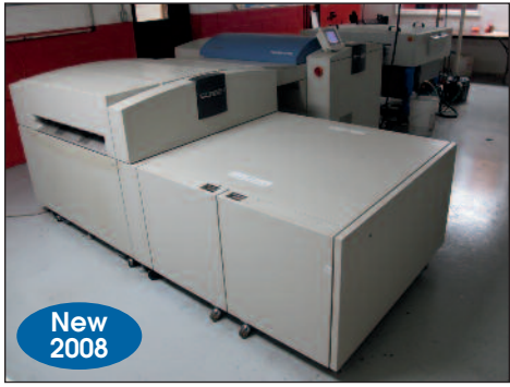
Screen CTP System Model Plate-Rite 4300S