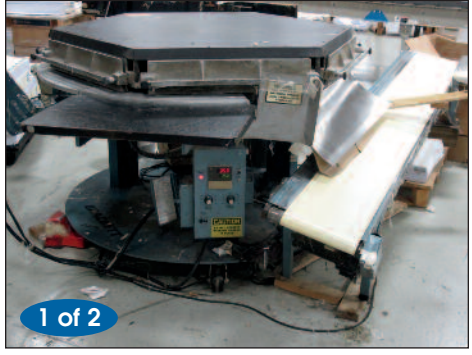
Bracket Padding Machine Model CP