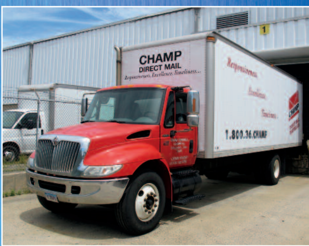
International Box Truck Model 4300 DT 466