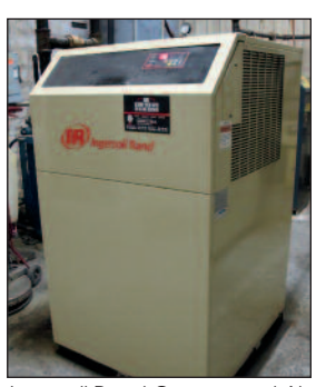
Ingersoll Rand Compressed Air Dryer Model NVC800A400