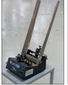
Surefeeder Reliant 1500 Friction Feeder