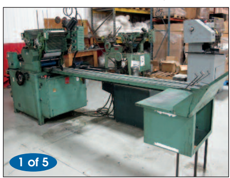
Halm Jet SuperJet JPTWOD-6D