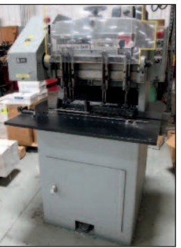
Drill Model B3