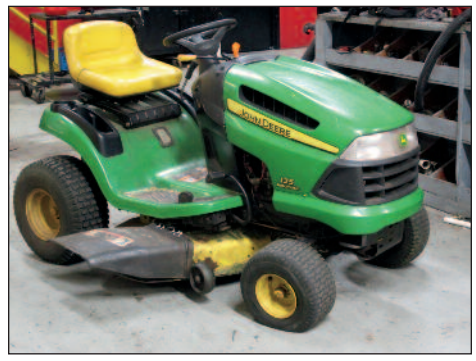
John Deere Riding Lawn Mower Model 125