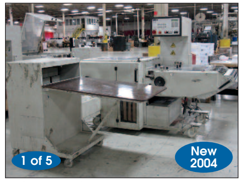
MBO Palamides Stacker Bundler Model BA700