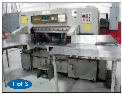
Prism Paper Cutter Model QZK-1150-J