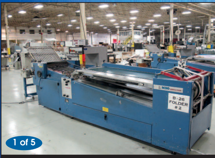
MBO Folder Model B26, S/N W04/53, Dual Feed, Perfection Series