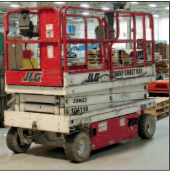
JLG Electric Scissor Lift Model 2046