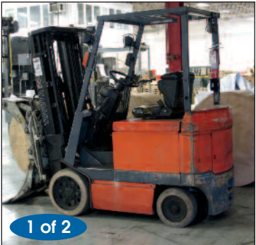
Toyota 4000 lb. Electric Forklift w/Roll Clamp