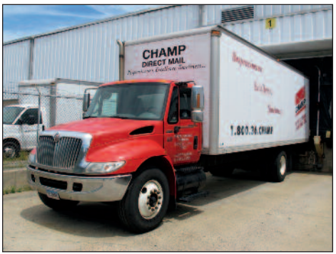
International Box Truck Model 4300 DT 466