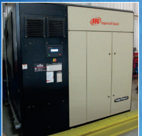
Ingersoll Rand 125 HP Rotary Screw Air Compressor #IRN125H

75 Cascade Boulevard, Milford, CT 06460 Auction Date: Wednesday, July 30, 1:00 PM (ET) Inspection: Tues., July 29, 9 AM to 4 PM