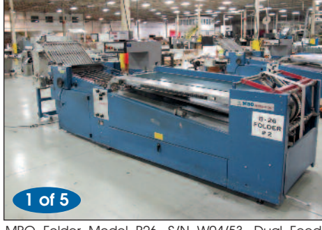
MBO Folder Model B26, S/N W04/53, Dual Feed, Perfection Series