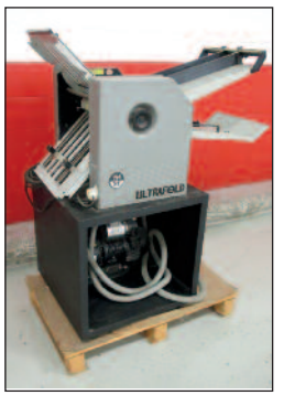
Baum Ultrafold Model 714XE