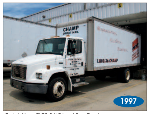
Freightliner FL70 24' Diesel Box Truck