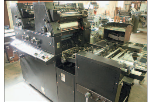
Ryobi 2-Color Sheet Fed Press Model I-Tech 3985