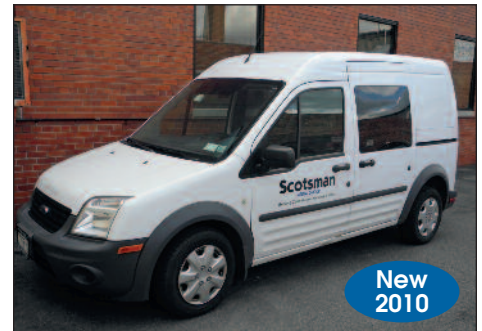
Ford Transit Van