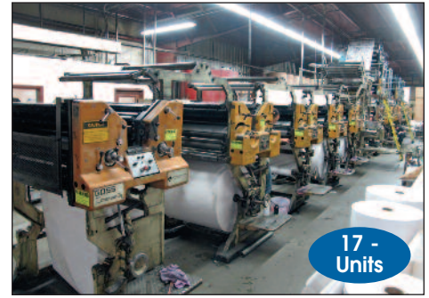
Goss Community Web Press, 35" Web Width, 22-3/4" Cutoff