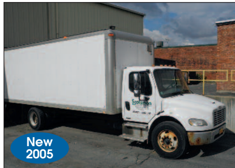
Freightliner Box Truck