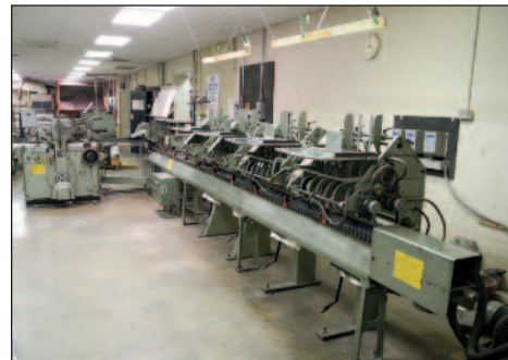
Muller Martini Saddle Stitcher line Model Minuteman