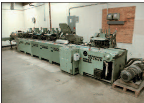
Muller Collator Model 227E