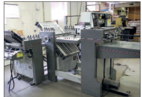
Baum Legend Folder, 4/4