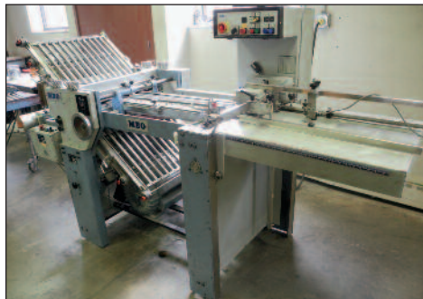
MBO Folder Model T49, 4/4