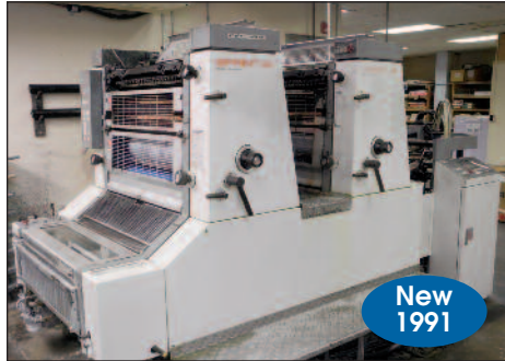
Komori Sprint S-228P Printing Press