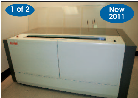
Kodak CTP System Model Trendsetter News, Thermal Platesetter