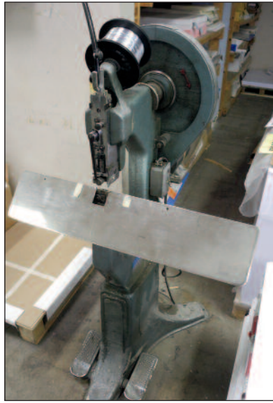
Interlake Wire Stitcher Model A