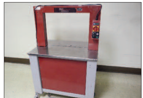
PAC Strapping Machine Model SM65