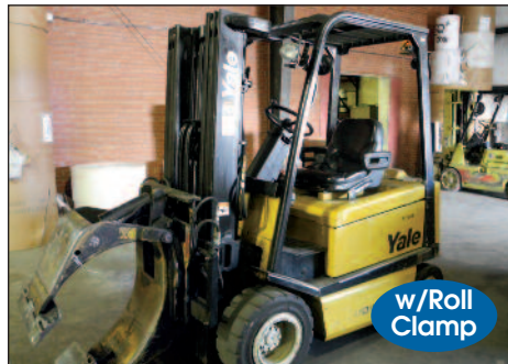
Yale 5000 lb. Electric Forklift Model ERP050