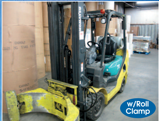
Komatsu 3500 lb. LPG Forklift Model FG25ST-16

AUCTION INFORMATION • WWW.THOMASAUCTION.COM • 203-458-0709