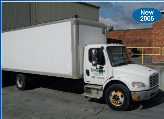
Freightliner Box Truck

Inspection: Tuesday, August 19, 9 AM to 4 PM