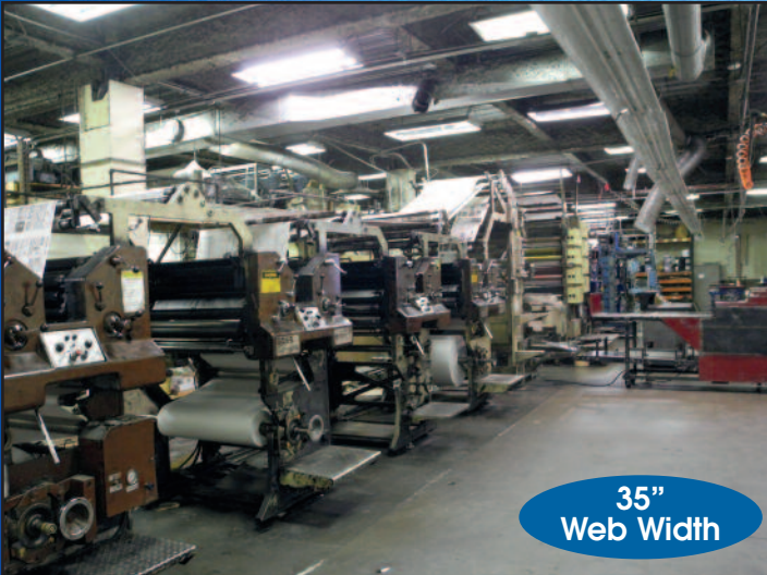
Goss Community Web Press, 35" Web Width, 22-3/4" Cutoff