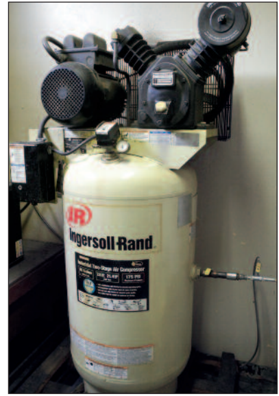
Ingersoll Rand 7.5 HP Vertical Tank Air Compressor