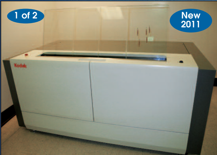
Kodak CTP System Model Trendsetter News, Thermal Platesetter