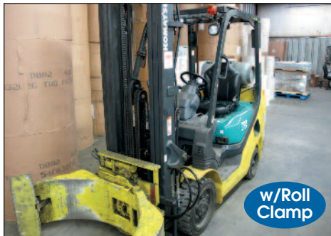
Komatsu 3500 lb. LPG Forklift Model FG25ST-16