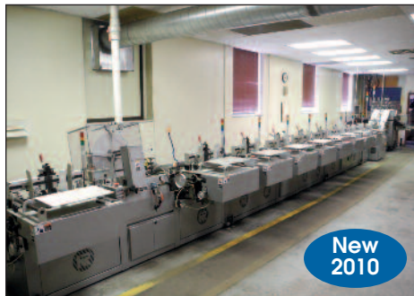
Kirk Rudy Inserter Line Model 600 w/KR950 Stacker