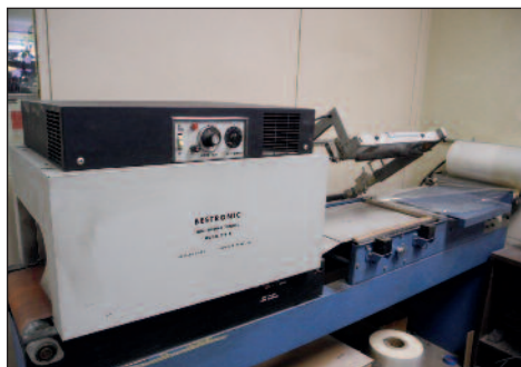
Beseler L-Seal Packing Machine