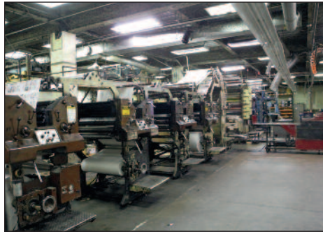
Goss Community Web Press, 35" Web Width, 22-3/4" Cutoff