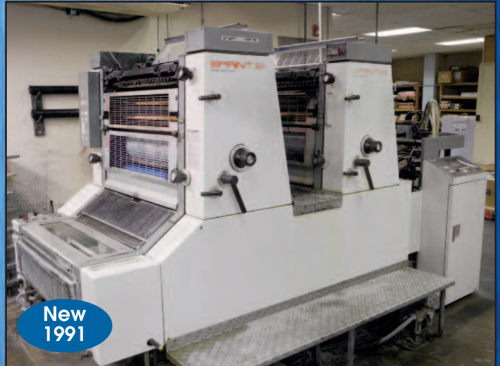
Komori Sprint S-228P Printing Press