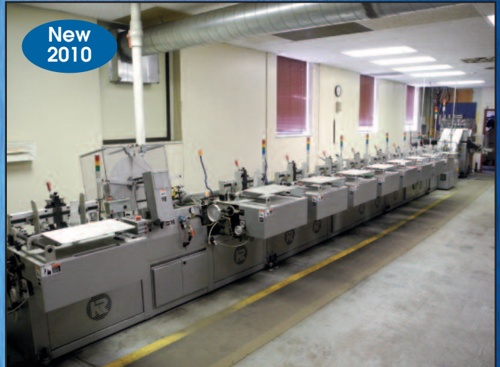
Kirk Rudy Inserter Line Model 600 w/KR950 Stacker