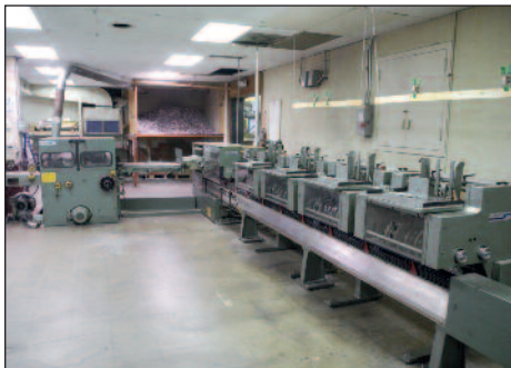
Muller Martini Saddle Stitcher Line Model 321 Fox