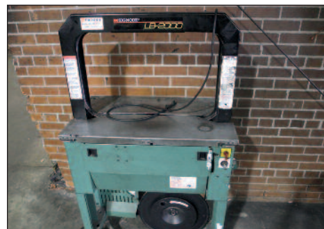
Signode LB2000 Strapper