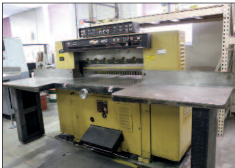
Challenge Paper Cutter Model 420GM