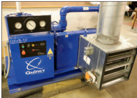
Quincy 10 HP Rotary Screw Air Compressor Model QSVB-10