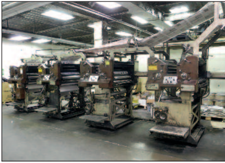
Web Press Co Quad Stack Print Units, 35" Web Width, 22-3/4" Cutoff