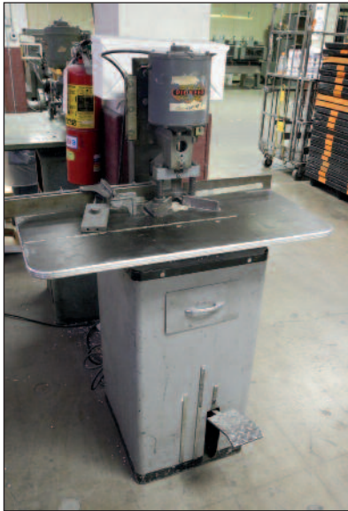
Pioneer Round Corner Machine