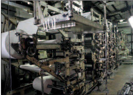
Goss Suburban Web Press, 35" Web Width, 22-3/4" Cutoff