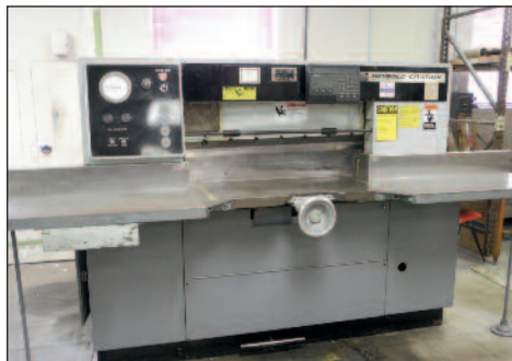
Harris Seybold Paper Cutter