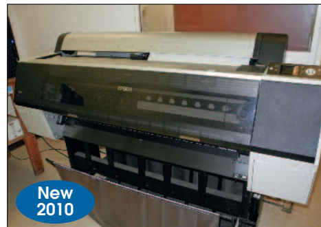
Epson Stylus Pro 9900 Printer Model K126A