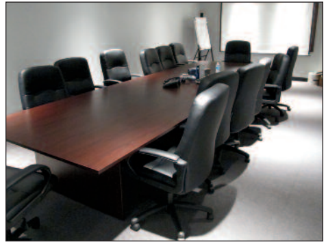
EXECUTIVE CONFERENCE ROOM

THIS BROCHURE IS A PARTIAL LISTING – COMPLETE LOT CATALOG & BIDDING AT WWW.THOMASAUCTION.COM