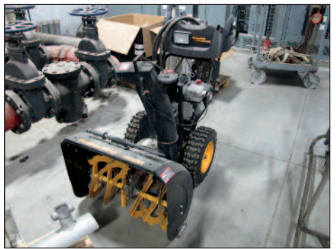
POULAN PRO GAS POWERED SNOW BLOWER