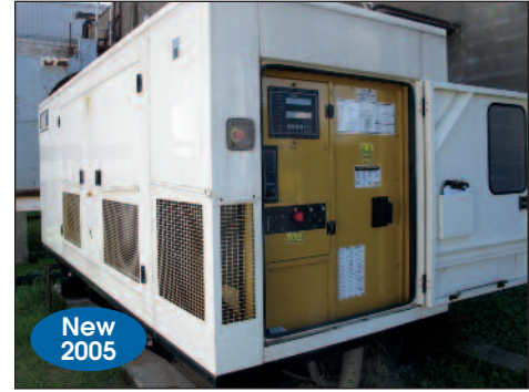
CATERPILLAR 500 KVA PRIME BACKUP GENERATOR