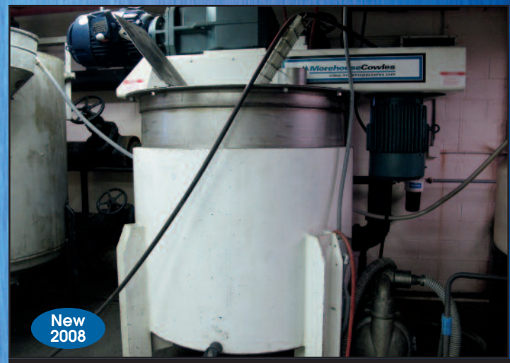
Morehouse Cowles Dissolver Model 2TV2045

Auction Date: Wednesday, November 12, 10:30 AM (ET) Inspection: Tuesday, November 11, 9 AM to 4 PM (ET)