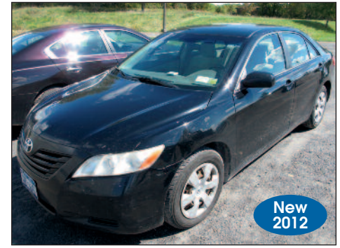
FORD TAURUS SEL