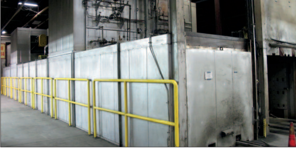
CUSTOM DESIGNED & FABRICATED 9-BURNER REFRACTORY MELTING FURNACE, 2,800°F TEMP