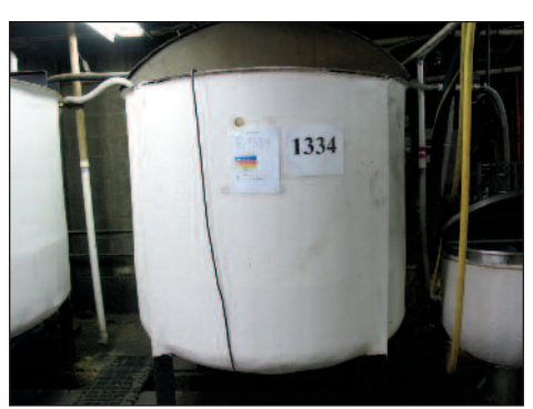
500 GALLON STAINLESS STEEL/JACKETED MIXING TANK