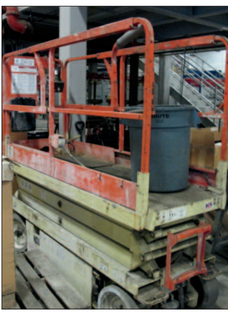
JLG ELECTRIC SCISSOR LIFT