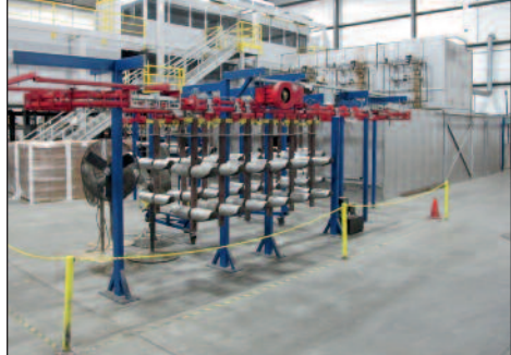
OVEN/DRYING CONVEYOR SYSTEM, 3-LANE OVEN, 230-280 DEG F TEMP