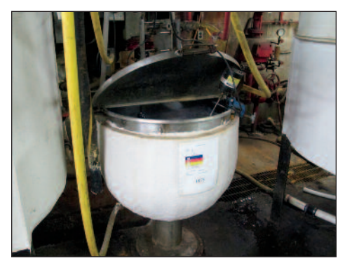
250 GALLON STAINLESS STEEL/JACKETED MIXING TANK