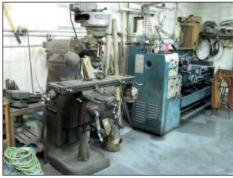
BRIDGEPORT MILL & ENCO LATHE