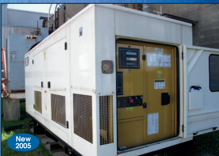
Caterpillar 500 KVA Prime Backup Generator