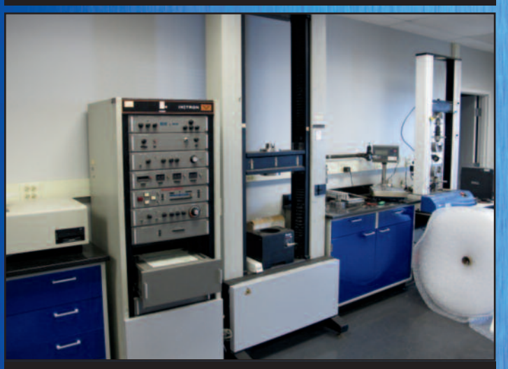
Instron Load Cell Tensile Tester Model 1125