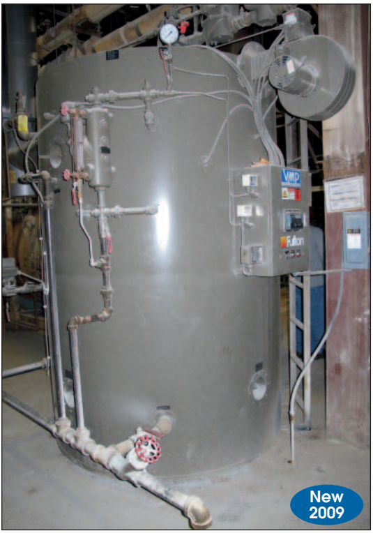
FULTON FUEL FIRED STEAM BOILER MODEL VMP100