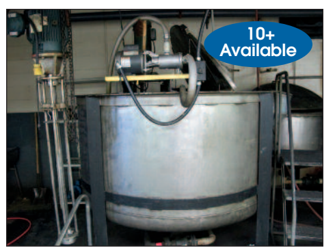
300 GALLON STAINLESS STEEL MIXING TANK W/NEPTUNE MIXER