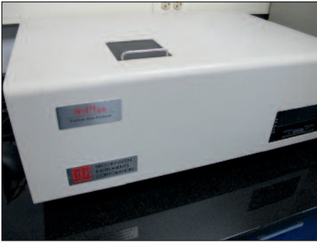
BROOKHAVEN 90+ PARTICLE ANALYZER