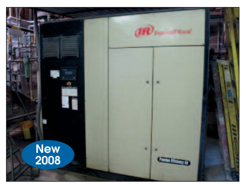
INGERSOLL RAND 200 HP ROTARY SCREW AIR COMPRESSOR MODEL IRN200H-2S