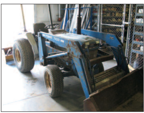
FORD 7108 TRACTOR