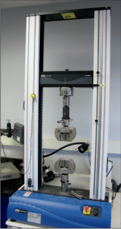
INSTRON LOAD CELL TENSILE TESTER MODEL 3369