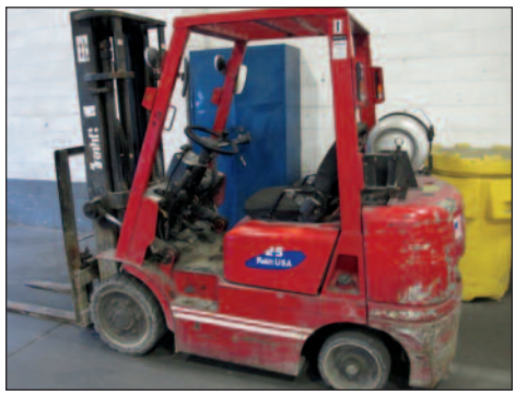
TAILLIFT 5,000 LB LPG FORKLIFT MODEL 5G25C