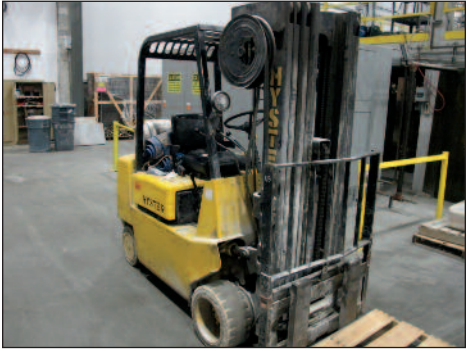
HYSTER 5,000 LB FORKLIFT MODEL S50XL