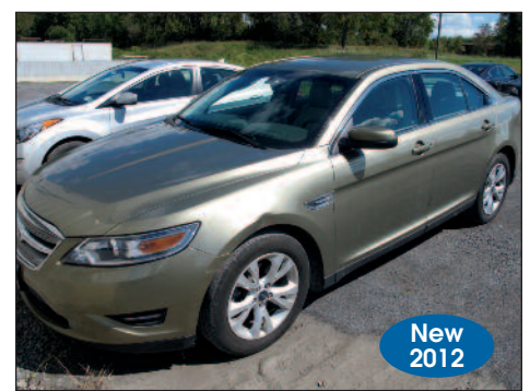
FORD TAURUS SEL