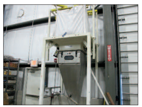
SPIRO-FLOW SURGE BIN FEED HOPPER