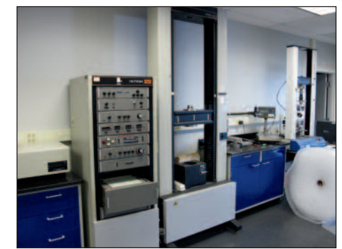
INSTRON LOAD CELL TENSILE TESTER MODEL 1125