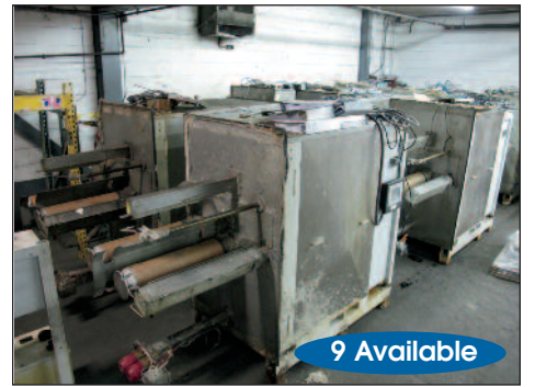
VIEW OF DIETZE & SCHELL DIRECT ROVING WINDERS