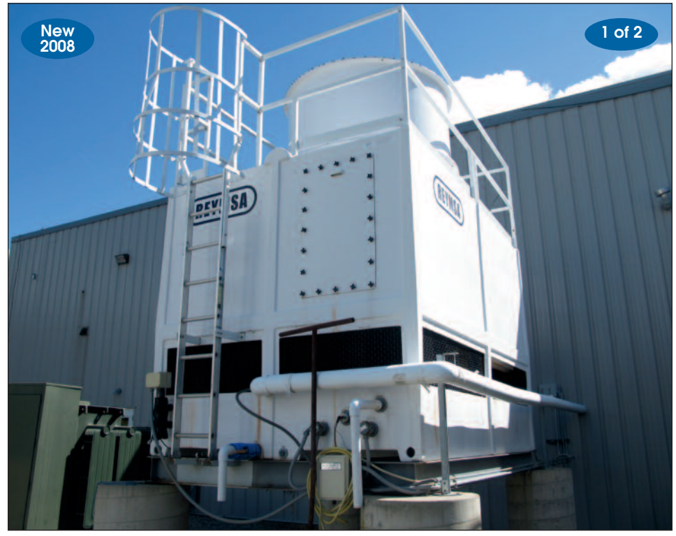
REYMSA MODEL HRFG812120, 1-FAN 20-HP COOLING TOWER