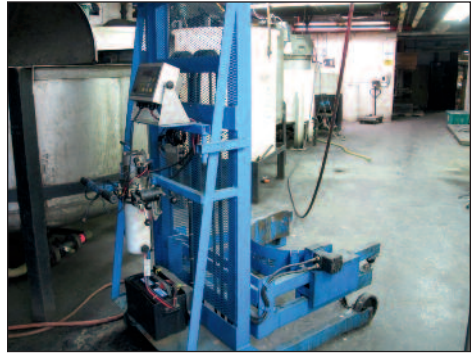
MORSE ELECTRIC WALK BEHIND BARREL CART

Large Quantity of Scrap Material: Steel Beams, Steel Coil, Wire, etc.