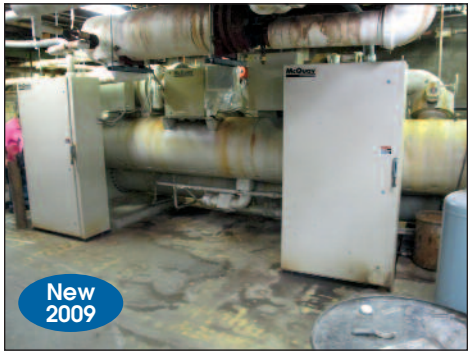
MCQUAY CHILLING SYSTEM MODEL WDC063MA