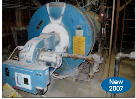
YORK SHIPLEY GENERATOR/BOILER MODEL 560-SPH-175X-S150-N