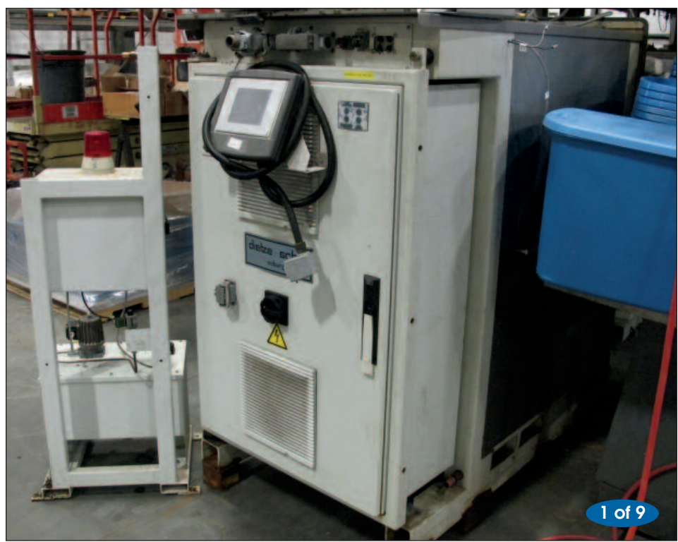
DIETZE & SCHELL DS360/2-2 DIRECT ROVING WINDER