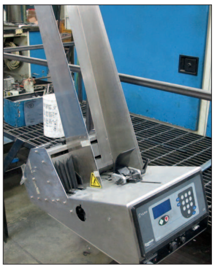
SUREFEEDER ST1250 FRICTION FEEDER