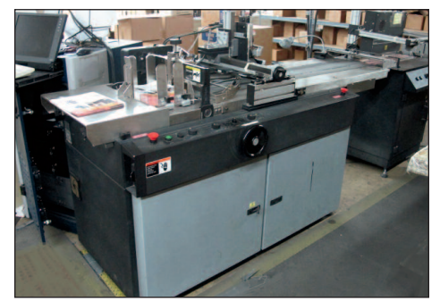
VIDEO JET 7000 VARIABLE DATA PRINT SYSTEM