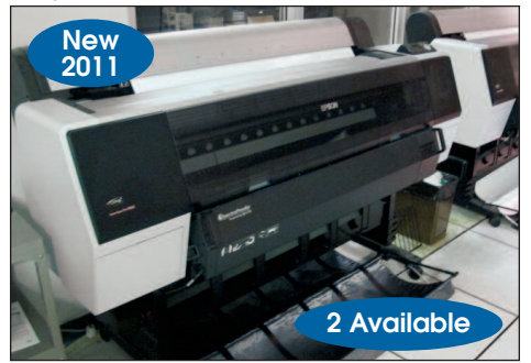
EPSON STYLUS PRO 9890 44" WIDE DIGITAL INKJET PROOFER