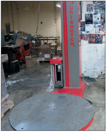
UNISOURCE ROTARY STRETCH PALLET WRAPPER