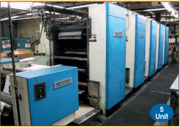
HARRIS M100L WEB PERFECTING PRESS, 26.5" X 23'

THIS BROCHURE IS A PARTIAL LISTING. COMPLETE LOT CATALOG & PHOTOS AT WWW.THOMASAUCTION.COM