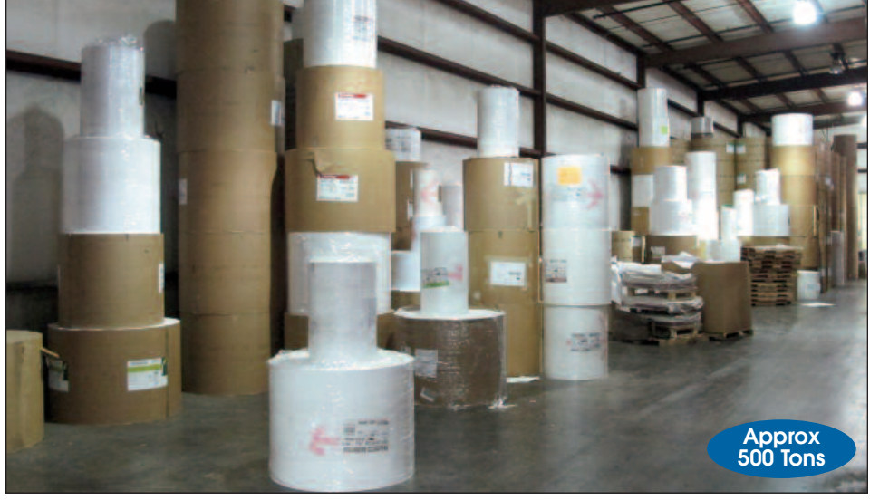
VIEW OF PAPER INVENTORY

Office Furniture & Equipment: Executive Office Suits, Conference Room, Receptionist Area, Desktop Computers & Printers, Office Machines etc.