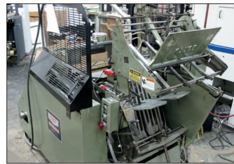
KLUGE EHD 14" X 22" DIE CUTTER