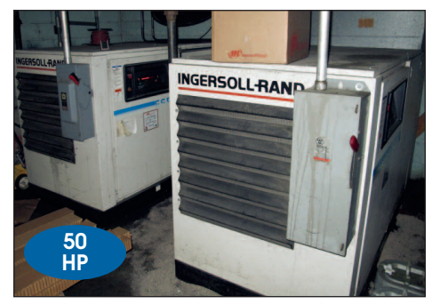
(2) INGERSOLL RAND SSR XFE50 AIR COMPRESSORS