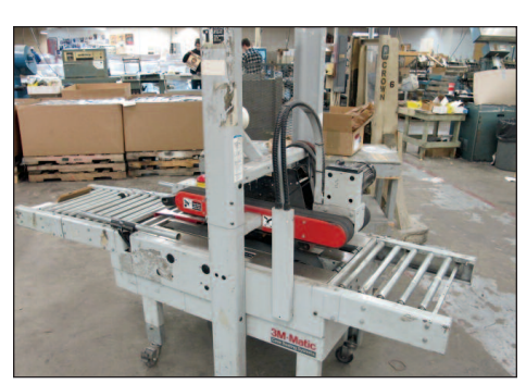
3M AUTOMATIC CASE SEALER