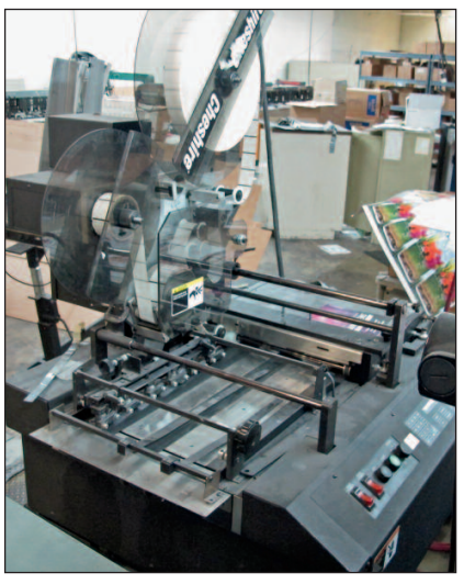
CHESHIRE 2" TLS TABBER