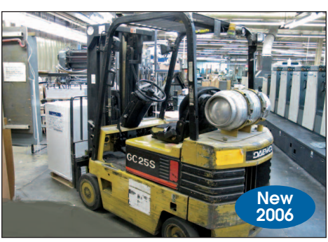
DAEWOO 5,000 LB LPG FORKLIFT TRUCK MODEL GC25S-2