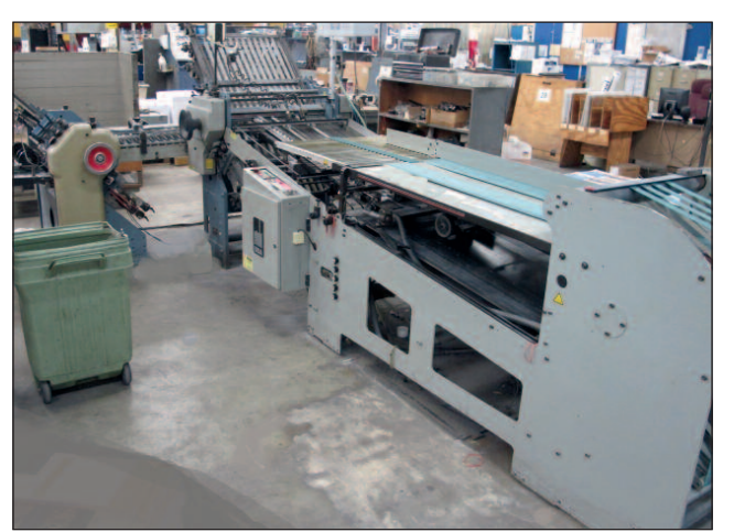
STAHL TF66 26" X 40" 32-PAGE CONTINUOUS FEED FOLDER