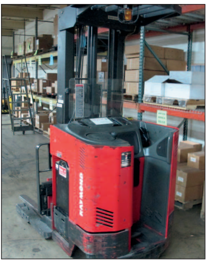
RAYMOND 3,000 LB ELECTRIC REACH TRUCK MODEL EASI