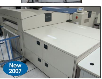
SCREEN PLATERITE 8600S DIGITAL PLATESETTER CTP SYSTEM