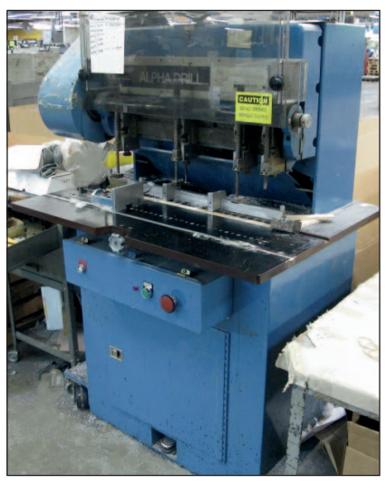
ALPHA 5-SPINDLE HYDRAULIC PAPER DRILL