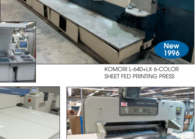
POLAR MOHR 155-EML-MON PAPER CUTTER S/N 5821231