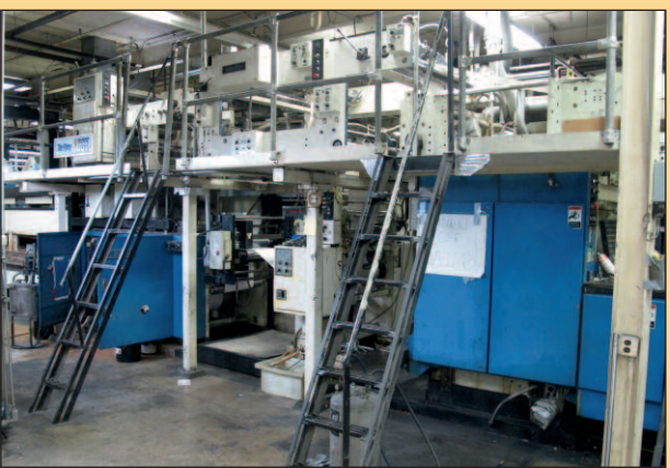
VIEW OF M300M FOLDER SECTION