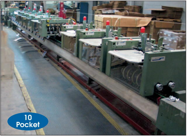
MULLER MARTINI 335 FOX SADDLE STITCHER