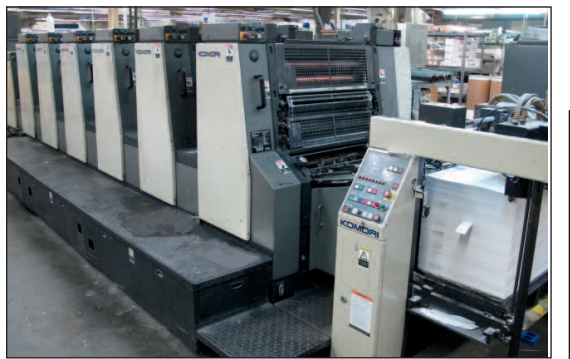
KOMORI L628 6-COLOR SHEET FED PRINTING PRESS

Heidelberg SM102VP, 28" x 40" 4-Color Sheet Fed Perfecting Printing Press, S/N 513748 (New 1980) w/ Remote Inkjet Fountain Console Control, 226,844,000 Impressions (2 Over 2 Perfector), Conventional Dampening