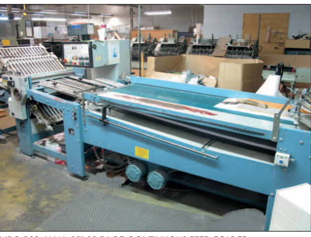
MBO B30 4/4/4, 30" 32-PAGE CONTINUOUS FEED FOLDER