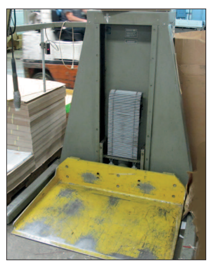
POLAR MOHR MODEL L-1000-W-6 PAPER LIFT