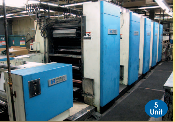
HARRIS M100L WEB PERFECTING PRESS, 26.5" X 23'