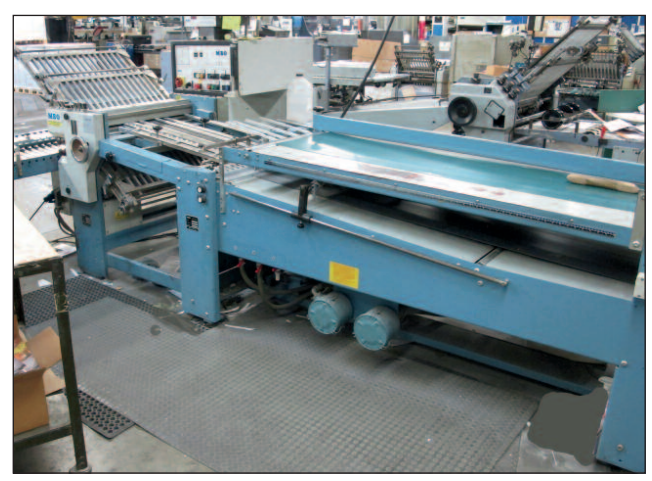
MBO B30 4/4/2, 30" 16-PAGE CONTINUOUS FEED FOLDER