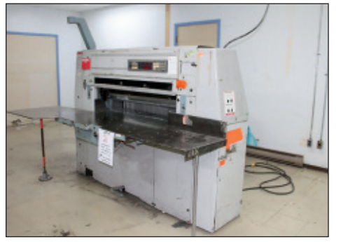
Polar Mohr Paper Cutter Model 115CE