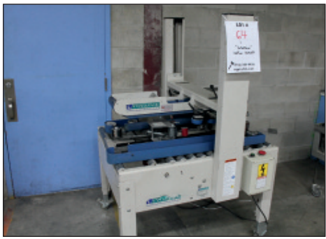
Interpack Case Sealer