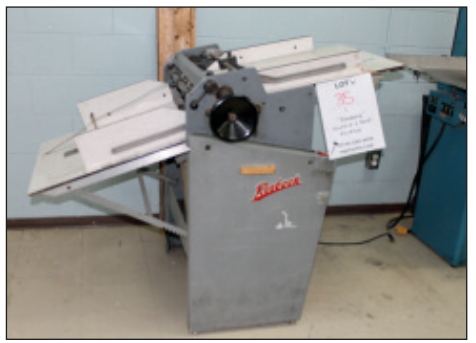
Rosback Scoring & Perf Machine