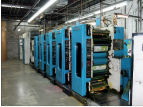
Harris 8 Page Heatset Web Press Model M-80