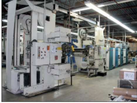
Harris 32 Page Web Book Press Model M110