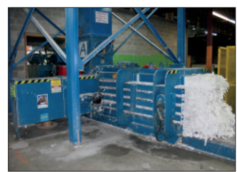
Balemaster Horizontal Baler Model 413008