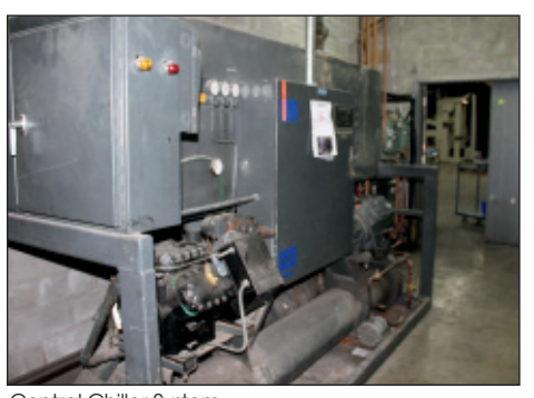
Central Chiller System