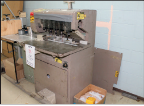
Lawson 5-Spindle Hydraulic Power Paper Drill