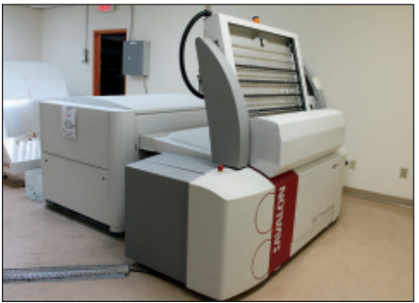
Agfa Avalon SF CTP System