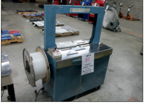
Gerrard Strapping Machine Model 415