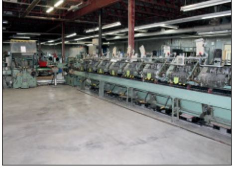
Muller Martini Saddle Stitcher Line Model 235