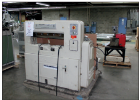
Polar Mohr Cutter Model 72CS