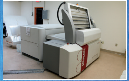
Agfa Avalon SF CTP System

TUESDAY, MARCH 17, 9 AM TO 4 PM OR BY APPOINTMENT