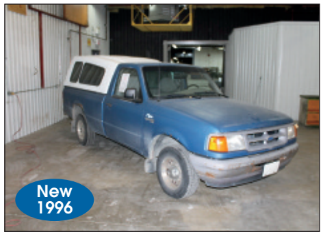
Ford Ranger XL Pick Up Truck