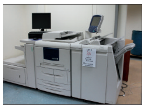
Xerox 4112 Copier