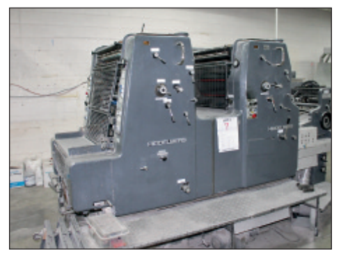
Heidelberg 2-Color Perfecting Sheet Fed Press Model MOZP