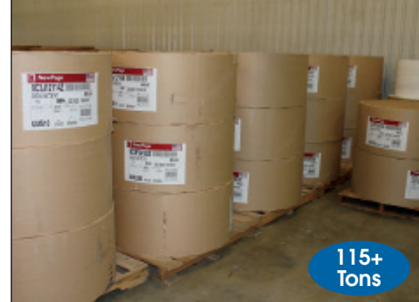
View of Roll Paper Inventory