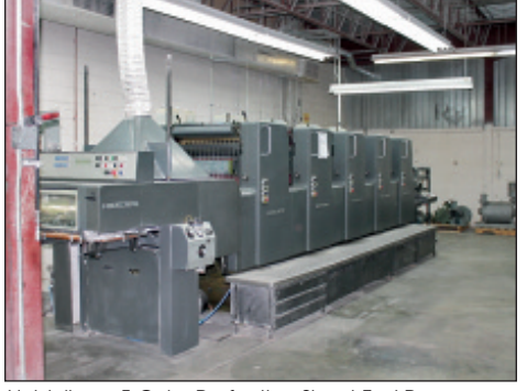
Heidelberg 5-Color Perfecting Sheet Fed Press Model MOFP-H