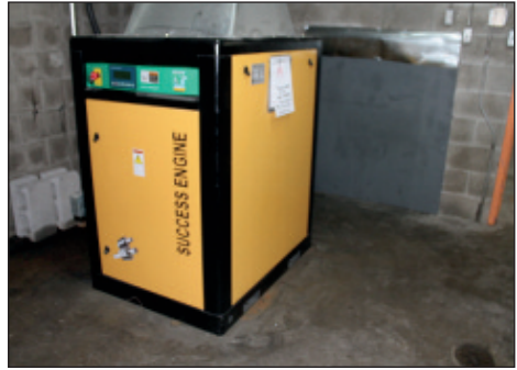
Success Engine 30 HP Air Compressor Rotary Screw