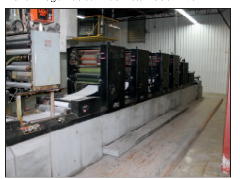
Didde Business Form Web Press Model DG-860