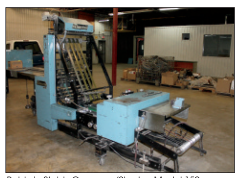
Baldwin Stobb Conveyor/Stacker Model 150