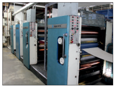
Harris 32 Page Web Book Press Model M120