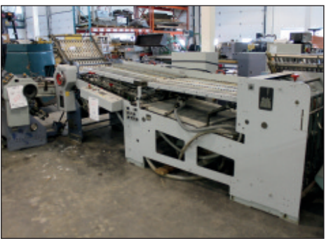
Stahl T56 Folder