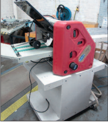
Challenge Folder # Medalist 870