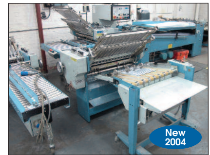
MBO Folder Model B26