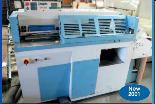
Duplo Perfect Binder Model MR 500