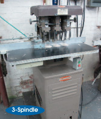
Challenge Paper Drill Model EH-3A

Transformer - Komori Series A, Part #K480225-MOD.5, V22064KA, Class AA, 3-Phase Transformer, 60 HZ, S/N J00D1574, Pri Volts 480 Delta, Sec Volts 220Y/127, 225 KVA Transformer - Hammond Power Solutions, Part #NMK075BK, 480Y/277V, 75 KVA