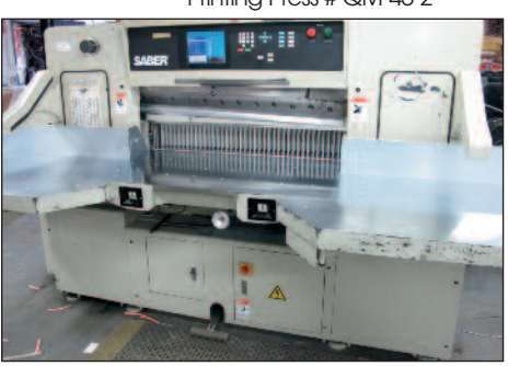
Saber 42" Paper Cutter Model S-115

Olec UV Coating System Model DMC19-C-10111, S/N 6593-0108 (New 2008) w/ Olec DMC Series Feeder & Stacker