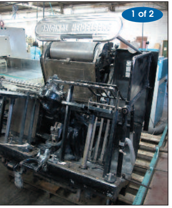
Original Heidelberg Windmill Presses