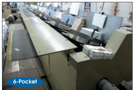
McCain 1800 Saddle Stitcher Line