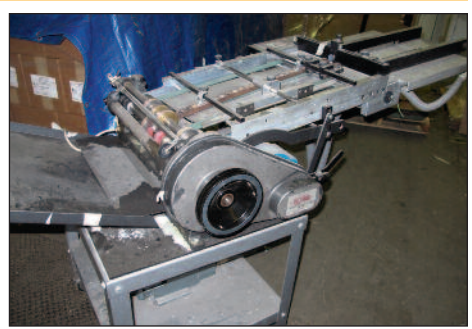
Rollem Scoring & Perforating Machine Model Champion 990