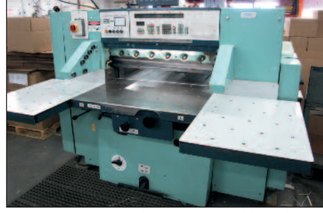
Perfecta 36" Paper Cutter # Seypa 92 PMC-1

Duplo Perfect Binder Model MR 500, S/N 0501400 (New 2001), Single Clamp, Cover Feeder, Scoring, Gold SE Waste Recovery Vacuum, w/Jet Portable Dust Collector