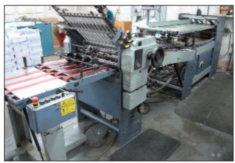
Stahl Folder Model T56