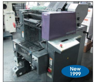
Heidelberg Printmaster 2-Color Printing Press # QM-46-2