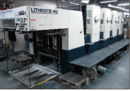
Komori L-440 4-Color Sheet Fed Printing Press