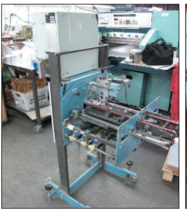
MBO Air Knife Folder Model Z2