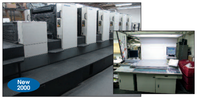
Komori L640-CX 6-Color Sheet Fed Printing Press