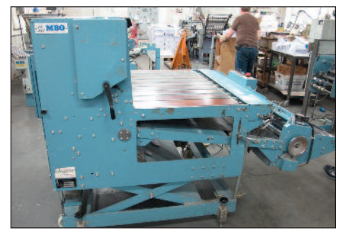
MBO Stacker Model SBAP-82ME