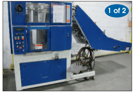
Gammerler STC-70 Web Counter Stacker