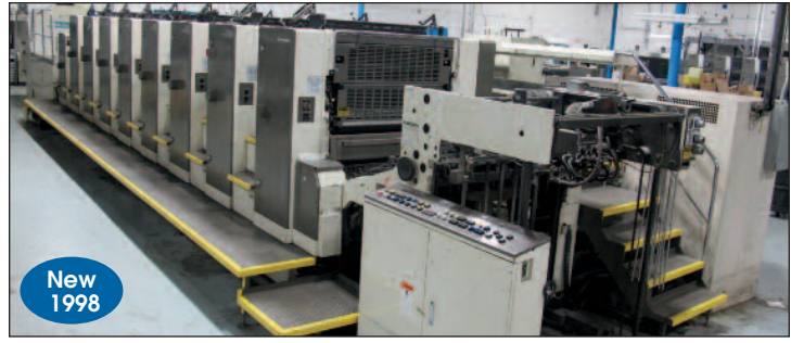
Mitsubishi 3H-8 Sheet Fed Printing Press