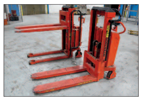
Interthor 3000 lb Electric Paper Lift Trucks Model TP30ME0362