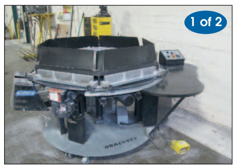
Brackett Circular Padding Machine