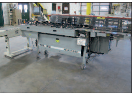
Mailcrafter Inserter Model 9800L