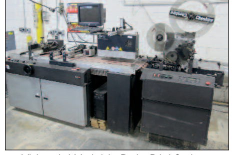
Video Jet Variable Data Print System Model 98700081 w/Tabber