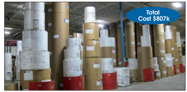
Partial View of Paper Inventory