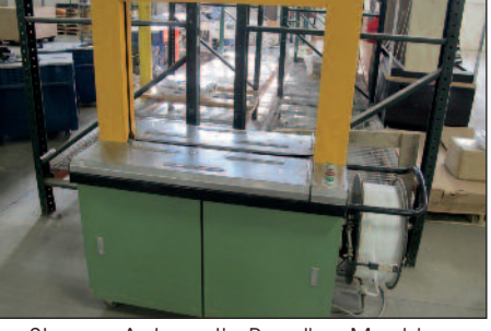
Strapex Automatic Banding Machine