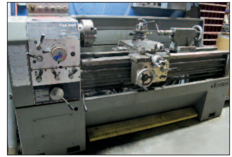
Takang Lathe, 17" x 1500 mm