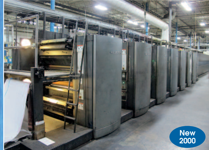
Heidelberg S2000 Sunday Web Press, 23.25" x 38" Width

Man Roland 708LV-8 Sheet Fed Printing Press