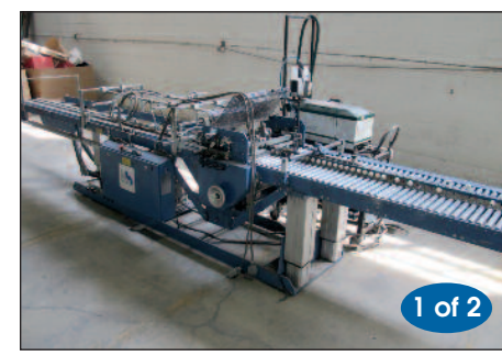
Herzog & Heymann Folder