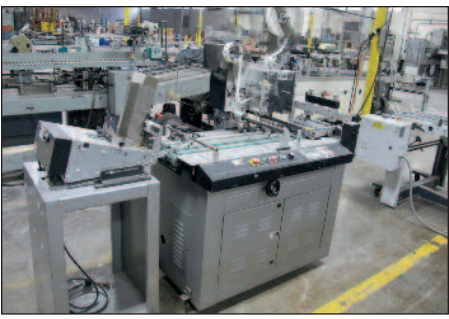
Kirk Rudy Tabber Model 535-CS