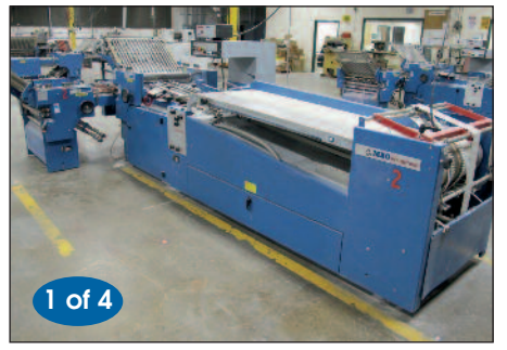
MBO B26S-C Perfection Series Folder