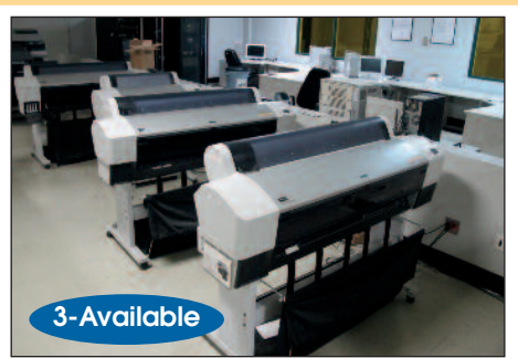
Epson Stylus Pro 9880 Proofers