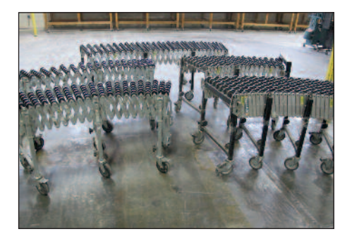
View of Nestflex Conveyors