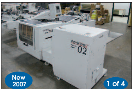
Palamides Automatic Banding Machine Model Delta 703

MT-HD1250 Processor S/N ME-10340 (2008), Kodak Gumming Unit, Kodak Model MT-HD1250 Processor S/N ME-10857 (2012), (2) Dell Poweredge +310 Servers w/ Dual Monitors