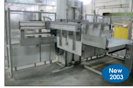
Polar Mohr Transomat Model TR160EL-6