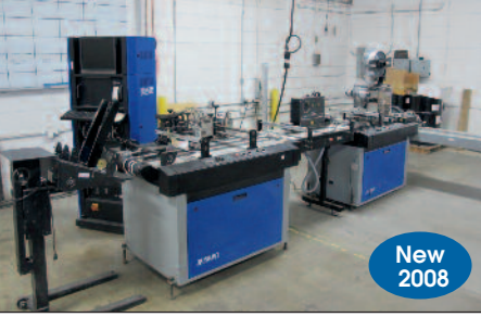
Variable Data Inkjet Print System Model BK1700 w/Tabber Buskro