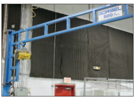
Gorbel 500 lb. Jib Crane w/Hoist