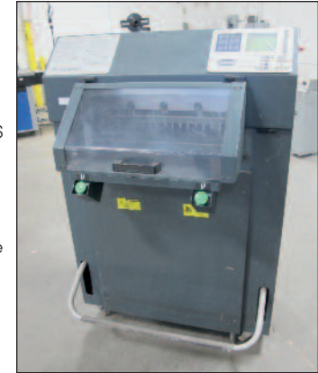
Challenge Paper Cutter Model Titan 200