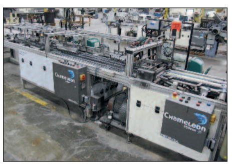
Chameleon Gluer Finishing System Model 650SRS & 800S+

Stahl Air Knife Folder Model VFZ 52.2 S/N 97495-254050