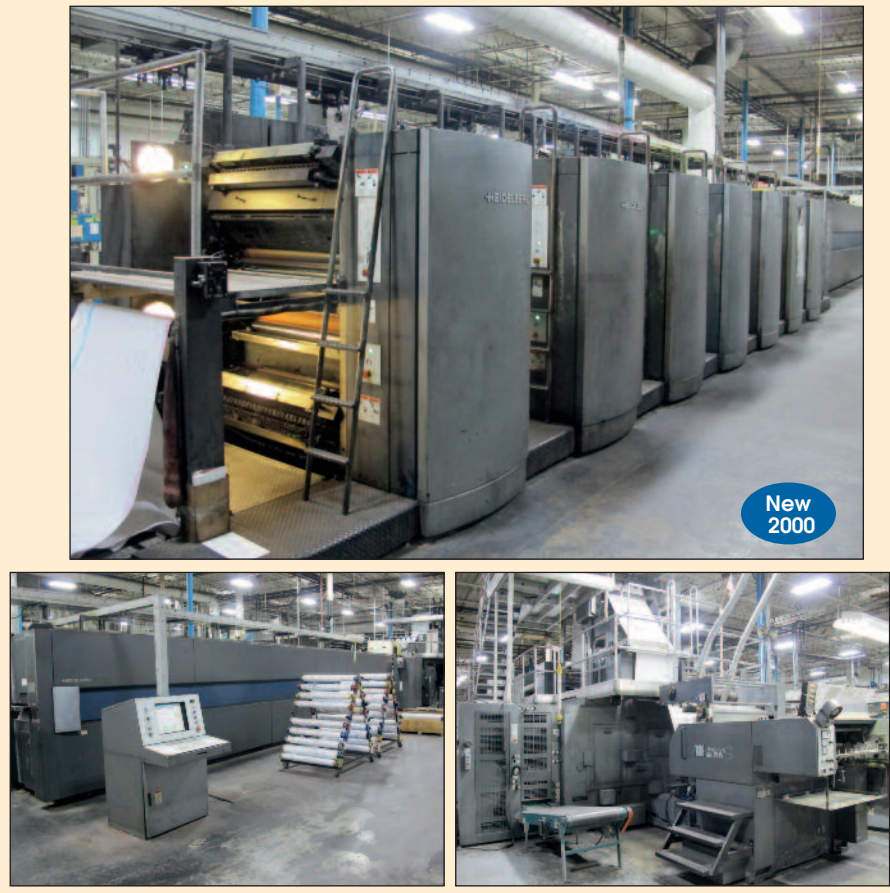
Heidelberg S2000 Sunday Web Press, 23.25" x 38" Width