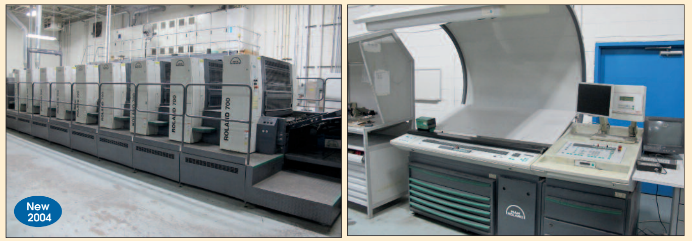
Man Roland 708LV-8 Sheet Fed Printing Press