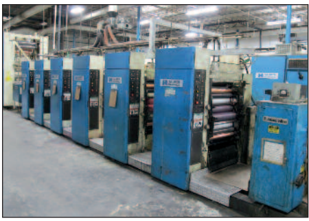
Harris M1000 Web Printing Press, 23.5" x 38" Width