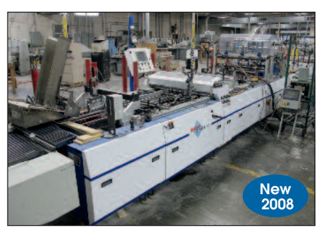
Packsmart Folder/Gluer Line Model 30