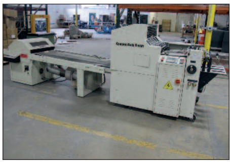
Kompac Kwik Finishing System