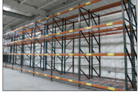
View of H.D. Pallet Racking