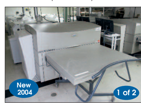
Creo Lotem (Kodak) CTP Systems Model 80011 Quantum