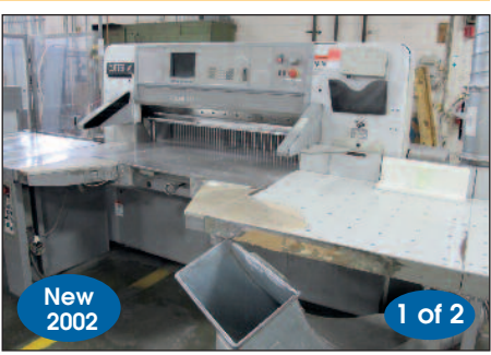
Polar Mohr Paper Cutter Model 137ED