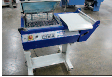
Italdiback Dibipack 1217ST Packaging Machine

Harland Portable Labeling Machine Model Comet-Servo, S/N J55793-01 (New 2005) Label-Aire Portable Labeling System Model 2111CD, S/N 0143679711