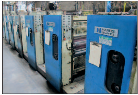
Harris 110A Web Printing press, 17.75" x 26" Width