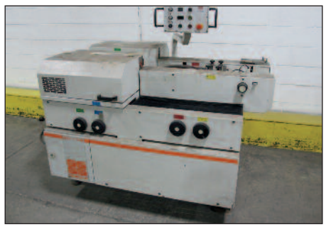
Gammerler RS-114 Trimmer