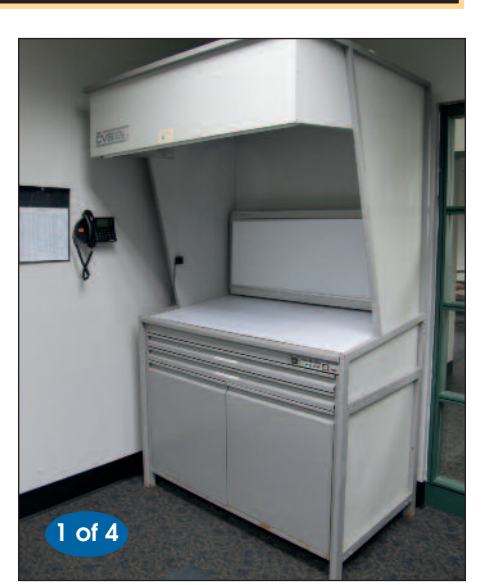
GTI CVS Color View Booth