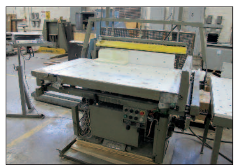
Polar Mohr Paper Jogger Model RAB5