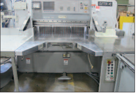
Polar Mohr Paper Cutter Model 115ED