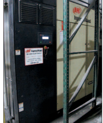
Ingersoll Rand 125 HP Rotary Screw Air Compressor #IRN125H-CC

Lantech "Q" Series Semi-Automatic Pallet Stretch Wrapper