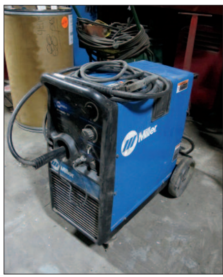
Miller Millermatic 251 Welder