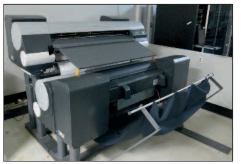
Canon Proofing System Model IPF8300S