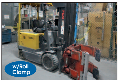
TCM 4200 lb Electric Forklift Model FCB30A4