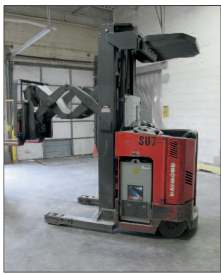
Raymond 5000 lb Electric Forklift Reach Truck Model EZD36VDR30