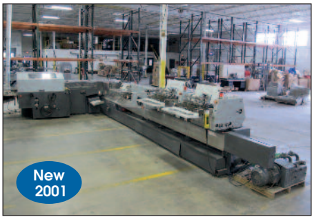
Heidelberg Saddle Stitcher Line Model HS270