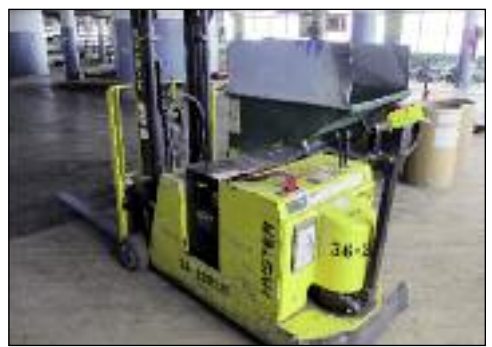
Hyster 3000 lb Electric Pallet Truck Model W30XTC