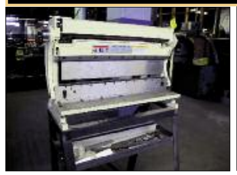
Jet Combination Shear Brake & Roll #SBR-30N