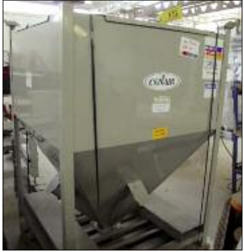
Conair Portable Surge Bin Hopper