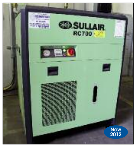
Sullair Compressed Air Dryer Model RC700