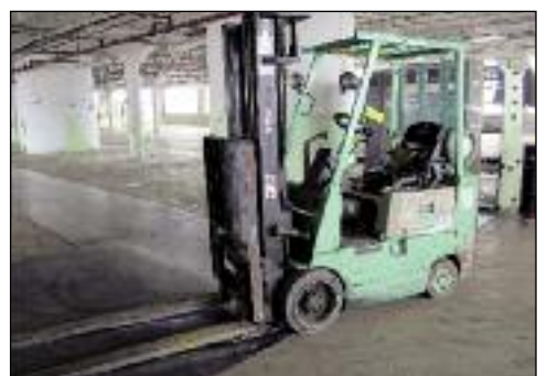
Mitsubishi 3000 lb LPG Forklift Model FGC1