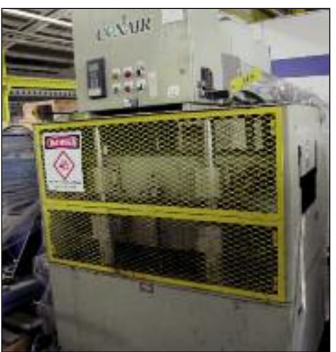
Conair Strand Pelletizer