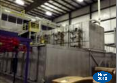
ITS International Thermal Systems Gas Tunnel Oven