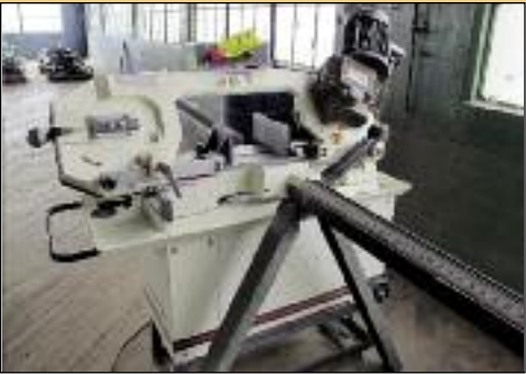
Jet Horizontal Band Saw #HBS-814GA