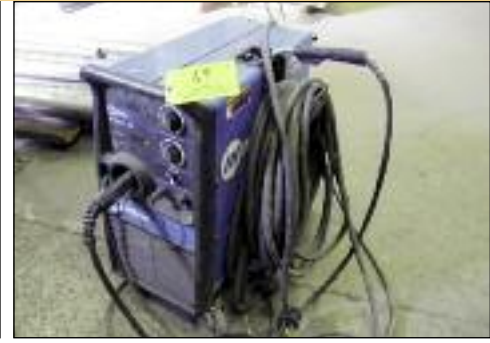
Miller Millermatic 251 Wire Welder