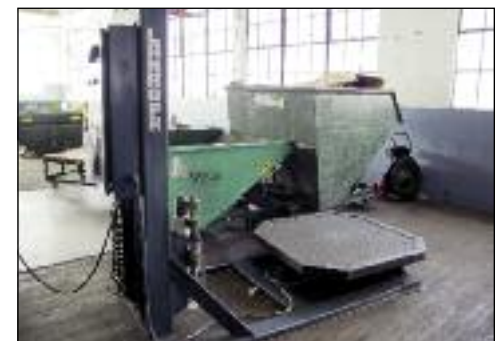
Lantech Lan Wrapper Model 48