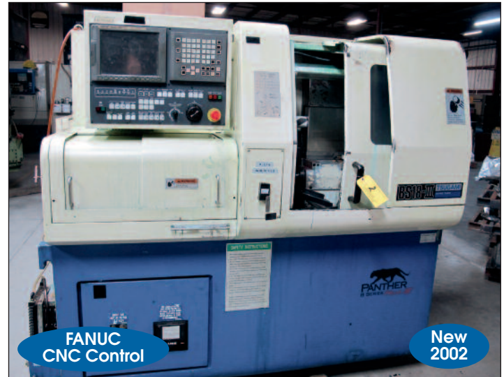
Tsugami BS18-III Swiss Type CNC Lathe