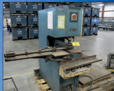
Amada #SP-15 Insertion Set Press 15 Ton Cap