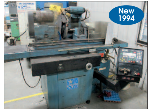
K.O. Lee #022-0242 CNC Cylindrical Grinder