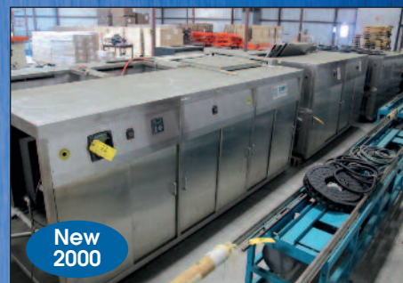
Crest Ultrasonic Parts Wash System - 6 Station

THOMAS INDUSTRIES 2414 Boston Post Road Guilford, CT 06437-2310 (203) 458-0709 • (203) 458-0727 Fax http://www.thomasauction.com