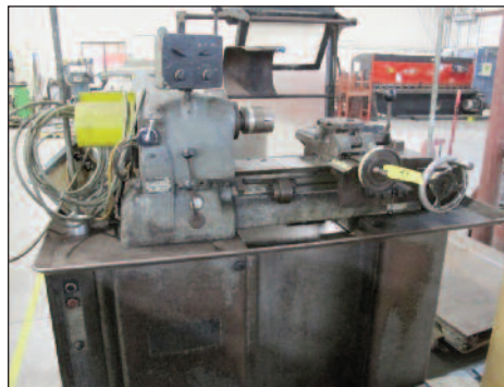
Hardinge # HC Hand Chucker