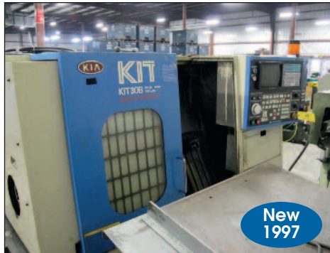
KIA #Kia-Turn-30B CNC Turning Center