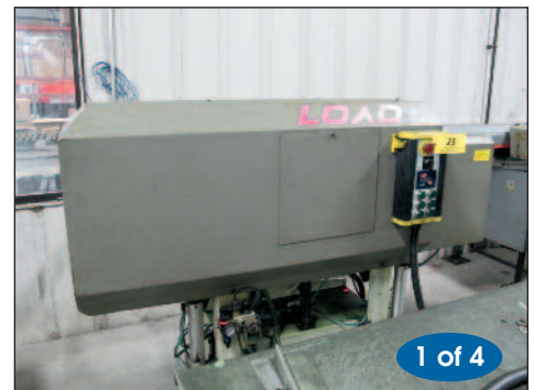
LNS #Quickload Automatic Bar Feed