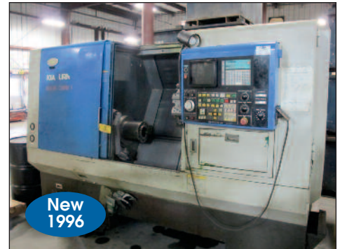
KIA #Kia-Turn-28 CNC Turning Center