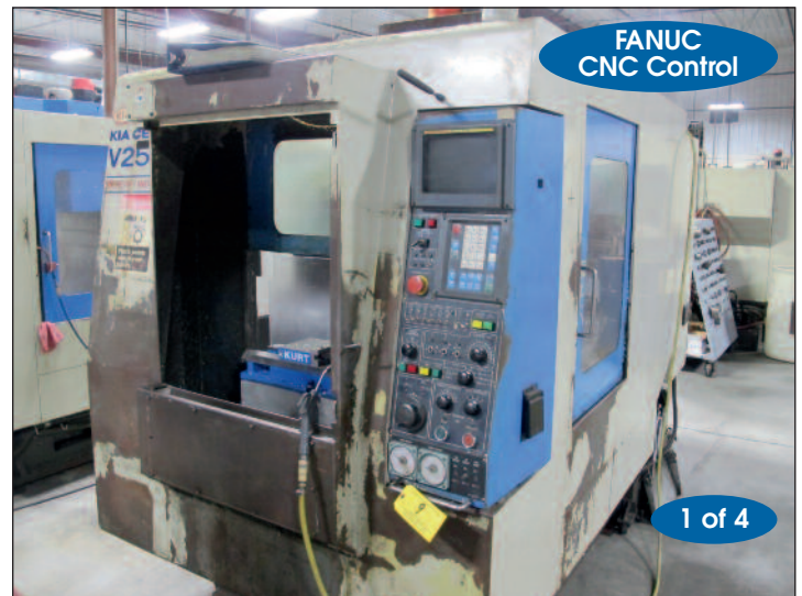
KIA #KV-25P CNC VMC