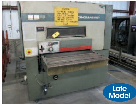
Grinding-Master 36" Deburring/Finishing Machine #MCSB-900