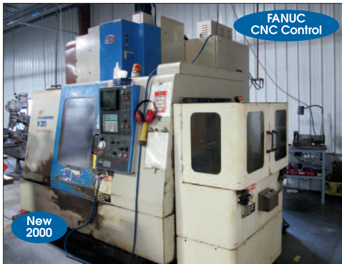
KIA KV-35-IIP CNC VMC