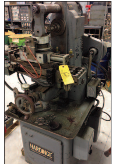
HARDINGE # TM Milling Machine