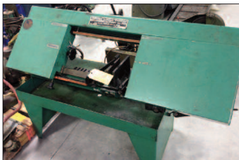
Carolina #KV-12 Horizontal Band Saw