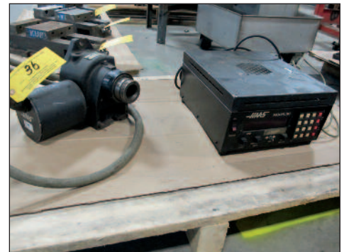
Haas 5C Indexing Fixture