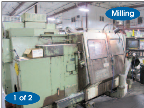
Okuma #LC-20M "4-Axis" CNC Turning Center