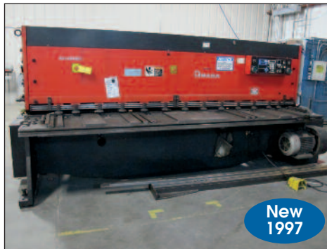
Amada 10' x 1/4" Shear Model M-3060