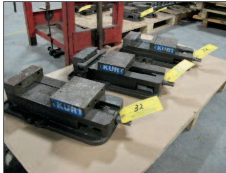
View of Kurt Vises