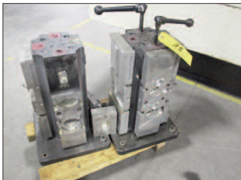
(2) Chick Tombstones