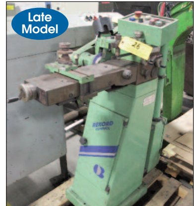
Rekord Saw Blade Sharpener