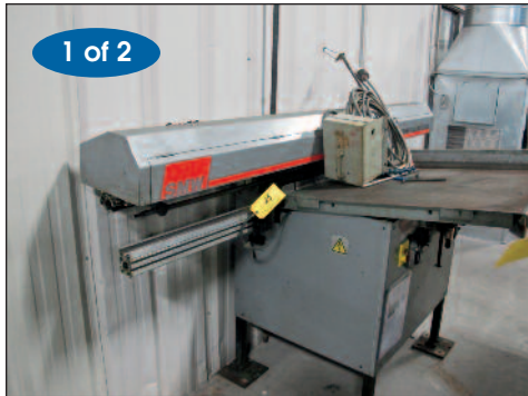
SMW #Superspacer 12.65 Automatic Bar Feed