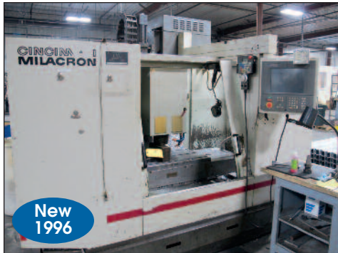
Cincinnati-Milacron Arrow-750 CNC VMC