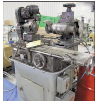
R-O Grinder w/ 5C Workhead