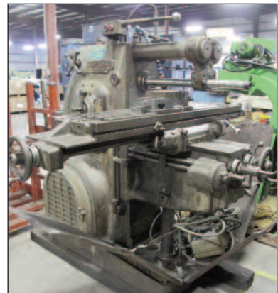
Kearney & Trecker #2, Model- 250CH Horizontal Milling Machine

Amada #SP-15 Insertion Set Press 15 Ton Cap S/N 150852; ; LNS #Quickload Automatic Bar Feed Unit; (2) SMW #Superspacer 12.65 Automatic Bar Feed Unit; Grinding-Master 36" Deburring/Finishing Machine #MCSB-900; K.O. Lee #022-0242 CNC Cylindrical Grinder (New 1994), 8" x 17" Cap; Hardinge #HC Hand Chucker Lathe S/N HC3723N; Kearney & Trecker #2 Horz Milling Machine; R-O Grinder; Rekord Control Saw; (3) Polar Cool Large Shop Fan #Papa Bear; (10+) Kurt Machine Vises; (2) Chick Tombstones; Haas Indexer Model #5C w/ Haas Servo Control