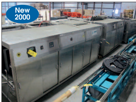
Crest Ultrasonic Parts Wash System - 6 Station