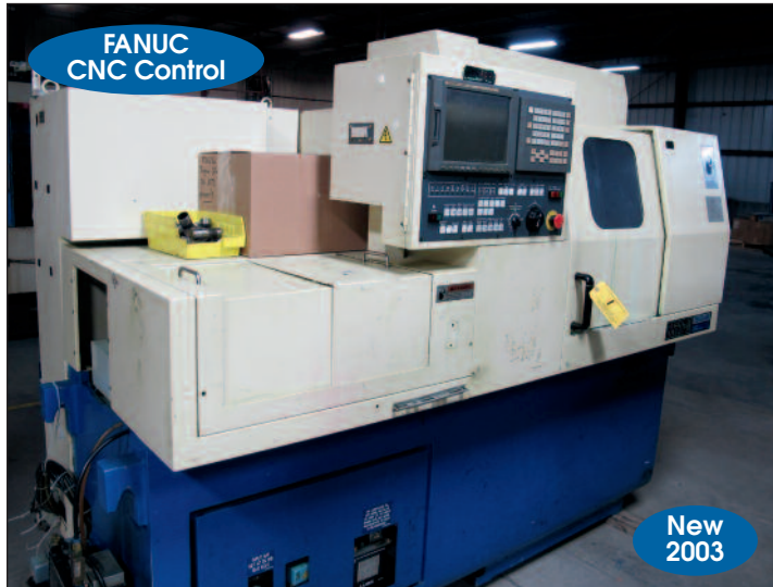
Tsugami BS26-III Swiss Type CNC Lathe