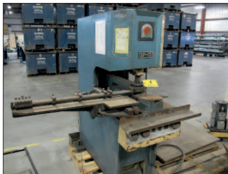
Amada #SP-15 Insertion Set Press 15 Ton Cap