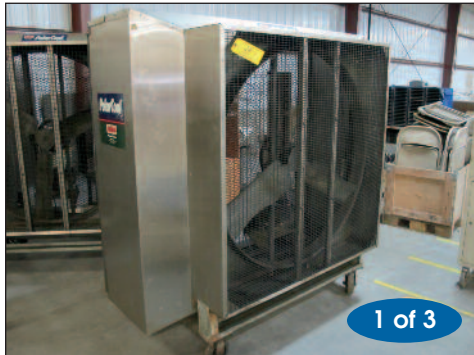
Polar Cool Large Shop Fan #Papa Bear