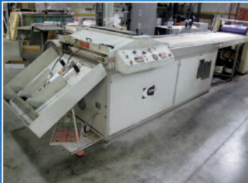
TEC UV Coater Model #2426-1-14-A

Sale Date: Thursday, June 11, 1:00 PM (ET)