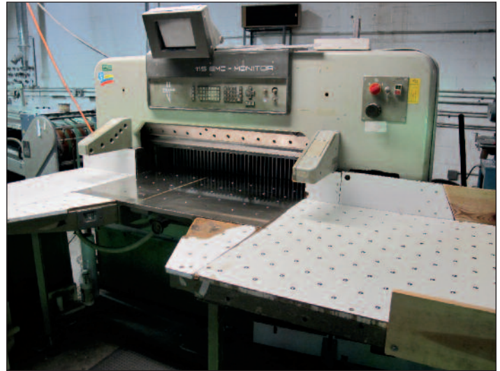
Polar Mohr 45" Paper Cutter Model 115-EMC-MON