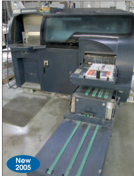
CP Bourg Perfect Binder Model #BB3002