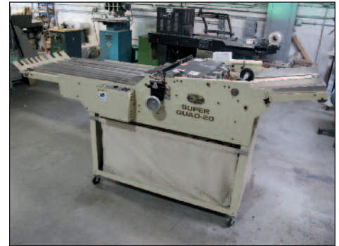
Therm-O-Type Super Quad 20 Slitter/Perforator/Scorer