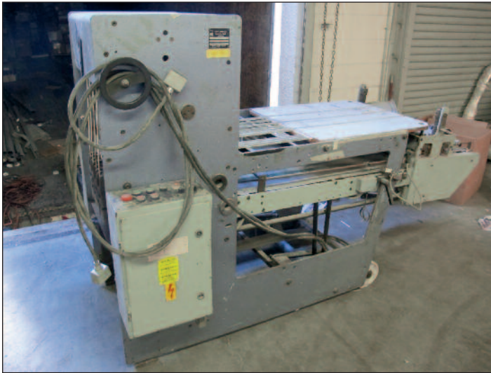
Stahl Stacker/Crusher Model #SBP46