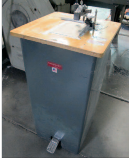
Lassco Corner Rounder Machine