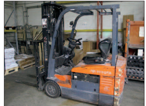
Toyota 3,000 Lb Electric Forklift Model #7FBEU15