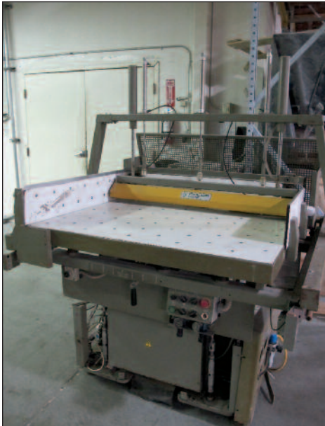
Polar Mohr Paper Jogger Model #PAL-4