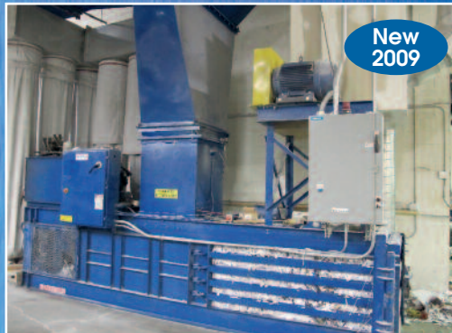
Max-Pak Hydraulic Baler System w/Shredder