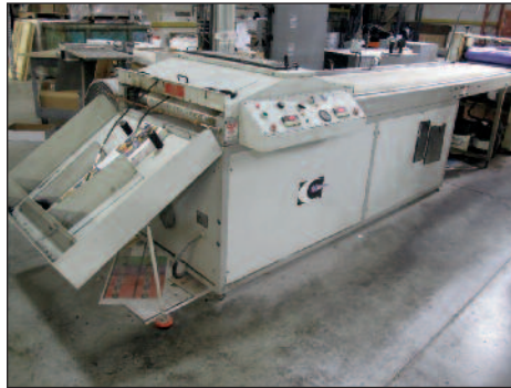
TEC UV Coater Model #2426-1-14-A