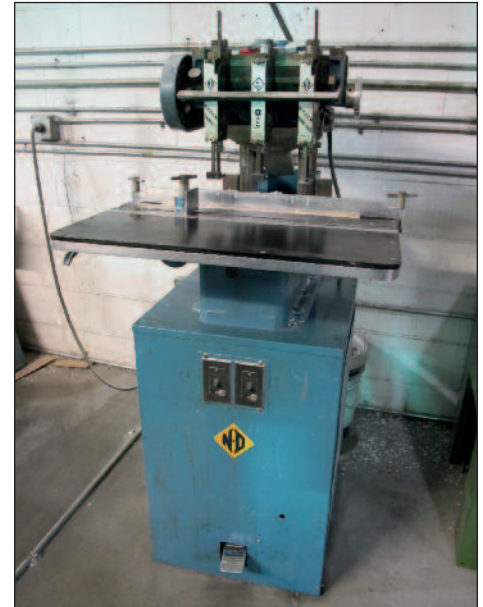
Nygren-Dahly Heavy Duty Paper Drill