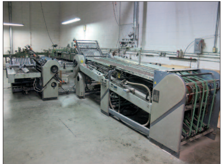
Stahl 26" Folder Model TC 66/4-4-4-RCC