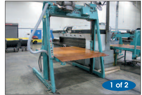
EDM 61" PAPER LOADING SYSTEM