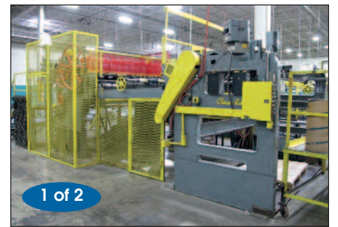
CLARK AIKEN 100" SHEETER, SINGLE KNIFE ROTARY SHEETER