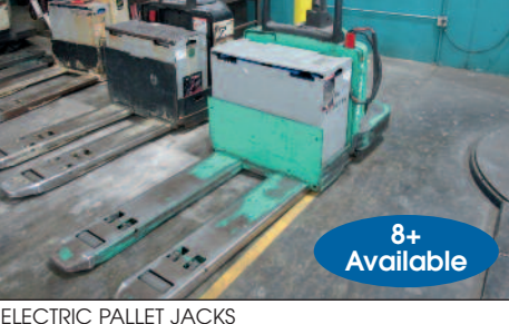
ELECTRIC PALLET JACKS