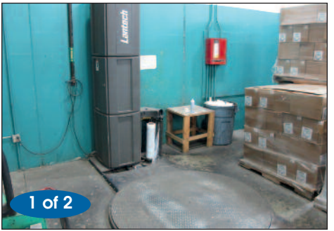
LANTECH ROTARY STRETCH PALLET WRAPPER MODEL Q SERIES