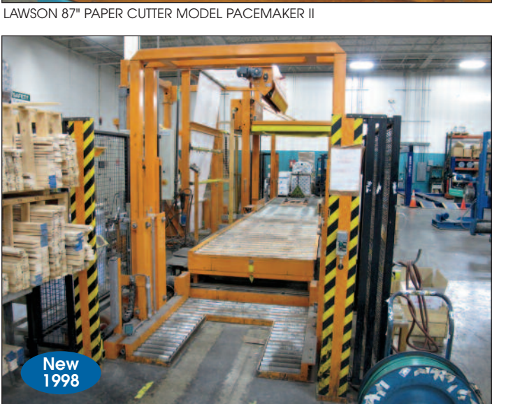
MSK/COVERTECH ROLL WRAPPING SYSTEM MODEL 282-E3