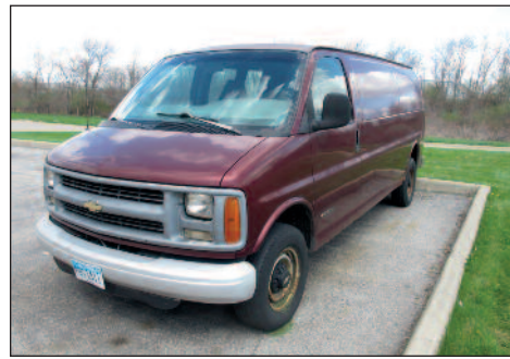
CHEVY 2500 VAN