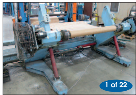
POWELL ECCENTRIC PIVOT SHAFTLESS UNWIND STAND