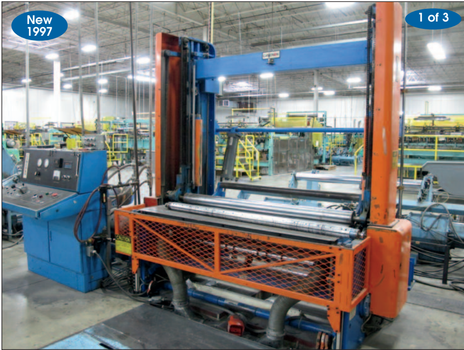
CAMERON 72" SLITTER REWINDERS MODEL T426