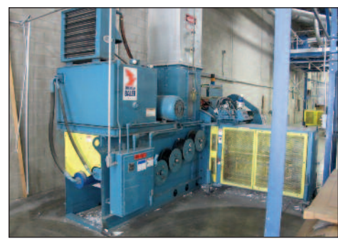
AMERICAN HORIZONTAL BALER MODEL 3029730R, 30 HP

OUTSTANDING AUCTION OFFERING, COMPLETE LOT CATALOG & BIDDING AT www.ThomasAuction.com