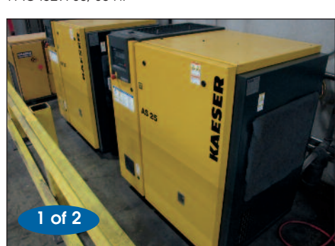
KAESER ROTARY SCREW AIR COMPRESSOR MODEL AS25