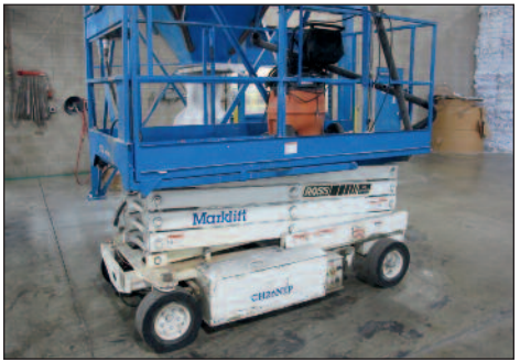
MARKLIET ELECTRIC SCISSOR LIET MODEL CH26NEP