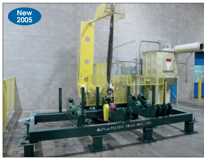
PACIFIC TRAIL ROLL SAW MODEL PRS25104