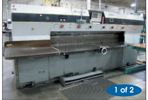
LAWSON 110" PAPER CUTTER MODEL MC-VIII