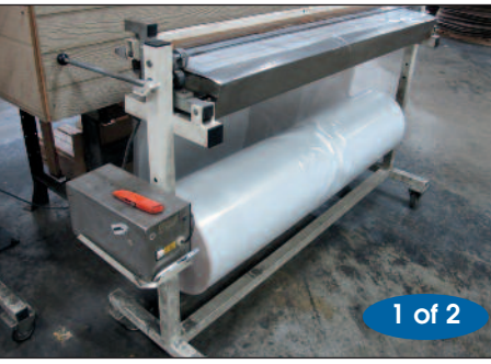
MSK 6' IMPULSE SEALING SYSTEM MODEL HPL1500