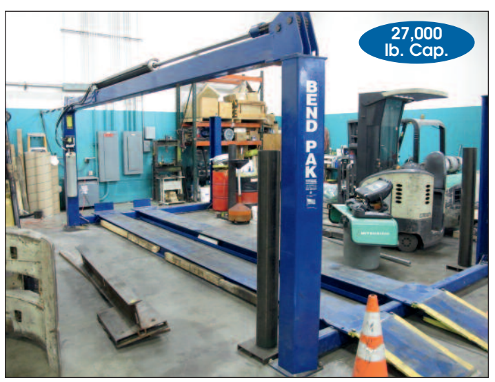
BEND PAK AUTOMOTIVE REPAIR LIFT MODEL BP-27