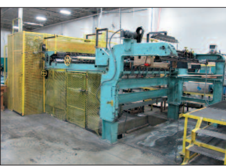
CLARK AIKEN 88" SHEETER, SINGLE KNIFE ROTARY SHEETER