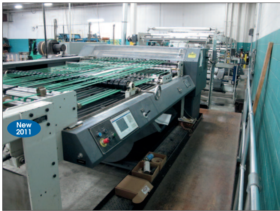
MAXSON 65" DOUBLE KNIFE SHEETER