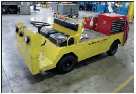
CUSHMAN FLECTRIC SHOP CART MODEL TITAN 3000