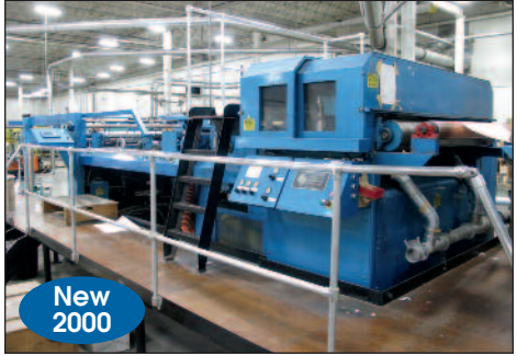
MAXSON 65" SINGLE KNIFE SHEETER