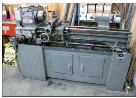
JET 13" X 40" LATHE MODEL 1340PBD