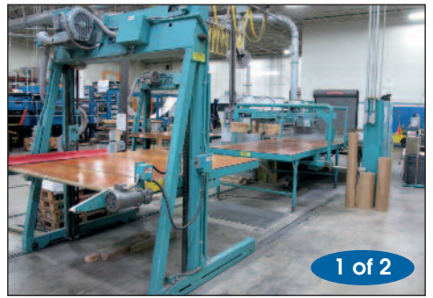
EDM 61" PAPER UNLOADING SYSTEM