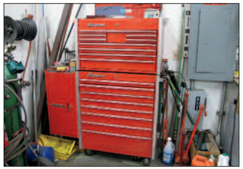
SNAP-ON PORTABLE TOOL CABINET