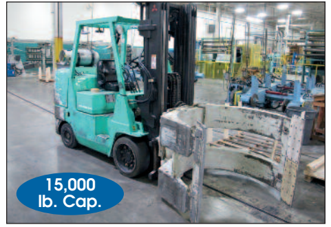
MITSUBISHI #FGC45K FORKLIFT W/ROLL CLAMP