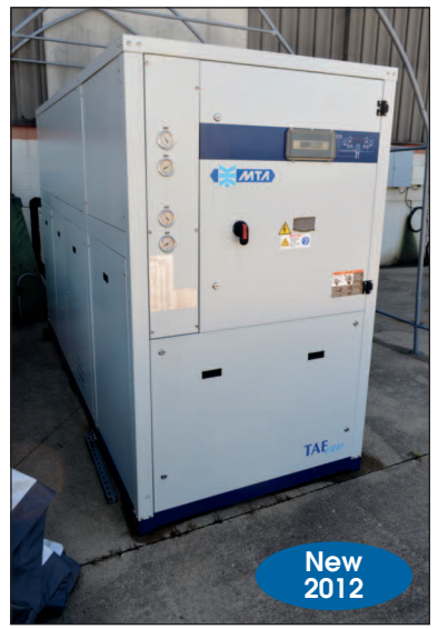
MTA WATER CHILLER MODEL TAE-EVO-602