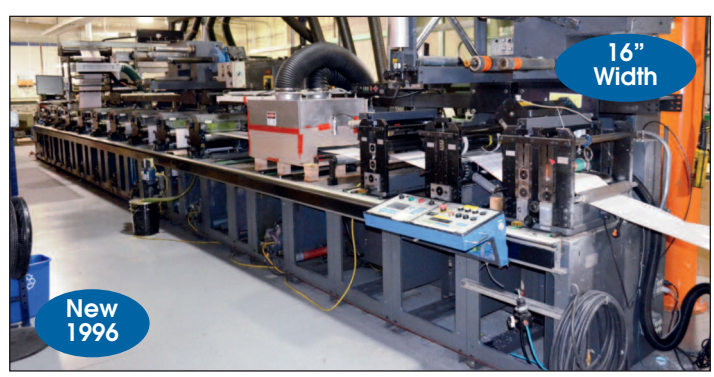
ARSOMA 8-COLOR UV FLEXO WEB LABEL PRESS MODEL EM410