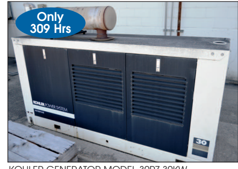
KOHLER GENERATOR MODEL 30RZ 30KW,