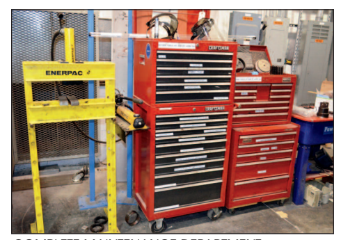
COMPLETE MAINTENANCE DEPARTMENT