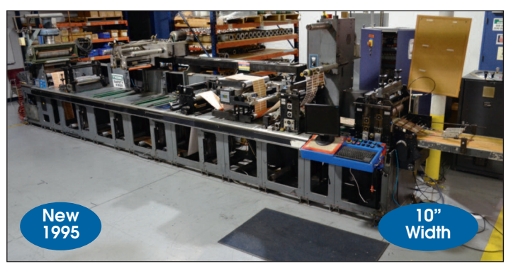
ARSOMA 3-COLOR UV FLEXO WEB LABEL PRESS MODEL EM411