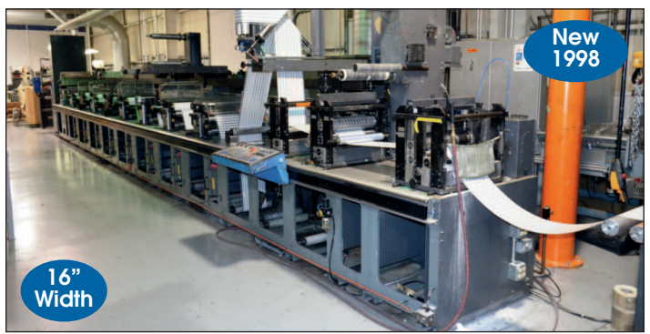
ARSOMA 10-COLOR UV FLEXO WEB LABEL PRESS EM410