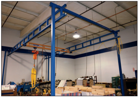
GORBEL 1800 LB CAPACITY FREESTANDING CRANE SYSTEM