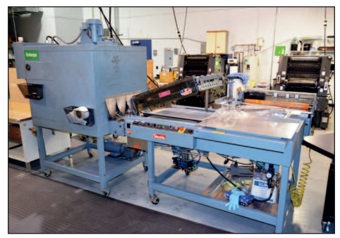
SHANKLIN MODEL S26 L-SEAL PACKAGING MACHINE