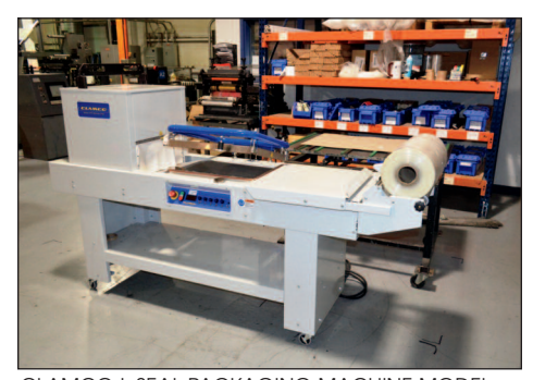
CLAMCO L-SEAL PACKAGING MACHINE MODEL 120-COMBO