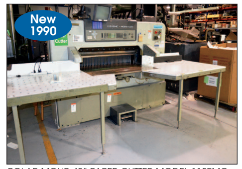
POLAR MOHR 45" PAPER CUTTER MODEL 115EMC-MON