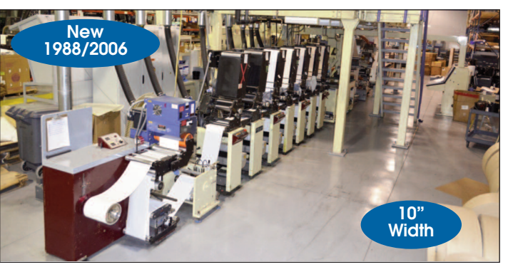
COMCO/ARSOMA UV FLEXO WEB LABEL PRESS