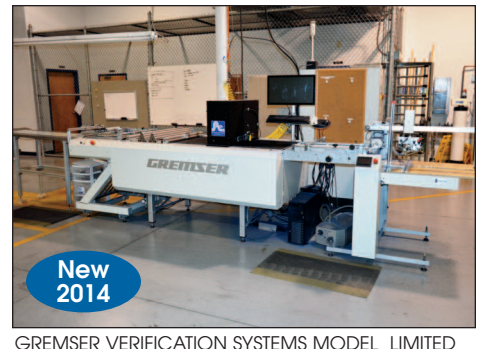
CHEMPER AFRILICATION 2121FIND MODEL FIMILER