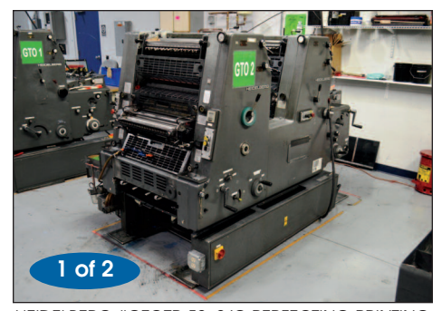
HEIDELBERG #GTOZP-52, 2/C PERFECTING PRINTING PRESS

Companies will Grow Primarily through Mergers & Acquisitions Epicomm & Thomas Industries are partnering to provide printersa unique opportunity to explore strategic growth options. Our in-depth knowledge of the printing industry and longstanding relationships with printers nationwide mean we can combine invaluable data on industry trends with thousands of prequalified printers seeking to expand their businesses through mergers or acquisitions.