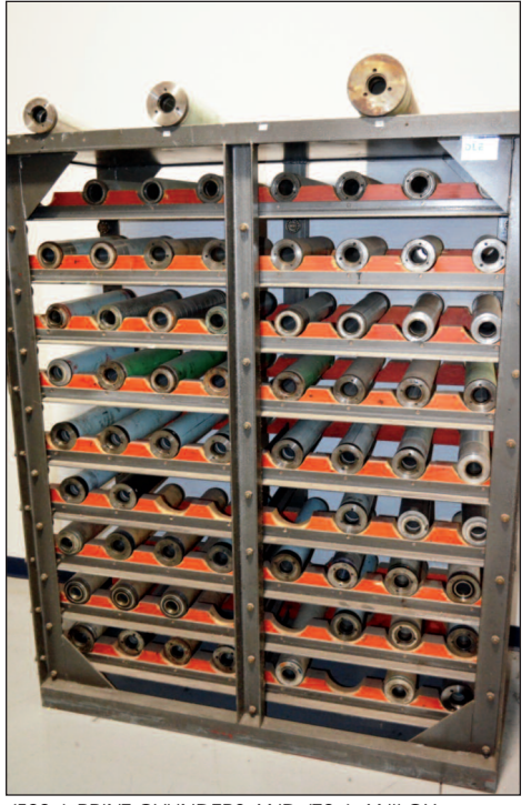
(500+) PRINT CYLINDERS AND (70+) ANILOX ROLLERS

HEIDELBERG #GTOZP-52, 2/C PERFECTING PRINTING