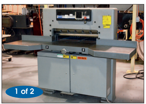
CHALLENGE 30.5" PAPER CUTTER MODEL MPX