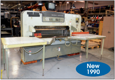
POLAR MOHR 61" PAPER CUTTER MODEL 155 EMC-