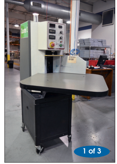
US PAPER COUNTERS MODEL MAX I-CCP PAPER COUNTER