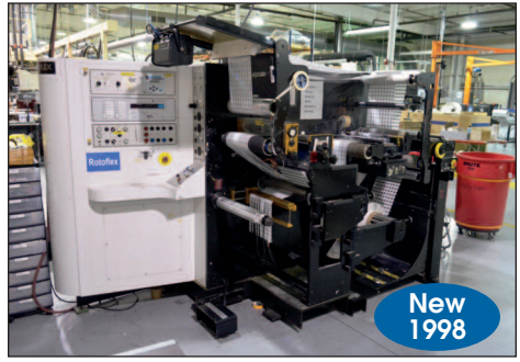
ROTOFLEX 16" SLITTER REWINDER, MODEL VLI1400