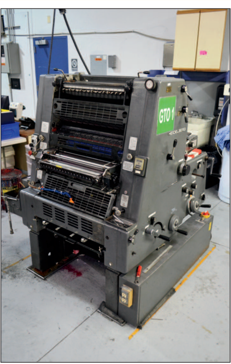
HEIDELBERG #GTO-52 PRINTING PRESS