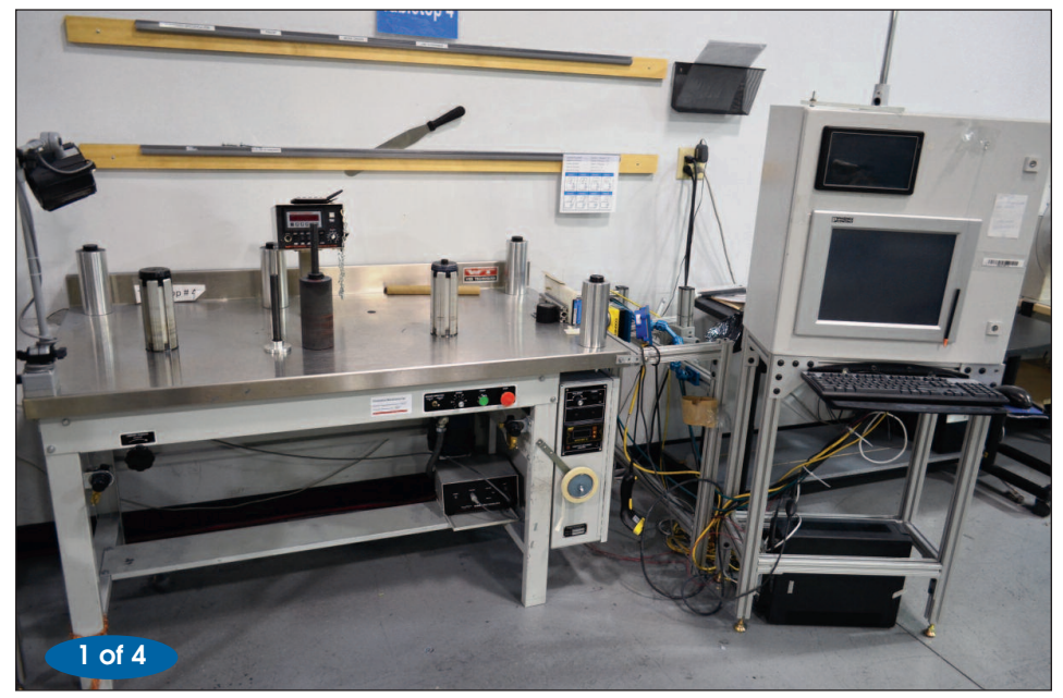
WEB TECHNIQUES MODEL WT-25 7" REWIND AND INSPECTION MACHINE