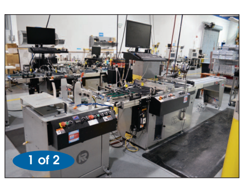
KIRK RUDY VARIABLE DATA PRINT SYSTEM