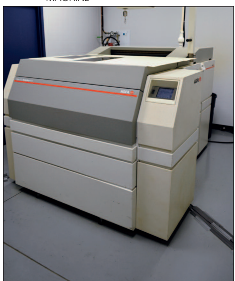
AGFA SELECT SET AVANTRA 445 FILM PROCESSOR