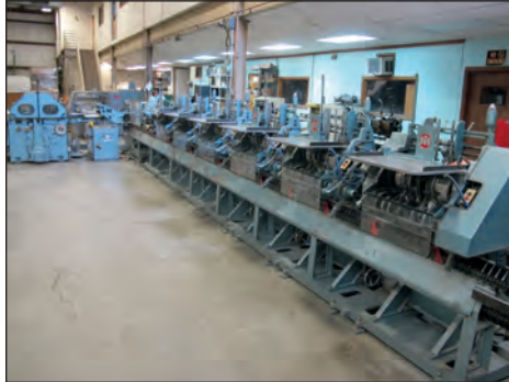
McCain 1500 Saddle Stitcher, 6-Pocket