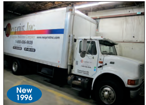
International 22' Box Truck Model 4900