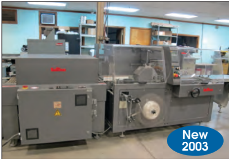
Kalifass Automatic Packaging Machine # Universal 400