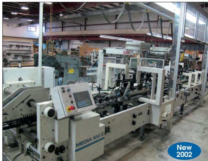
Bobst Media 100II-A2 Folder / Gluer