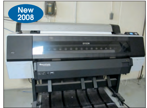
Epson Proofer Model 9900