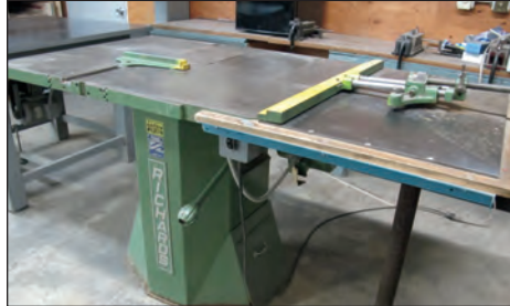
Richards Super Die Maker Saw