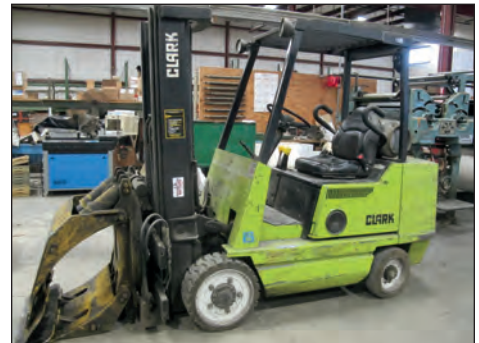
Clark 3650 lb. LPG Forklift Model GCX30 w/ Roll Clamp