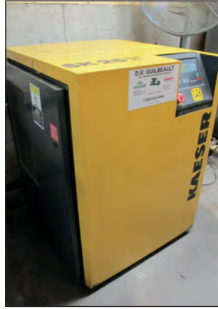
Kaeser Rotary Screw Air Compressor Model SK26