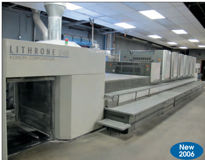
Komori 6-Color Sheet Fed Printing Press Model LS640