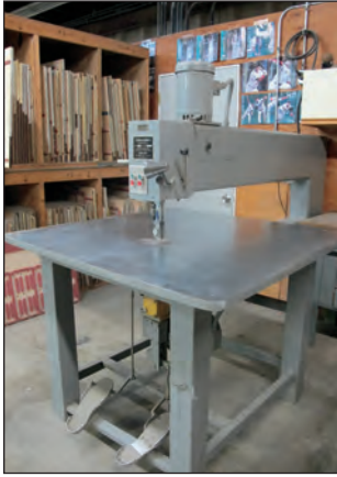
Labor Saver Saw Ultramatic Die Saw Model DJ60