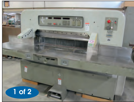
Polar Mohr 45" Paper Cutter Model 115EMC