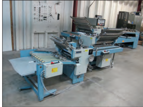
MBO Folder Model B21, 4/4/4