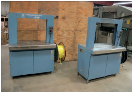
Akebono Oval Strapping Machine Model 515