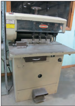
Challenge 3-Head Paper Drill #EH-3A