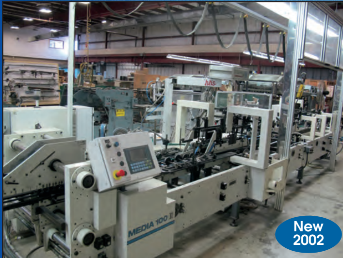
Bobst Media 100II-A2 Folder / Gluer

OPEN HOUSE INSPECTION: TUESDAY, SEPTEMBER 15, 9 AM TO 4 PM