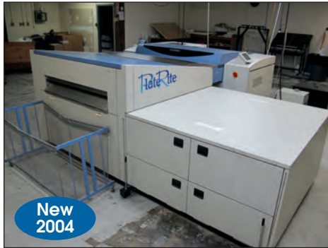
Screen Plate-Rite CTP System Model PT-R8800