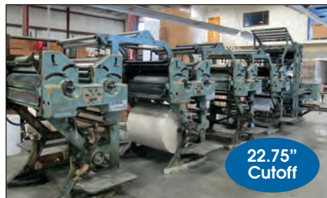
Goss Community 4-Unit Web Printing Press