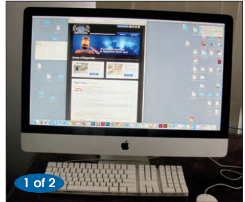
Apple All-In-One G5 Power PC