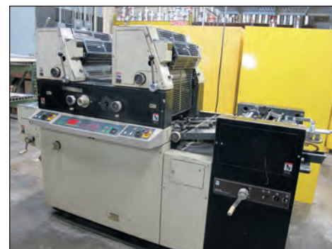
Ryobi 2-Color Offset Printing Press Model 3985