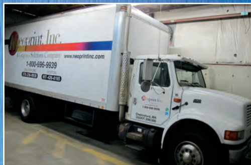
1996 International 22' Box Truck Model 4900