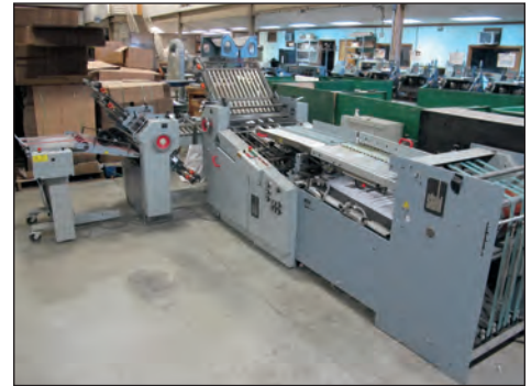
Heidelberg Stahl Folder Model Ti55/4-52/4/ri5