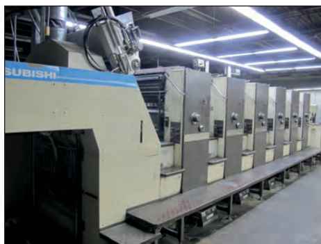
Mitsubishi 6/C Fed Printing Press Model 3F