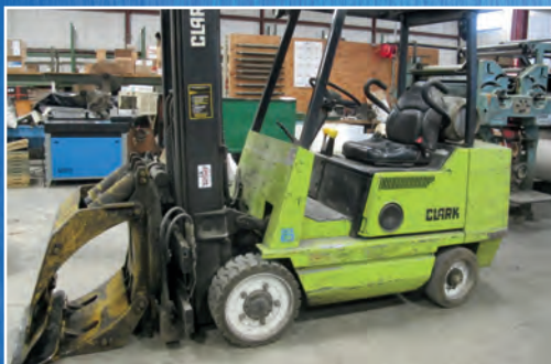
Clark 3650 lb. LPG Forklift Model GCX30 w/ Roll Clamp

AUCTION DATE: WEDNESDAY, SEPTEMBER 16, 1:00 PM (ET) OPEN HOUSE INSPECTION: TUESDAY, SEPTEMBER 15, 9 AM TO 4 PM