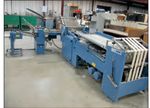
MBO Folder Model B30C