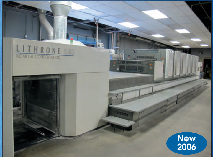
Komori 6-Color Sheet Fed Printing Press Model LS640