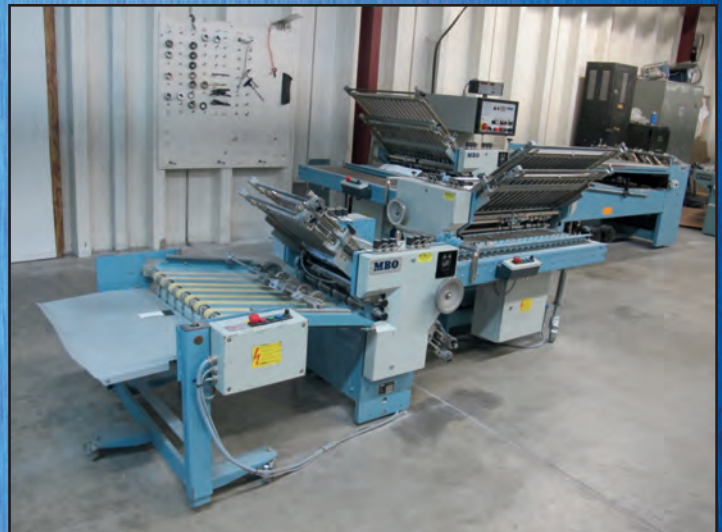
MBO Folder Model B21, 4/4/4