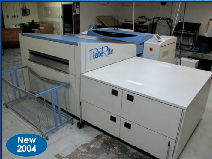
Screen Plate-Rite CTP System Model PT-R8800