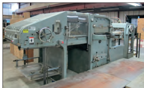
Bobst Super Autoplaten Die Cutter Model SP1260E