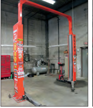
Alm Auto Lift