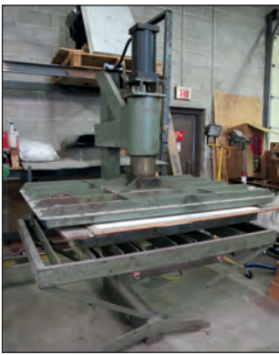
Clicker Press, 24" x 48"