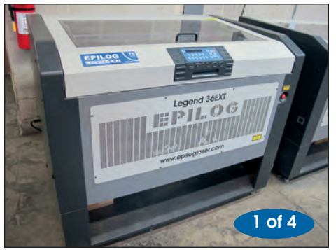
Epilog Laser Engraver Model Legend 36EXT