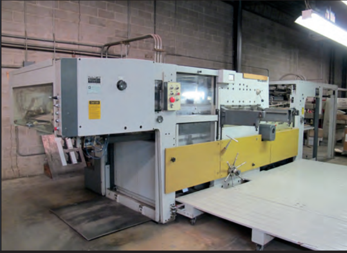
Bobst Die Cutter Model Autoplaten SP-1120-E