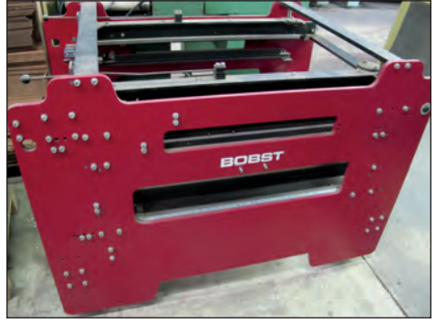
Bobst Make Ready Table