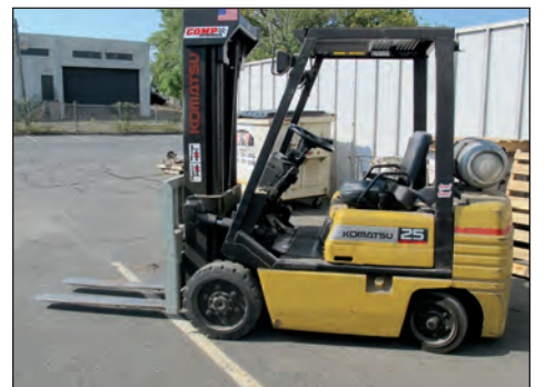
Komatsu 4500 lb LPG Forklift Model 25