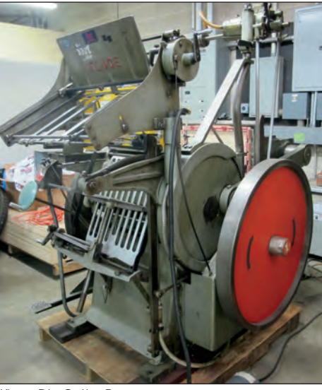
Kluge Die Cutter Press