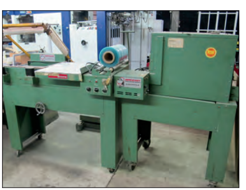
Sergeant L-Seal Packaging Machine