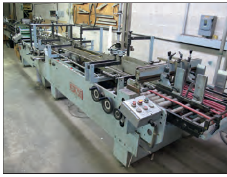
Vega Folder Gluer Model 750