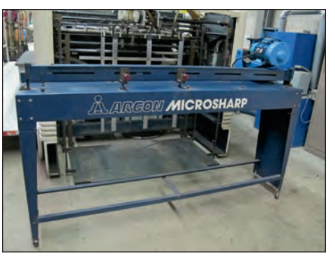
Argon Microsharp Squeegee Sharpener