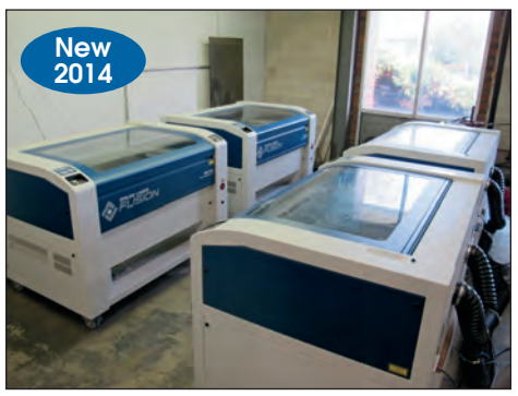
(4) Epilog Fusion Engravers Model 1300