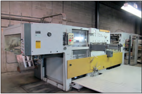
Bobst Die Cutter Model Autoplaten SP-1120-E