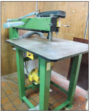
Die Jig Saw / Drill