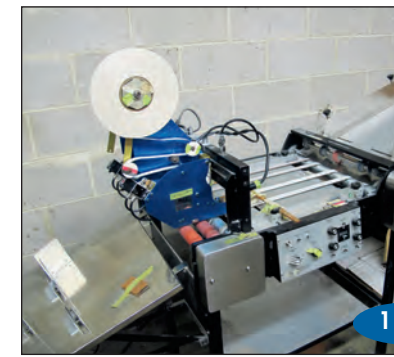
MGI Taping Machine