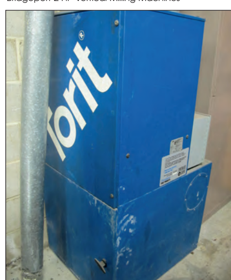
Torit Dust Collector