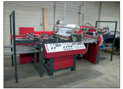
Ecosystems Thermal Laminator Model 76, 30" x 45