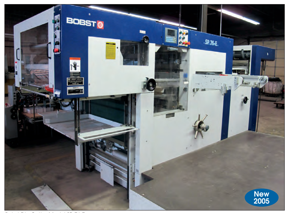
Bobst Die Cutter Model SP-76-E