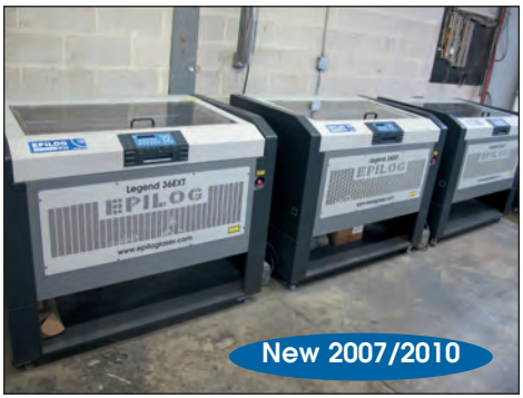
Epilog Laser Engraver Model Legend 36EXT