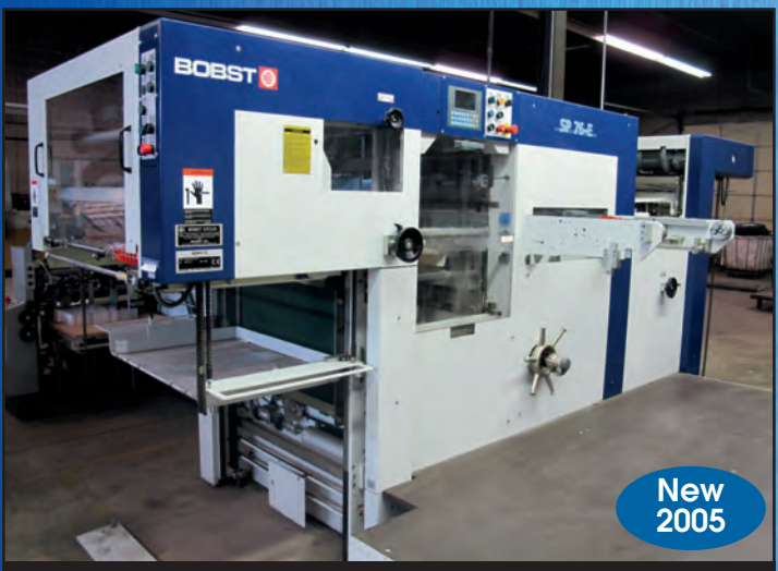
Bobst Die Cutter Model SP-76-E

AUCTION DATE: THURSDAY, NOVEMBER 5, 1:00 PM (ET) OPEN HOUSE INSPECTION: WEDNESDAY, NOVEMBER 4, 9 AM TO 4 PM