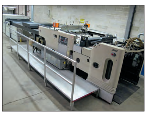
Sakurai 28" x 40" UV/IR Screen Printer Model MS-102A