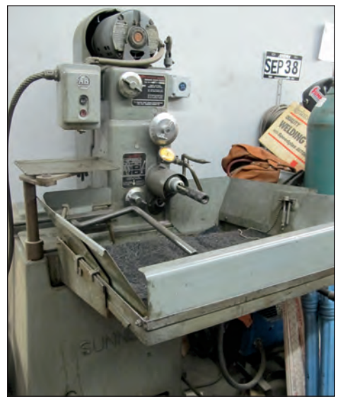
Sunnen Hone Model MB1660