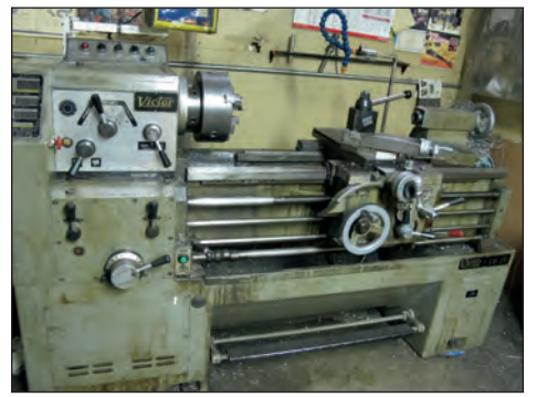
Victor Toolroom Lathe, 16" x 40"