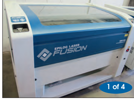
Epilog Fusion Engravers Model 1300