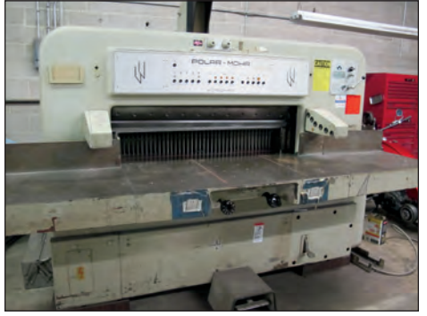
Polar Mohr 45" Paper Cutter Model 115CE