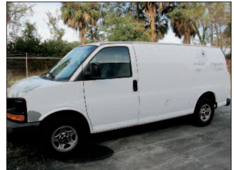
GMC Cargo Van