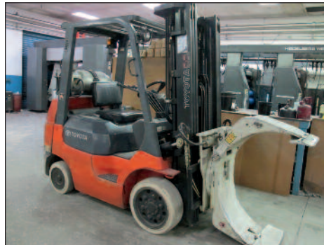
Toyota 5000 lb. LPG Roll Clamp Forklift Model 7FGCU25