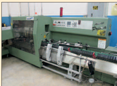
Muller Martini Saddle Stitcher Line Model Amrys Prima, 4-Pocket, 2-Cover