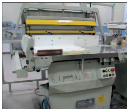
Knorr Systems Paper Jogger