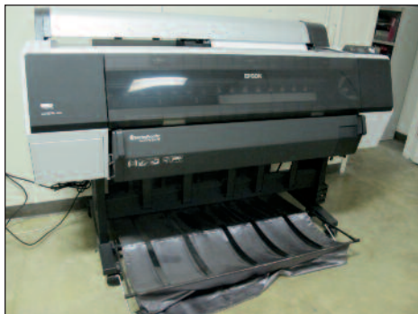
Epson Stylus Pro 9900 Proofer