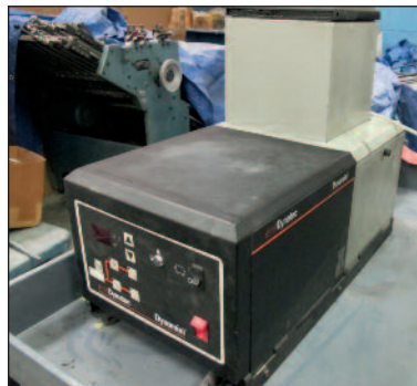
ITW Dynatec Hot Melt Glue Unit