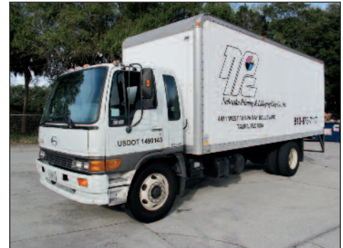
Hino Box Truck Model SG3320