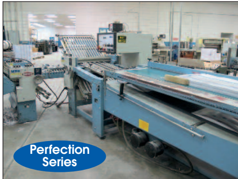
MBO Folder Model B26