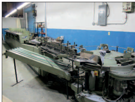
Muller Martini Panda Perfect Binder Line Model 201