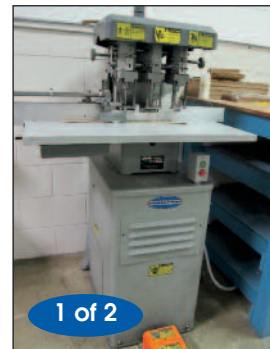
Challenge 3 Spindle Paper Drill Model EH3A