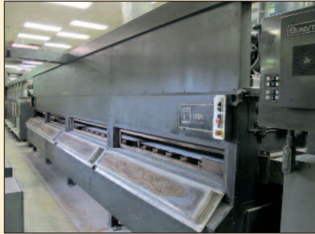
Heidelberg Web 8 Web Printing Press, 20" X 23 1/8"