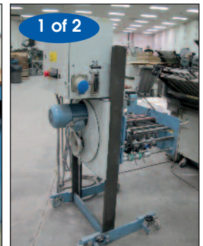
MBO Air Knife Folder Model Z2