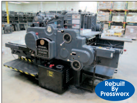
Original Heidelberg Cylinder Press Model SBG