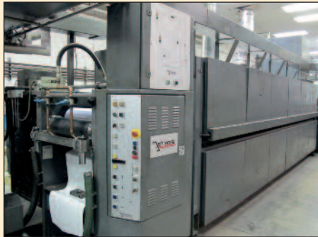
Heidelberg Web 8 Web Printing Press, 20" X 24 3/4"