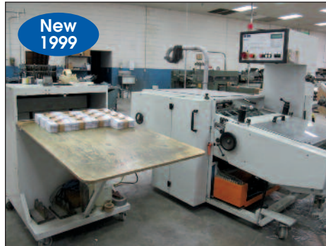
MBO Palamides Automatic Bundler/Stacker Model BA700