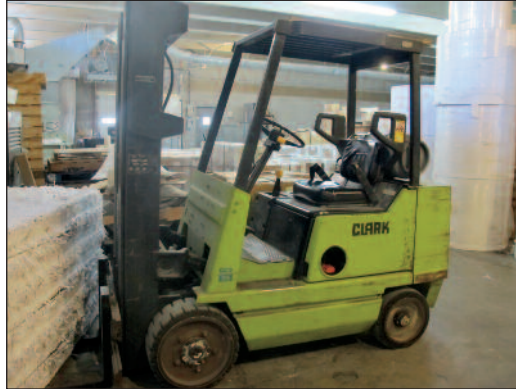
Clark 3000 lb. LPG Forklift Model GCS25MB