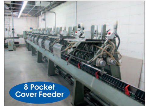
Muller Martini Saddle Stitcher Line Model 235