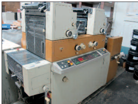
Ryobi/Itek 2-Color Printing Press, Model 3985