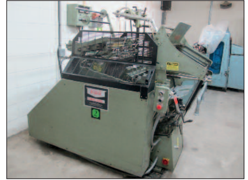
Kluge Die Cutter Model EHD14x22