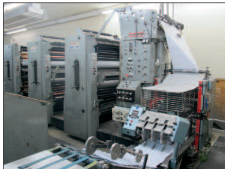
King Web Book Press, Model F11A