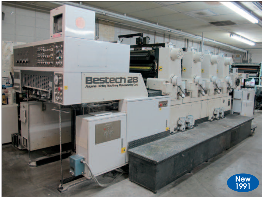
Akiyama 4-Color Sheet Fed Printing Press Model Bestech 428