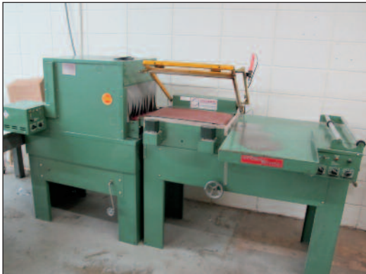
Sergeant L-Seal Packaging Machine