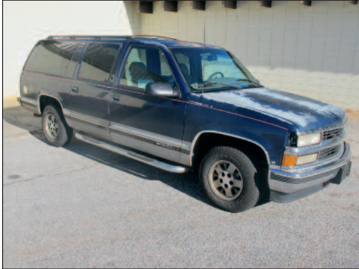
Chevy Suburban SUV