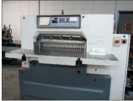
Sneider Senator 30" Paper Cutter Model 76SC