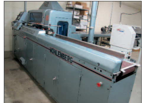
Wohlenberg / Lawson 3-Knife Trimmer Model Rapid Trimmer