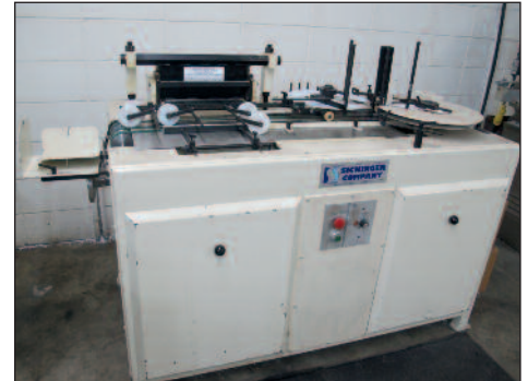
GBC Sickinger Universal Speed Punch Model USP13