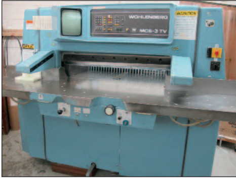
Wohlenberg 36" Paper Cutter Model 92