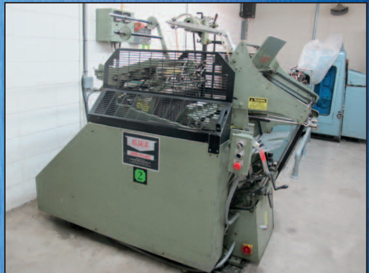
Kluge Die Cutter Model EHD14x22