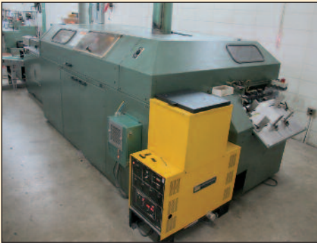
Muller Martini Perfect Binder Model Panda w/Zenith Trimmer and Uno Stacker