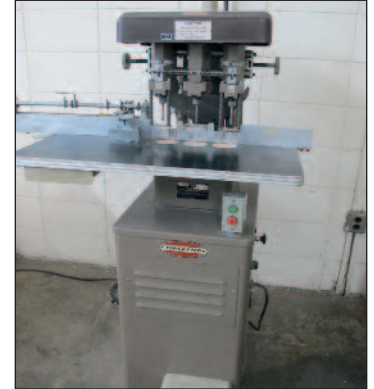
Challenge Paper Drill, Model EH-3A