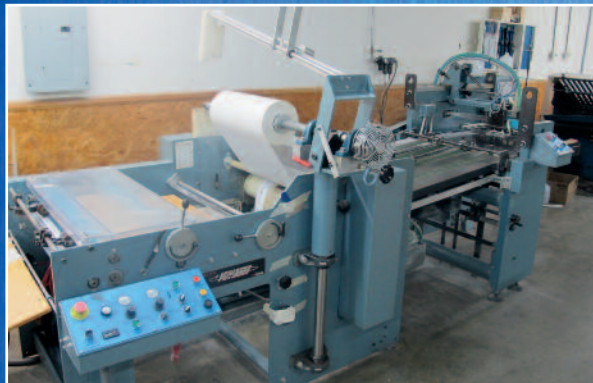
GBC Laminator Model Voyager 3200

SALE DATE: THURSDAY, FEBRUARY 11, 1:00 PM (ET) INSPECTION DATE: TUESDAY, FEBRUARY 16, 9 AM TO 4 PM (LOCAL TIME)