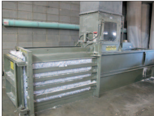
Balemaster Horizontal Baler Model HCC-20