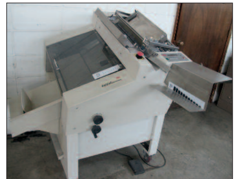
GBC Sickinger Color Coil Inserter Model DigiCoil

FIRST LOT CLOSSES: WEDNESDAY, FEBRUARY 17, 1:00 PM (ET)