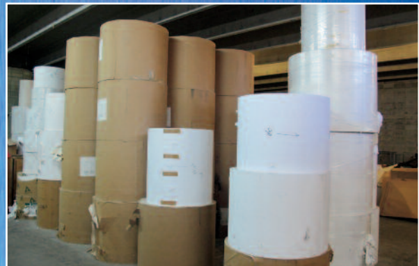
Paper Inventory - Roll Stock