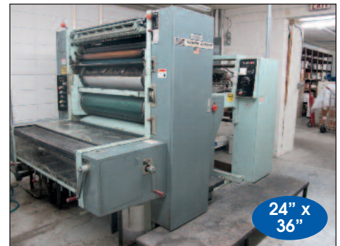
Harris 1-Color Web Press Model L136B