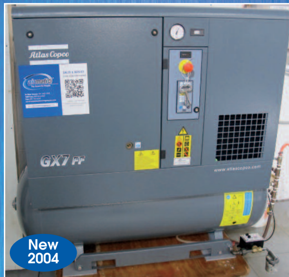
Atlas Copco 10 HP Rotary Screw Air Compressor Model GX7FF-EL

INSPECTION DATE: WEDNESDAY, FEBRUARY 10, 9 AM TO 4 PM (LOCAL TIME)