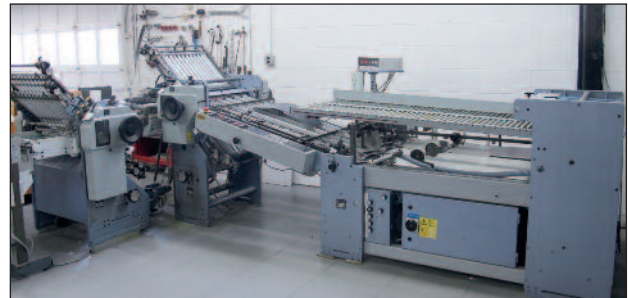
Stahl Folder Model TF66