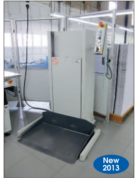
Polar Mohr Paper Lift Mode LW450-2-IFT