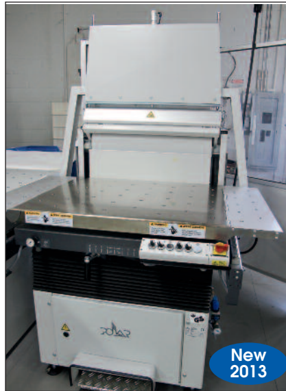
Polar Mohr Paper Jogger Model RA-2