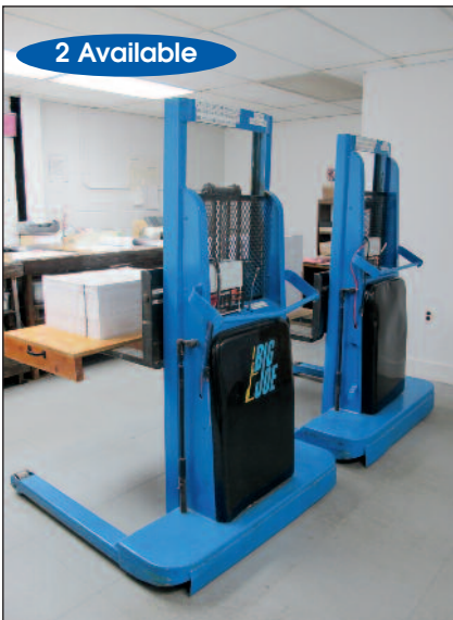
Big Joe Electric Lift Trucks