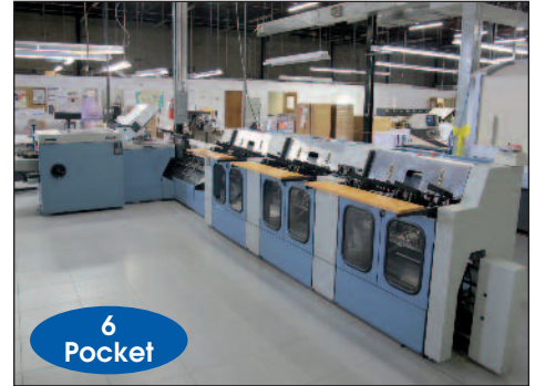
Stahl Omega Saddle Stitcher