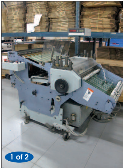
Stahl Delivery Stacker Model VSA66.1