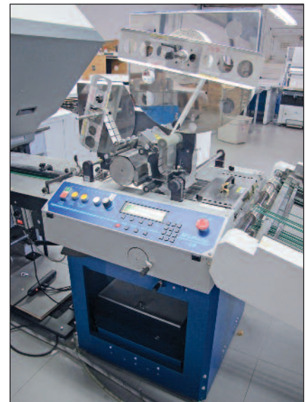
Rena Systems Tabber Model XPS-ProTab 4.0