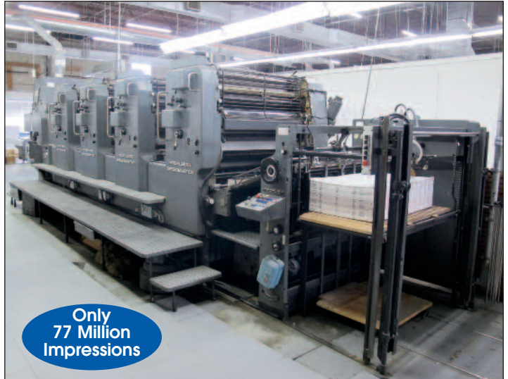
HEIDELBERG PRINTING PRESS MODEL HD102VP