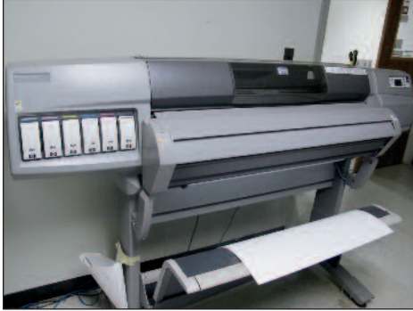
HP Design Jet 5500 Double Sided Proofer, w/Spinjet