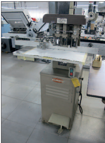
Challenge 3 Spindle Paper Drill Model EH3A