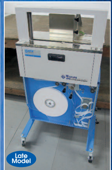
Wexler Automatic Banding Machine Model ATS-MS330-20