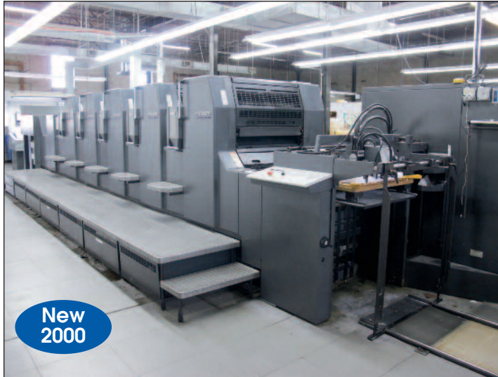
HEIDELBERG HYBRID DI/CONVENTIONAL PRINTING PRESS MODEL SM74-5-P3+L-DI