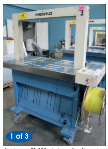
Akebono TS-250 Automatic Stapping Machine