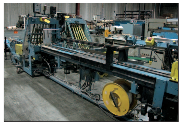
Penn Graphics PGE 200 Horizontal Log Stacker