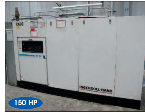
Ingersoll Rand 150 HP Air Compressor Model SSR-