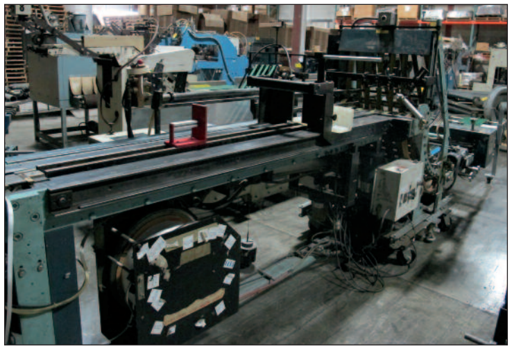
SMC V1000 Horizontal Log Stacker