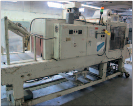
Amsler Shrinkwrap Tunnel