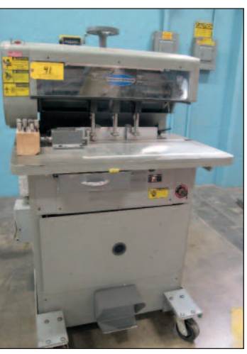
Challenge Paper Drilling Machine Model MS-10A