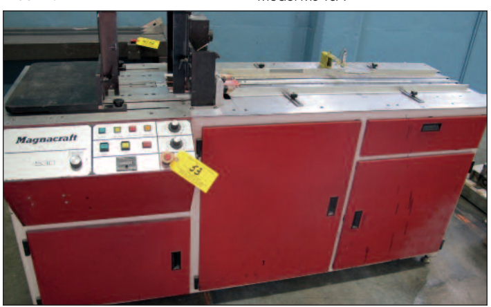
Magnacraft 6' Ink Jet Base Model 540