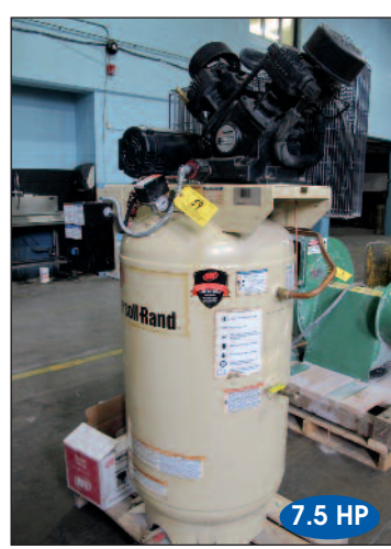
Ingersoll Rand Compressor Model TS/ON