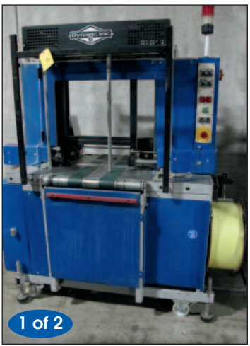
Dynaric Strapper Model NP-1500