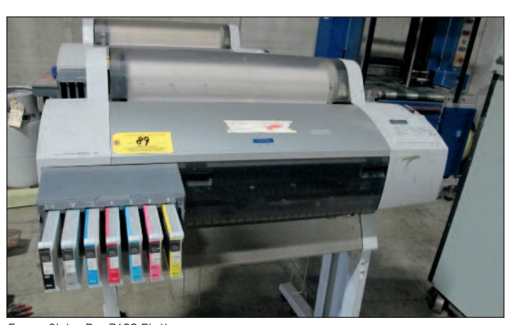
Epson Stylus Pro 7600 Plotter