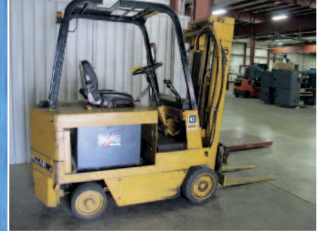
Caterpillar Electric Fork Truck Model M50B