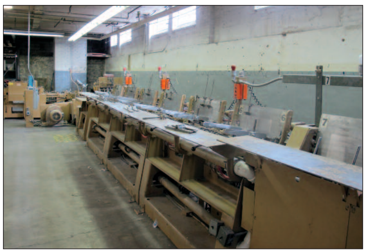
McCain 1800XL Saddle Stitcher