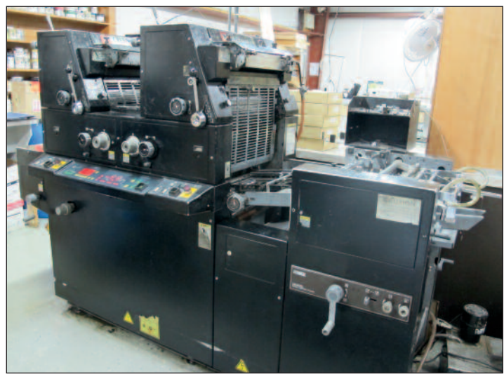
AM Multigraphics Offset Duplicator Model 1250