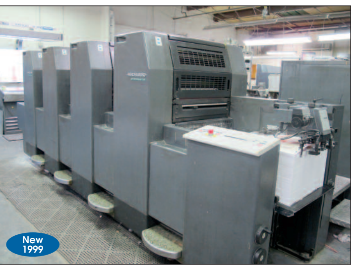
Heidelberg 4/C Printing Press Model SM52-4