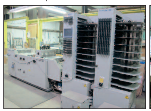
Standard Horizon Bookiet Maker #SPF-20 Stitcher Folder