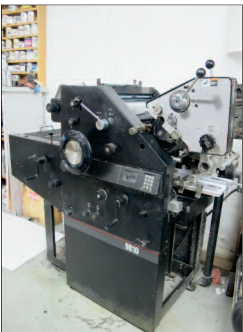
AB Dick Offset Duplicator Model 9810