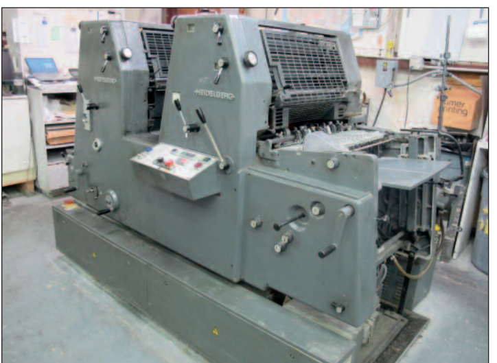
Heidelberg 2/C Printing Press Model GTOZ5252