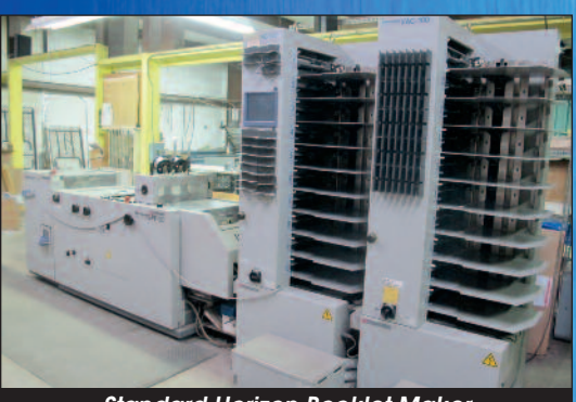
Standard Horizon Booklet Maker #SPF-20 Stitcher Folder