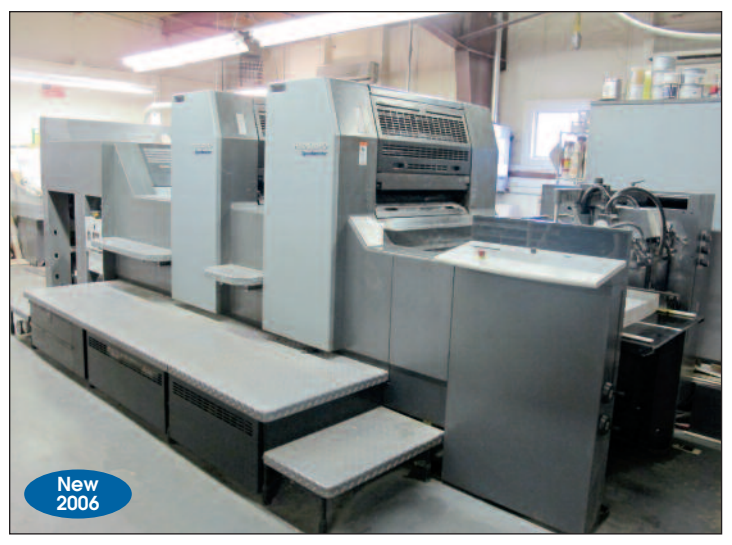
Heidelberg 2/C Fed Printing Press Model SM74-2-P-H