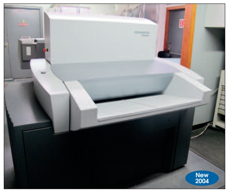
Heidelberg Prosetter CTP System Model 2165