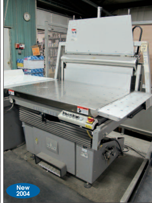
Polar Mohr Paper Jogger Model RA4