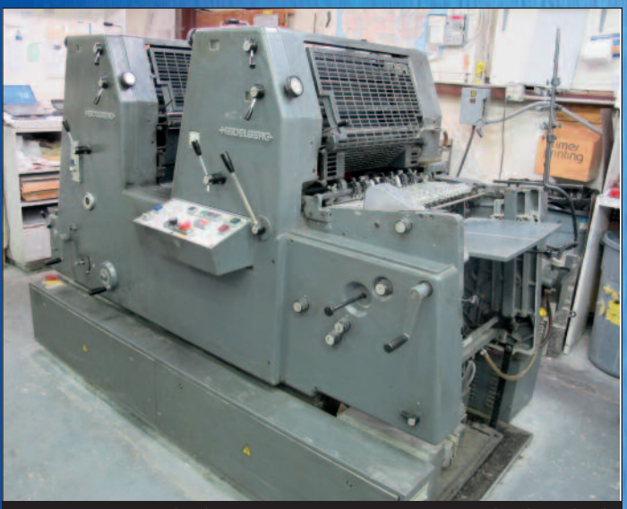
Heidelberg 2/C Printing Press Model GTOZ5252

SALE DATE: THURSDAY, MAY 5, 2016, 1:00 PM (ET) OPEN HOUSE INSPECTION: WEDNESDAY, MAY 4, 9 AM TO 4 PM (LOCAL TIME)