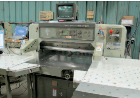
Standard Horizon Booklet Maker #SPF-20 Stitcher Polar Mohr Paper Cutter Model 92-EMC-MON