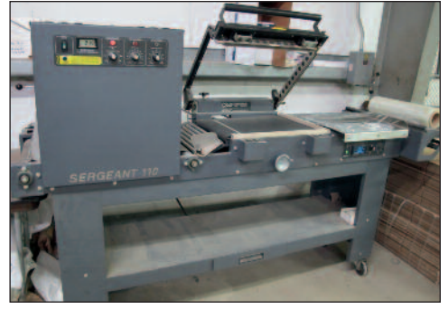
Sergeant L-Seal Packaging Machine Model 110