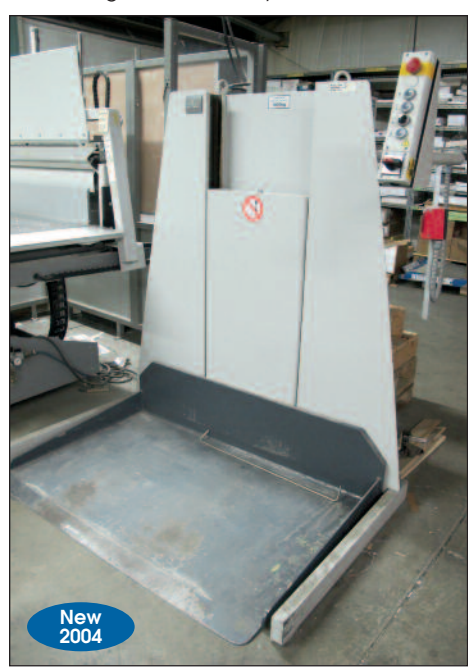
Polar Mohr Paper Lift Model LW1000-4

Plant Support Including: Martin Yale Paper Jogger, Central Pneumatic 2.5 HP Portable Air Compressor, (3) Paddy Wagon Carts, (4) Wire-O Bench Top Punch/Binders, Pallet Jacks, Bindery Carts, Metro Racks, Strapping Carts, Work Benches, HP Design Jet 5500 Proofer, etc.