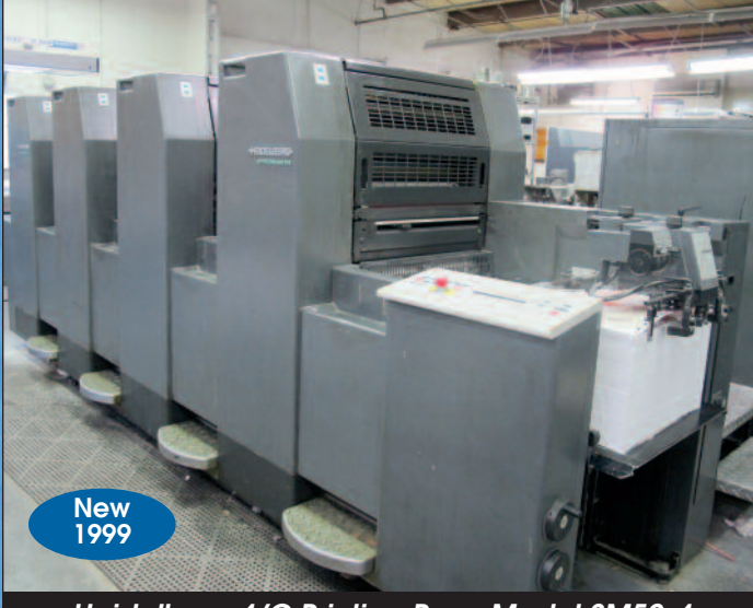
Heidelberg 4/C Printing Press Model SM52-4

SALE DATE: THURSDAY, MAY 5, 2016, 1:00 PM (ET) OPEN HOUSE INSPECTION: WEDNESDAY, MAY 4, 9 AM TO 4 PM (LOCAL TIME)