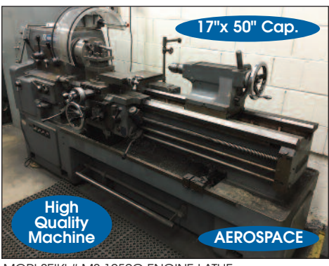
MORI-SEIKI # MS-1250G ENGINE LATHE