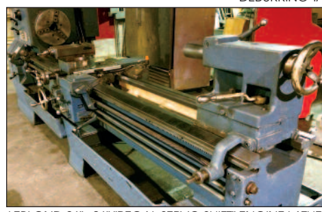
LEBLOND 26"x 96" "REGAL SERVO SHIFT" ENGINE LATHE