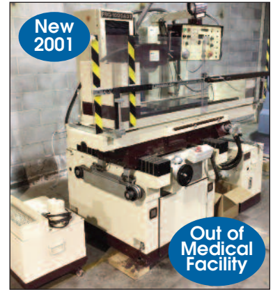
CHEVELIER # FSG-1020AD-II Hyd. Surface Grinder