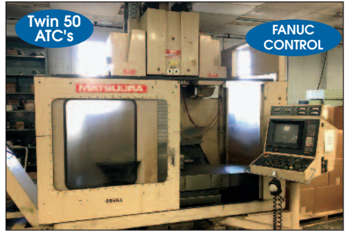
MATSUURA # MC-800-VDC "TWIN SPINDLE" CNC VMC