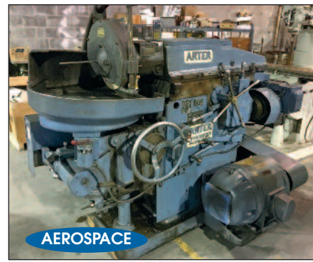
ARTER # A-12 ROTARY SURFACE GRINDER