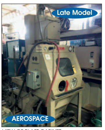
VIEW OF BLAST CABINET