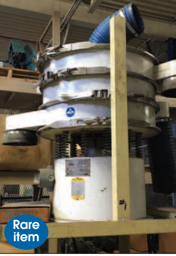
SWECO VIBRATORY ENERGY SEPERATOR