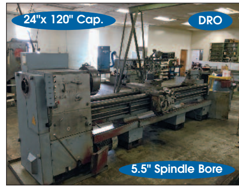
TOOLMEX # TUR-63A ENGINE LATHE