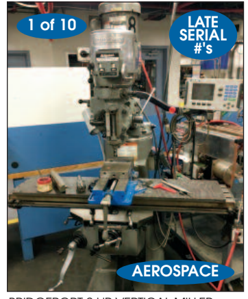
BRIDGEPORT 2 HP VERTICAL MILLER