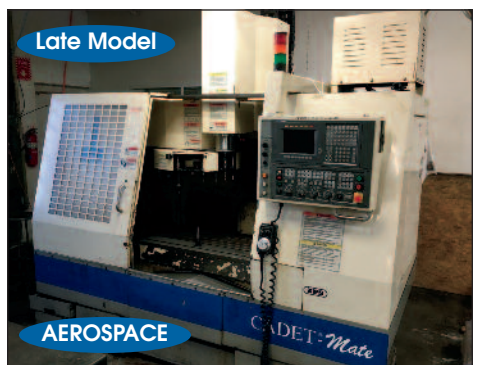
OKUMA # CADET-MATE CNC VMC