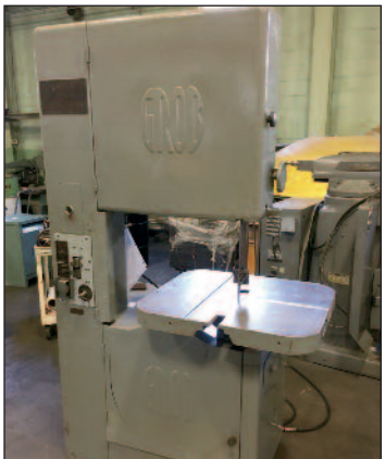
GROB # NS-24 VERTICAL BANDSAW w/Welder