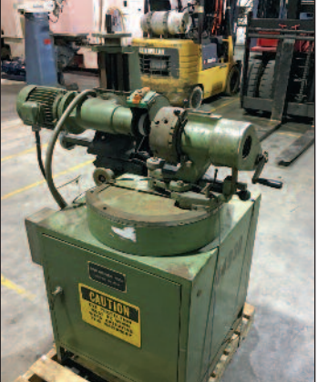
RUSH # 250-A "AUTOMATIC" DRILL GRINDER