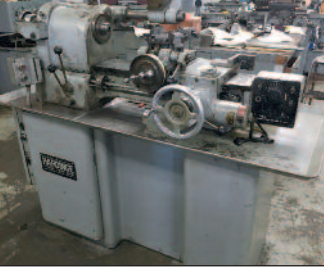
HARDINGE # HCT HAND CHUCKER