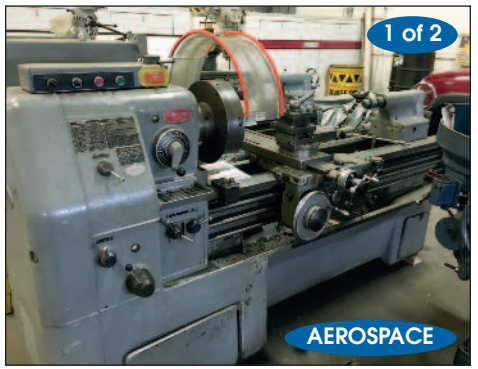
OKUMA # LS 21"x 54" ENGINE LATHE