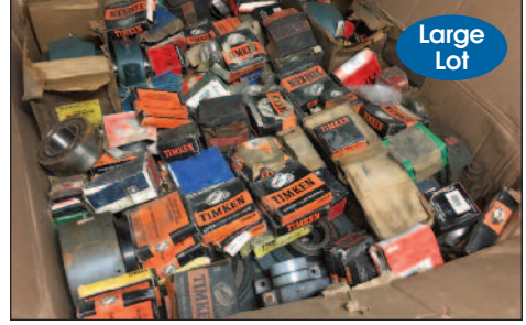
VIEW of BEARINGS & PILLOW BLOCKS