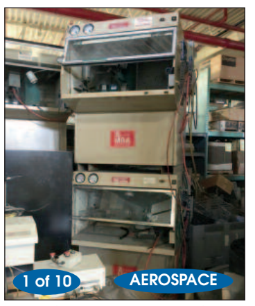
MBA "DOWN DRAFT" De-Burring & Blending BENCH