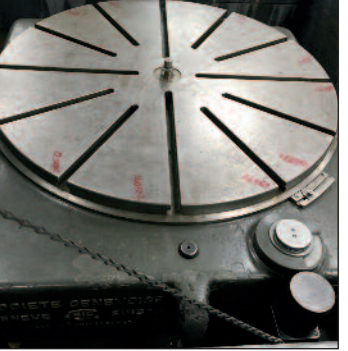
SIP 31" PRECISION ROTARY TABLE