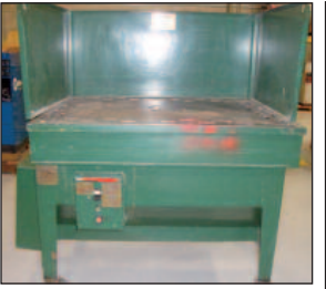
DENRAY # 3646-G DOWNDRAFT DEBURRING TABLE