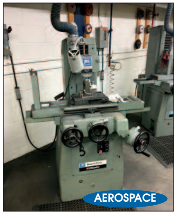
BROWN & SHARPE # 612 "Master" Surface Grinder