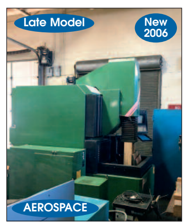
SODICK # AQ-55L CNC "SINKER TYPE EDM"