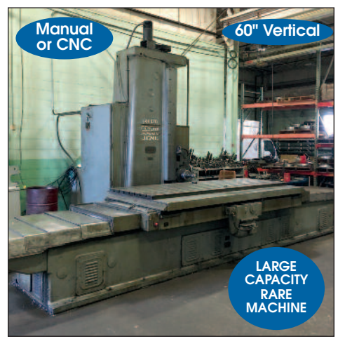
DeVlieg # 4K-120 "JIG-MILL"