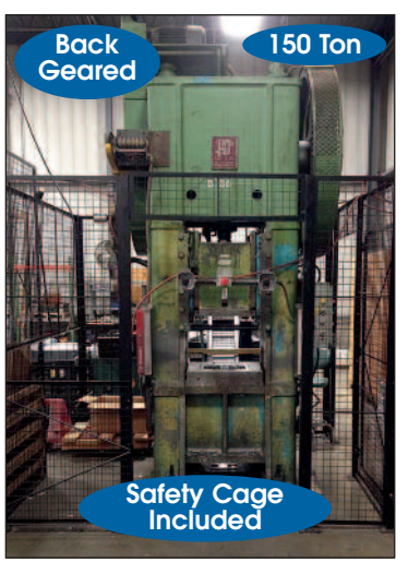
L & J # 150-1-24 STRAIGHT SIDE PRESS