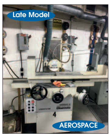
OKAMOTO # LINEAR 6-18-B SURFACE GRINDER