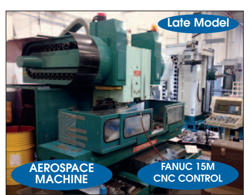
MATSUURA # MC-1000-VDC "Twin Spindle" CNC VMC