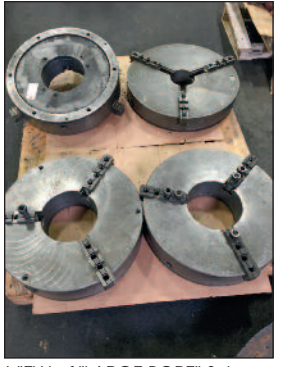
VIEW of "LARGE BORE" 3-Jaw Chucks