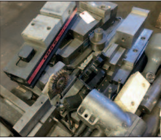
VIEW OF TOOLING AVAILABLE