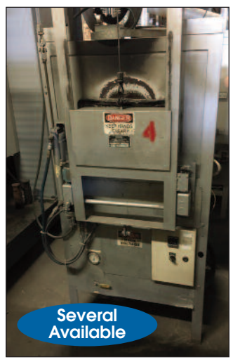
VIEW of FURNACE