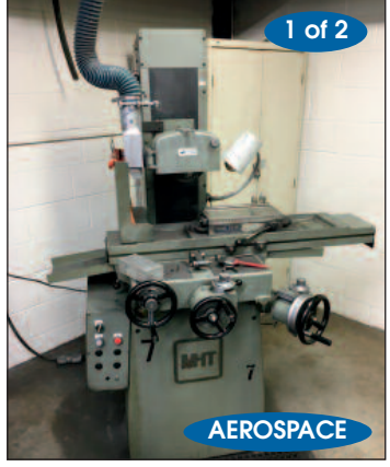
MITSUI-SEIKI 6"X 12" PRECISION SURFACE GRINDER