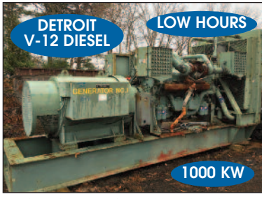
KATO ENGINEERING # 1000-EX-9E POWER GENERATOR