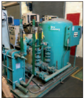
DRY COOLERS, INC. "CLOSED LOOP COOLING UNIT"