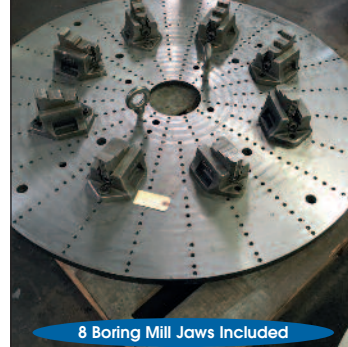
VIEW OF FIXTURE PLATES AVAILABLE