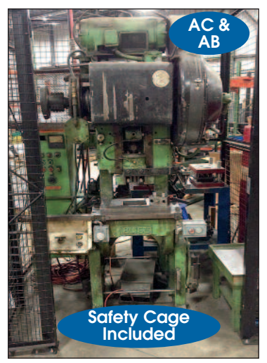
BLISS OBI PRESS # CH-22