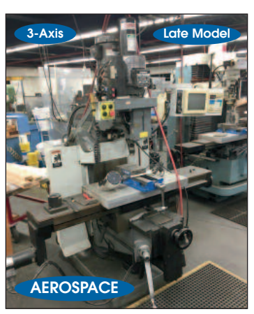
BRIDGEPORT # EZ-TRAK CNC VERTICAL MILLER