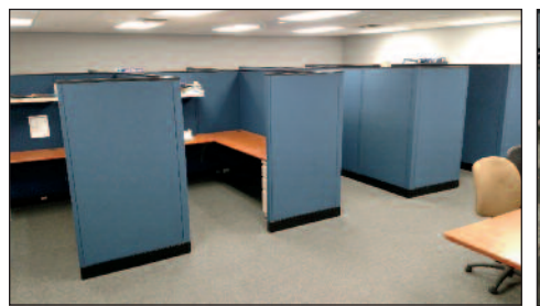
View of Office Dividers