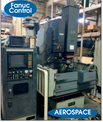
ELOX CNC "SINKER TYPE EDM"