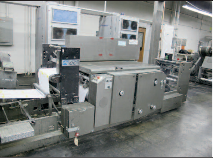
Sanden 10 Color Printing Press Model Express 10-CG15020T