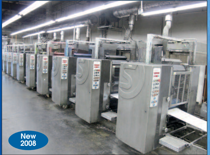
Sanden 10/C Printing Press Model Express 10-CG15020T

249 Gay Street, Manchester, New Hampshire 03103