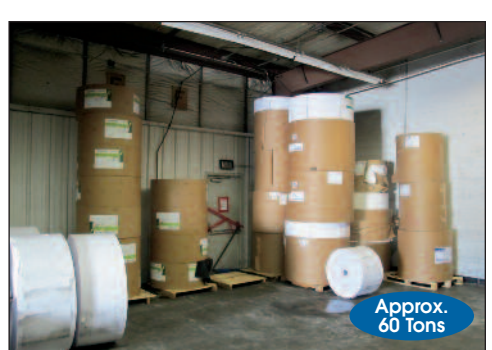
View of Paper Inventory