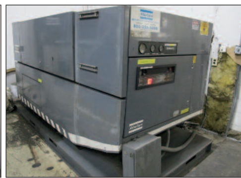
Atlas Copco 125 HP Air Compressor ZT245-125