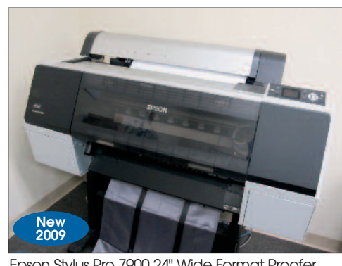
Epson Stylus Pro 7900 24" Wide Format Proofer