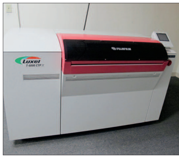
Fuji Film/Dainippon Screen CTP System III Dart Luxel T6000