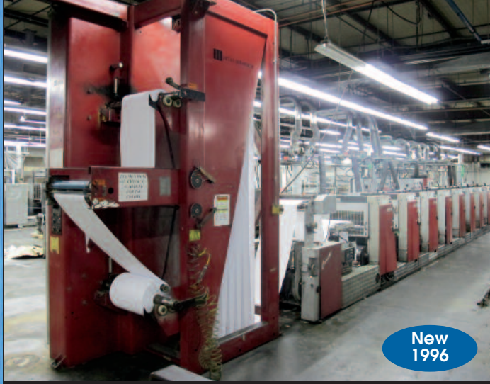
Muller Martini Printing Press # 2304 Concept Press

SALE DATE: THURSDAY, MAY 12, 2016, 1:00 PM (ET) OPEN HOUSE INSPECTION: WEDNESDAY, MAY 11, 9 AM TO 4 PM (LOCAL TIME)