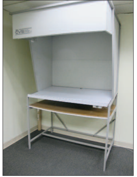
GTI Color View Station