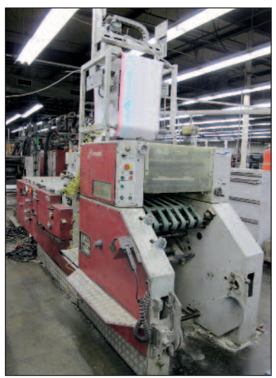
Muller Martini Printing Press Model 2304 Concept Press