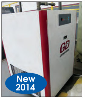
GARDNER DENVER HYSTER 1 COMPRESSED AIR DRYER $120XL2 MODEL RNC300A4