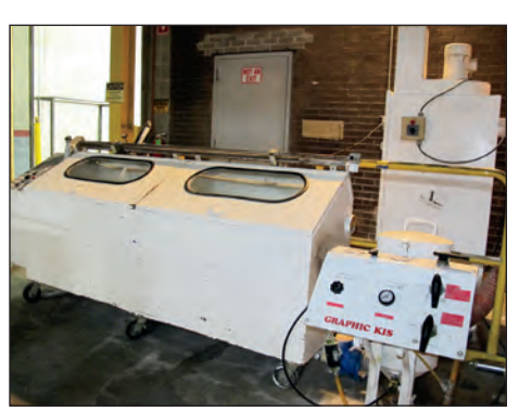
GRAPHICS ROLL CLEANING SYSTEM MODEL KIS