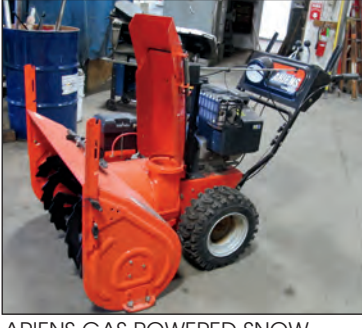
ARIENS GAS POWERED SNOW BLOWER #1336PRO