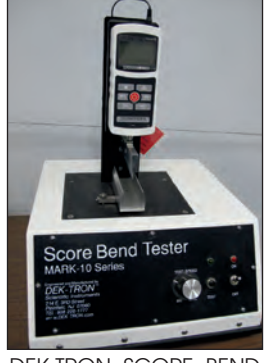
DEK-TRON SCORE BEND TESTER MODEL MARK-10