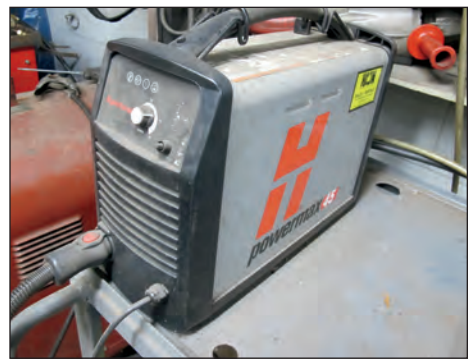
HYPERTHERM PLASMA CUTTER #POWERMAX45