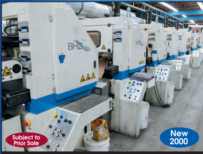
BHS 7-Color Flexographic Printing Press, 40" Web Width, 500 FPM

SALE DATE: WEDNESDAY, JUNE 15, 1:00 PM (ET) OPEN HOUSE INSPECTION: MON & TUES, JUNE 13 & 14, 9 AM TO 4 PM (LOCAL TIME)