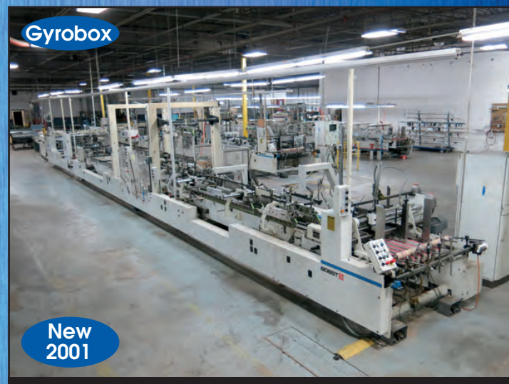
Bobst Folder/Gluer Model Alpina 110 MOT/G3, 4/6 Corner, Bottom Lock