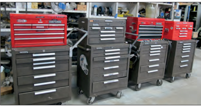
(6+) PORTABLE TOOL CABINETS