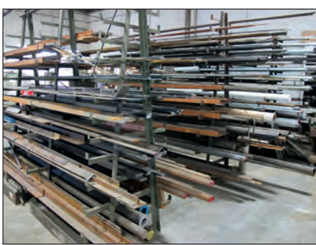
VIEW OF RAW MATERIALS