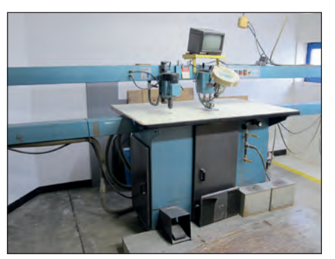
SANDVIK 12' STEEL RULE DIE SAW AND DRILL