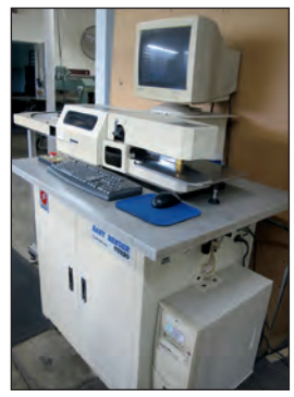
SEOUL LASER DIEBOARD STEEL RULE BENDER #EASY BENDER TURBO