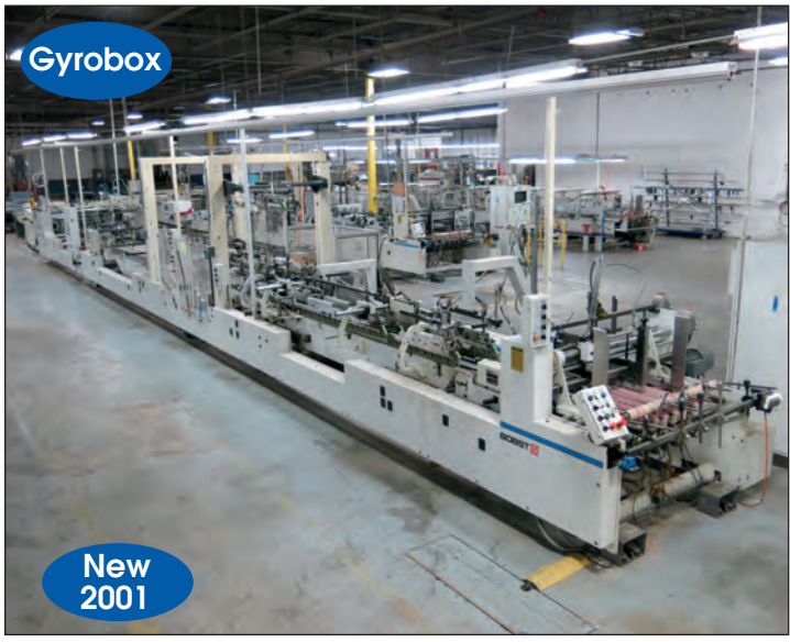
BOBST FOLDER/GLUER MODEL ALPINA 110 MOT/G3, 4/6 CORNER, BOTTOM LOCK