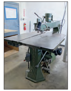
RICHARDS 48" SUPER DIEMASTER SAW