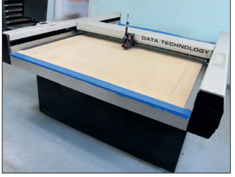
DATA TECHNOLOGY CNC SAMPLE CUTTING TABLE MODEL DPS6648