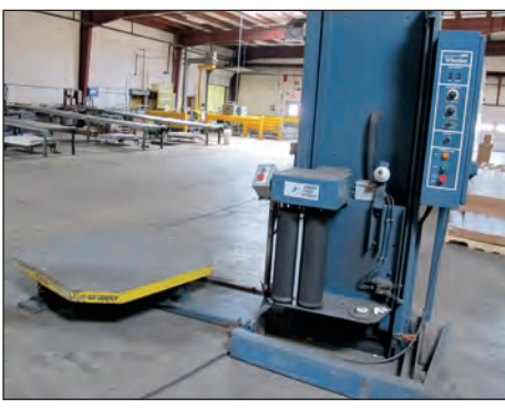
LANTECH STRETCH PALLET WRAPPER MODEL SVGSS06501601