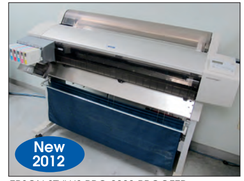
EPSON STYLUS PRO 9900 PROOFER