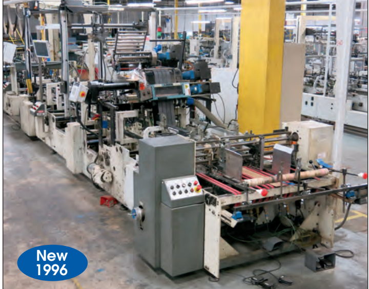
BOBST FOLDER/GLUER MODEL DOMINO 110-M II MATIC, 4/6 CORNER, BOTTOM LOCK