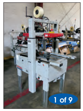
3M CASE SEALERS