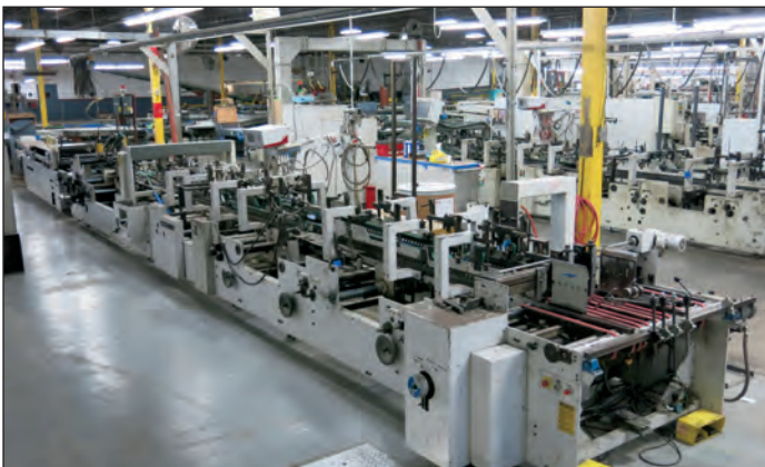
BOBST FOLDER/GLUER MODEL DOMINO 110-M