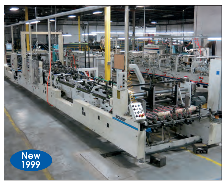
BOBST FOLDER/GLUER MODEL ALPINA 130 A3, 4/6 CORNER, BOTTOM LOCK