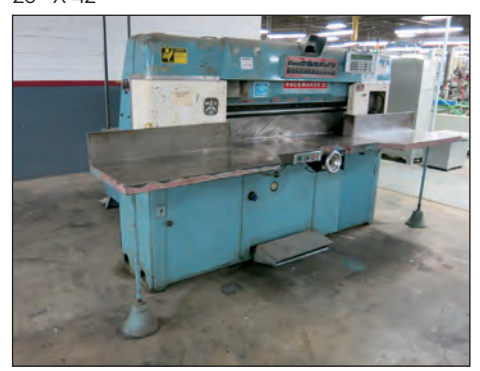
LAWSON 52" PAPER CUTTER MODEL PACEMAKER II