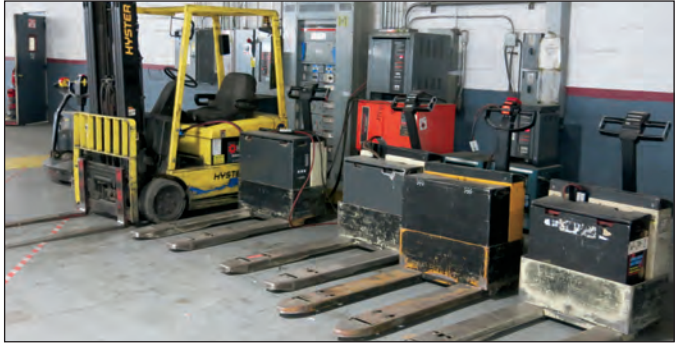
VIEW OF ELECTRIC PALLET JACKS