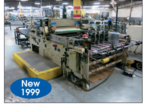
HEIBER & SCHRODER 2-LANE WINDOW MACHINE

International Folder/Gluer Model FZ Swifty, 39 1/2" W Right Angle Folding Carton Folder/Gluer S/N FZ-285 w/ Model FZK Feeder Unit, Mactron Sureglue Programmable Gluing System, Reliance Electric VS Drive System