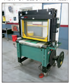
SIGNODE STRAPPER MODEL HBX4330