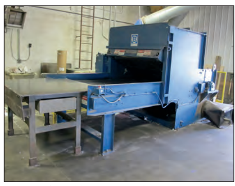
BALEMASTER 30 HP PAPER SHREDDER