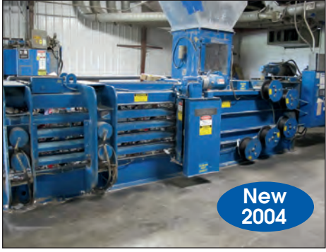
BALEMASTER HYDRAULIC AUTOMATIC BALER #4030