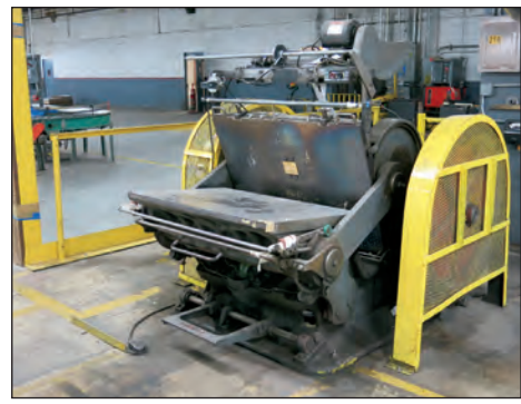
THOMPSON NATIONAL DIE CUTTER STYLE 6, 28" X 42"