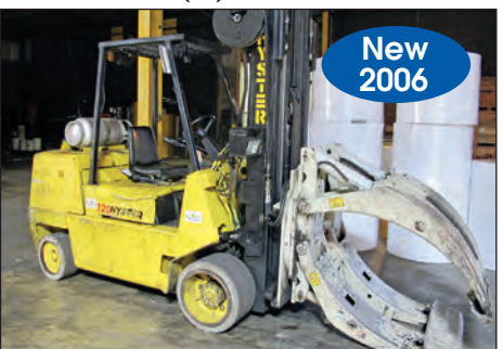
HYSTER 12,000 LB LPG FORKLIFT MODEL $120XL2