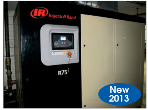
INGERSOLL RAND 125 HP ROTARY SCREW COMPRESSOR # R75I-A125