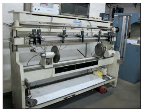
JM HEAFORD 62" FLEXO PLATE MOUNTER PROOFER #WW COBRA