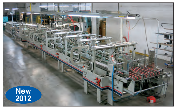
OMEGA FOLDER/GLUER MODEL ALLPRO 110