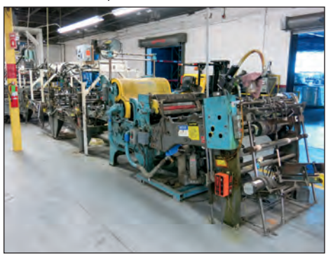
INTERNATIONAL FOLDER/GLUER # FZ SWIFTY, 35.5"