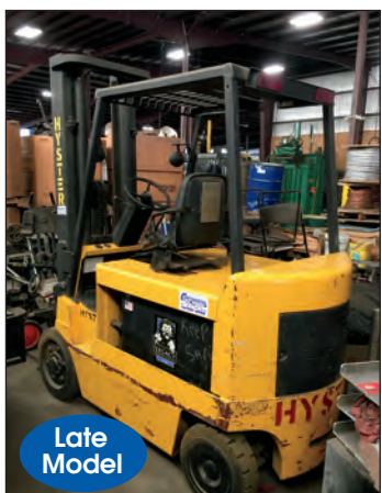
HYSTER # E70-XL ELECTRIC FORKLIFT W/ # 8,000 LB. CAP.