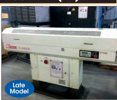
FEDEK "WARRIOR" COMPACT CNC BAR-FEED UNIT