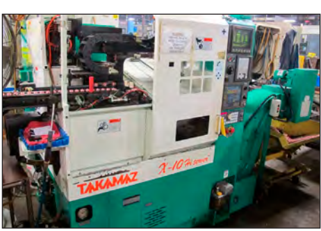
TAKAMAZ # "X-10 HI-SERVER" CNC LATHE

KIA FANUC 1 of 5 Control KIA # KIT-30A CNC TURNING CENTER