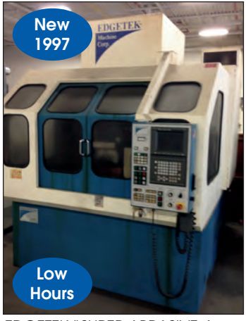
EDGETEK "SUPER ABRASIVE 4-AXIS" CNC GRINDER