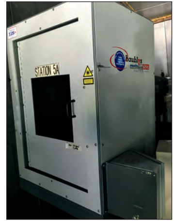
BAUBLYS CONTROL LASER