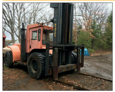
HYSTER #H-400-B DIESEL FORKLIFT TRUCK W/ # 48,000 LB. CAP.