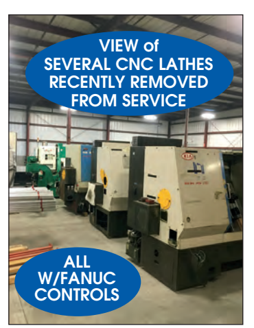
KIA CNC TURNING CENTERS