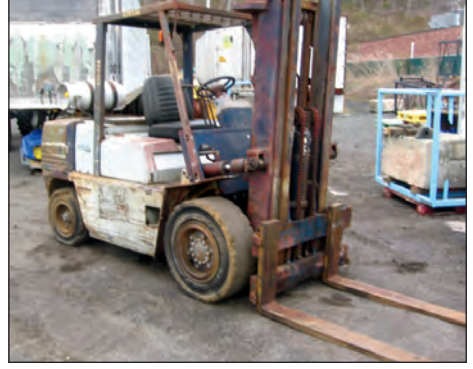
KOMATSU # FG-45T-6 W/ # 9,000 LB. CAP.

LARGE SELECTION OF PLANT SUPPORT, TOOLING, INSPECTION EQUIPMENT & MUCH MORE!!