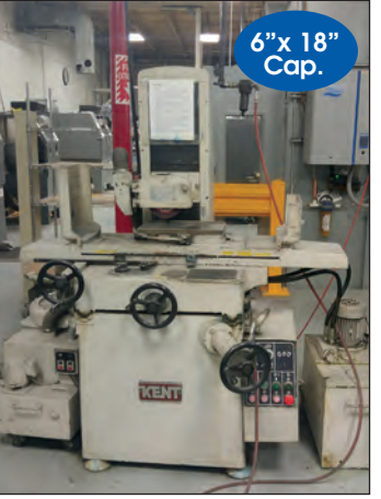
KENT # KGS-250-AH "HYDRAULIC" SURFACE GRINDER