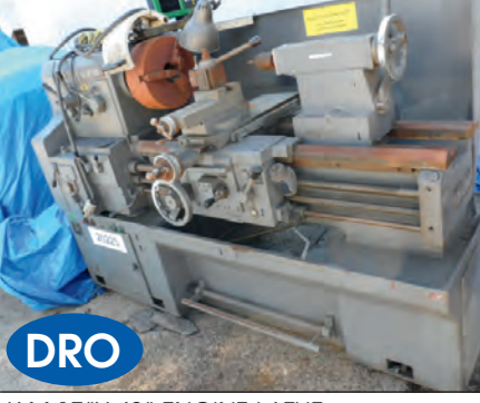
YAM 17"X 40" ENGINE LATHE