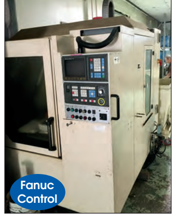
TRAUB CNC VERTICAL MACHINING CENTER