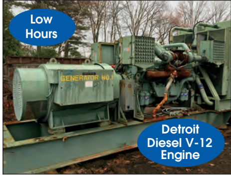
KATO ENGINEERING 1000KW POWER GENERATOR