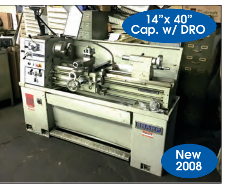
SHARP #14-40F TOOLROOM LATHE