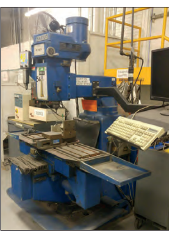
SAEILO # SNV-3 CNC VERTICAL MILLING MACHINE