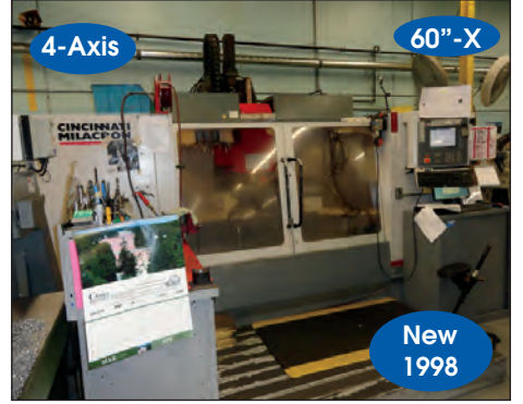
CINCINNATI # ARROW-1500 CNC "4-AXIS" VERTICAL MACHINING CENTER

HAAS # VF-3 CNC VERTICAL MACHINING CENTER