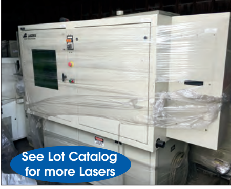
AB LASER MARKING SYSTEM