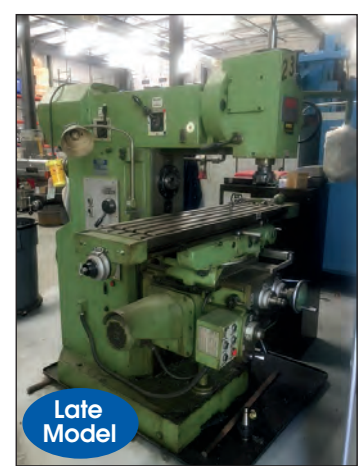
TOOLMEX # FWD-32J "UNIVERSAL" HORIZONTAL-VERTICAL MILLER