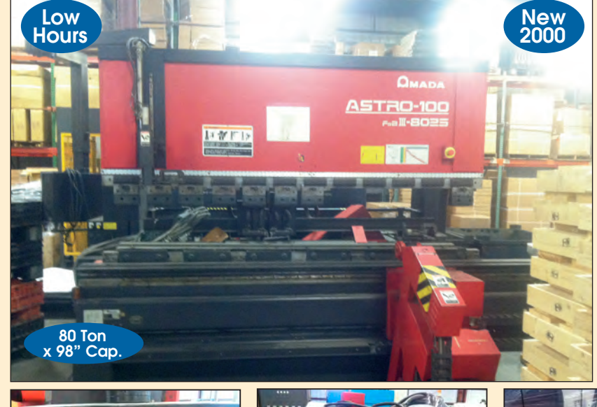
AMADA # ASTRO-FAB-III-8025 CNC Press Brake