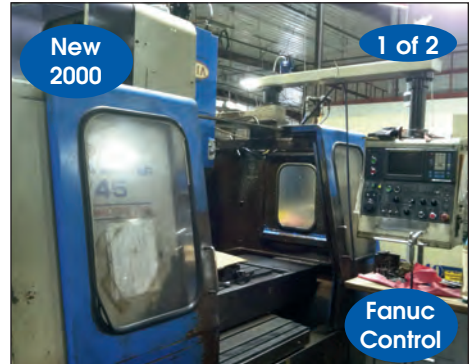
KIA # KV-45 CNC VERTICAL MACHINING CENTER