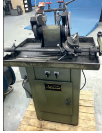
NOMURA DOUBLE END "SWISS TYPE" CARBIDE TOOL GRINDER