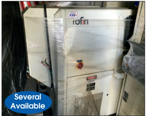
ROFIN LASER MARKING SYSTEM