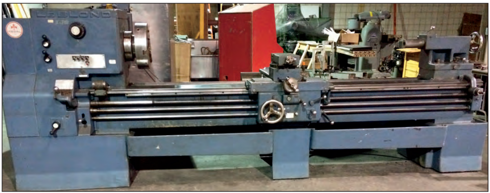
LEBLOND 26" X 96" "REGAL SERVO SHIFT" ENGINE LATHE