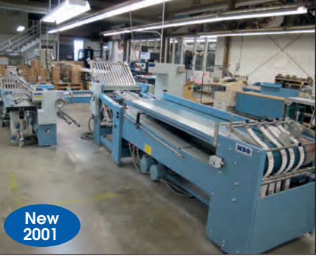
MBO FOLDER MODEL B26-S/444