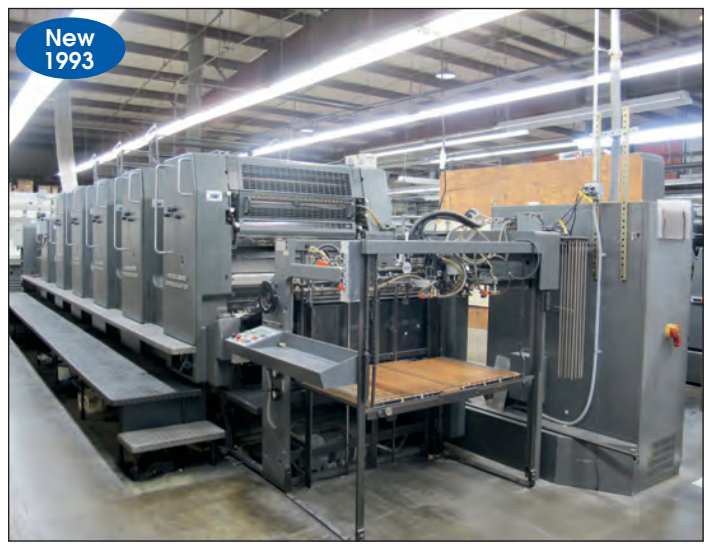
HEIDELBERG 5-COLOR SHEET FED PRINTING PRESS MODEL SM-102FP