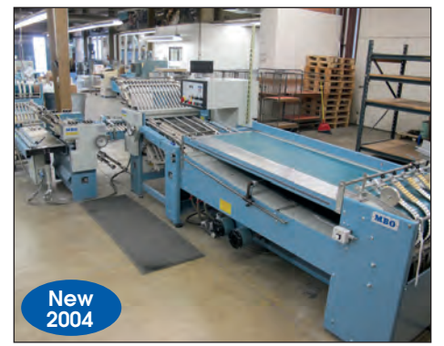
MBO FOLDER MODEL B-30-C/444