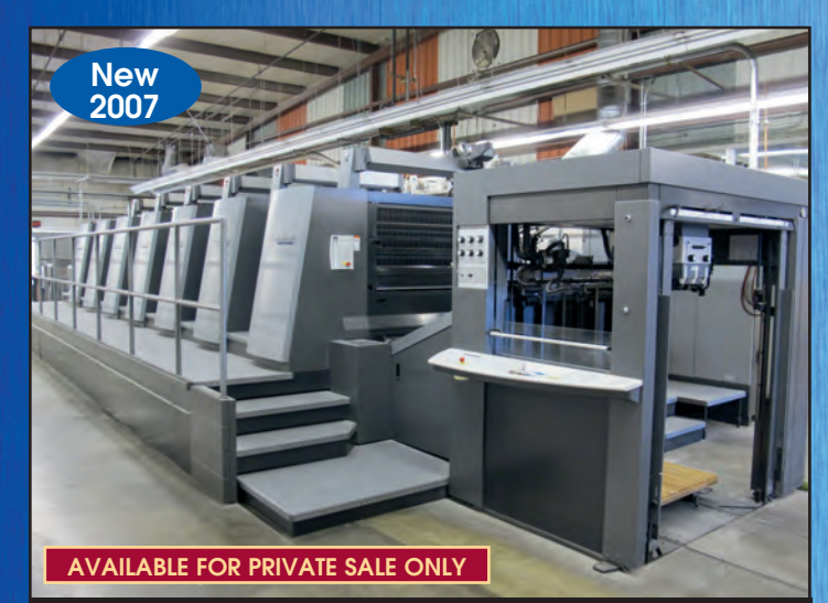
Heidelberg 6-Color Sheet Fed Printing Press Model XL-105

SALE DATE: THURSDAY, JULY 28, 1:00 PM (ET) INSPECTION: WEDNESDAY, JULY 27, 9 AM TO 4 PM (LOCAL TIME)