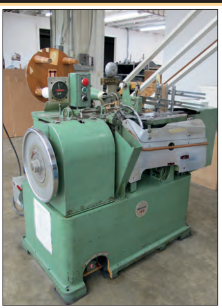
STRINGER KNOTTER MACHINE MODEL WHIRLWIND 185