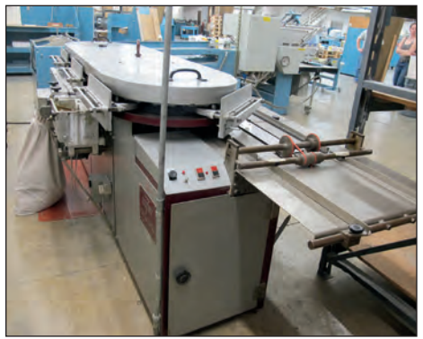
SULBY PERFECT BINDER MODEL 7