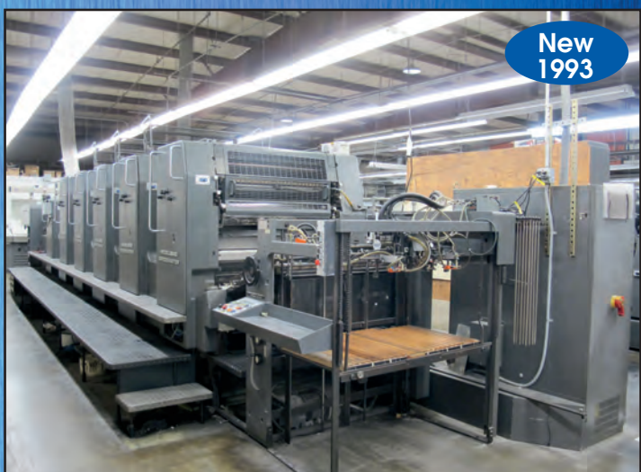
Heidelberg 5-Color Sheet Fed Printing Press Model SM-102FP