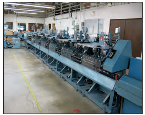
ITOH SADDLE STITCHER LINE MODEL SANNKOH