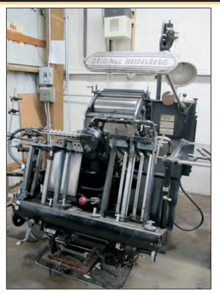
ORIGINAL HEIDELBERG WINDMILL PRESS