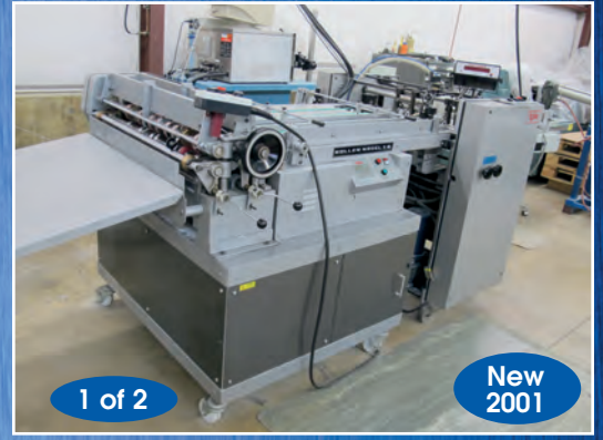
Rollem Scoring/Perforating Machines Model THDH