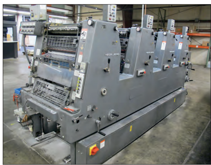
HEIDELBERG 4-COLOR SHEET FED PRINTING PRESS MODEL GTOVP-54