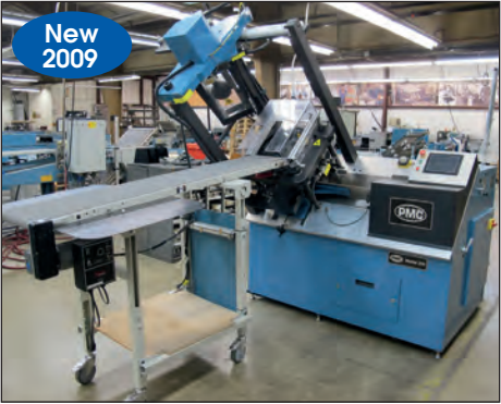
PMC DIE CUTTER MODEL 225CP-912

Challenge Jogger Model 2840A: S/N 1316 Kudo Jogger Model MJ-95