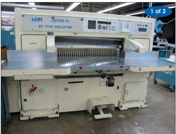
ITOH 45" PAPER CUTTER MODEL 115FC