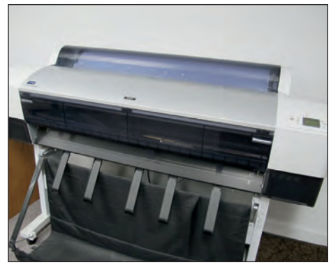
EPSON STYLUS PRO 9800 PROOFER