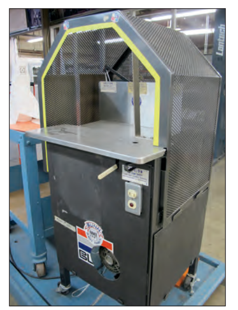
BUNN TYING MACHINE

SADDLE STITCHERS Itoh Saddle Stitcher Line Model