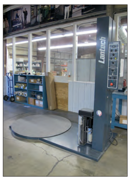
LANTECH ROTARY STRETCH PALLET WRAPPER, Q-SERIES

Pallet Jacks, Tape Dispensers, Digital Scales, Drill Presses, Double End Grinders, Power Tools, Densitometers, Racking, Label Printers, Storage Cabinets, Portable Carts, Computer Equipment, etc.