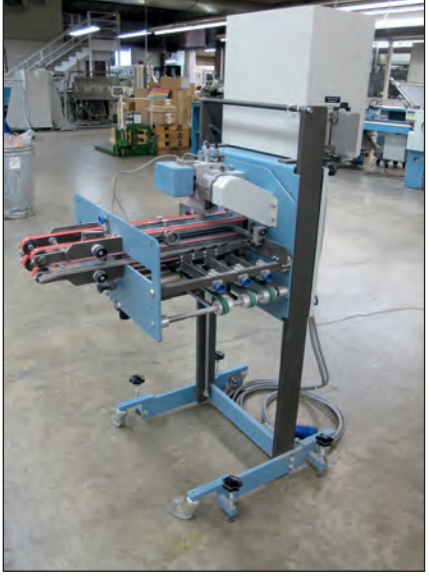
MBO AIR KNIFE FOLDER MODEL Z2

Epson Stylus Pro 9600 Proofer (New 2003) Epson Stylus Pro 9800 Proofer