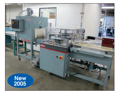
SHANKLIN L-SEAL PACKAGING MACHINE MODEL A-27A