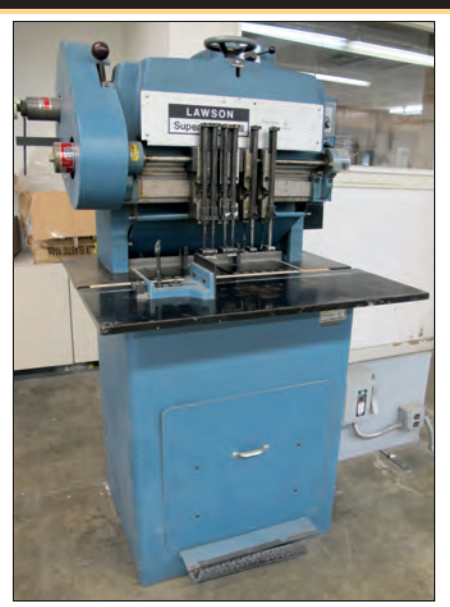
LAWSON PAPER DRILL, MODEL B, 5-SPINDLE