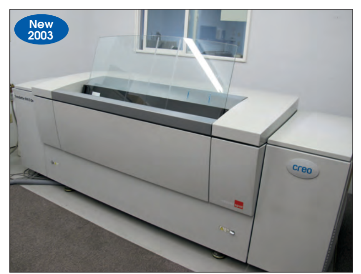
CREO CTP SYSTEM MODEL TRENDSETTER TS8, SQUARE SPOT