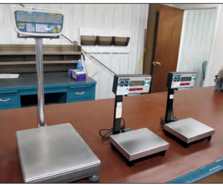
FLEX WEIGH DIGITAL WAREHOUSE PLATFORM SCALE