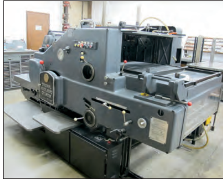
ORIGINAL HEIDELBERG SBD CYLINDER DIE CUTTER PRESS 25" X 35"

Stringer Knotter Machine Model Whirlwind 185