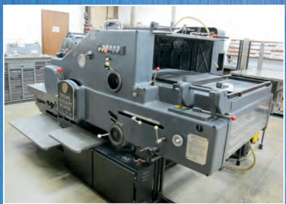
Original Heidelberg SBD Cylinder Die Cutter Press 25" x 35"