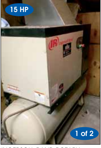
INGERSOLL-RAND ROTARY SCREW AIR COMPRESSOR