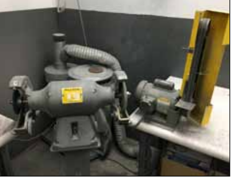
VIEW OF GRINDERS