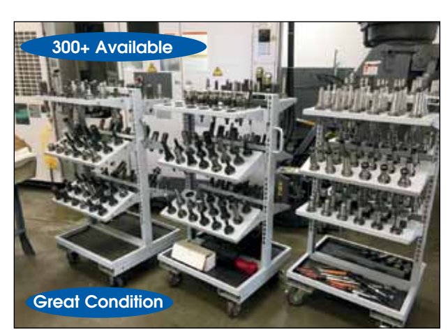
REGO-FIX" & "LYNDEX" # CAT-40 CNC TOOL HOLDERS

TRINCO # 42X24 Dry Blast Cabinet w/ Dust Collector, S/N 30319