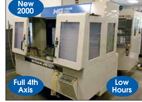
HITACHI-SEIKI # HG-400-II "4-AXIS" CNC HORIZONTAL MACHINING CENTER

(New 2014) DMG Mori-Seiki # NHX-4000 "4-Axis" CNC Horizontal Machining Center w/ (2) 15.75" x 15.75" Pallets, Travels: 22.04"-X,