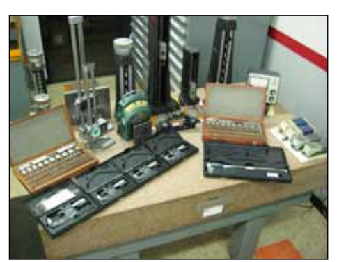
VIEW OF INSPECTION & GRANITE PLATE