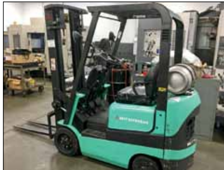
MITSUBISHI # FGC-15K FORKLIFT TRUCK W/ 3,000 LB. CAP.