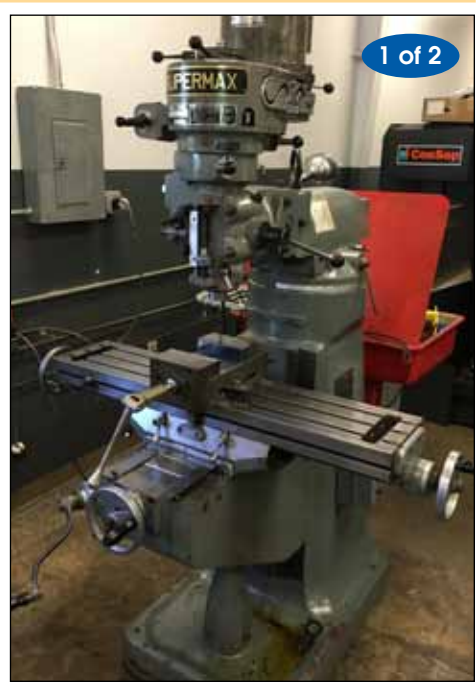
SUPERMAX VERTICAL MILLER