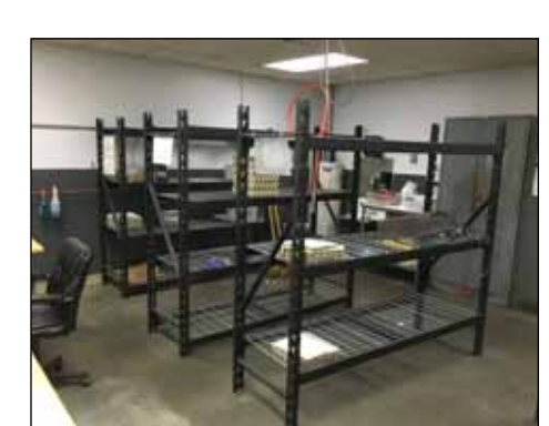
VIEW OF H.D. SHELVING