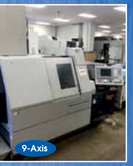
CITIZEN # M-32 CNC SWISS TYPE SCREW MACHINE

EUROTECH-ELITE # 710-SLLY "QUATTROFLEX" CNC "9-AXIS" TURNING CENTER