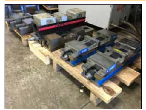
VIEW OF KURT & CHICK VISES