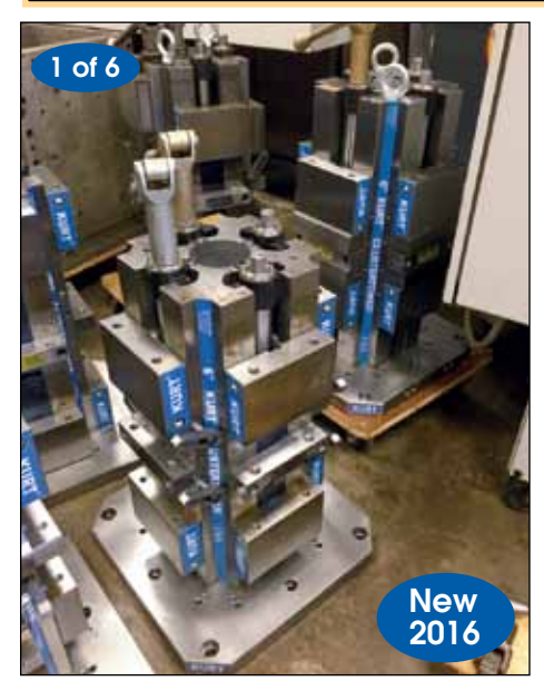
KURT "CLUSTER-TOWER" TOMBSTONES W/ VISES