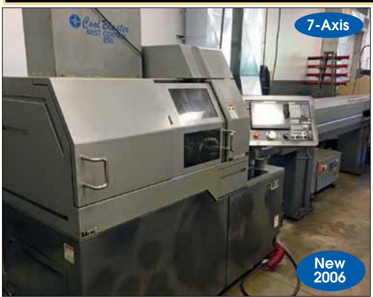
CITIZEN # L-20 CNC SWISS TYPE SCREW MACHINE