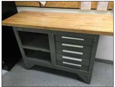
VIEW OF WOOD-TOP WORK BENCH

Baldor 1/2 HP # 500 Double End Precision Pedestal Grinder