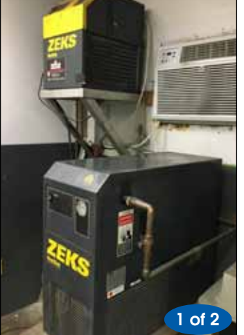
ZEKS AIR DRYERS