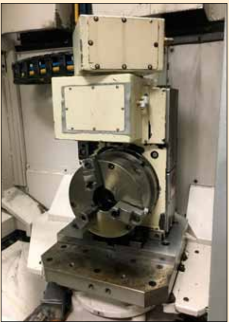
OKUMA # MA-400HA "5-AXIS" CNC HORIZONTAL MACHINING CENTER W/ TSUDAKOMA 5TH-AXIS ROTARY TABLES