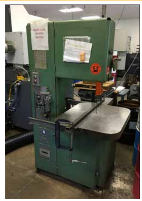
GROB VERTICAL BAND SAW