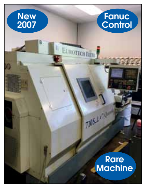
EUROTECH-ELITE # 710-SLLY "QUATTROFLEX" "9-AXIS" TURNING CENTER CNC