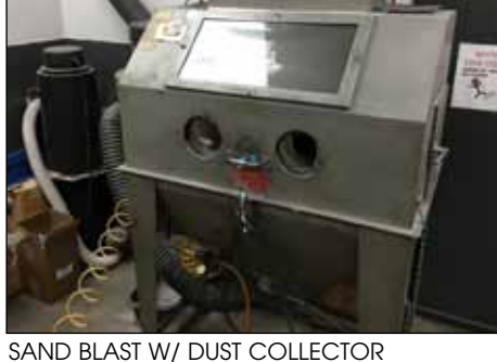
SAND BLAST W/ DUST COLLECTOR