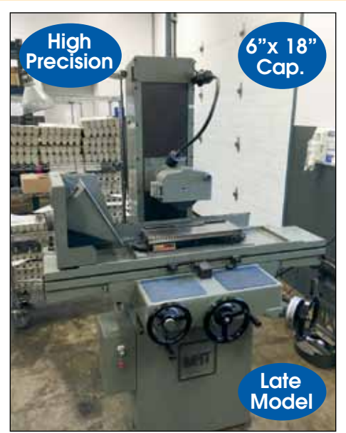
MHT-MITSUI # MSG-250MH SURFACE GRINDER