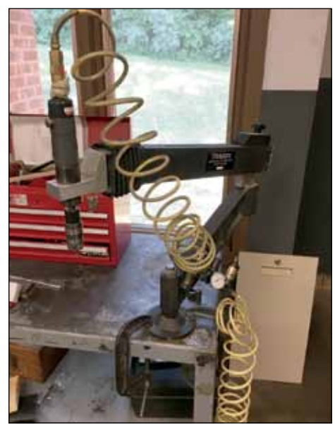
FLEX-ARM PNEUMATIC TAPPING UNIT