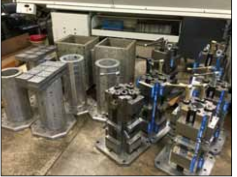
VIEW OF KURT & MID-STATE TOMBSTONES