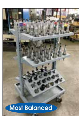
VIEW OF CNC TOOLHOLDERS