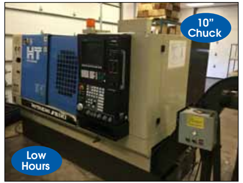
HITACHI-SEIKI # HTS-23S-III CNC TURNING CENTER