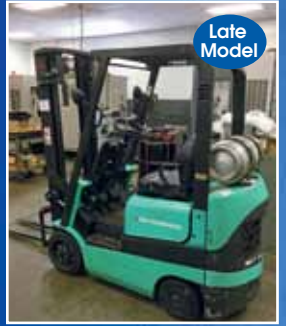
MITSUBISHI # FGC-15K FORKLIFT TRUCK W/ 3,000 LB. CAP.

By Order of : Mikco Manufacturing Tech. 14 Village Lane, Wallingford, Connecticut, USA SALE DATE: WEDNESDAY, JULY 20<sup>th</sup>, 10:30 AM (ET) INSPECTION: TUESDAY, JULY 19<sup>th</sup>, 9:00 - 4:00 (ET)