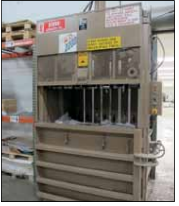
PIQUE VERTICAL HYDRAULIC BALER, SERIES 40