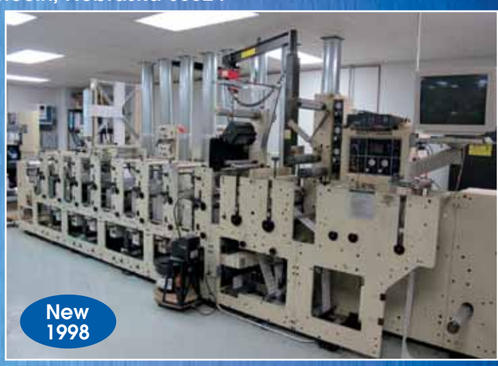
Mark Andy Flexo Printing Press Model 2200-13E