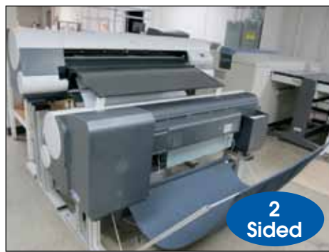
CANON IPF-815 IMPOSITION PROOFER