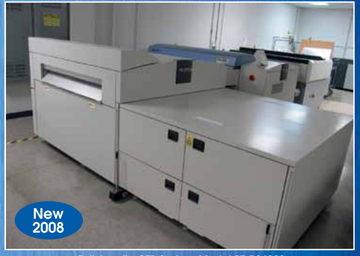
Fuji Javelin CTP System Model PT-R8600S

SALE DATE: Thursday, November 3, 1:00 PM (ET)