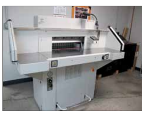
IDEAL PAPER CUTTER MODEL TRIUMPH 5551-06 EP