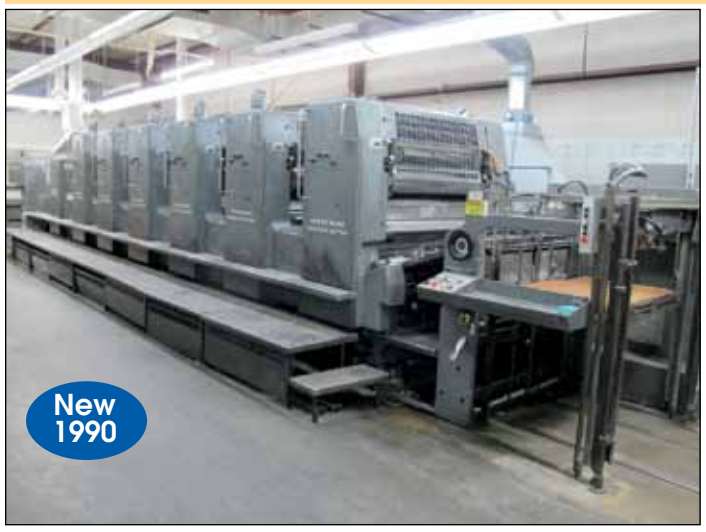
HEIDELBERG 6-COLOR SHEET FED PRINTING PRESS MODEL SM102-S+L