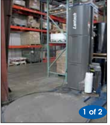
LANTECH ROTARY STRETCH PALLET WRAPPER, Q-SERIES