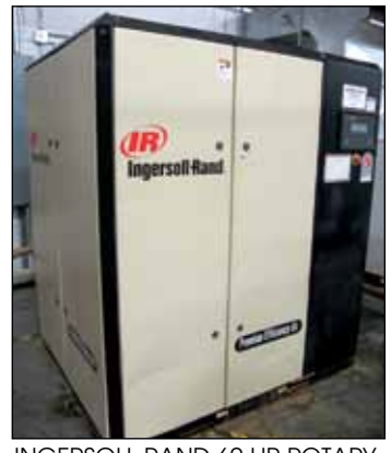
INGERSOLL RAND 60 HP ROTARY SCREW AIR COMPRESSOR MODEL SSR-EP60