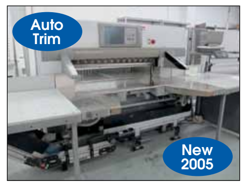
POLAR MOHR 54" PAPER CUTTER MODEL 137XT-AT