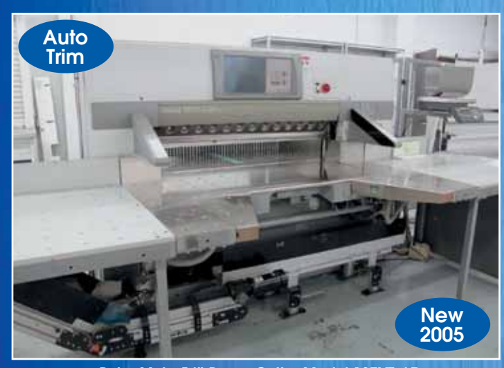
Polar Mohr 54" Paper Cutter Model 137XT-AT