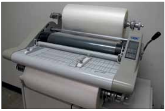
GBC DISCOVERY 20" LAMINATOR DISCOVERY 50