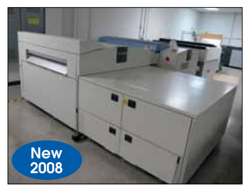
FUJI JAVELIN CTP SYSTEM MODEL PT-R8600S