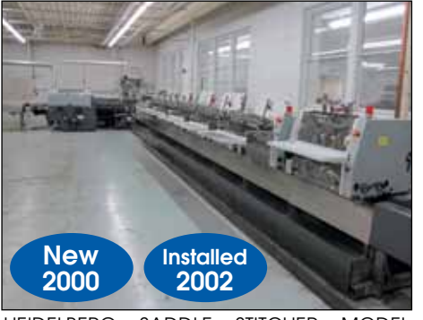
HEIDELBERG SADDLE STITCHER MODEL STITCHMASTER 270