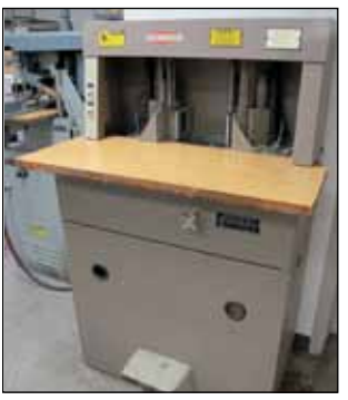
CHALLENGE ROUND CORNER MACHINE MODEL DCM