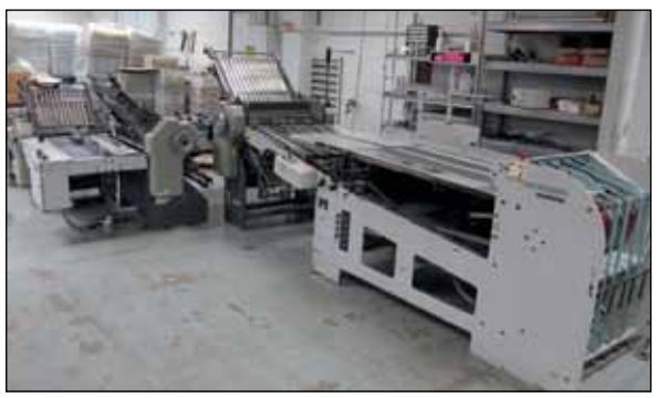
HEIDELBERG STAHL FOLDER MODEL 1426D-C-3