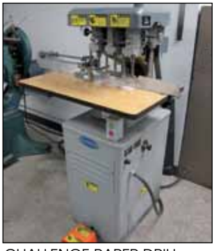
CHALLENGE PAPER DRILL MODEL FH-3A