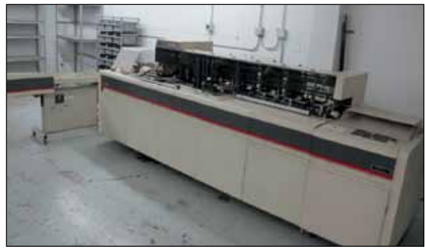
BELL AND HOWELL MAILSTAR INSERTER