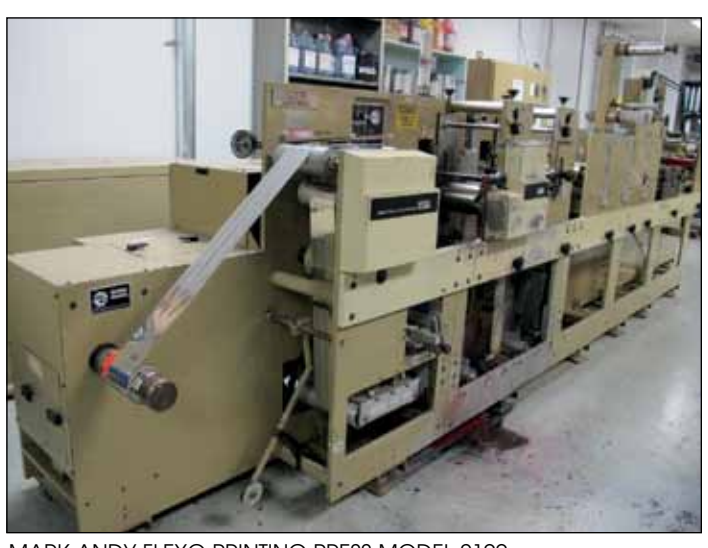
MARK ANDY FLEXO PRINTING PRESS MODEL 2100