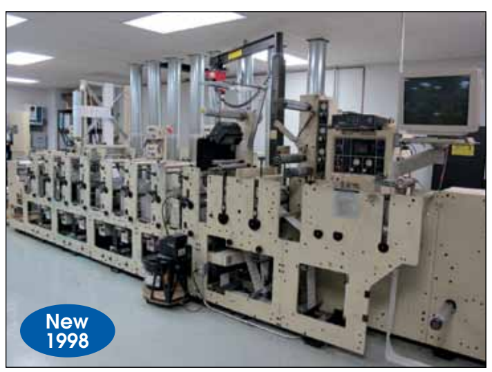
MARK ANDY FLEXO PRINTING PRESS MODEL 2200-13E