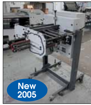
STAHL AIR KNIFE FOLDER MODEL VZF-52