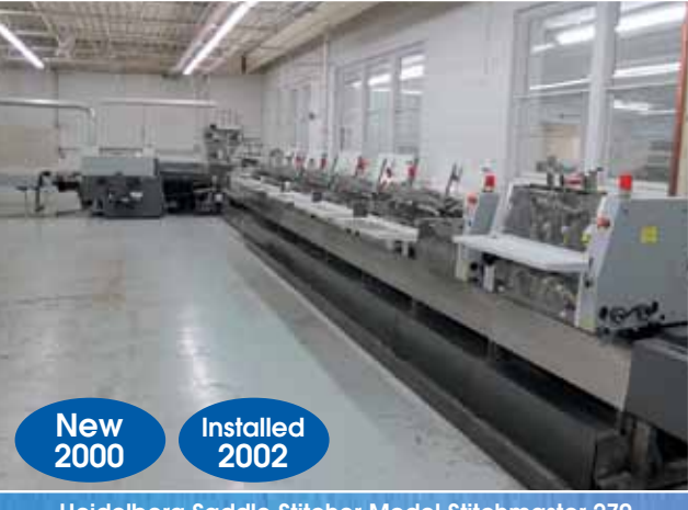
Heidelberg Saddle Stitcher Model Stitchmaster 270