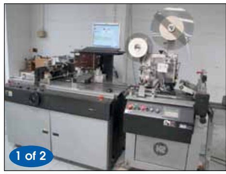
VIDEO JET / KIRK RUDY VARIABLE DATA PRINT / TAB LINE