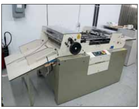
ROSBACK SCORING AND PERFORATING MACHINE MODEL 223SR