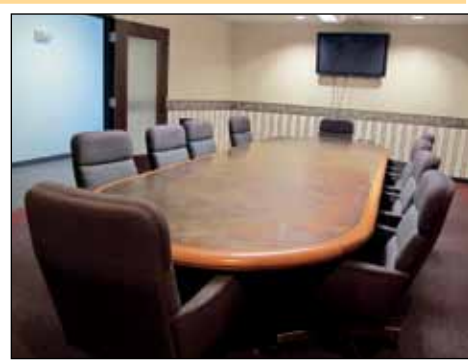
EXECUTIVE CONFERENCE ROOM