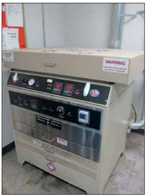
ANDERSON REELAND OVEN EXPOSURE ANTI TACK MACHINE, MODEL 24X30