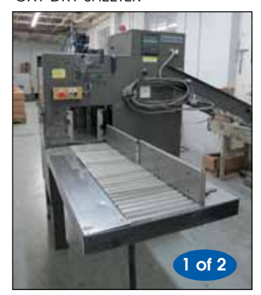
RIMA RS-12 STACKERS