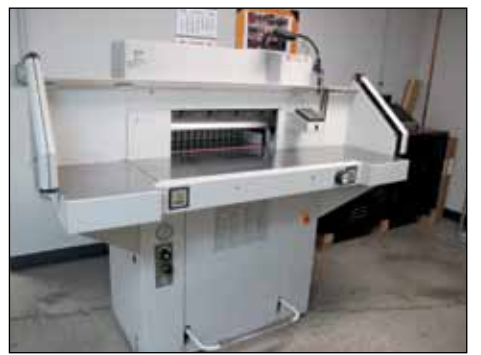
IDEAL PAPER CUTTER MODEL TRIUMPH 5551-06 EP