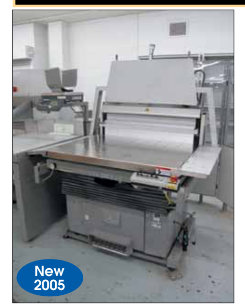
POLAR MOHR JOGGER MODEL RA-4