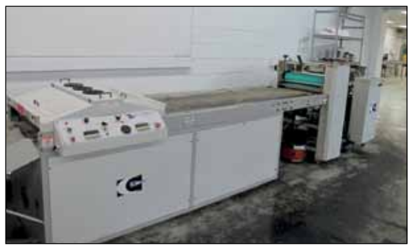
TECH LIGHTING UV COATER MODEL TC2421