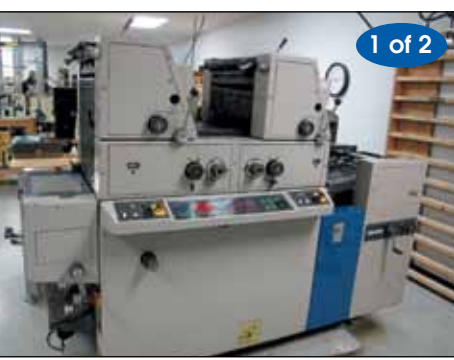
RYOBI 3302M 2-COLOR PRINTING PRESS