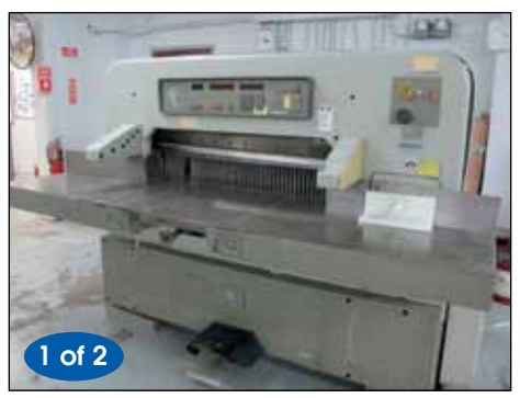
POLAR MOHR 45" PAPER CUTTER MODEL 115EMC