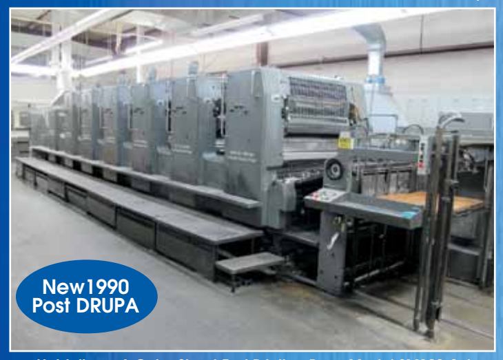
Heidelberg 6-Color Sheet Fed Printing Press Model SM102-S+L

3721 W Mathis Street, Lincoln, Nebraska 68524