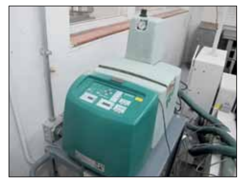
ROBATECH HOT MELT GLUE SYSTEM CONCEPT A5/6-KPC12

Baldwin Sheeter #1000J Oxy-Dry Sheeter (Early to Mid 90's Vintage)