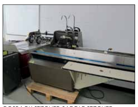
ROSBACK STITCHER SADDLE STITCHER MODEL 201A