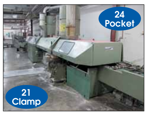
MULLER STAR-BINDER PERFECT BINDER