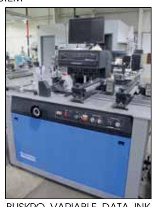
BUSKRO VARIABLE DATA INK JET PRINT SYSTEM # BK700