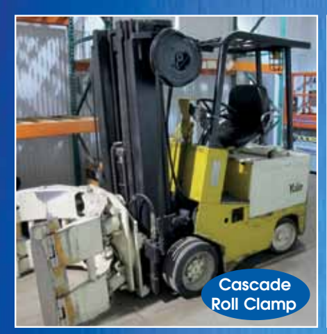
Yale 4500 lb Electric Forklift Model EERCO60