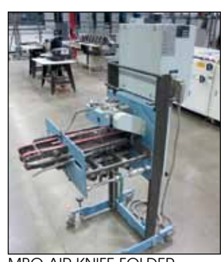
MBO AIR KNIFE FOLDER MODEL Z2