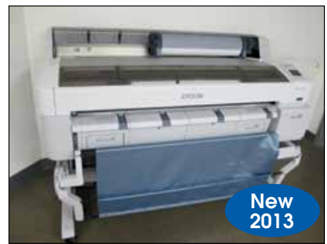
EPSON SUPER COLOR T7000 IMAGING PROOFING SYSTEM