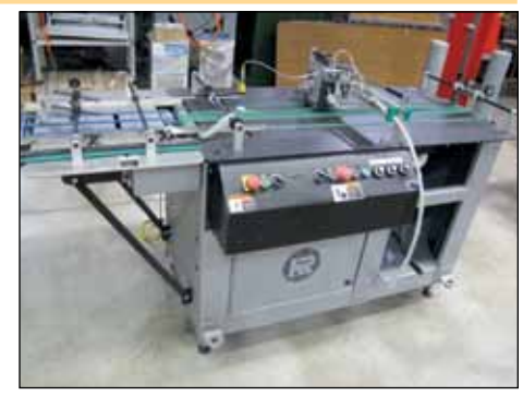
KIRK RUDY VARIABLE DATA PRINTER