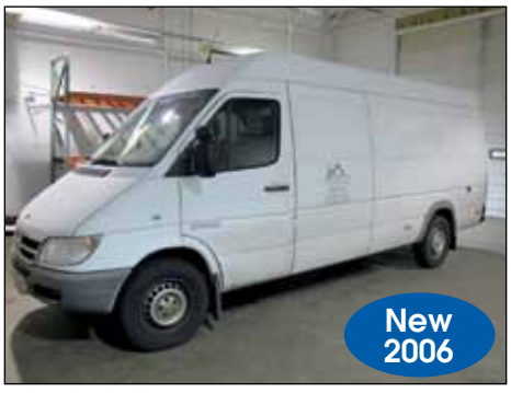
DODGE 2500 SPRINTER