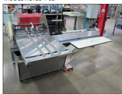
ROSBACK AUTO STITCHER MODEL 201CA