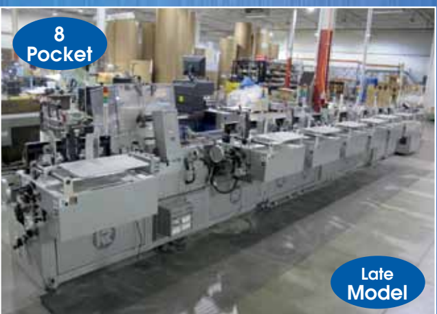
Kirk Rudy Collating Line Model 600

SALE DATE: Thursday, February 23, 1:00 PM (ET)