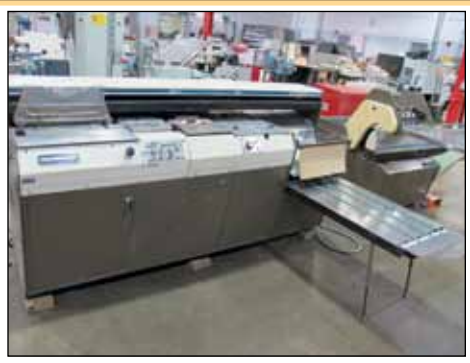
ROSBACK PERFECT BINDER MODEL 880