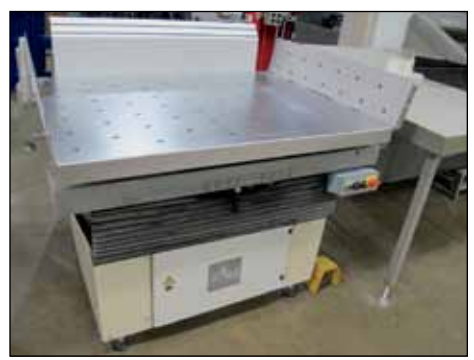
POLAR MOHR PAPER JOGGER MODEL RA4