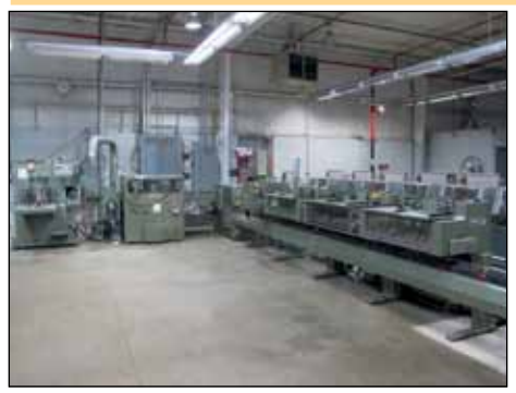
MULLER MARTINI SADDLE STITCHER MODEL MINUTEMAN