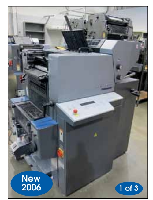
HEIDELBERG PRINTMASTER PRINTING PRESS MODEL QM46-2