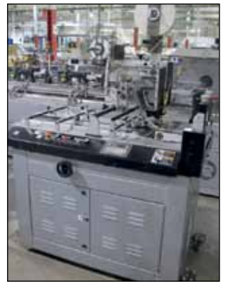
KIRK RUDY TABBER MODEL 535