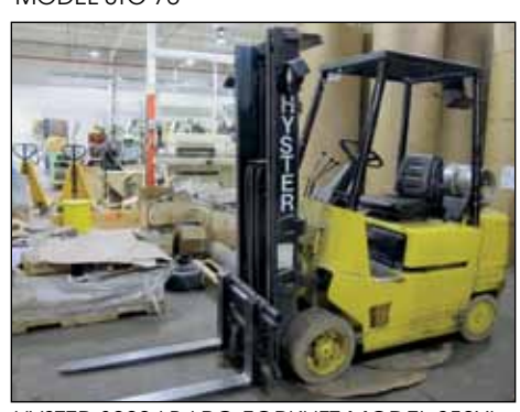
HYSTER 3000 LB LPG FORKLIFT MODEL S50XL