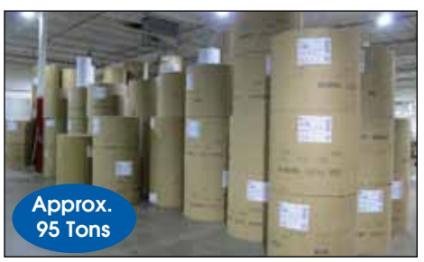
ROLL PAPER INVENTORY - LARGE QUANTITY