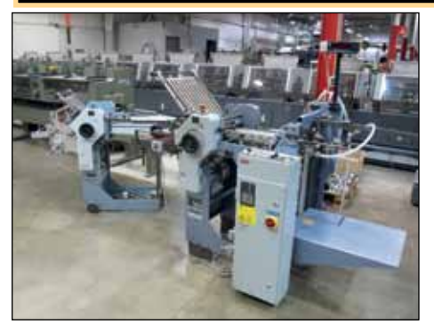
STAHL MINI FOLDER MODEL T36