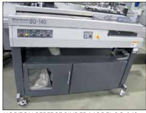
HORIZON PERFECT BINDER MODEL BQ-140