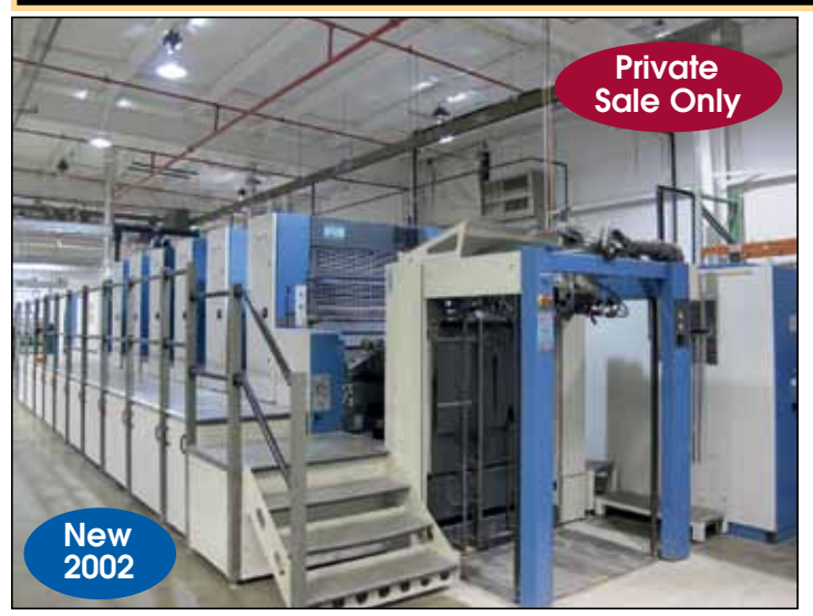
KBA SHEET FED PRINTING PRESS MODEL RA105CX-6-L-ALV2