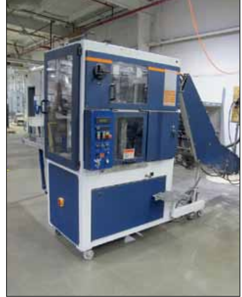
GAMMERLER PRINT PATH STACKER MODEL STC-70