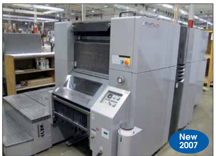
PRESSTEK PRINTING PRESS MODEL 52DI