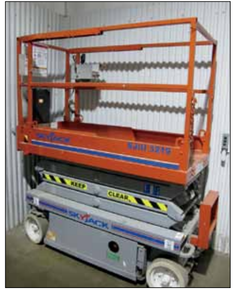
SKYJACK ELECTRIC SCISSOR LIFT MODEL SJIII-3219