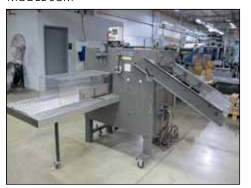
RIMA STACKER MODEL RS-11-9-1/4