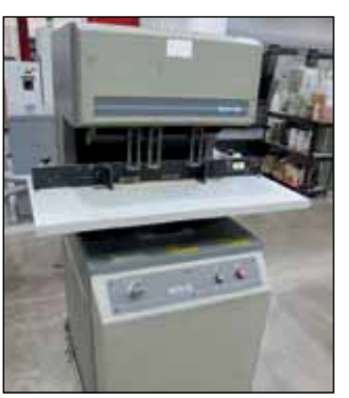
CHALLENGE 3-SPINDLE PAPER DRILL MODEL MS-5