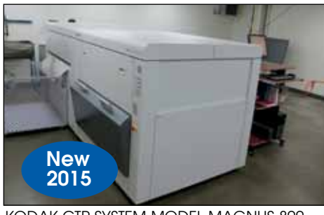
KODAK CTP SYSTEM MODEL MAGNUS 800