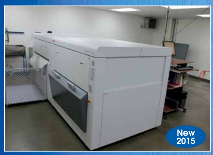
Kodak CTP System Model Magnus 800