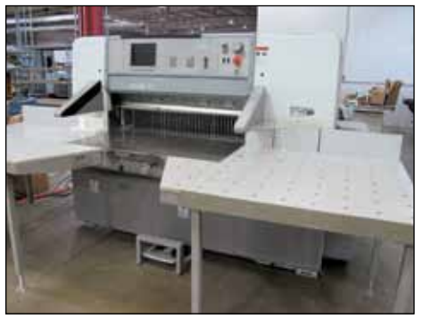
POLAR MOHR PAPER CUTTER MODEL 115ED