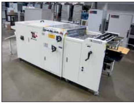
TEC LIGHTING UV COATER MODEL XCF25-1-3D