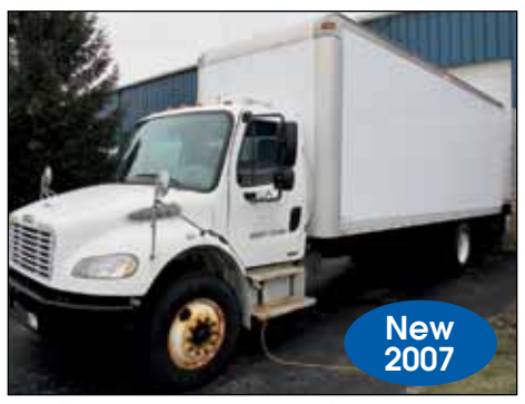
FREIGHTLINER DELIVERY TRUCK