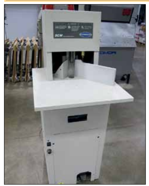
CHALLENGE ROUND CORNERING MACHINE MODEL SCM