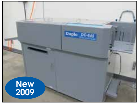
DUPLO SLITTER CUTTER CREASER MODEL DC645