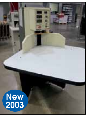
US PAPER COUNTERS MODEL CW-M