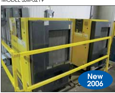
(2) KAESER ROTARY SCREW AIR COMPRESSOR MODEL ASD40