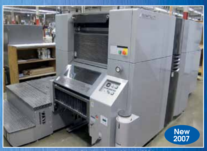
Presstek Printing Press Model 52DI

SALE DATE: Thursday, February 23, 1:00 PM (ET)