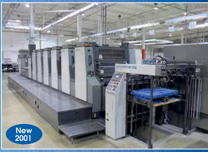
Komori 6-Color Sheet Fed Printing Press Model L628