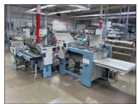
MBO FOLDER MODEL B23