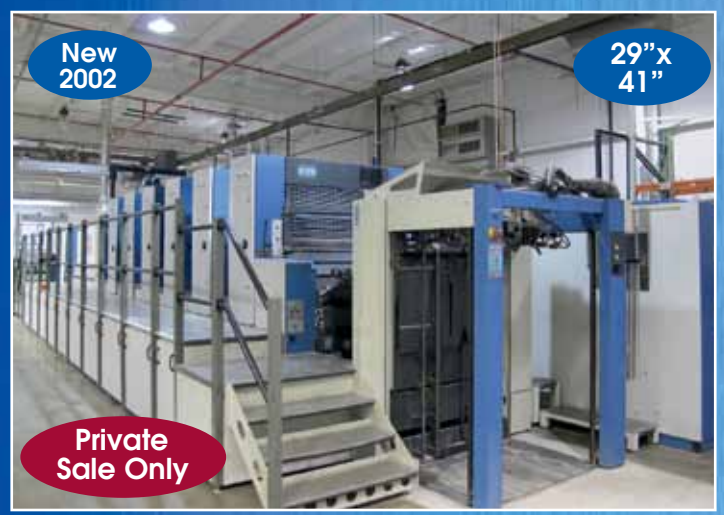
KBA Sheet Fed Printing Press Model RA105CX-6-L-ALV2

COMPLETE PLANT CLOSURE OF LARGE COMMERCIAL PRINTER Home Mountain Publishing Company 3602 Enterprise Ave., Valparaiso, IN 46383 United States