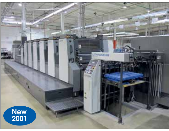
KOMORI 6-COLOR SHEET FED PRINTING PRESS MODEL L6288