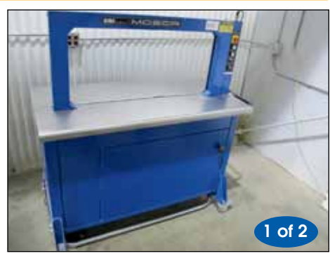
EAM MOSCA STRAPPING MACHINE MODEL RO-M-P4