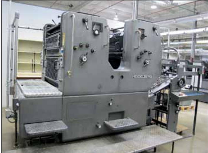
HEIDELBERG 2-COLOR SHEET FED PRINTING PRESS MODEL SORMZ