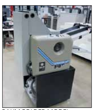
BAUM FOLDER MODEL ULTRAFOLD XLT