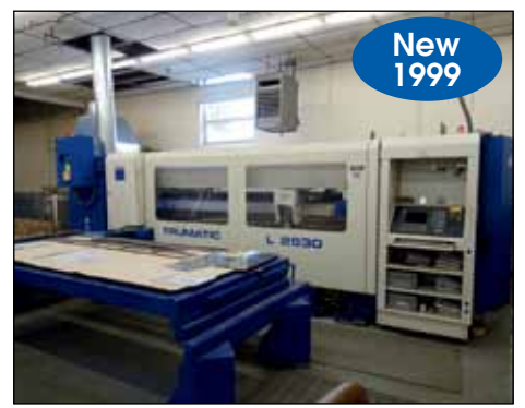
TRUMPF TRUMATIC LASER CUTTING SYSTEM MODEL L2530