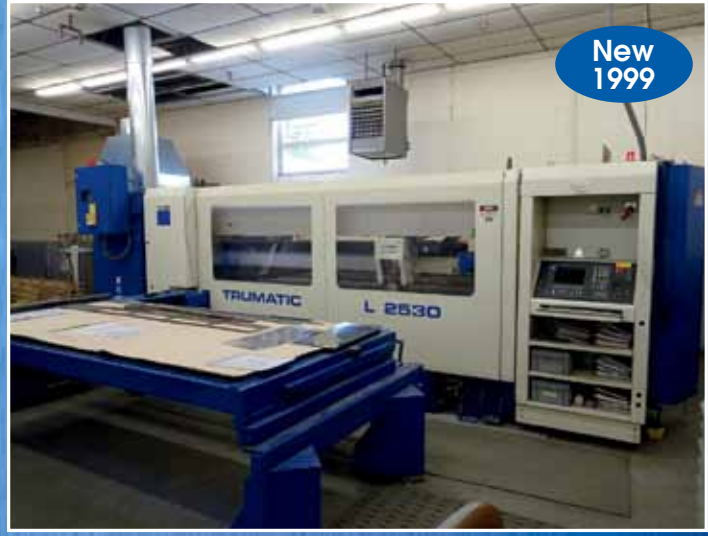
Trumpf Trumatic Laser Cutting System Model L2530

Amada Pega King 345 30-Ton CNC Turret Punch Press