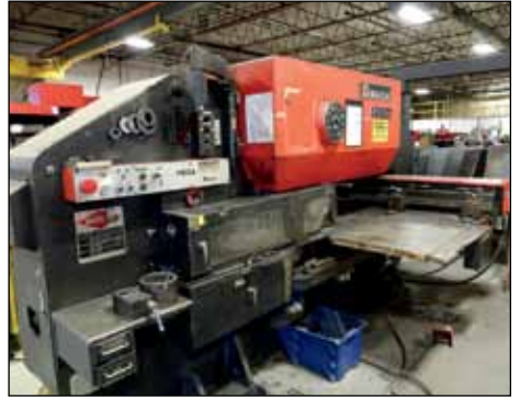
AMADA PEGA KING 345 30-TON CNC TURRET PUNCH PRESS