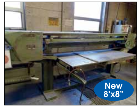
OAKLEY HIGH SPEED SEMI AUTOMATIC BELT SANDER MODEL D