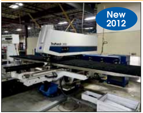
TRUMPF TRUPUNCH 3000 20-TON ELECTRIC PUNCH MODEL 511