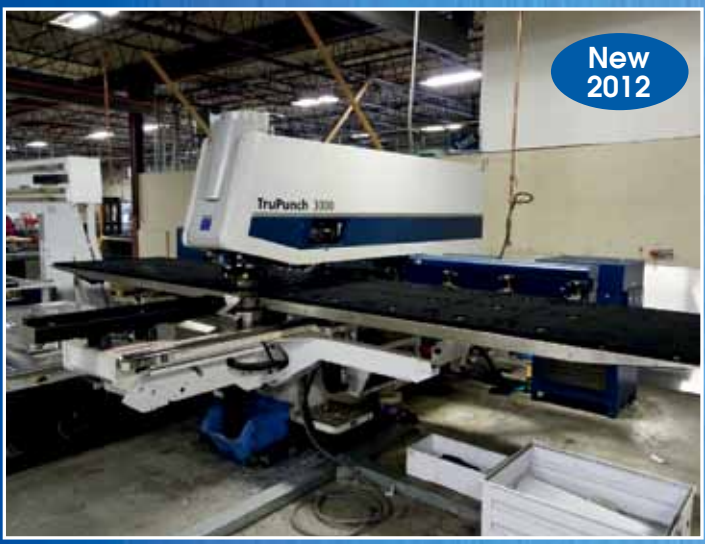
Trumpf Trupunch 3000 20-Ton Electric Punch Model 511

SALE DATE: WEDNESDAY, APRIL 5, 2:00 PM (ET) INSPECTION: TUESDAY, APRIL 4, 9 AM TO 4 PM (ET)