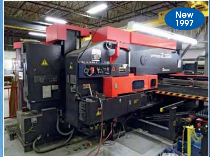
Amada Vipros Z358PPC 30-Ton Hyd. CNC Turret Punch Press