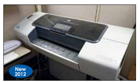
HP DESKJET TI 100PS A-D SIZE PLOTTER