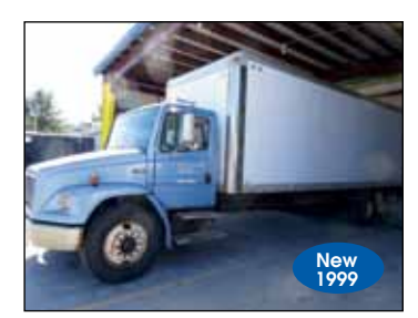
FREIGHTLINER 26' BOX TRUCK MODEL FL60