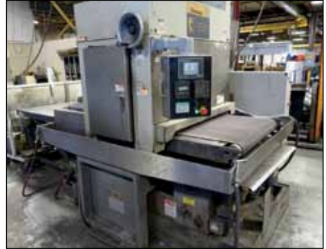
TIMESAVER 36" BELT SANDER MODEL 137-1 HDMW