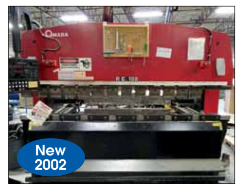
AMADA 10' X 100-TON HYDRAULIC PRESS BRAKE MODEL RG100