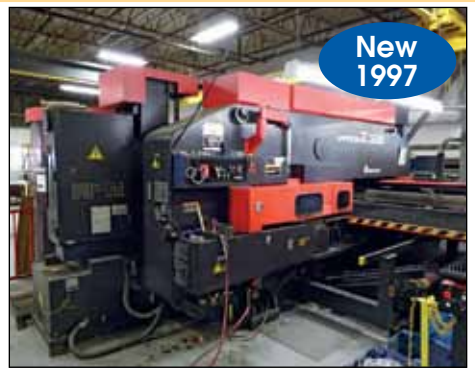
AMADA VIPROS Z358PPC 30-TON HYDRAULIC CNC TURRET PUNCH PRESS