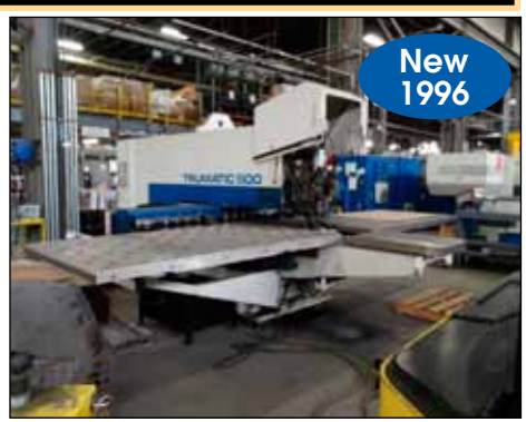
TRUMPF TRUMATIC 500 22-TON 2-AXIS CNC PUNCH MODEL 9089

Amada 10' x 100-Ton Hydraulic Press Brake Model RG100, (New 2002), NC9EX 3-Axis Gauging System