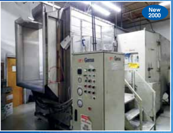
ITW GEMA DIAMOND 8000 CFM POWDER SPRAY