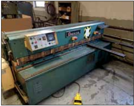
AMADA 8' HYDRAULIC SQUARING SHEAR MODEL S2532