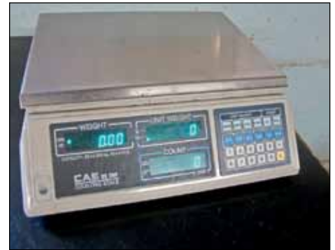
CAS DIGITAL COUNTING SCALE MODEL SC25P