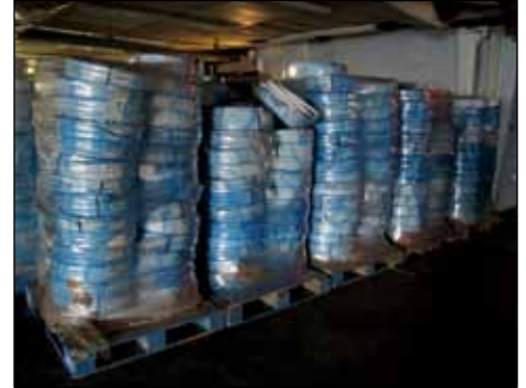
HOSE • SPA • WASHING MACHINE • SUCTION • FLAT • TUBING REINFORCED CLEAR • CONTRACTOR RED BLACK