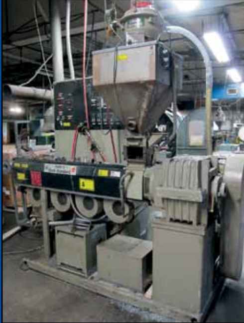
2.5" Davis Standard Extruder, 40 HP, Model 2.5IN25-MK-5, Mark V