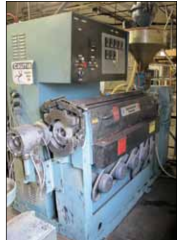
2.5" DAVIS STANDARD EXTRUDER, 40 HP, MODEL THERMATIC I