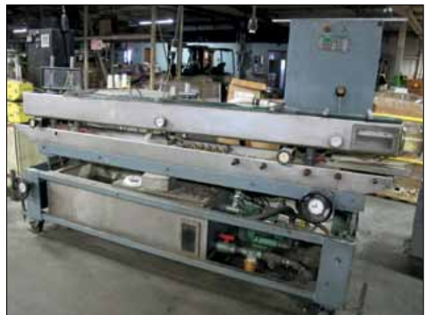
EXTRUSION COOLING TANKS