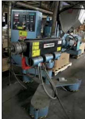
1.25" DAVIS STANDARD EXTRUDER, MODEL DS-125