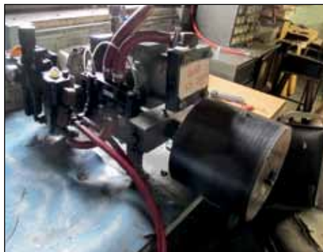
OMETCO/OLIVET GARDEN HOSE EXPANDING RIBBED CRIMPING MACHINE MODEL JR

Large Assortment of: Water Baths, Pullers, Chillers, Hoppers, Magnets, etc.