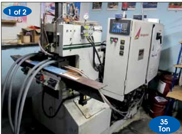
AUTOJECTORS HORIZONTAL INJECTION MOLDING MACHINE, SHUTTLE TABLE MODEL WDHS-355