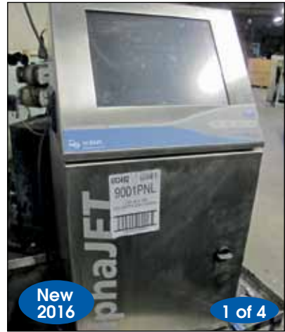
KBA METRONIC ALPHAJET INK JET CODE PRINTER MODEL MID-060