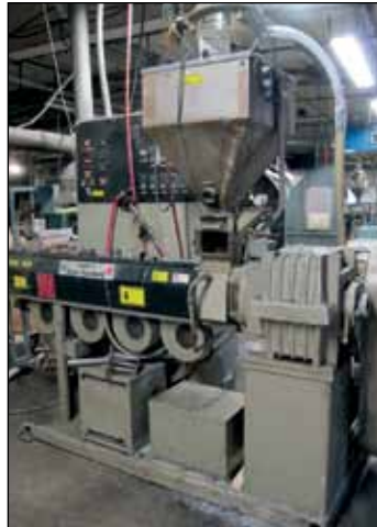
2.5" DAVIS STANDARD EXTRUDER, 40 HP MODEL 2.5IN2-5 MK-5, MARK V