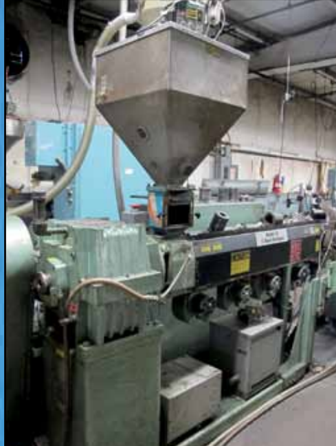
2.5" Davis Standard Extruder, 40 HP, Model MV-251N25, Mark VI,

SALE DATE: WEDNESDAY, MAY 17, 1:00 PM (ET)