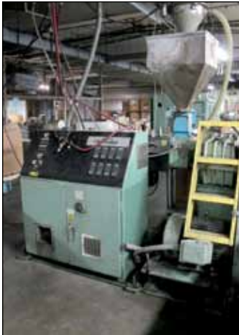
2.5" DAVIS STANDARD EXTRUDER, 40 HP, MODEL 2.5IN25-MK6, MARK VI