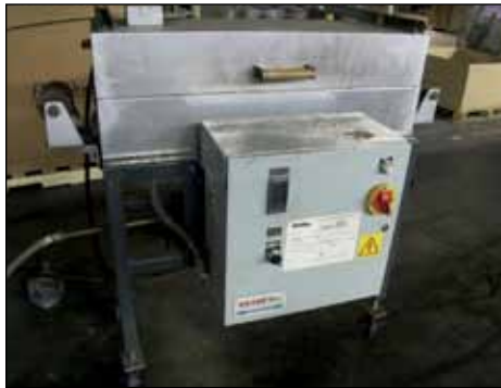
GLEN PRO RADION SERIES 42 PRE HEATER