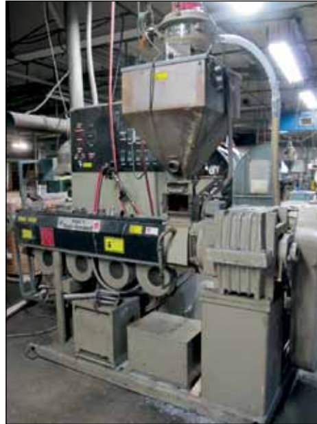
2.5" DAVIS STANDARD EXTRUDER, 40 HP, MODEL 2.5IN25-MK-5, MARK V