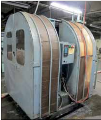
CUSTOM BUILT WARDWELL TYPE HOSE REINFORCING MACHINE