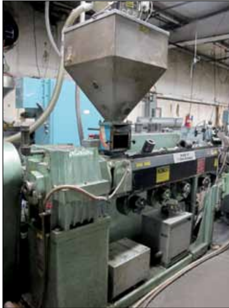
2.5" DAVIS STANDARD EXTRUDER, 40 HP, MODEL MV-251N25, MARK VI