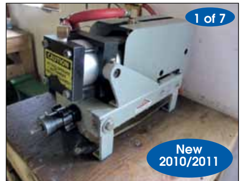
OMETCO/OLIVET GARDEN HOSE EXPANDING RIBBED CRIMPING MACHINE MODEL JR