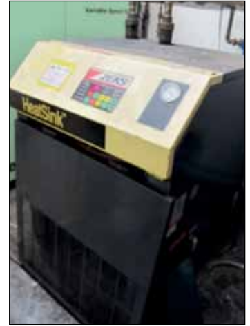
ZEKS REFRIGERATED AIR DRYER MODEL 200HSEA400