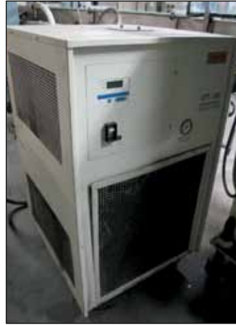
THERMO CHILLER MODEL CFT-300